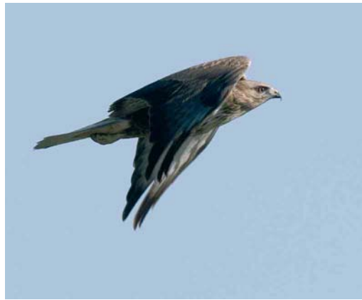
Mystery photograph VIII (January)

In Magnificent Frigatebird, immature and adult females and immature males are easily distinguished from Ascension Frigatebird and Lesser Frigatebird by the pattern on the axillaries. The latter two species show entirely white axillaries, sometimes referred to as 'spurs' (cf plate 321). These may appear as extensions of the white breast patches of young and female birds. Magnificent, however, only shows pale fringes to these feathers creating a characteristic pale and dark striped