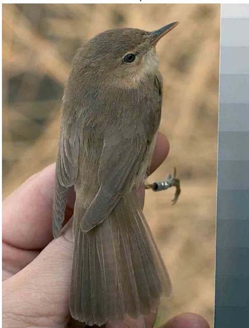
313 European Reed Warbler / Kleine Karekiet Acrocephalus scirpaceus , adult, Espoo, Finland, 13 August 2006 (Annika Forsten & Antero Lindholm). Same bird as in plate 315.