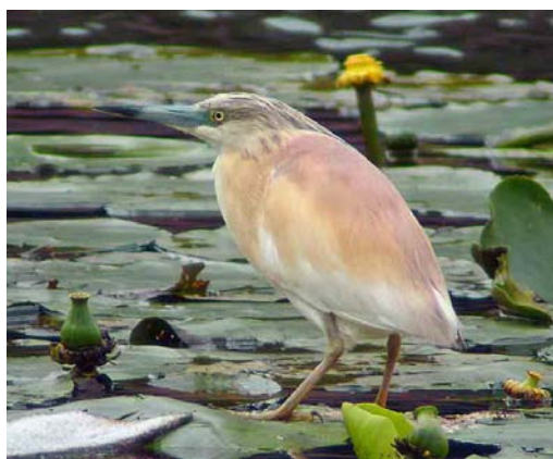
361 Witvleugelstern / White-winged Tern Chlidonias leucopterus , Veenoordkolk, Deventer, Overijssel, 16 mei 2007 362 Witvleugelstern / White-winged Tern Chlidonias leucopterus , Waverhoek, Utrecht, 16 mei 2007 363 Amerikaanse Wintertaling / Green-winged Teal Anas carolinensis , Philipsdam, Zeeland, 8 mei 2007 364 Ralreiger / Squacco Heron Ardeola ralloides , adult, Nieuwerbrug, Zuid-Holland, 27 juni 2007 365 Ralreiger / Squacco Heron Ardeola ralloides , adult, Schipluiden, Zuid-Holland, 29 mei 2007 366 Ralreiger / Squacco Heron Ardeola ralloides , adult, Diemen, Noord-Holland, 23 juni 2007