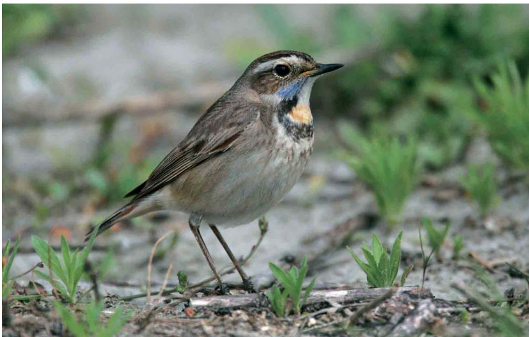
378 Blauwborst / Bluethroat Luscinia svecica , Maasvlakte, Zuid-Holland, 26 mei 2007