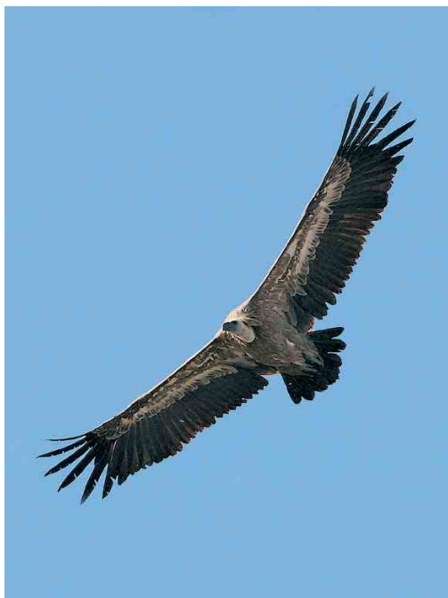
389 Vale Gier / Eurasian Griffon Vulture Gyps fulvus , Oss, Noord-Brabant, 19 juni 2007

dag voor vogelaars van buiten Zeeland geen situatie voor dat je 'kon gaan rijden' op een groep pleisterende gieren en naarmate het later werd had ik (Co van der Wardt) wat dat betreft de hoop al vrijwel opgegeven. Tegen 20:30 belde WJ echter dat er een melding was van c 20 mogelijke Vale Gieren die zich op dat moment zouden bevinden langs de Brandstraat in Geffen, Noord-Brabant. De Brandstraat is nog geen 15 min rijden van mijn huis in Vinkel. Bij aankomst op de plek stonden er al groepjes buurtbewoners te kijken en vrijwel direct vielen de 'witte bontkragen' op die her en der in de bomen te zien waren. Ik kon WJ dus goed nieuws doorbellen dat hij vervolgens verder wereld- kundig maakte. Ik had nog net tijd om met een onder- gaande zon wat foto's te maken. Ter plekke – er was inmiddels een behoorlijke groep mensen gearriveerd – hoorde ik hoe het allemaal gegaan was. Een aantal 'grote vogels' was geland in een paar bomen in de wei- landen aan de Brandstraat en omgeving. Een familie die daar woont zag dat en consulteerde de Vogelwerkgroep Oss. Die ondernamen actie en zo bereikte het bericht uiteindelijk ook WJ. Hoeveel het er nu precies waren was moeilijk te zeggen. Ze zaten behoorlijk verspreid over het gebied en wisten zich in sommige bomen goed te verstoppen. We dachten dat