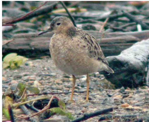
332 Spotted Sandpiper / Amerikaanse Oeverloper Actitis macularia , Århus, Jylland, Denmark, 18 May 2007 333 Caspian Plover / Kaspische Plevier Charadrius asiaticus , Eilat, Israel, 1 May 2007 334 Hudsonian Whimbrel / Amerikaanse Regenwulp Numenius hudsonicus , Walney Island, Cumbria, England, July 2007 335 Buff-breasted Sandpiper / Blonde Ruitter Tryngites subruficollis , Rheindelta, Austria, 28 May 2007

first Red-necked Stint C ruficollis for Spain was reported at Guadalhorce ponds, Málaga, on 15 May and the third for Norway was an adult at Orreosen, Klepp, Rogaland, on 27-28 June. If accepted, a Temminck's Stint C temminckii at Grímsey on 7 June will be the first for Iceland. The first Long-toed Stint C subminuta for Finland and c 10th for the WP was an adult at Salminlahti, Kotka, on 26-28 June. In May-June 2004, up to four breeding attempts of Pectoral Sandpiper C melanotos occurred in Scotland of which three were on different islands in the Outer Hebrides and one (ie, a pair in display in early June and an adult accompanying a very fresh juvenile in early July) was on the north-eastern mainland (Br Birds 100: 321-367, 2007). On 22 May, the eighth Sharp-tailed Sandpiper C acuminata for Norway turned up at Ekkerøy, Vadsø, Finnmark. The seventh for the Netherlands was an adult at Rockanje, Zuid-Holland, on 14 July. In England, a