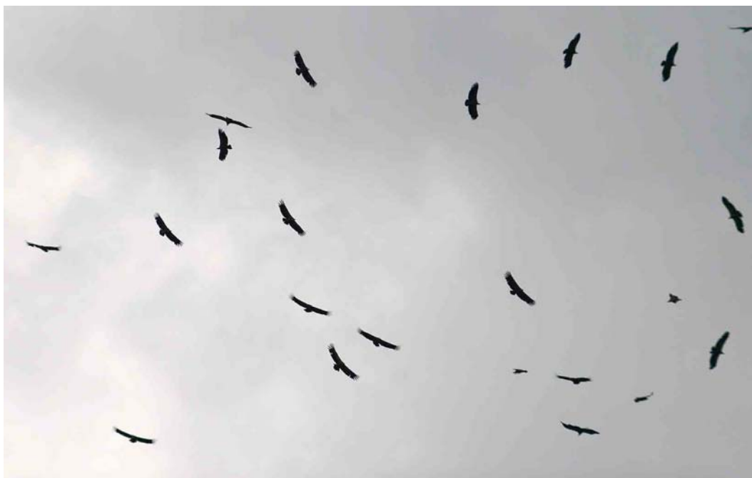
390 Vale Gieren / Eurasian Griffon Vultures Gyps fulvus , Zuidzande, Zeeland, 18 juni 2007 (Pim A Wolf)

het er zeker 20 waren maar anderen kwamen – naar later bleek – die avond al tot 33. De volgende ochtend, woensdag 19 juni, bezocht ik het gebied opnieuw en koos weer positie in de Brandstraat vanwaar een aantal vogels in de gaten kon worden gehouden. Tegen 10:00 begonnen ze in zuidelijke richting weg te vliegen en de teller kwam op 41 of 42 exemplaren; later die dag waren er in Noord-Brabant waarnemingen van 33 bij Sint-Oedenrode en kleinere aantallen langs Eindhoven. Eén exemplaar bij Oss bleef tot in de avond achter maar bleek een dag later eveneens verdwenen. Ook de vogels van Oss kregen massale belangstelling van bijna alle denkbare actualiteitenprogramma's op televisie.