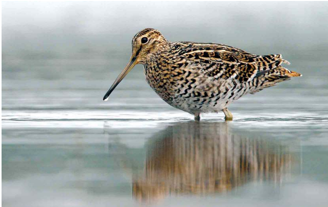
384 Poelsnip / Great Snipe Gallinago media , adult, Elen, Limburg, 6 mei 2007 (Vincent Legrand)