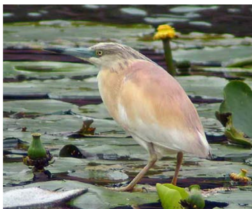
361 Witvleugelstern / White-winged Tern Chlidonias leucopterus , Veenoordkolk, Deventer, Overijssel, 16 mei 2007 362 Witvleugelstern / White-winged Tern Chlidonias leucopterus , Waverhoek, Utrecht, 16 mei 2007 363 Amerikaanse Wintertaling / Green-winged Teal Anas carolinensis , Philipsdam, Zeeland, 8 mei 2007 364 Ralreiger / Squacco Heron Ardeola ralloides , adult, Nieuwerbrug, Zuid-Holland, 27 juni 2007 365 Ralreiger / Squacco Heron Ardeola ralloides , adult, Schipluiden, Zuid-Holland, 29 mei 2007 366 Ralreiger / Squacco Heron Ardeola ralloides , adult, Diemen, Noord-Holland, 23 juni 2007