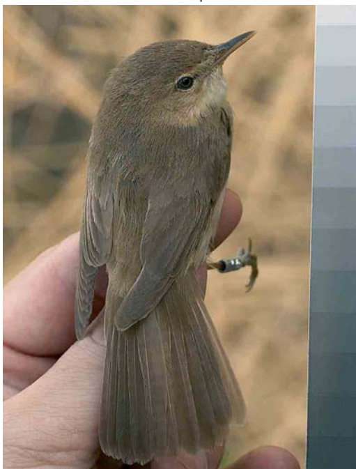
313 European Reed Warbler / Kleine Karekiet Acrocephalus scirpaceus , adult, Espoo, Finland, 13 August 2006 (Annika Forsten & Antero Lindholm). Same bird as in plate 315.