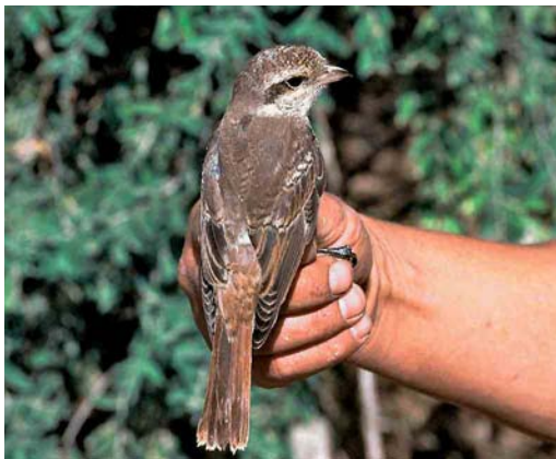
318 Turkestan Shrike / Turkestaanse Klauwier Lanius phoenicuroides , juvenile moulting to first-winter plumage, Chokpak pass, Kazakhstan, September 2003 (Arend Wassink)

brown colours are visible. Daurian is, therefore, safely excluded as possible solution.