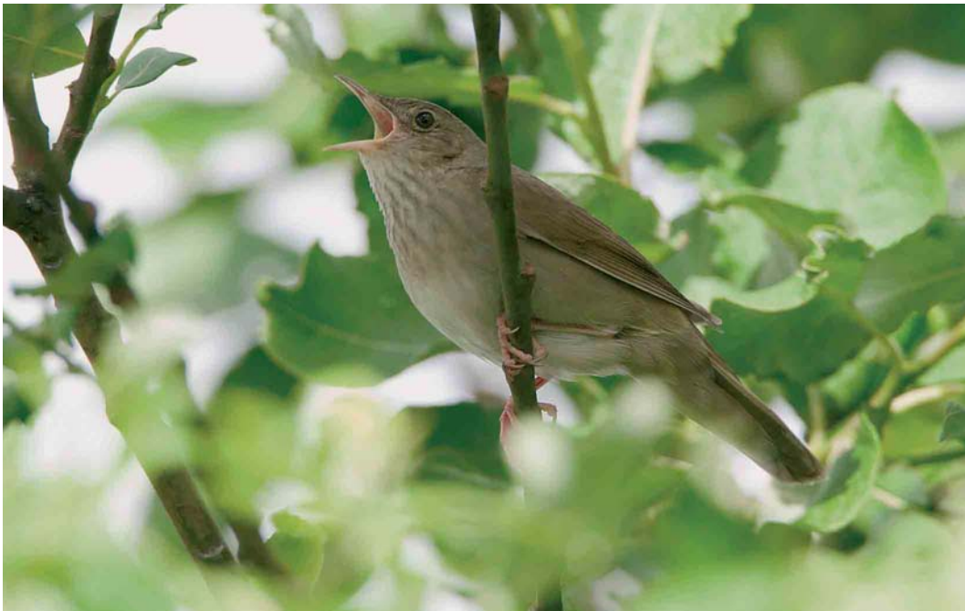
379 Kregelzanger / River Warbler Locustella fluviatilis , Brunssum, Limburg, 19 mei 2007 (Ran Schols)