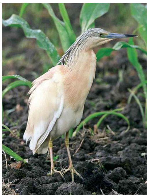
358 Groene Reiger / Green Heron Butorides virescens , Zijkanaal H-weg, Amsterdam, Noord-Holland, 1 juni 2007 359 Ralreiger / Squacco Heron Ardeola ralloides , adult, Wieringen, Noord-Holland, 17 juni 2007 360 Ralreiger / Squacco Heron Ardeola ralloides , adult, Watergraafsmeer, Amsterdam, Noord-Holland, 22 juni 2007