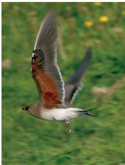
347 Stone-curlew / Griel Burhinus oedicnemus , Düne, Helgoland, Schleswig-Holstein, Germany, 13 May 2007 348 Collared Pratincole / Vorkstaartplevier Glareola pratincola , Annagh Head, Mayo, Ireland, 8 June 2007 349 Basra Reed Warblers / Basrakarekieten Acrocephalus griseldis , adult, Lehavot Habashan, Israel, 19 June 2007