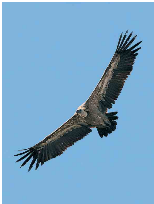
389 Vale Gier / Eurasian Griffon Vulture Gyps fulvus , Oss, Noord-Brabant, 19 juni 2007

dag voor vogelaars van buiten Zeeland geen situatie voor dat je 'kon gaan rijden' op een groep pleisterende gieren en naarmate het later werd had ik (Co van der Wardt) wat dat betreft de hoop al vrijwel opgegeven. Tegen 20:30 belde WJ echter dat er een melding was van c 20 mogelijke Vale Gieren die zich op dat moment zouden bevinden langs de Brandstraat in Geffen, Noord-Brabant. De Brandstraat is nog geen 15 min rijden van mijn huis in Vinkel. Bij aankomst op de plek stonden er al groepjes buurtbewoners te kijken en vrijwel direct vielen de 'witte bontkragen' op die her en der in de bomen te zien waren. Ik kon WJ dus goed nieuws doorbellen dat hij vervolgens verder wereld- kundig maakte. Ik had nog net tijd om met een onder- gaande zon wat foto's te maken. Ter plekke – er was inmiddels een behoorlijke groep mensen gearriveerd – hoorde ik hoe het allemaal gegaan was. Een aantal 'grote vogels' was geland in een paar bomen in de wei- landen aan de Brandstraat en omgeving. Een familie die daar woont zag dat en consulteerde de Vogelwerkgroep Oss. Die ondernamen actie en zo bereikte het bericht uiteindelijk ook WJ. Hoeveel het er nu precies waren was moeilijk te zeggen. Ze zaten behoorlijk verspreid over het gebied en wisten zich in sommige bomen goed te verstoppen. We dachten dat