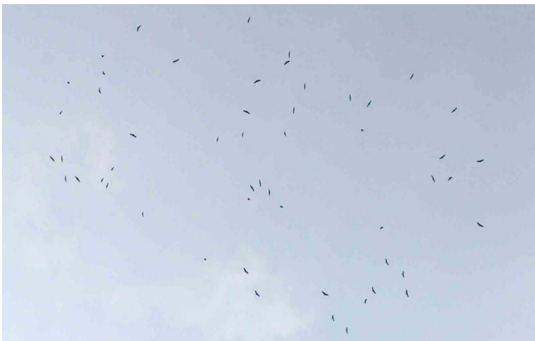
383 Vale Gieren / Eurasian Griffon Vultures Gyps fulvus , Nederename, Oudenaarde, Oost-Vlaanderen, 17 juni 2007

16 juni, toen tenminste 18 exemplaren hoog over Ruisbroek, Antwerpen, vlogen. Op 17 juni werd meteen de omvang van de invasie duidelijk toen eerst 55 over Virelles trokken, waarna een massieve 'bel' van 94 werd ontdekt en gefotografeerd boven Nederename, Oost-Vlaanderen. De meeste belangstelling ging naar overnachtende groepen van 64 in Ursel, Oost-Vlaanderen, van 17 op 18 juni en van 34 in Meerbeke, Oost-Vlaanderen, van 18 op 19 juni. Een overzicht van de waarnemingen is materie voor een uitgebreider artikel maar wel is al duidelijk dat tussen 18 en 26 juni naar schatting c 200 vogels zijn waargenomen. Ze verschenen in alle provincies maar Oost-Vlaanderen werd het beste bedeed. De gegevens die na de mediabelangstelling kwamen zijn moeilijk op betrouwbaarheid in te schatten; verschillende ingezonden waarnemingen betroffen Buizerds Buteo buteo ... Bij Antoing, Hainaut, werd op 17 mei een Slangenarend Circaetus gallicus gezien. Op 15 juni was er een waarneming in Het Hageven in Neerpelt, gevolgd door een tweede op 23 juni. Op 19 juni vloog er één laag over Engsbergen, Limburg. Een zeer waarschijnlijk vrouwtje Steppiekiekendief Circus macrourus vloog op 19 juni over Mortsel, Antwerpen. Mei was goed voor 27 Grauwe Kiekendieven C. pygargus . Een Bastaard- of Schreeuwend Aquila clanga/pomarina vloog op 3 mei over Roeselare, West-Vlaanderen. Een lichte vorm Dwergarend A. pennata die op 5 mei over Wezel, Antwerpen, vloog kon kort daarop worden onderschept boven de