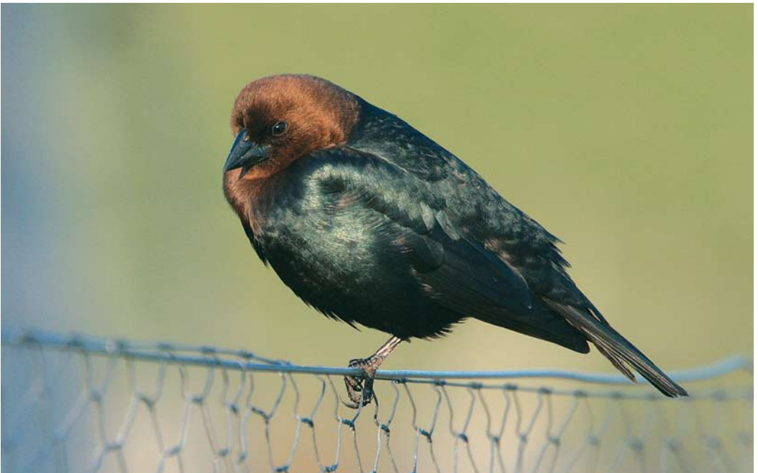
225 Brown-headed Cowbird / Bruinkopkoevogel Molothrus ater , Fair Isle, Shetland, Scotland, 10 May 2009