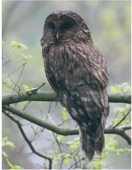
184 Ural Owl / Oeraluil Strix uralensis macroura , central Slovenia, 14 December 2007 (Miha Krofel). Pale morph individual. 185 Ural Owl / Oeraluil Strix uralensis macroura , near Krakow, Poland, 2 May 2008 (Chris van Rijswijk/birdshooting.nl). Partially melanistic morph individual. Appearance of partially melanistic or melanistic morph birds is almost blackish in the field. 186 Ural Owl / Oeraluil Strix uralensis macroura , near Krakow, Poland, 2 May 2008 (Chris van Rijswijk/birdshooting.nl). Grey morph individual.