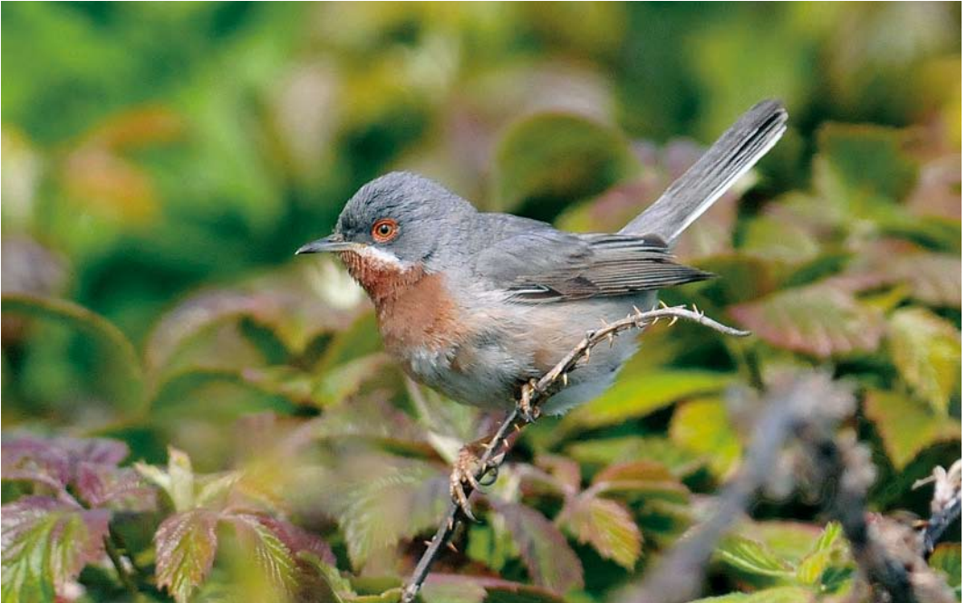
224 Eastern Subalpine Warbler / Oostelijke Baardgrasmus Sylvia cantillans albistriata , male, Portland Bill, Dorset, England, 9 May 2009 (Nick Hopper)