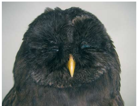
173 Ural Owl / Oeraluil Strix uralensis liturata , southern Finland, 19 April 2008 ( Al Vrezec ). Pale facial disk is typical for northern subspecies of Ural Owl. 174 Ural Owl / Oeraluil Strix uralensis 'momiymae' (included in S u hondoensis ), Honshu, Japan, 17 April 2004 ( Aki Higuchi ). In eastern part of range, southern Ural Owls are darker and more brownish than northern subspecies. 175 Ural Owl / Oeraluil Strix uralensis macroura , central Slovenia, 6 April 2007 ( Al Vrezec ). Facial disk of pale morph. 176 Ural Owl / Oeraluil Strix uralensis macroura , central Slovenia, 11 May 2007 ( Andrej Kapla ). Grey morph individual with prominent circumocular barring. 177 Ural Owl / Oeraluil Strix uralensis macroura , central Slovenia, 6 June 2007 ( Andrej Kapla ). Facial disk of melanistic morph. 178 Ural Owl / Oeraluil Strix uralensis macroura , Ljubljana, Slovenia, 20 November 2004 ( Al Vrezec ). Facial disk of melanistic morph; very dark individual with almost blackish facial disk.