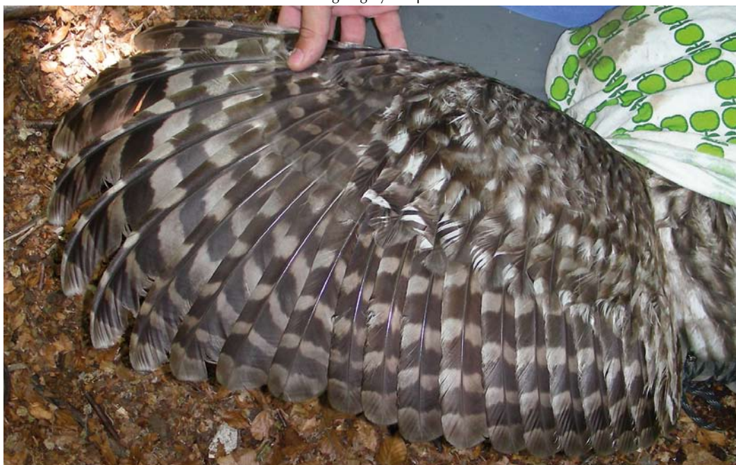
180 Ural Owl / Oeraluil Strix uralensis macroura , central Slovenia, 11 May 2007 ( Andrej Kapla ). Wing of grey morph.