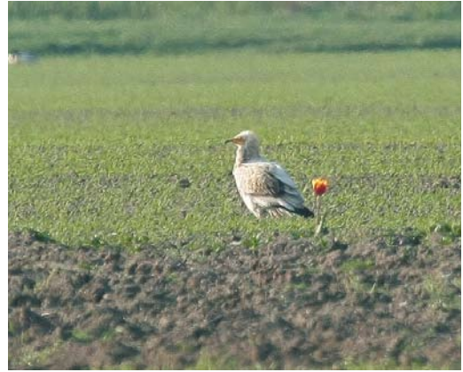
242-243 Aasgier / Egyptian Vulture Neophron percnopterus , Wieringermeer, Noord-Holland, 25 april 2009