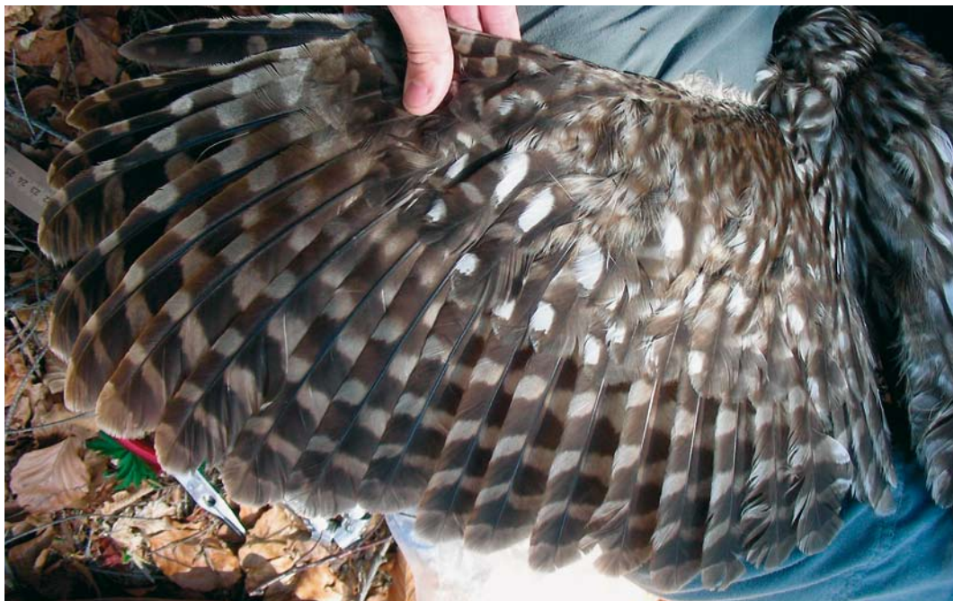
179 Ural Owl / Oeraluil Strix uralensis macroura , central Slovenia, 6 April 2007 ( Andrej Kapla ). Wing of pale morph.