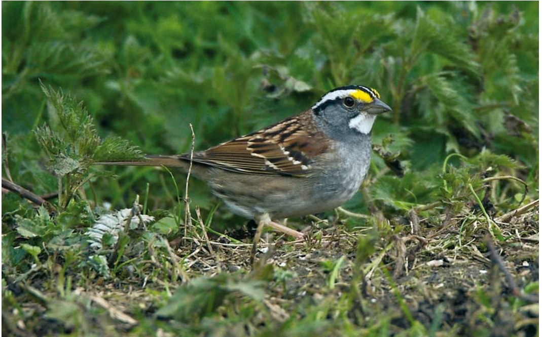
222 White-throated Sparrow / Witkeelgors Zonotrichia albicollis , Old Winchester Hill, Hampshire, England, 19 April 2009