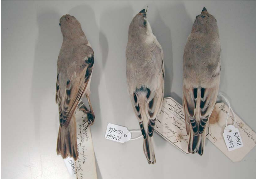
161 Desert Sparrows / Afrikaanse Woestijnmussen Passer simplex , Nationaal Natuurhistorisch Museum Naturalis, Leiden, Netherlands, July 2008 (Guy M Kirwan). Dorsal comparison of male P s simplex (left-hand bird) and P s saharae (right-hand two).