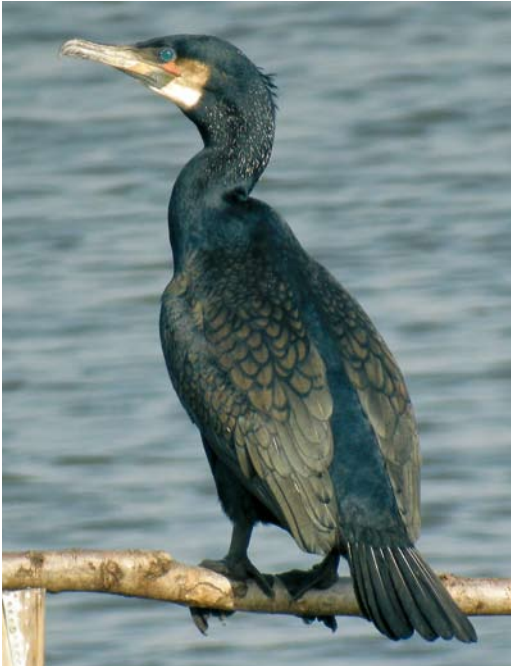
210 Atlantic Great Cormorant / Grote Aalscholver Phalacrocorax carbo carbo , Lier-Anderstad, West-Vlaanderen, Belgium, 21 April 2009 (Kris De Rouck)