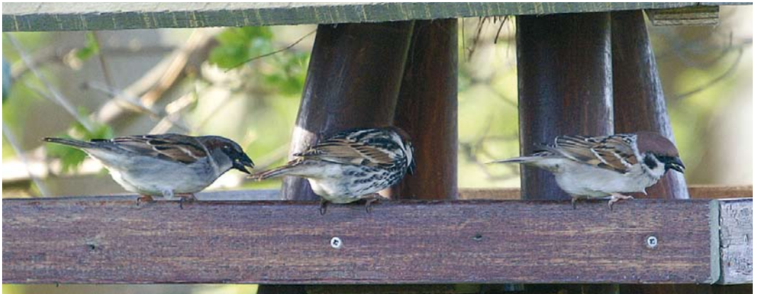
241 Spaanse Mus / Spanish Sparrow Passer hispaniolensis , mannetje (midden), met Huisemus / House Sparrow P. domesticus , mannetje, en Ringmus / Eurasian Tree Sparrow P. montanus , Den Hoorn, Texel, Noord-Holland, 18 april 2009

Oude Stuifdijk op de Maasvlakte, Zuid-Holland. Deze vogel werd dezelfde avond door enkele 10-tallen vogelaars gezien en liet zich de volgende dag gedurende iets meer dan een uur wederom bekijken. Een week later, op 26 en 27 april, volgden nog twee korte waarnemingen (beide met foto) bij de Verzinking, c 1 km van de plek waar hij werd ontdekt. Of het hier uitgezwermde exemplaren van het groepje uit de Eemshaven betrof zal wel altijd een open vraag blijven; de Texelse vogel was echter hemelsbreed op meer dan 150 km en die van de Maasvlakte zelfs op meer dan 250 km ten zuidwesten van de Eemshaven.