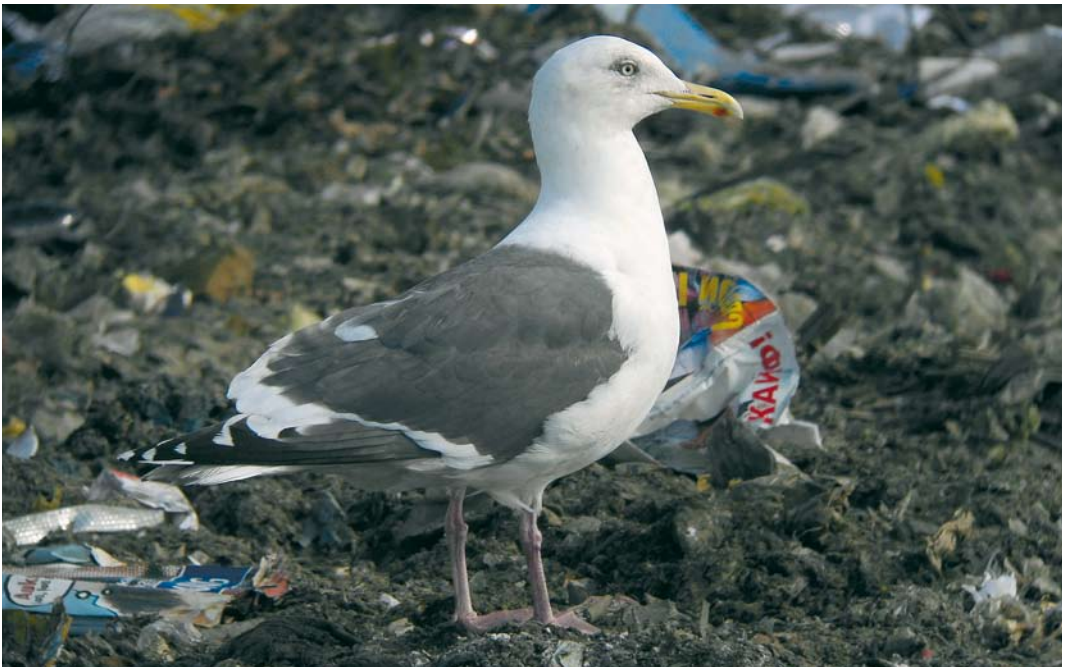
205 Slaty-backed Gull / Kamtsjatkameeuw Larus schistisagus , adult, Riga, Latvia, 13 April 2009 (Paul Hackett)