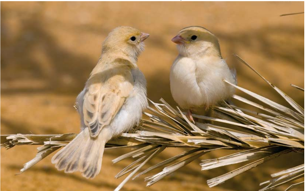
223 Desert Sparrows / Woestijnmussen Passer simplex , fledglings, Merzouga, Tafilalt, Morocco, 30 March 2009