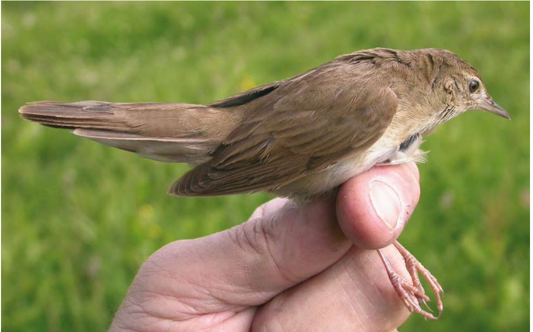
194 Aberrant Savi's Warbler / afwijkende Snor Locustella luscinioides , Korte Waarden, Elburg, Gelderland, Netherlands, 21 June 2008 ( Symen Deuzeman ) 195 Aberrant Savi's Warbler / afwijkende Snor Locustella luscinioides , Korte Waarden, Elburg, Gelderland, Netherlands, 21 June 2008 ( Symen Deuzeman ). Note dark centres of median and lesser coverts and very weak emargination of outer web of p8.