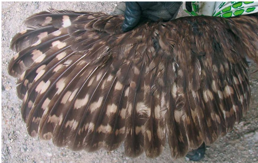
181 Ural Owl / Oeraluil Strix uralensis macroura , central Slovenia, 6 June 2007. Wing of melanistic morph.