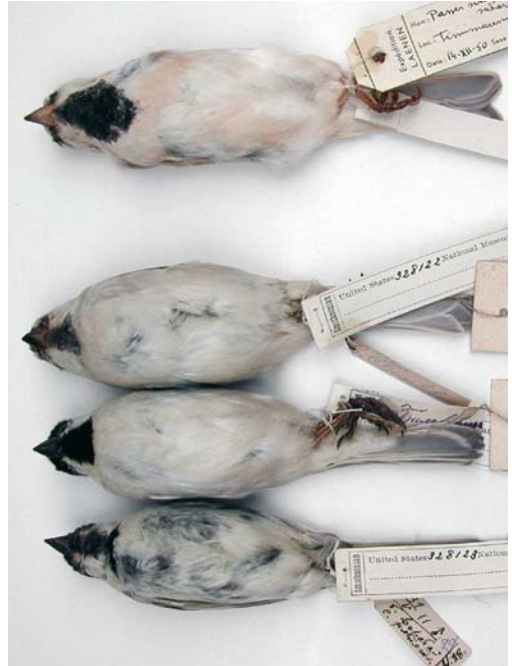
156-157 Zarudny's Sparrows / Zarudny's Woestijnmussen Passer (simplex) zarudnyi , two males and female (lower three), and Desert Sparrow / Afrikaanse Woestijnmus P s saharae , young male, National Museum of Natural History, Smithsonian Institution, Washington DC, USA, August 2006 (Guy M Kirwan)