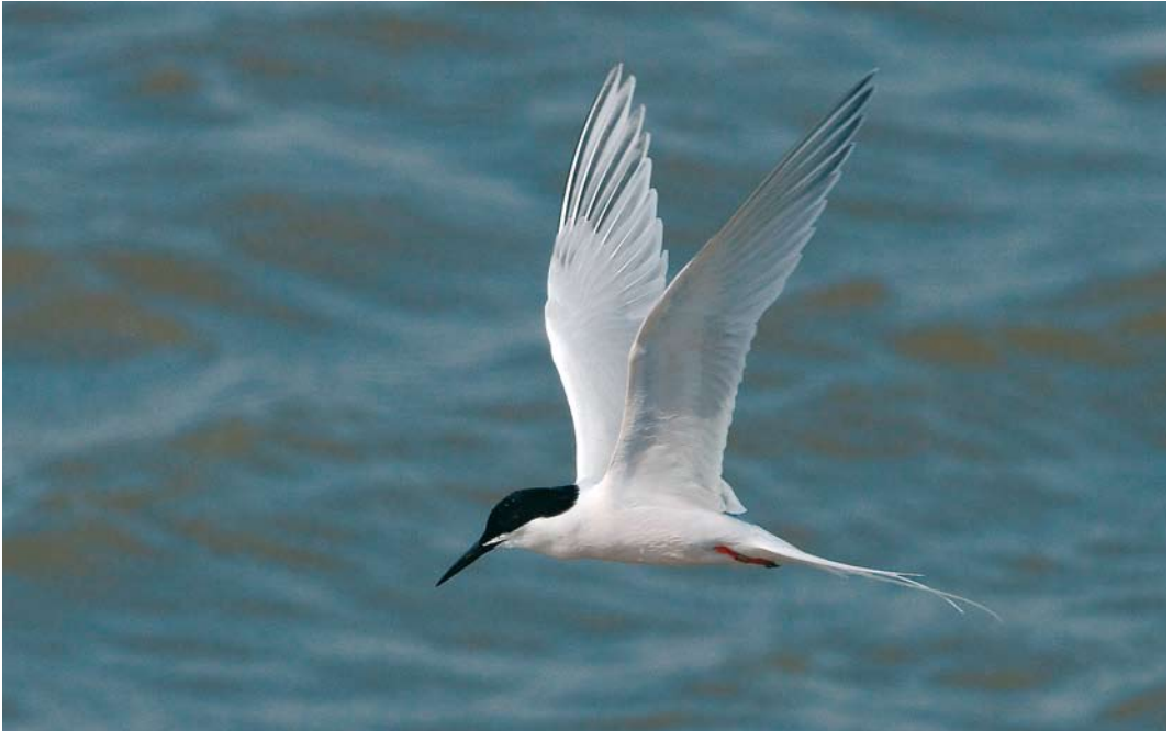
208 Roseate Tern / Dougalls Stern Sterna dougallii , adult, Stellendam, Zuid-Holland, Netherlands, 7 May 2009