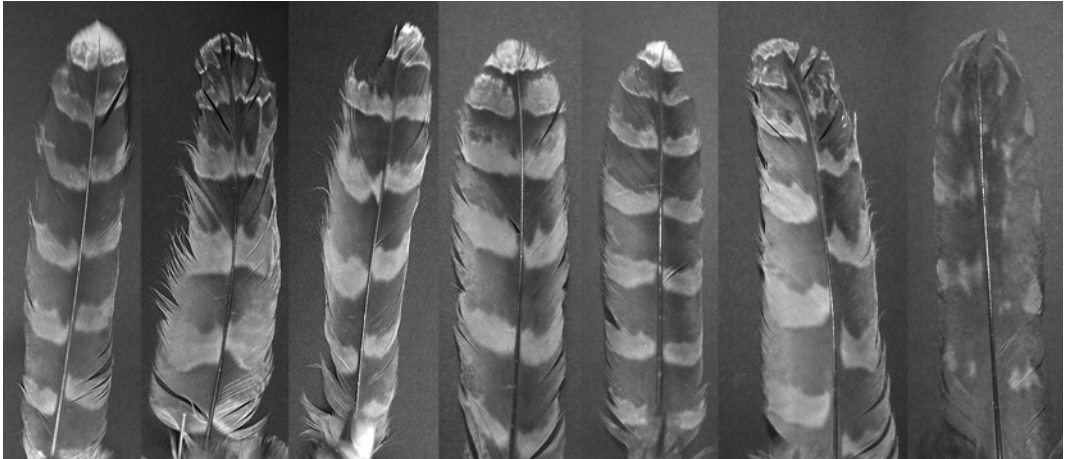
183 Variability of barring pattern on central tail-feathers in Ural Owls Strix uralensis macrourea (Al Vrezec). Note that on the right feather from dark melanistic morph individual barring pattern is greatly reduced due to increase of melanin.

istic birds are the rarest and individuals of the pale morph and grey morph are the most common (table 1). Because the plumage variation from pale