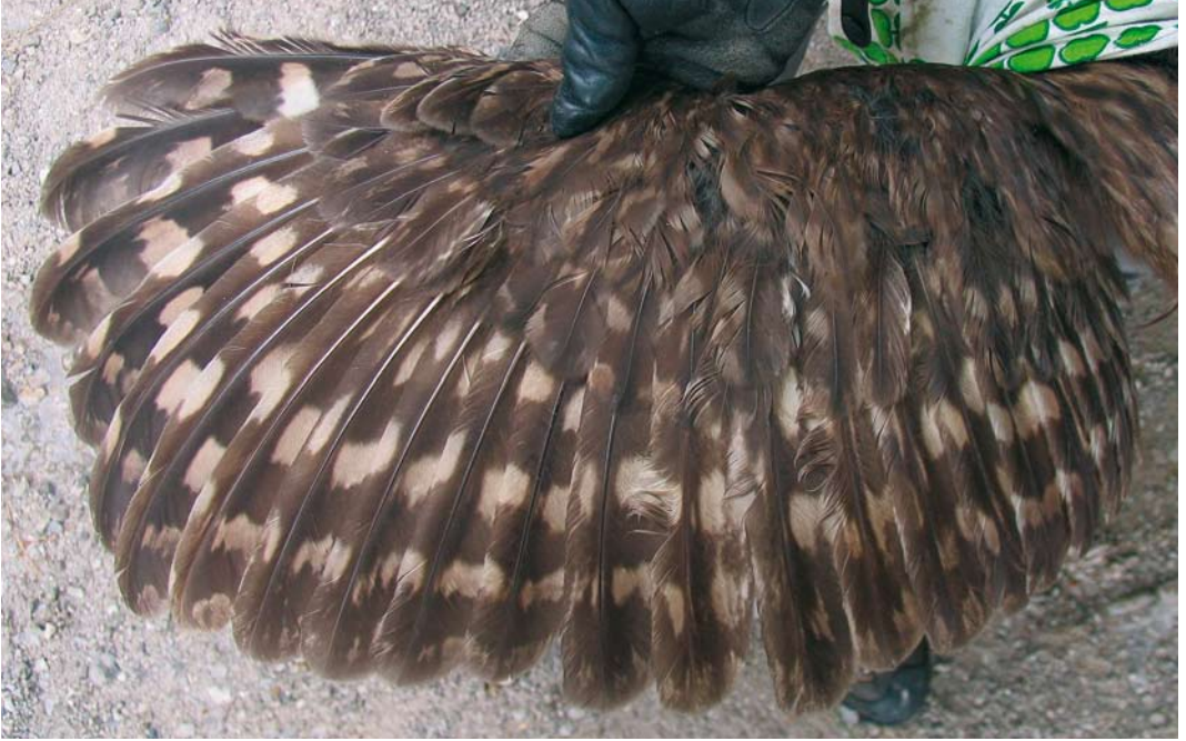
181 Ural Owl / Oeraluil Strix uralensis macroura , central Slovenia, 6 June 2007 ( Andrej Kapla ). Wing of melanistic morph.