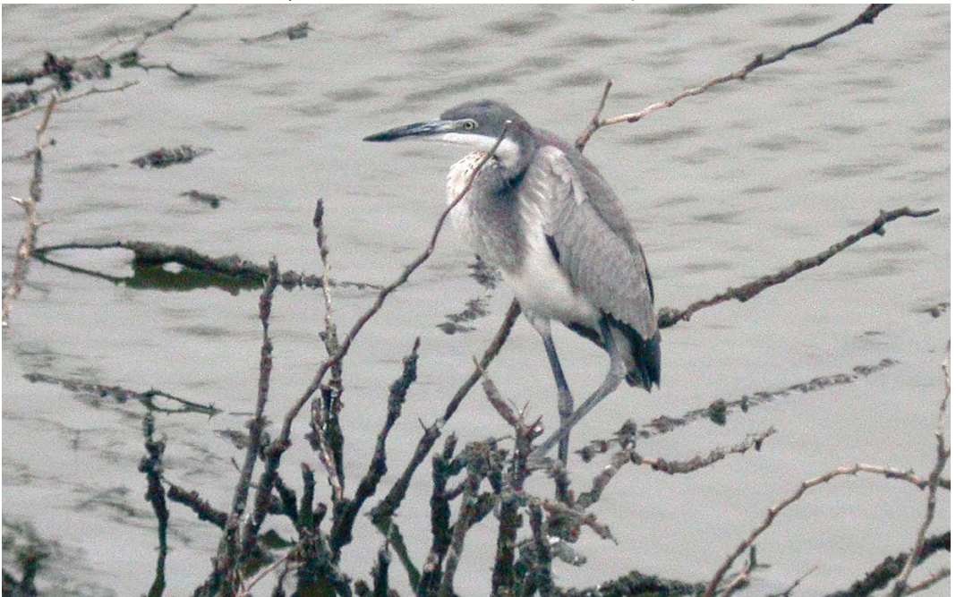
209 Black-headed Heron / Zwartkopreiger Ardea melanocephala , Barragem de Poilao, Santiago, Cape Verde Islands, 21 March 2009