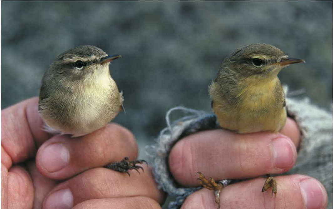
200 Willow Warblers / Fitissen Phylloscopus trochilus , Valassaaret, Finland, September 1995. Both birds were used as mystery bird in the Masters of Mystery competition. The left one was the most difficult mystery bird in 12 years of competition: no entrant identified it correctly.

Raptors (hawks Accipitridae and falcons Falconidae) were chosen 16 times (11%) and gulls Laridae 11 times (8%). Of these most 'popular' families, the mystery photographs of gulls resulted in the lowest percentage of correct answers (on average correctly identified by only 39% of the entrants), whereas the waders were the most easy ones (on average, 54% correct answers). Of the families with more than five mystery photographs, wag-tails Motacillidae (including pipits Anthus ) were the most difficult to identify. On average, only 30% of the entrants managed to identify the mystery photographs of the latter family correctly.