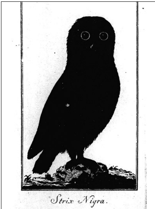
FIGURE 3 First published illustration of melanistic morph of Carpathian-Dinaric Ural Owl Strix uralensis macrourea given by Hacquet (1791) and described as ' Strix nigra '

to dark is clinal, the number of distinguishable morphs is difficult to define and the four morphs proposed here and their demarcation must be considered somewhat arbitrary.