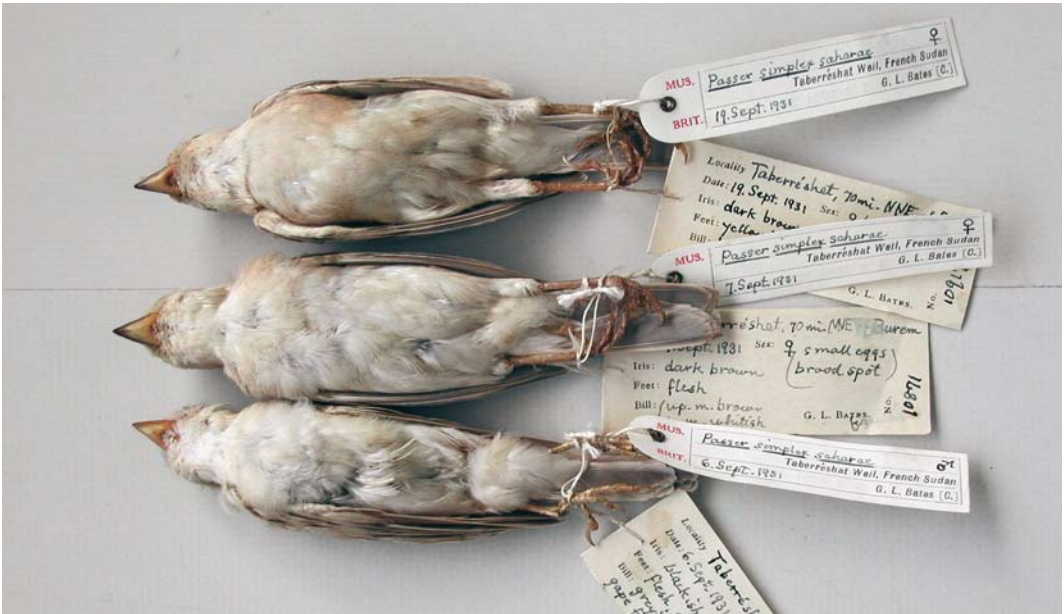
168 Desert Sparrows / Afrikaanse Woestijnmussen Passer simplex , Natural History Museum, Tring, England, February 2007. Ventral comparison of saturation in three specimens of P s simplex from Mali. From top to bottom: female (September), female (September) and young male (September). Similar variation can be seen in upperparts coloration of specimens from Mali.