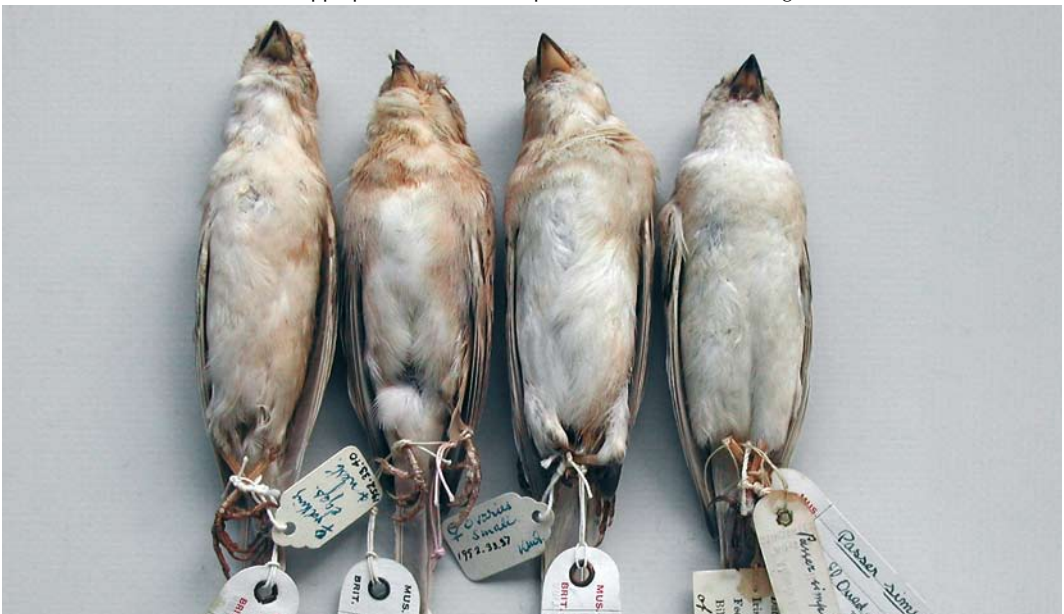
169 Desert Sparrows / Afrikaanse Woestijnmussen Passer simplex , Natural History Museum, Tring, England, February 2007. Ventral comparison of saturation in specimens from range of P s saharae . From left to right: Libya (April), Libya (September), Libya (April) and Algeria (April). Similar variation can be seen in upperparts coloration of specimens from the same regions.