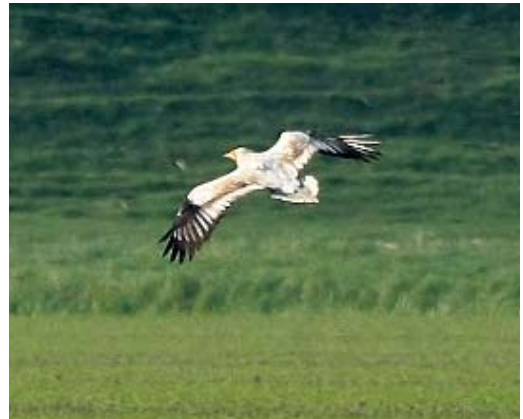
231 Roodkeelpieper / Red-throated Pipit Anthus cervinus , De Pomp, Lauwersmeer, Friesland, 26 april 2009 (Roef Mulder) 232 Roodstuitzwaluw / Red-rumped Swallow Cecropis daurica , Kraaijensbergse Plassen, Gelderland, 7 april 2009 (Harvey van Diek) 233 Rode Rotslijster / Rufous-tailed Rock Thrush Monticola saxatilis , mannetje, Veenhuizerstukken, Groningen, 1 mei 2009 (Phil Koken) 234 Aagier / Egyptian Vulture Neophron percnopterus , Wieringermeer, Noord-Holland, 25 april 2009 (Fred Visscher)

Ruigpootuil Aegolius funereus gevonden; de vogel bleek te zijn geslagen door een Havik A. gentilis . Een overvliegende Alpengierzwaluw Apus melba werd op 3 april gefotografeerd bij Kamperhoek. Een spectaculaire melding was die van een helaas niet twitchbare Huisgierzwaluw A. affinis op 16 maart boven Reek, Noord-Brabant. Indien aanvaard gaat het om het derde geval; de vorige waren op 17 mei 2001 op Terschelling en op 20 november 2006 in IJmuiden. De eerste Hop Upupa epops van het voorjaar werd op 15 maart gefotografeerd in Asten, Noord-Brabant. Vanaf 4 april verschenen soortgenoten op ten minste 20 andere plekken. In het merendeel van de gevallen ging het om kortstondige waarnemingen. Het meeste bekijks trok een exemplaar op de Maasvlakte van 17 tot 19 april. Vanaf 10 april werden verspreid over het land weer verscheidene Draaihalzen Jynx torquilla waargenomen. Het exemplaar dat op die datum in de Eemshaven verbleef, kreeg misschien nog