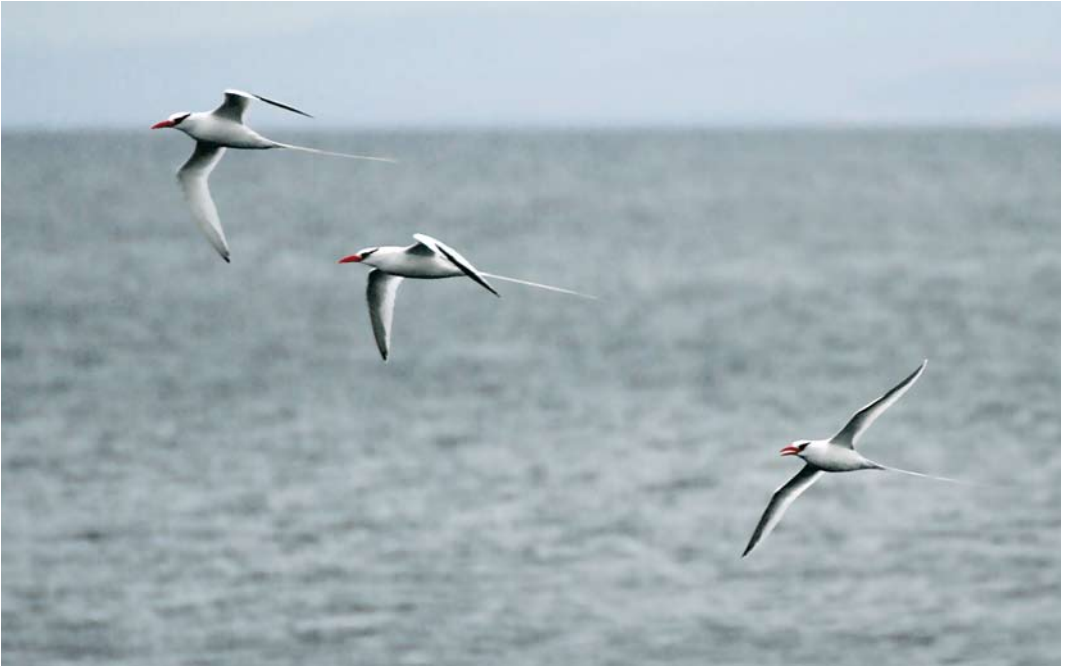
206 Red-billed Tropicbirds / Roodsnavelkeerkringvogels Phaeton aethereus , Puerto del Carmen, Lanzarote, Canary Islands, 26 April 2009 (Francisco Javier García Vargas)