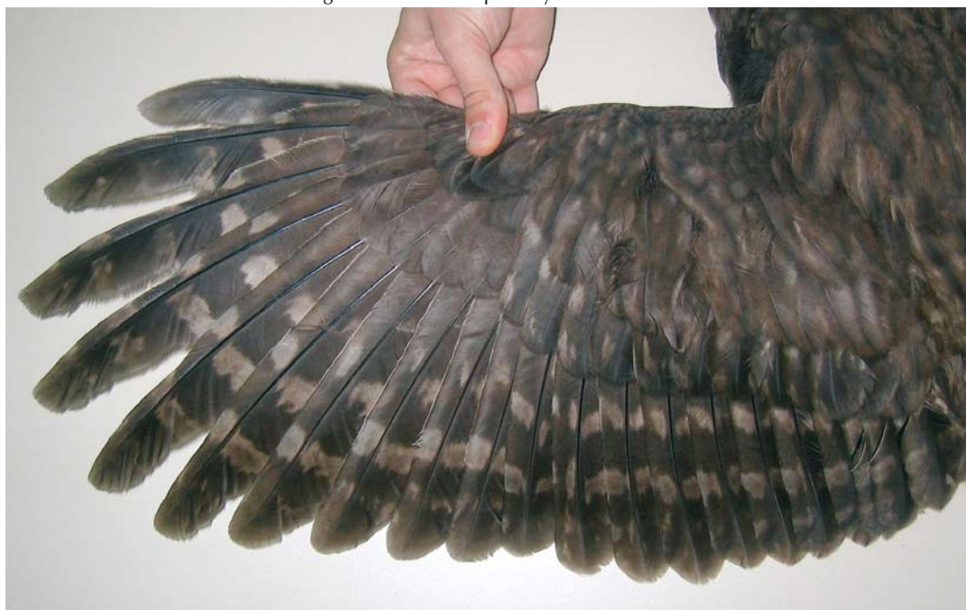
182 Ural Owl / Oeraluil Strix uralensis macroura , Ljubljana, Slovenia, 20 November 2004. Wing of melanistic morph. Very dark individual.