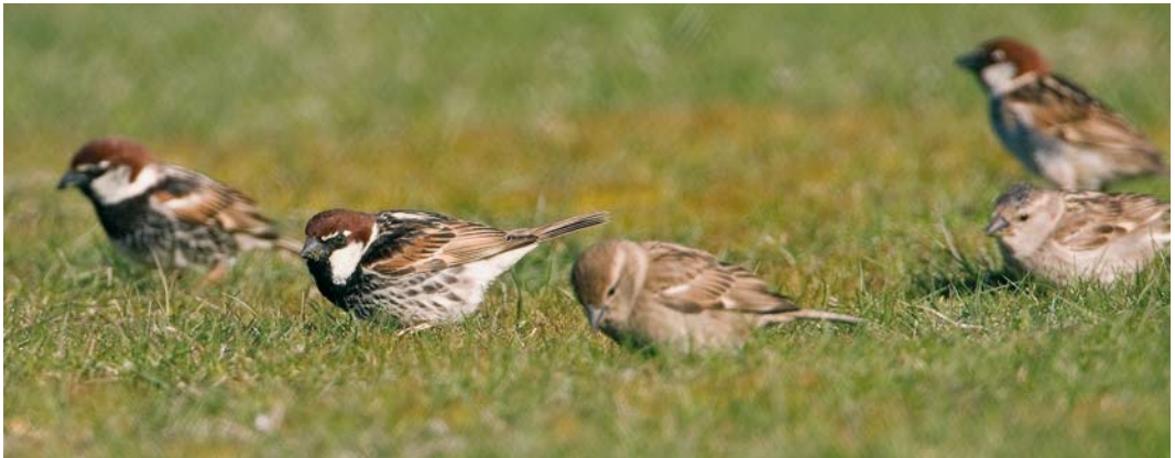
237 Spaanse Mussen / Spanish Sparrows Passer hispaniolensis , mannetjes en vrouwtjes, Eemshaven, Groningen, 10 april 2009

Omdat niet eerder groepjes Spaanse Mussen rond de Noordzee waren gezien, werd over de herkomst gespeculeerd. Zo was enkele dagen voor de ontdekking in de haven een graanschip uit Griekenland aangekomen dat onderweg geen andere haven had aangedaan. Voor zover bekend zijn de vogels echter niet op of in de buurt van dat schip gezien. Verder zijn er geen aanwijzingen dat de vogels met een schip zijn meegekomen. De soort is in het verleden wel verdacht van het zich verplaatsen per schip. Zo verbleven in mei 1995 zes Spaanse Mussen te Antifer in Normandië, Frankrijk, waarvan werd verondersteld dat ze met een schip waren gearriveerd (Birding World 8: 355, 1995). Daar staat tegenover dat de soort in Zuid-Europa trekvogel is en normaliter in groepjes vliegt. De CDNA neemt vogels waarvan is aangetoond dat ze met behulp van een schip zijn aangekomen niet