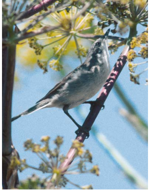
201-203 Lesser Whitethroat / Braamsluiper Sylvia curruca , Lesvos, Greece, May 1995. Used as mystery bird and presumed to be an 'orphan warbler S hortensis/crassirostris ' (then: Orphean Warbler S hortensis ) by the authors (Dutch Birding 19: 244-248, 1997), but in retrospect a Lesser Whitethroat, as most of the entrants rightly suggested.