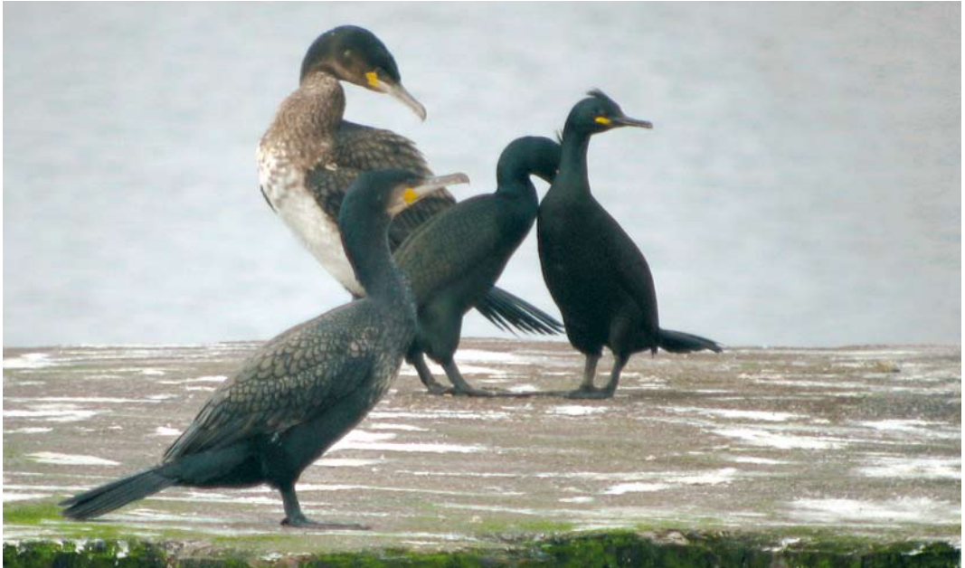
227 Grote Aalscholver / Atlantic Great Cormorant Phalacrocorax carbo carbo (achter), Aalscholver / Continental Great Cormorant P c sinensis (voor) en Kuifaalscholwers / European Shags P aristotelis , adult (rechts), Noordersluis, IJmuiden, Noord-Holland, 5 april 2009