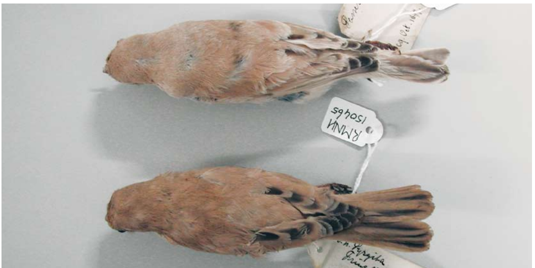
162 Desert Sparrows / Afrikaanse Woestijnmussen Passer simplex , Nationaal Natuurhistorisch Museum Naturalis, Leiden, Netherlands, July 2008 (Guy M Kirwan). Dorsal comparison of female P s simplex (bottom) and P s saharae (top).