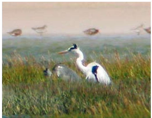
212 Purple Heron / Puperreiger Ardea purpurea , off Gough, Tristan da Cunha archipelago, South Atlantic Ocean (40°25'91"S, 9°59'53"W), 8 April 2009 213 Magnificent Frigatebird / Amerikaanse Fregatvogel Fregata magnificens , Curral Velho, Boavista, Cape Verde Islands, 26 March 2009 214 Chinese Shrike / Chinese Klauwier Lanius arenarius , male, Bibi Shirvan, Golestan, Iran, 19 January 2009 215 Caspian Plover / Kaspische Plevier Charadrius asiaticus , Mandria beach, Cyprus, 9 April 2009 216 Cricket Warbler / Krekelprinia Spiloptila clamans , between Dakhla and Aousserd, Morocco, 21 April 2009 217 Mauritainian Heron / Mauritaanse Blauwe Reiger Ardea cinerea monicae , Hoja Lamera, Dhakla bay, Morocco, 22 April 2009