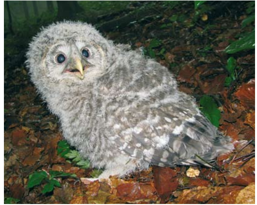
188 Ural Owl / Oeraluil Strix uralensis macrourea , central Slovenia, 21 May 2008 (Al Vrezec). Fledgling of pale or grey morph, with well distinguishable barring pattern on back and belly.

individuals of the pale and grey morphs, much less so in partially melanistic birds and almost imperceptible in melanistic individuals. The circumocular barring is present only in pale and grey morph individuals but not in melanistic birds. I have found that circumocular barring is present in all grey morph owls but is absent in c 43% of pale morph individuals (table 1). The increase of pigments (melanin) is shown also in the barring pattern of the primaries and secondaries, with the dark bars generally being larger in melanistic individuals than in pale or grey birds. Also in the tail-feathers, especially the pair of central feathers, only a few pale patches with no clear barring pattern are present in melanistic individuals. Similar almost unicoloured central tail-feathers are also found in davidi (Scherzinger & Fang 2006).