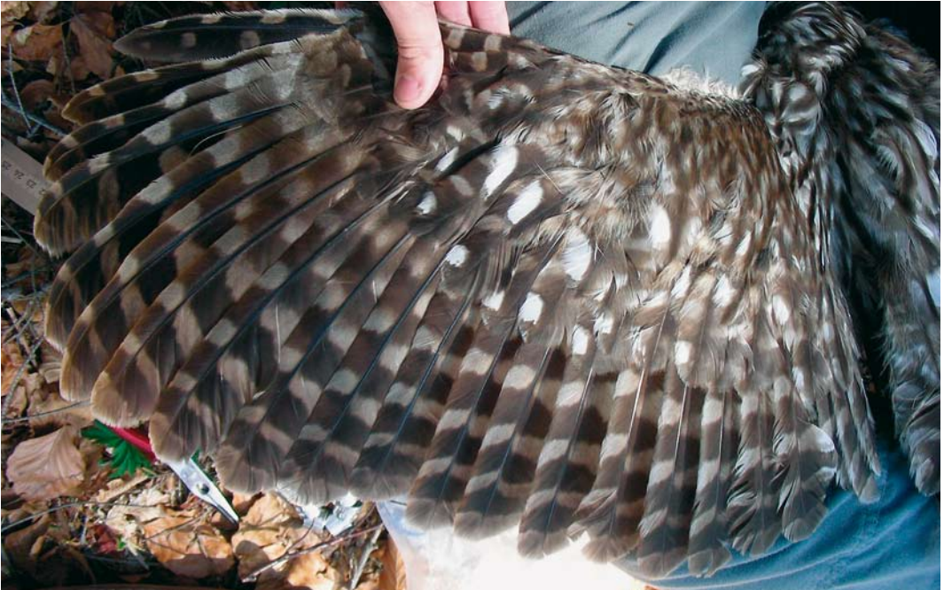
179 Ural Owl / Oeraluil Strix uralensis macroura , central Slovenia, 6 April 2007 (Andrej Kapla). Wing of pale morph.