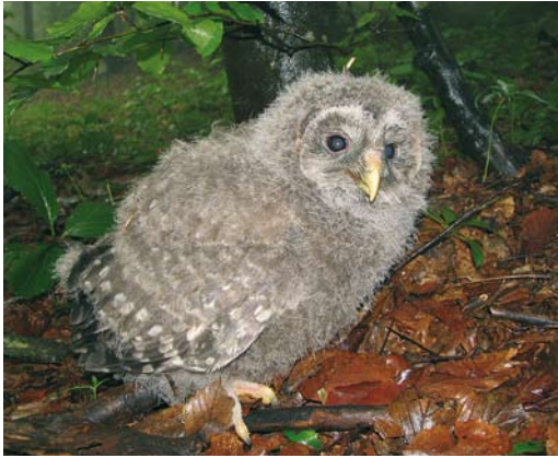
187 Ural Owl / Oeraluil Strix uralensis macrourea , central Slovenia, 21 May 2008 (Al Vrezec). Fledgling of partially melanistic or melanistic morph, with no visible bars on back or belly and with dark facial disk.