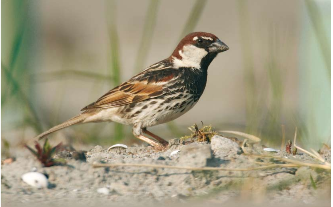
238 Spaanse Mus / Spanish Sparrow Passer hispaniolensis , mannetje, Eemshaven, Groningen, 11 april 2009 (Mark Schuurman)