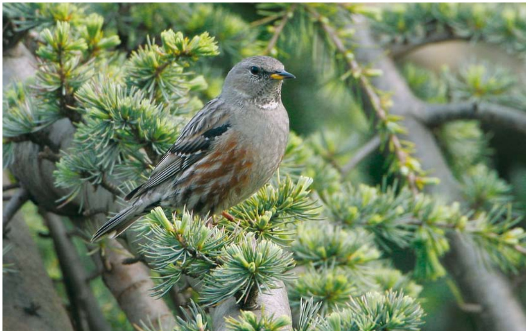
235 Alpenheggenmus / Alpine Accentor Prunella collaris , Eibergen, Gelderland, 26 april 2009 (Martin van der Schalk)