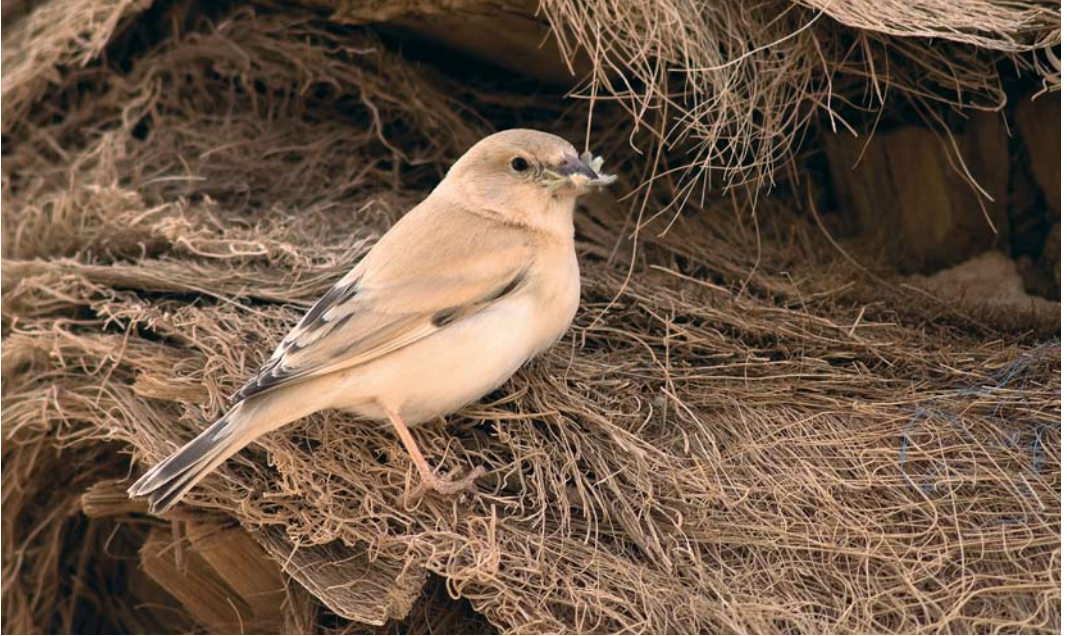
172 Desert Sparrow / Afrikaanse Woestijnmus Passer simplex saharae , female, Merzouga, Tafilalt, Morocco, 30 March 2004

qualifies for Red Data listing, given that its core range is now potentially rather small and shows evidence of having declined in recent decades.