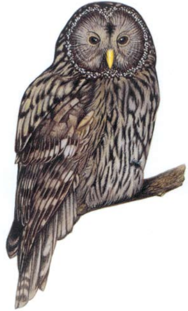
FIGURE 2 Variability of plumage coloration in Carpathian-Dinaric Ural Owls Strix uralensis macroura with four colour morphs: 1 pale morph, 2 grey morph, 3 partially melanistic morph, and 4 melanistic morph (Žarko Vrezec)