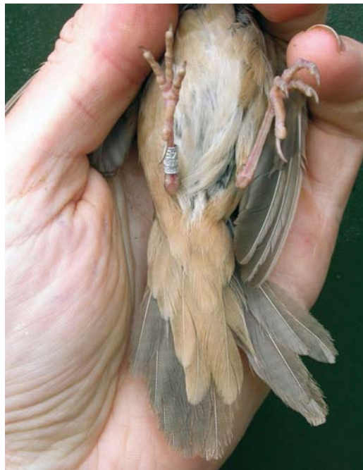
196 Aberrant Savi's Warbler / Snor Locustella luscinioides , Korte Waarden, Elburg, Gelderland, Netherlands, 21 June 2008 (Symen Deuzeman). Note dark instead of white shaft of undertail-coverts. 197 Savi's Warbler / Snor Locustella luscinioides , Zwarte Meer West, Overijssel, Netherlands, 29 June 2008 (Symen Deuzeman). Note white shaft of undertail-coverts. 198 Savi's Warbler / Snor Locustella luscinioides , Castricum, Noord-Holland, Netherlands, 27 August 2007 (André J van Loon). Note unmarked median and lesser coverts.