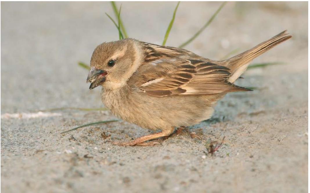
239 Spaanse Mus / Spanish Sparrow Passer hispaniolensis , vrouwtje, Eemshaven, Groningen, 11 april 2009 (Mark Schuurman)