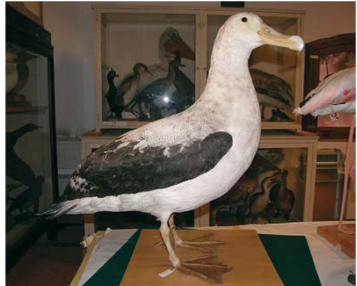
199 Tristan Albatross / Tristanalbatros Diomedea exulans dabbenena , immature male (collected at Palermo, Sicily, Italy, on 4 October 1957), Museo di Storia Naturale, Terrasini, Sicily, Italy, February 2008 (Fabio Lo Valvo)

Soldaat et al (2009) mentioned the bill size (length 150 mm, width c 39 mm) published in Orlando (1958) as being characteristic for dabbenena . Apart from this, the overall smaller size separates it from Wandering Albatross D e exulans but does not exclude Antipodean Albatross D e antipodensis which is similar in size. However, antipodensis is extremely unlikely to occur in the WP because it is distributed mainly in the Pacific Ocean. Separating the 'wandering albatross' taxa, which are often regarded as five separate species (cf Burg & Croxall 2004, Soldaat et al 2009), is very difficult but measurements should lead to the correct taxon. The Sicilian specimen is thus as-