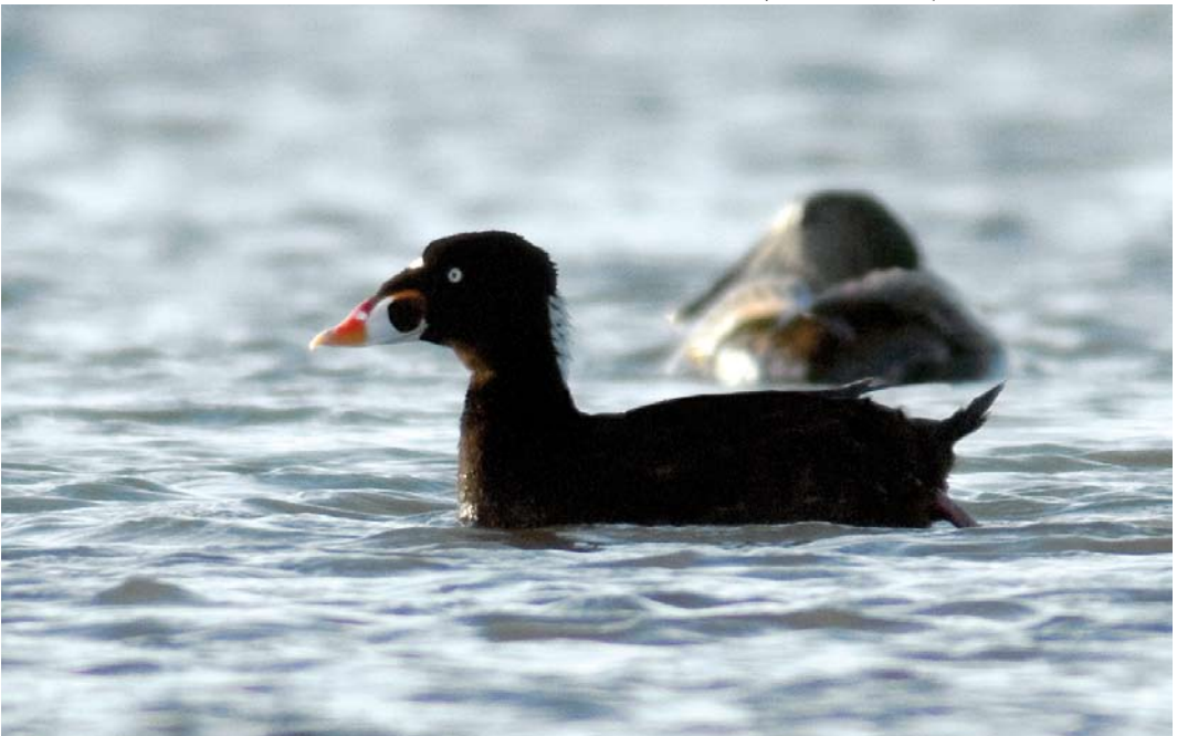
207 Surf Scoter / Brilzee-eend Melanitta perspicillata , adult male, with Common Eider / Eider Somateria mollissima , De Slufter, Texel, Noord-Holland, Netherlands, 10 May 2009