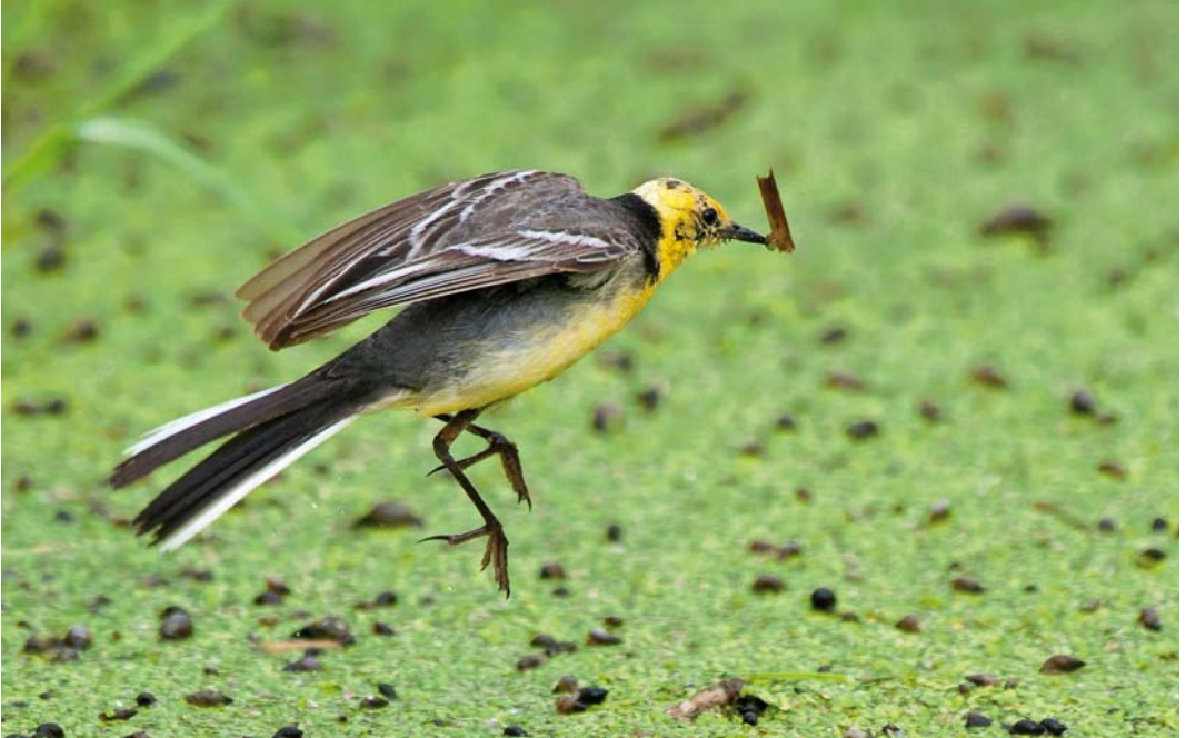
327 Citrine Wagtail / Citroenkwikstaart Motacilla citreola , first-summer male, collecting food for young, Zeewolde, Flevoland, Netherlands, 16 July 2011