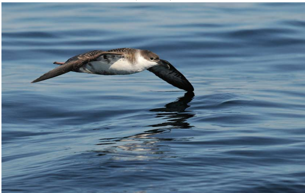
273 Great Shearwater / Grote Pijlstormvogel Puffinus gravis , off southern Portugal, 23 September 2009