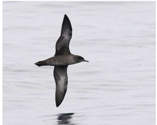
277 British Storm Petrel / Stormvogeltje Hydrobates pelagicus , off southern Portugal, 23 September 2010 (Roef Mulder) 278 Wilson's Storm Petrel / Wilsons Stormvogeltje Oceanites oceanicus , off southern Portugal, 23 September 2010 (Roef Mulder) 279 Great Shearwater / Grote Pijlstormvogel Puffinus gravis , off southern Portugal, 23 September 2010 (Roef Mulder) 280 Sooty Shearwater / Grauwe Pijlstormvogel Puffinus griseus , off southern Portugal, 23 September 2010 (Roef Mulder)

ed include Barolo Shearwater Puffinus baroli (eg, in September 2010). Yelkouan Shearwater P yelkouan is suspected to occur in very small numbers but there have not yet been any confirmed records (Magnus Robb in litt). The cape can especially be productive if the wind blows from a westerly direction. The southern headlands in the vicinity of Sagres is often even better when calm conditions prevail or the wind comes from the south, particularly for close-up views of shearwaters. The critically endangered Balearic Shearwater P mauretanicus can occur in numbers exceeding 200 birds per hour, representing a considerable percentage of the world population (in the Balearic Islands, breeding numbers have decreased severely over the last years and are estimated to stand as