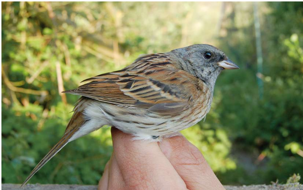
362 Maskergors / Black-faced Bunting Emberiza spodocephala , mannetje, Zwanenwater, Noord-Holland, 7 mei 2011 ( Peter Spanenburg ) 363 Cirlgors / Cirl Bunting Emberiza cirlus , vrouwtje, 't Vroon, Westkapelle, Zeeland, 4 mei 2011 ( Arnoud B van den Berg ) 364 Bruinkeelortolaan / Cretschmar's Bunting Emberiza caesia , mannetje, Rottumerplaat, Groningen, 14 mei 2011 ( Bernard Spaans )