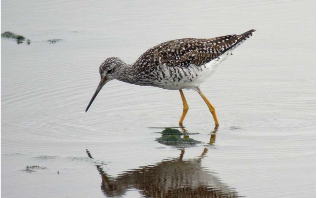
345 Grote Geelpootruiter / Greater Yellowlegs Tringa melanoleuca , eerste-zomer, Bokkegat, Wissenkerke, Zeeland, 26 juni 2011 ( Kris De Rouck )