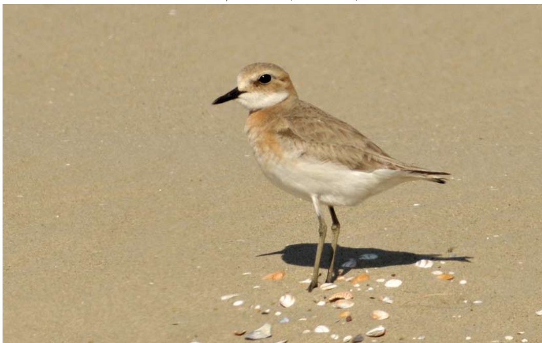
344 Woestijnplevier / Greater Sand Plover Charadrius leschenaultii , tweede-kalenderjaar, Julianadorp, Noord-Holland, 4 mei 2011