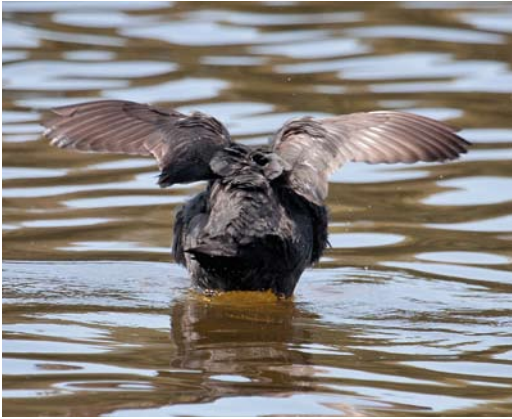
303 Hybrid Eurasian x Red-knobbed Coot / hybride Meerkoet x Knobbelmeerkoet Fulica atra x cristata , Sidi Bou-Rhaba, Morocco, 25 April 2009. Unlike Eurasian, white trailing edge to secondaries is (almost) absent.