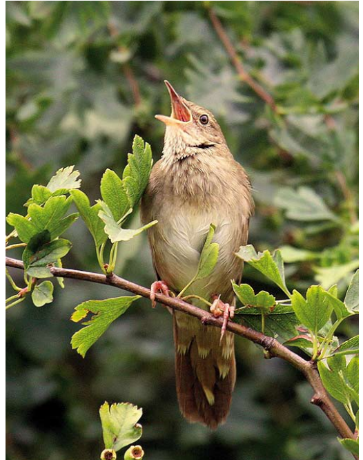
324 European Roller / Scharrelaar Coracias garrulus , Zuidland, Zuid-Holland, Netherlands, 10 July 2011 ( Frank Dröge ) 325 River Warbler / Krekelzanger Locustella fluviatilis , Beijumberbos, Groningen, Groningen, Netherlands, 2 July 2011 ( Alwin Borhem ) 326 Lesser Grey Shrike / Kleine Klapekster Lanius minor , Houtave, West-Vlaanderen, Belgium, 2 June 2011 ( Filip De Ruwe )