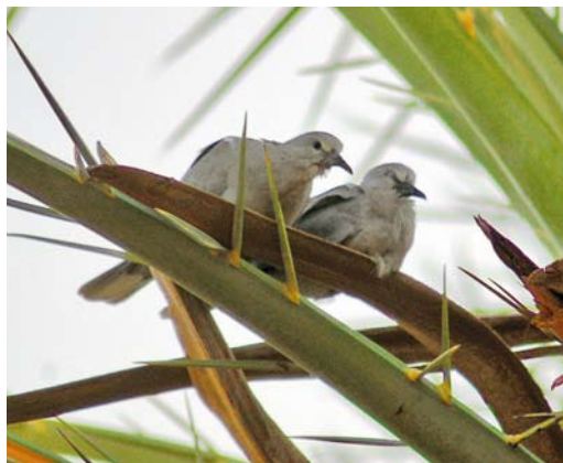
306 Eurasian Collared Doves / Turkse Tortels Streptopelia decaocto , fledglings, Awlad Margham, Libya, 19 August 2010

Breeding can be expected in other areas where good numbers of the species have been observed (see table 1). The possible impact of the spread of Eurasian Collared Dove through Libya on European Turtle Dove S turtur and Laughing Dove S senegalensis needs further investigation, as they are likely to compete for the same resources such as food and breeding sites.