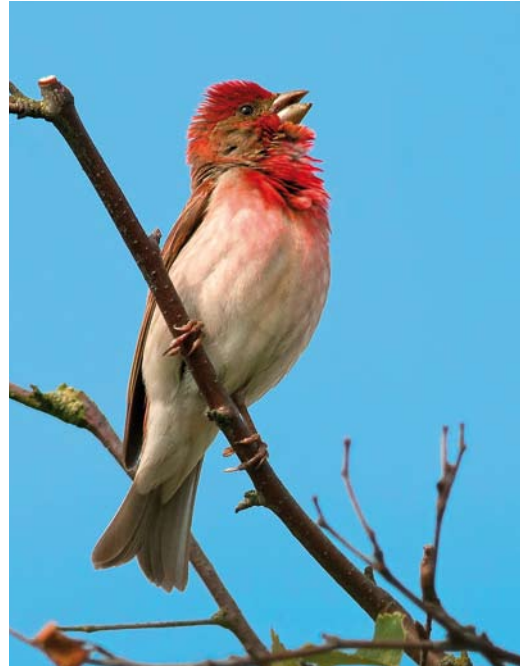
359 Slangenarend / Short-toed Snake Eagle Circaetus gallicus , Delleboersterheide, Friesland, 2 juni 2011 360 Roodmus / Common Rosefinch Carpodacus erythrinus , De Cocksdorp, Texel, Noord-Holland, 6 juni 2011 361 Roodmus / Common Rosefinch Carpodacus erythrinus , Grootte Keeten, Noord-Holland, 12 juni 2011