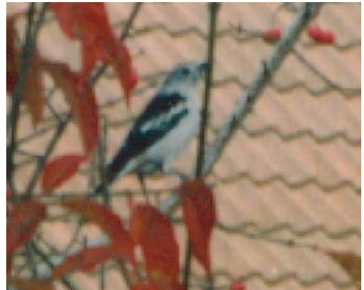
291 Daurische Spreeuw / Daurian Starling Agropsar sturninus , Duiven, Gelderland, 5 November 1999 (A J Meeuwissen)

slijtage of ontbrekende veren; snavel niet beschadigd, vergrooid of tweekleurig. Poten niet goed zichtbaar tussen bladeren, maar geen afwijkingen zichtbaar.