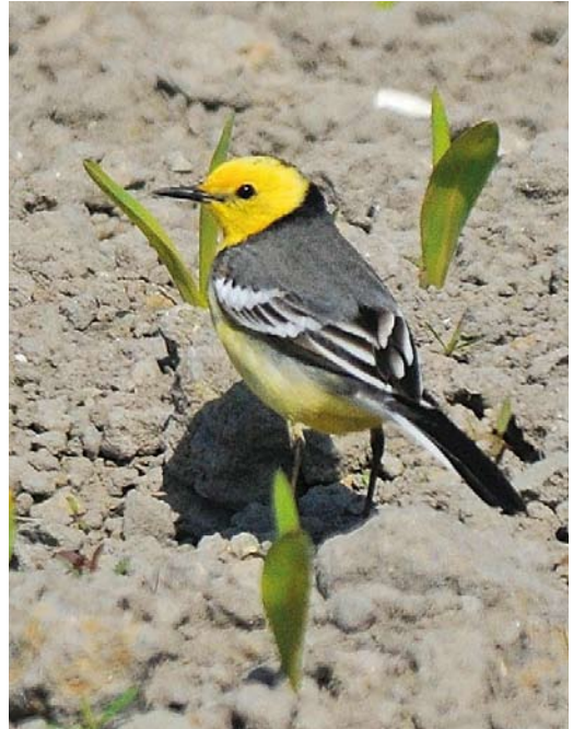
358 Citroenkwikstaart / Citrine Wagtail Motacilla citreola , mannetje, Dijkgatweide, Noord-Holland, 2 mei 2011 (Ruud Brouwer)

dween, veel waarnemers in vertwijfeling achterlatend omdat een Veldleeuwerik Alauda arvensis voor verwar- ring zorgde. Kortteenleeuweriken Calandrella brachydactyla lieten zich fraai bekijken in Noord-Holland op 7 mei bij Camperduin en van 14 tot 18 mei bij IJmuiden. Op 6 mei werd een overvliegende gemeld op de oost- punt van Vlieland. Een paar Kuifleeuweriken Galerida cristata bij Venlo, Limburg, gaf de Nederlandse populatie een flinke impuls door drie jongen te produceren. De enige andere plek waar de soort met zekerheid werd vastgesteld was in Slot Haverleij bij 's-Hertogenbosch, Noord-Brabant. Roodstuitzwaluwen Cecropis daurica werden gemeld op 1 mei langs Breskens, Zeeland (twee); op 1 mei over Berkeide bij Katwijk; op 1 mei over de Maasvlakte, Zuid-Holland; op 1 mei bij Berkel en Rodenrijs, Zuid-Holland; op 2 mei over de Eemshaven, Groningen (twee); op 3 mei langs Breskens; op 3 mei langs trektpost Noordkaap; op 4 mei langs Breskens; op 5 mei langs Breskens (twee); op 5 mei langs Petten, Noord-Holland; op 7 mei over Terschelling en Schier- monnikoog; op 9 mei langs trektpost Lauwersmeer Kustweg, Groningen (twee); op 20 mei boven het Paterswoldse Meer, Groningen; op 27 mei bij Ridderkerk, Zuid-Holland; en op 28 mei in de Brabantse Biesbosch, Noord-Brabant. Het voorjaarstotaal kwam hiermee uit op minimaal 30 exemplaren.