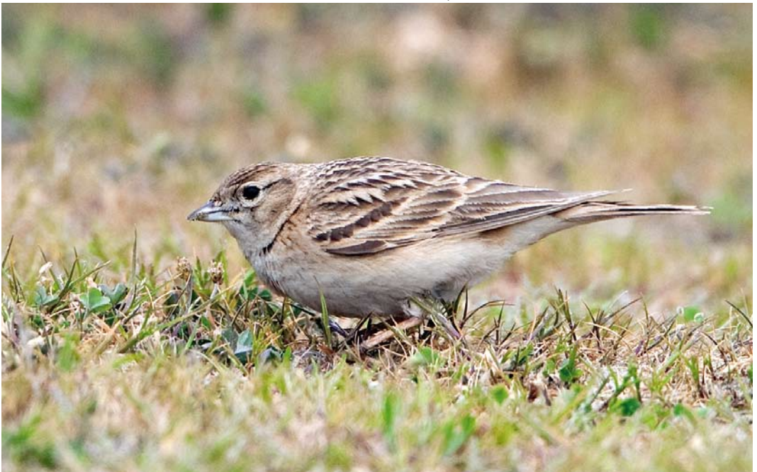
356 Kortteenleeuwerik / Greater Short-toed Lark Calendrella brachydactyla , IJmuiden, Noord-Holland, 16 mei 2011 (Arnold Meijer)