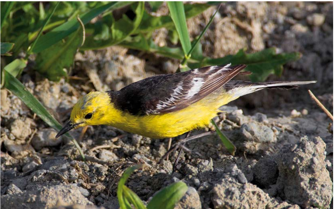
328 Black-backed Citrine Wagtail / Zwartrugcitroenkwikstaart Motacilla citreola calcarata , first-summer male, Van marshes, East Anatolia, Turkey, 18 May 2011