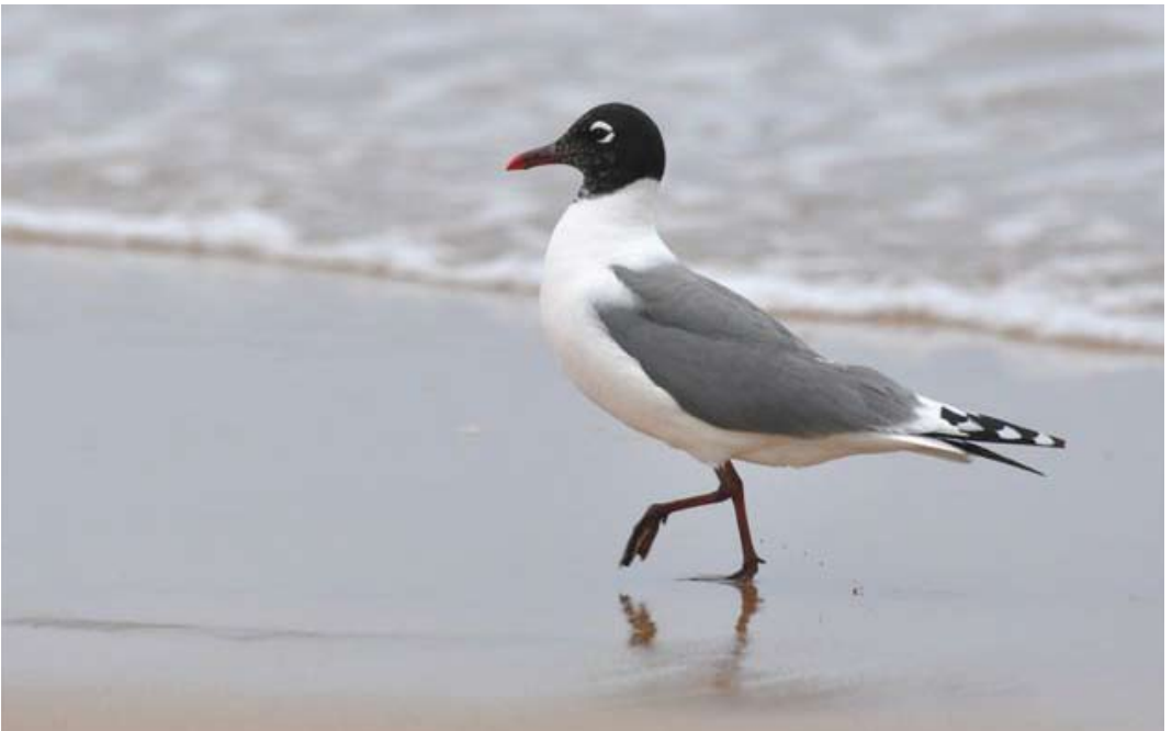
323 Franklin's Gull / Franklins Meeuw Larus pipixcan , adult, Aghroud plage, Haha, Morocco, 16 June 2011 (Suzanne Bonmarchand)