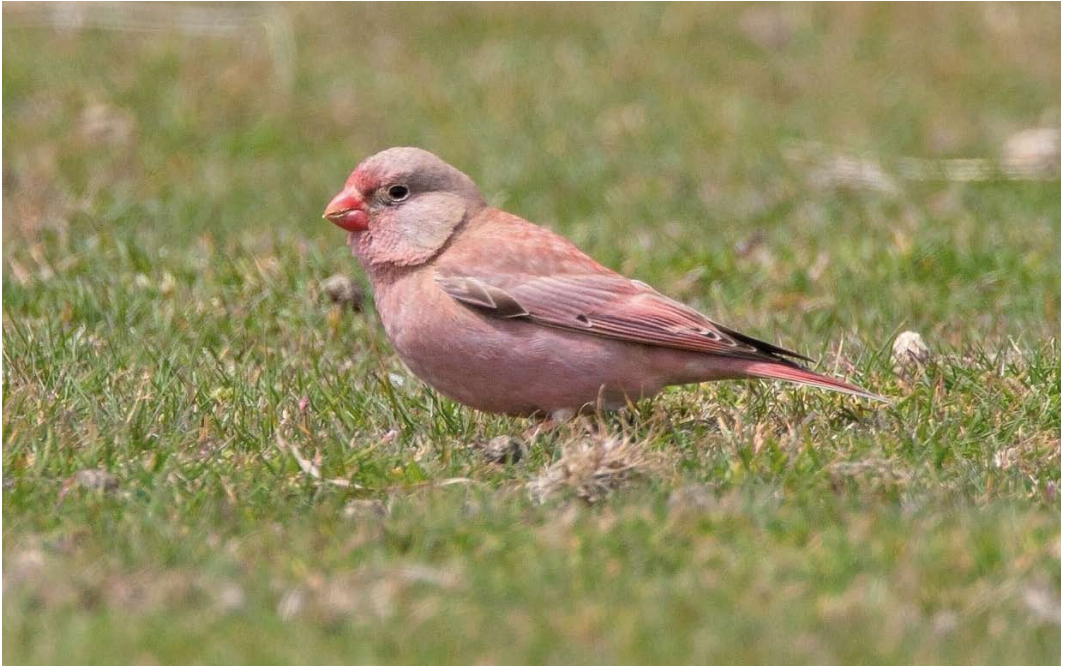
329 Trumpeter Finch / Woestijnvink Bucanetes githagineus , male, Lundy, Devon, England, 14 May 2011 (Andy Jordan)