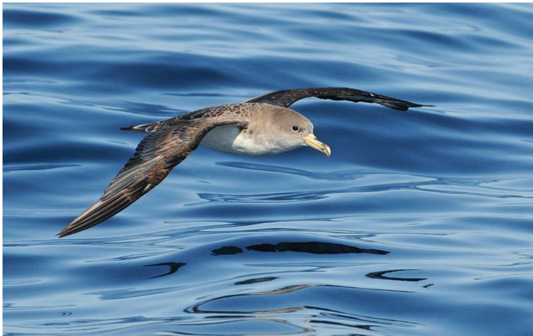
272 Cory's Shearwater / Kuhls Pijlstormvogel Calonectris borealis , off southern Portugal, 23 September 2009 (Roef Mulder)