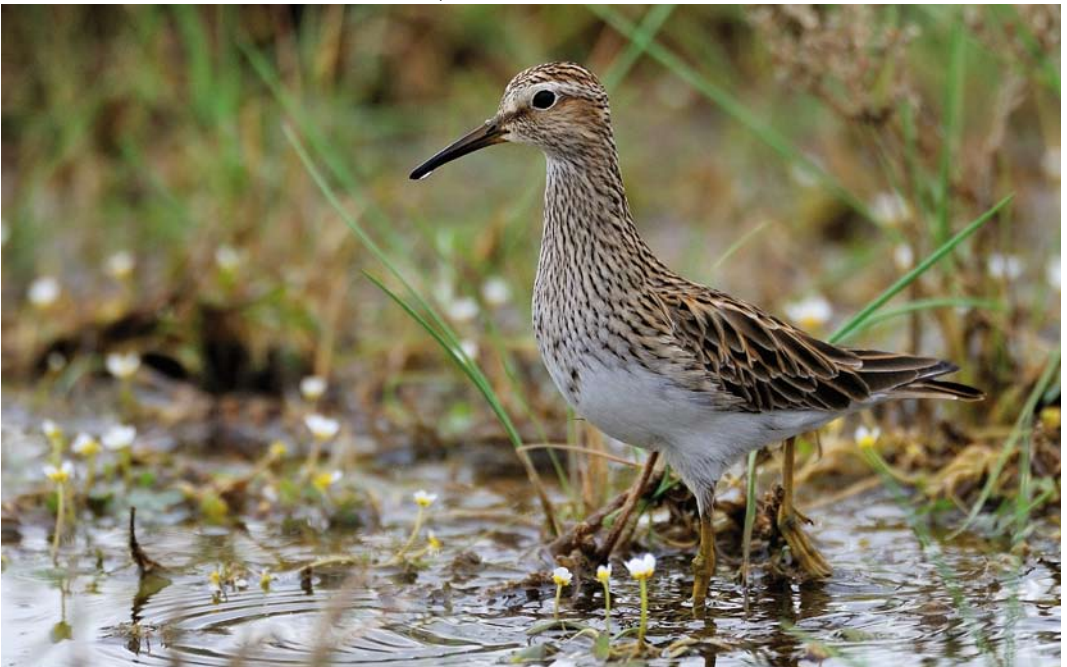
321 Pectoral Sandpiper / Gestreepte Strandloper Calidris melanotos , Stintino peninsula, Sardinia, Italy, 15 May 2011 (Venanzio Cadoni)