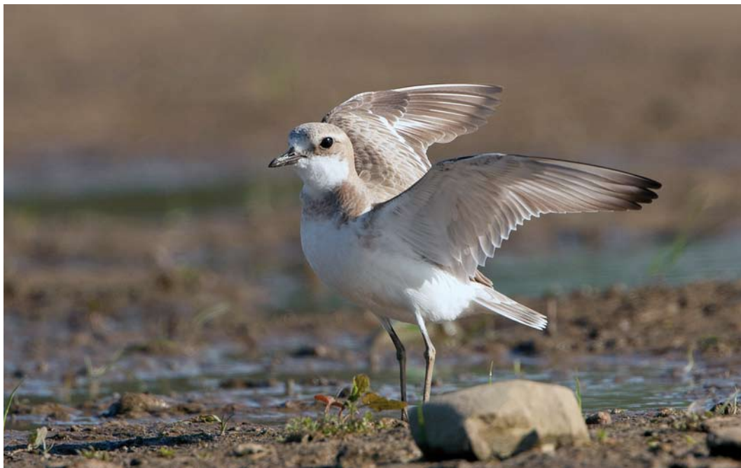
343 Woestijnplevier / Greater Sand Plover Charadrius leschenaultii , adult vrouwtje, Liendense Waard, Batenburg, Gelderland, 1 mei 2011 ( Co van der Wardt )