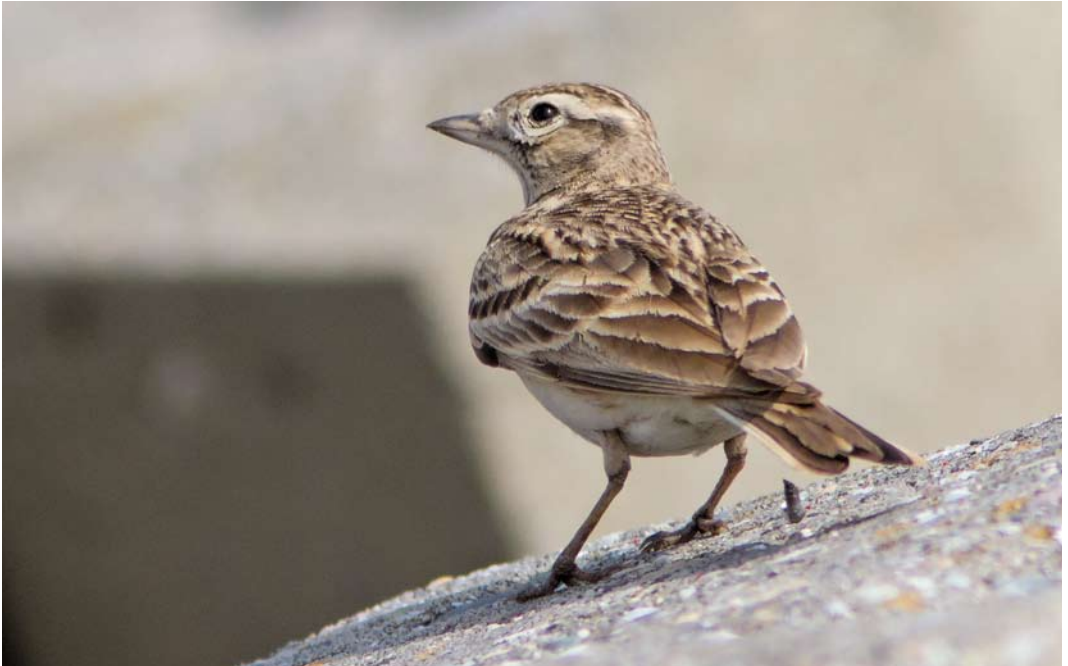
355 Kortteenleeuwerik / Greater Short-toed Lark Calendrella brachydactyla , Camperduin, Noord-Holland, 7 mei 2011 (Roelof de Beer)