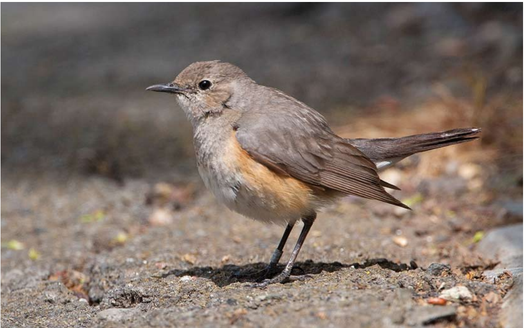
330 White-throated Robin / Perzische Roodborst Irania gutturalis , female, Hartlepool, Cleveland, England, 8 June 2011 (Kevin Du Rose)