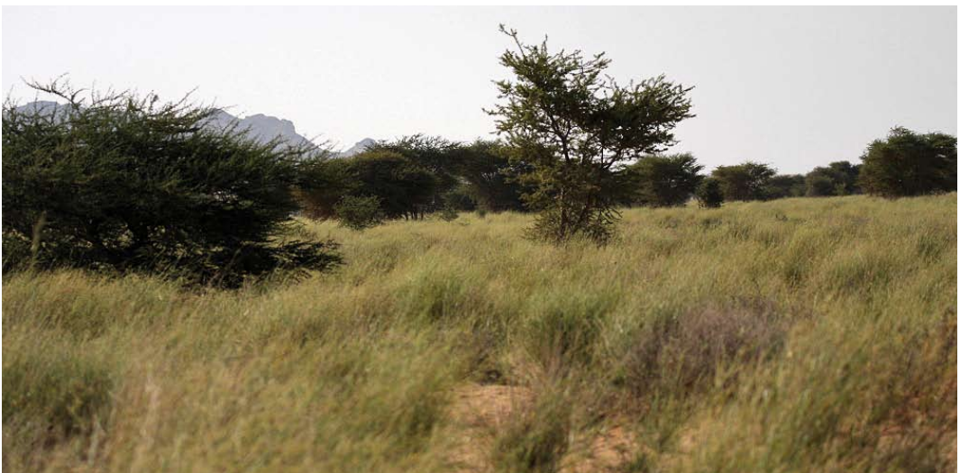
288 Breeding habitat of Cricket Longtail Spiloptila clamans in Oued Jenna, Aousserd, Oued Ed-Dahab, Morocco, 25 October 2010 (Mohamed Radi)

During our survey we recorded the breeding ac-