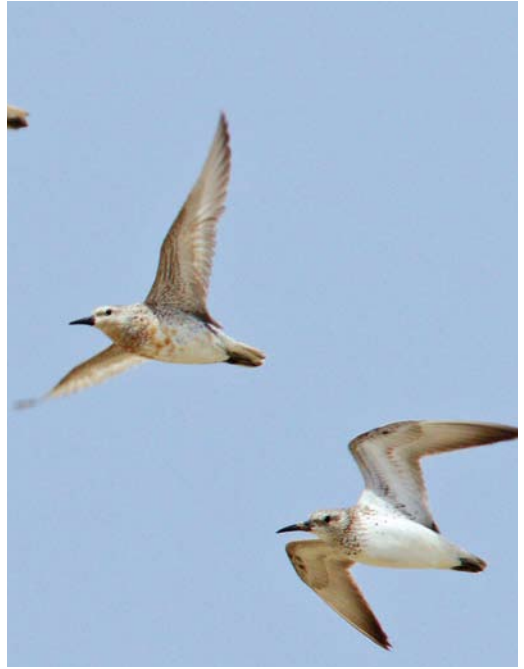
311 Presumed Eastern Common Tern / vermoedelijke Oostelijke Visdief Sterna hirundo longipennis, with Common Tern / Visdief S h hirundo, Heist, West-Vlaanderen, Belgium, 22 June 2011 312 Red Knot / Kanoet Calidris canutus, with Great Knot / Grote Kanoet C tenuirostris, Bandar Abbas, Hormozgan, Iran, 18 May 2011 313 Brown Noddy / Noddy Anous stolidus, Persian Gulf, Iran, 7 June 2011