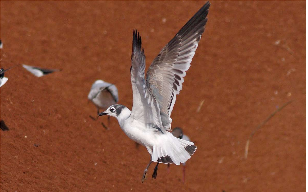
322 Franklin's Gull / Franklins Meeuw Larus pipixcan , second-summer, Delitzsch, Sachsen, Germany, 6 May 2011 (Jürgen Steudtner)