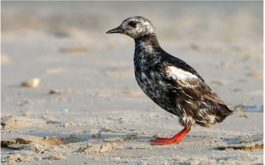
341 Zwarte Zeekoet / Black Guillemot Cephus grylle , eerstejaars, De Cocksdorp, Texel, Noord-Holland, 7 mei 2011 (Arnold Meijer)