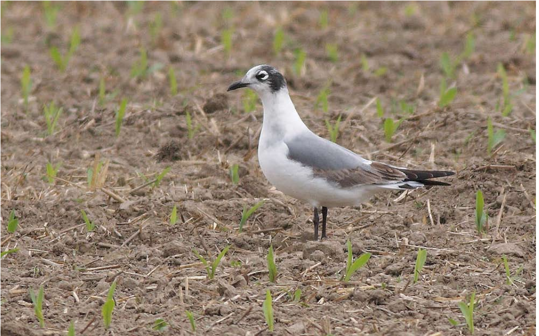
320 Franklin's Gull / Franklins Meeuw Larus pipixcan , second-summer, Delitzsch, Sachsen, Germany, 2 May 2011