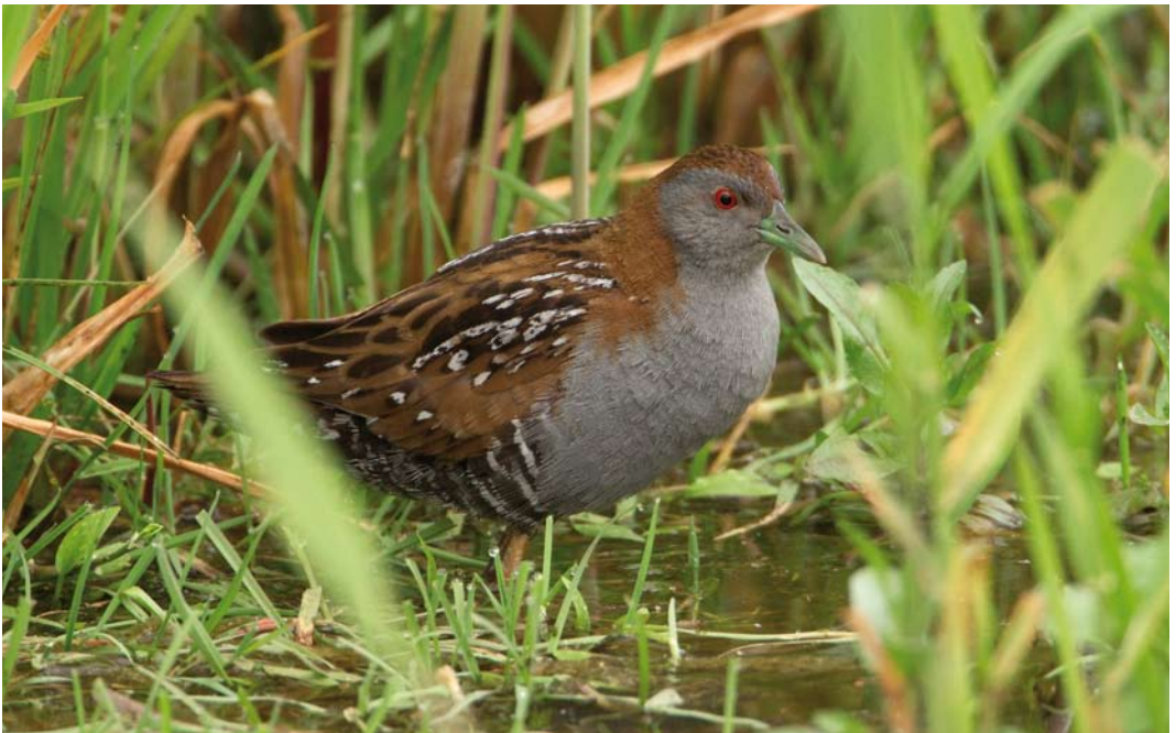
342 Kleinst Waterhoen / Baillon's Crake Porzana pusilla , Schokland, Flevoland, 6 juni 2011 (Roland Jansen)