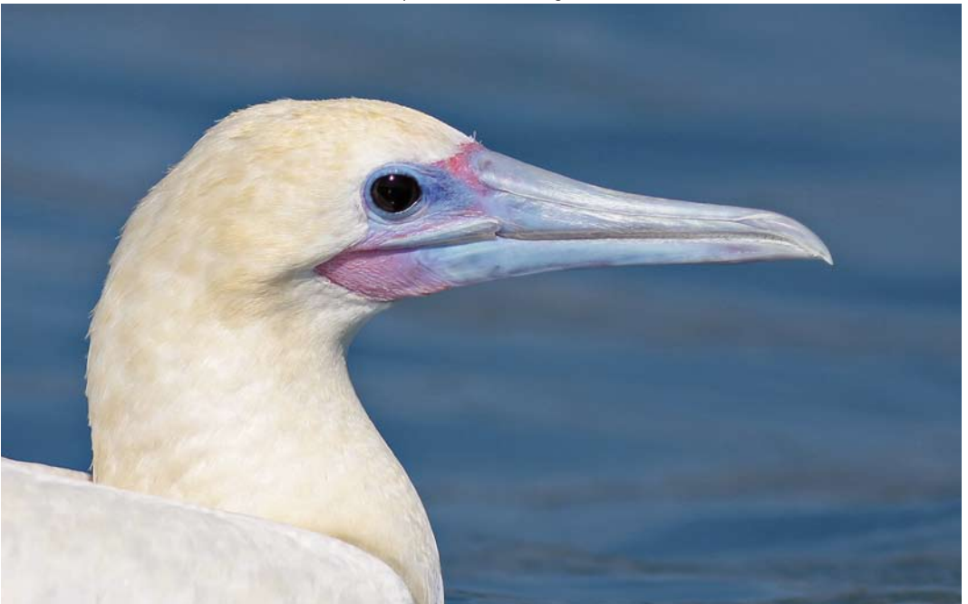
308 Red-footed Booby / Roodpootgent Sula sula , adult, Lac de Sainte-Croix, Alpes-de-Haute-Provence, France, 7 July 2011 ( Frédéric Jiguet )