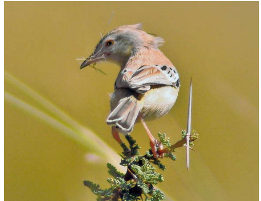
284 Cricket Longtails / Krekelpinia's Spiloptila clamans , adult male with recently fledged juvenile, Aousserd, Oued Ed-Dahab, Morocco, 25 October 2010 (Mohamed Radi). Note yellowish gape-flanges in juvenile. 285 Cricket Longtail / Krekelpinia Spiloptila clamans , recently fledged juvenile, Aousserd, Oued Ed-Dahab, Morocco, 25 October 2010 (Mohamed Radi). Note yellowish gape-flanges and less black greater coverts. 286-287 Cricket Longtail / Krekelpinia Spiloptila clamans with nest material, Aousserd, Oued Ed-Dahab, Morocco, 3 February 2010 (Fabian Schneider)

Because of the geopolitical situation of the region, the southernmost Western Sahara (region of Oued Ed-Dahab-Lagouira) and especially the Aousserd region used to be one of the less birded areas in the WP, although it later proved to hold a much sought-after assemblage of desert and subtropical species, some of which are not easy to see inside the WP. One of these, African Dunn's Lark Eremalauda durni durni , is probably different enough to be considered a potential future split (Lees & Moores 2006, cf Svensson et al 2009). Following the political stabilisation of the region, the number of visiting naturalists has increased considerably in recent years. As a consequence, some significant ornithological discoveries have been made. Since the old records of the 1950s, Black-crowned Sparrow-lark Eremopterix nigri-