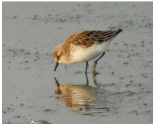
347 Lammergier / Bearded Vulture Gypaetus barbatus , onvolwassen, Den Helder, Noord-Holland, 20 juni 2011 348 Ralreiger / Squacco Heron Ardeola ralloides , Limietweg, Texel, Noord-Holland, 27 mei 2011, 349 Lammergier / Bearded Vulture Gypaetus barbatus , tweede-kalenderjaar mannetje ('Sardona'), Philippine, Zeeland, 13 juni 2011 350 Grijze Strandloper / Semipalmated Sandpiper Calidris pusilla , Westpolder, Groningen, 20 mei 2011

Goed gefotografeerde exemplaren werden vastgesteld op 5 mei bij Bennekom, Gelderland; van 6 mei tot in juli op de Hoge Veluwe, Gelderland; op 7 mei bij Kinderdijk, Zuid-Holland; op 22 mei boven Roosendaal, Noord-Brabant; van 30 mei tot 3 juni op de Delleboersterheide bij Oldeberkoop, Friesland; en van 4 juni tot in juli in het Drents-Friese Wold bij Vledder, Drenthe. Ter vergelijking: in de periode 1907-95 werden slechts acht gevallen aanvaard. Waarnemingen van deze soort worden nog steeds beoordeeld door de CDNA. Een nagekomen melding betrof die van een eerste-zomer Steppekiekendief Circus macrourus op 24 april bij Hardenberg, Overijssel. Andere exemplaren werden waargenomen op 1 mei bij Kampen, Overijssel (adult mannetje); op 1 mei bij Millingen aan de Rijn, Gelderland (adult mannetje); op 1 mei bij Slenaken, Limburg (eerste-zomer); op 2 mei een adult mannetje in Noord-Holland om 06:30 bij Heerhugowaard, om 08:28 bij de Dijkgatweide in de Wieringermeer en