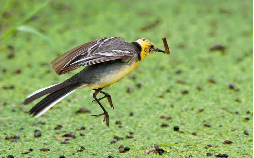
327 Citrine Wagtail / Citroenkwikstaart Motacilla citreola , first-summer male, collecting food for young, Zeewolde, Flevoland, Netherlands, 16 July 2011 ( Arnoud B van den Berg )