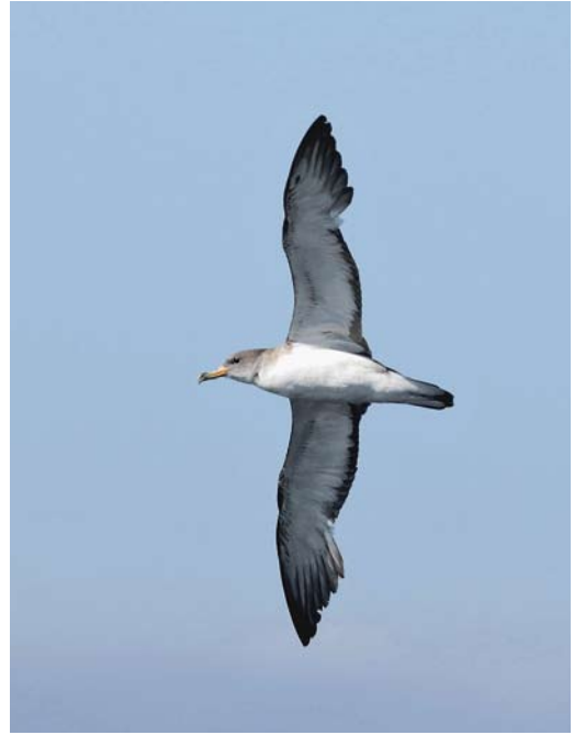
274 Balearic Shearwater / Vale Pijlstormvogel Puffinus mauretanicus , off southern Portugal, 25 September 2010 (Roef Mulder) 275 Scopoli's Shearwater / Scopoli's Pijlstormvogel Calonectris diomedea , off southern Portugal, 4 October 2009 (Ray Tipper) 276 Great Shearwater / Grote Pijlstormvogel Puffinus gravis , off southern Portugal, 23 September 2009 (Roef Mulder)