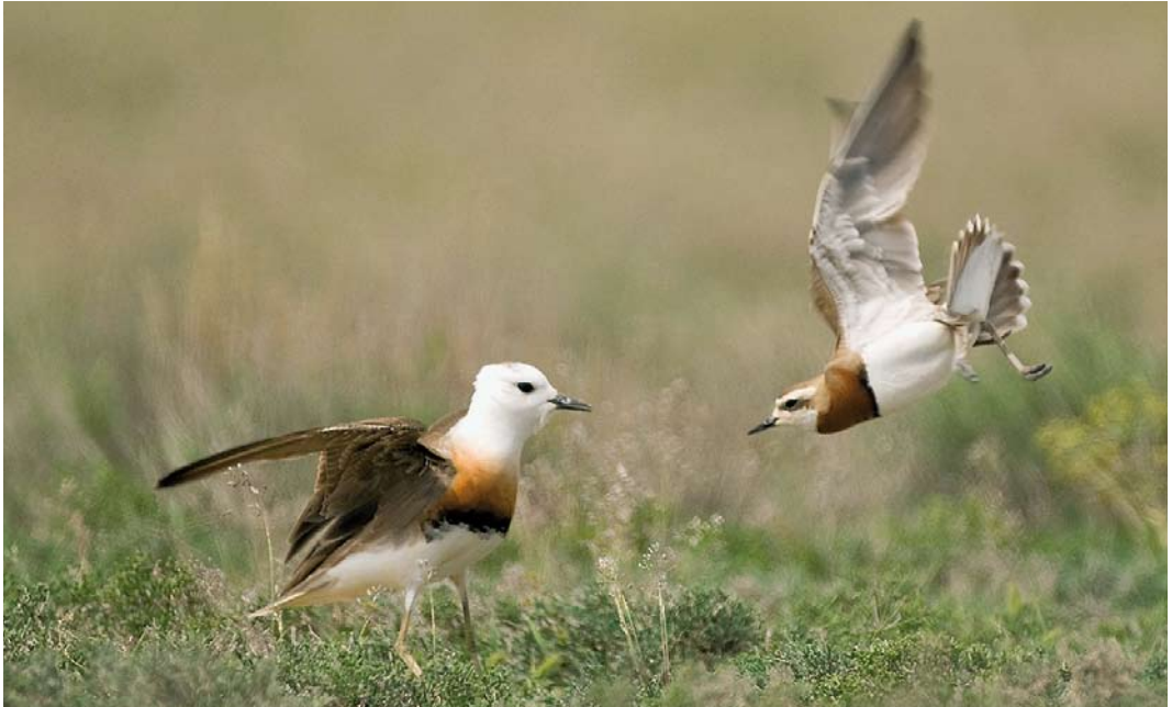
293 Oriental Plover / Steppeplover Charadrius veredus , adult male, with Caspian Plover C. asiaticus , adult male, Atanbaschik semi-desert, Aqtöbe province, Kazakhstan, 9 May 2009

The relatively fresh primaries in combination with the well-developed breast pattern indicated that the bird was an adult. First-summer males show very worn primaries and usually attain a dull breast band (Prater et al 1977).