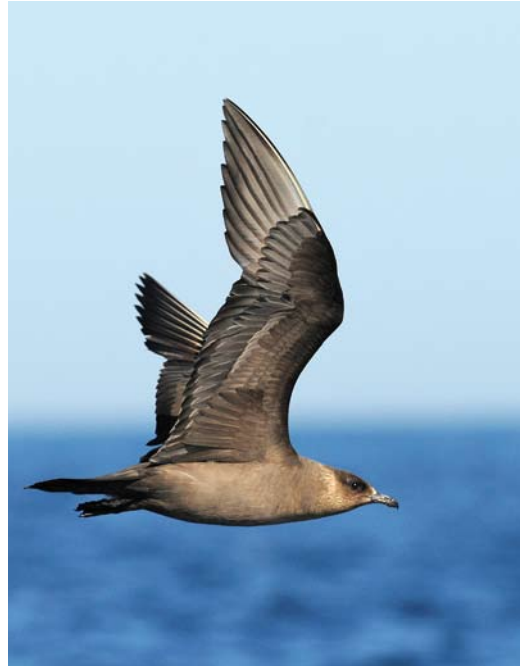
282 Arctic Jaeger / Kleine Jager Stercorarius parasiticus , off southern Portugal, 22 September 2009 (Roef Mulder)

algarvebirdman.com, www.birdwatching-algarve.com and www.marilimitado.com. More information on sightings of Wilson's Storm Petrels in the area can be found at www.club300.de/articles/008_wilsons/index.html (with many links to related websites about Wilson's Storm Petrel and pelagic trips off coastal Europe).