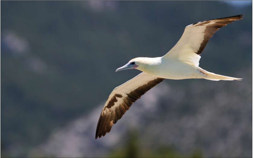
307 Red-footed Booby / Roodpootgent Sula sula , adult, Lac de Sainte-Croix, Alpes-de-Haute-Provence, France, 5 July 2011 ( Richard Bonser )