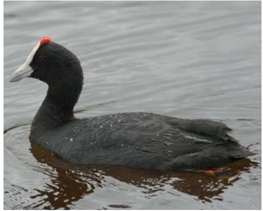
304 Red-knobbed Coot / Knobbelmeerkoet Fulica cristata , Sidi Bou-Rhaba, Morocco, 25 April 2009 (Peter Adriaens)