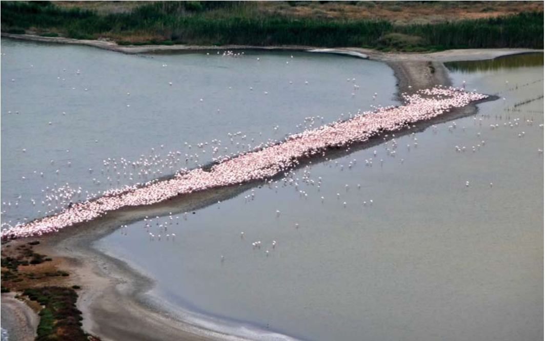
309 Greater Flamingos / Flamingo's Phoenicopterus roseus , breeding colony, Molentargius, Cagliari, Sardinia, Italy, 21 May 2011 ( Marcello Grussu )