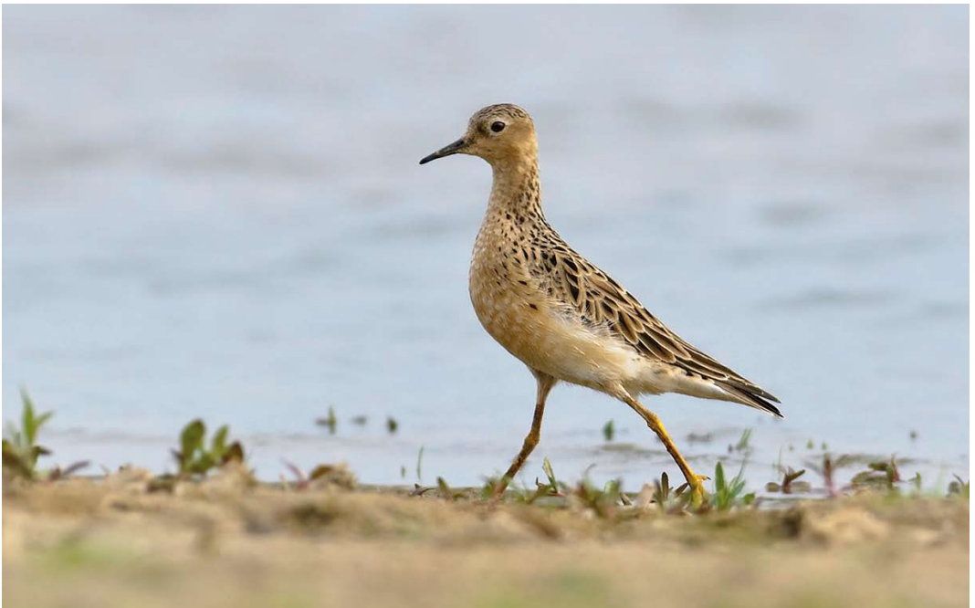
346 Blonde Ruiters / Semipalmated Sandpiper Tryngites subruficollis , Polder Hardenhoek, Brabantse Biesbosch, Noord-Brabant, 13 mei 2011 ( Hans Gebuis )