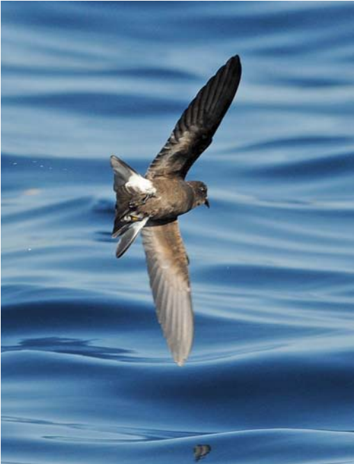
281 Wilson's Storm Petrel / Wilsons Stormvogeltje Oceanites oceanicus , off southern Portugal, 22 September 2009 (Roef Mulder)