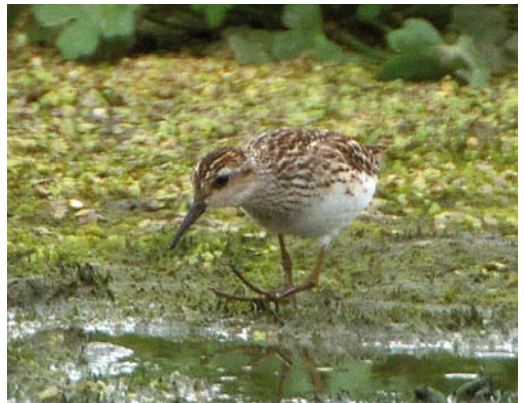
314 Egyptian Vulture / Aasgier Neophron percnopterus , Zandvoorde, West-Vlaanderen, Belgium, 22 April 2011 cf Dutch Birding 33: 203, 2011 315 Crested Honey Buzzard / Aziatische Wespindief Pernis ptilorhynchus , adult male, Villa San Giovanni, Calabria, Italy, 18 May 2011 316 Western Reef Heron / Westelijke Rifeiger Egretta gularis , Embouchure de l'oued Ksob, Diabat near Essaouir, Morocco, 19 June 2011 317 Red-necked Stint / Roodkeelstrandloper Calidris ruticollis , adult, Utopia, Texel, Noord-Holland, Netherlands, 19 July 2011 318 White-rumped Sandpiper / Bonapartes Strandloper Calidris fuscicollis , Comacchio, Po delta, Italy, 17 July 2011 319 Long-toed Stint / Taigastrandloper Calidris subminuta , Braunschweiger Rieselfelder, Niedersachsen, Germany, June 2011