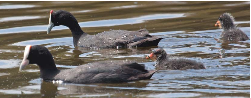
300 Hybrid Eurasian x Red-knobbed Coot / hybride Meerkoet x Knobbelmeerkoet Fulica atra x cristata , Sidi Bou-Rhaba, Morocco, 25 April 2009 (Peter Adriaens). Upper edge of frontal shield is straight and slightly notched (as in Red-knobbed) but shield is pinched at base due to pointed black feathering (as in Eurasian). 301 Hybrid Eurasian x Red-knobbed Coot / hybride Meerkoet x Knobbelmeerkoet Fulica atra x cristata , Sidi Bou-Rhaba, Morocco, 25 April 2009 (Peter Adriaens). Close-up of head and bill. Note mixed bill colours, vestigial red knobs and pointed wedge of black feathering. 302 Hybrid Eurasian x Red-knobbed Coot / hybride Meerkoet x Knobbelmeerkoet Fulicatra atra x cristata (foreground), with Red-knobbed Coot and two chicks, Sidi Bou-Rhaba, Morocco, 25 April 2009 (Peter Adriaens). In comparison with Red-knobbed, hybrid shows thicker neck and flatter head, reminiscent of Eurasian.

Red-knobbed is a vagrant and Eurasian a winter visitor. Diskin (2005) reported a Red-knobbed breeding at Al Warsen lake near Dubai, United Arab Emirates, 'perhaps mated with Fulica atra '. Two years later, on 5 December 2007, a hybrid was photographed at Al Warsen lake, which looked very similar to the Sidi Bou-Rhaba bird (Wilby 2007). Al Warsen Lake is the only site in Asia where Red-knobbed occasionally breeds. McCarthy (2006) does not report any case of hybridization between Eurasian and Red-knobbed.