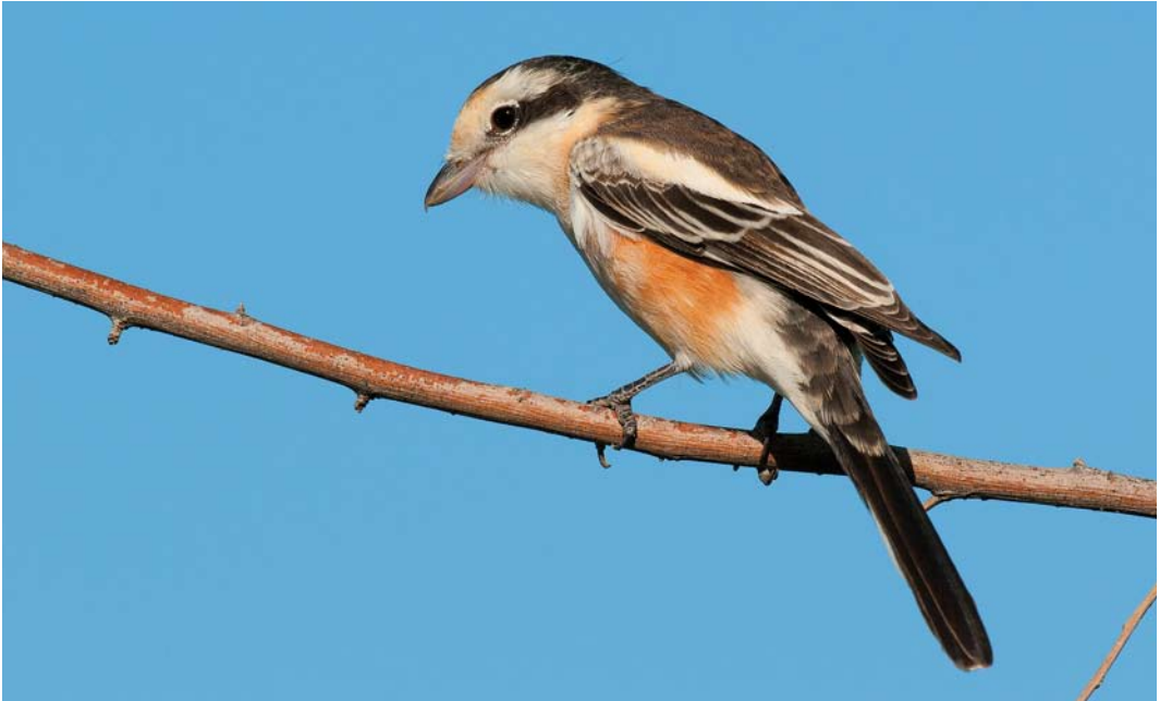
298 Masked Shrike / Maskerklauwier Lanius nubicus , adult female, Fetisovo, Mangghystau province, Kazakhstan, 31 August 2010 (Arend Wassink)

winged could be excluded by the presence of streaked flanks and the pattern of black and white on the face and neck. At this point SB, RA and AS were still not aware of the status of Syrian Woodpecker in Kazakhstan, and presumed it was a resident breeder at Naurzum nature reserve. It was only after checking Wassink & Oreel (2007), almost two days after the sighting, that it was realized that the species would be an addition to the national list. This caused the observers to further investigate the identification of the bird once back at home. After more research there, the bird was firmly identified as a Syrian Woodpecker.