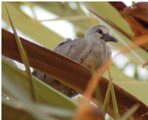
305 Eurasian Collared Dove / Turkse Tortel Streptopelia decaocto , fledgling, Awlad Margham, Libya, 18 August 2010