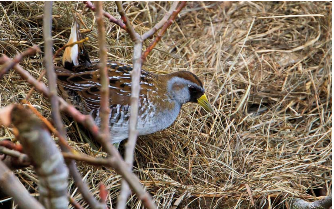
310 Sora / Soraral Porzana carolina , Suðursveit, Iceland, 26 April 2011 cf Dutch Birding 33: 203, 2011