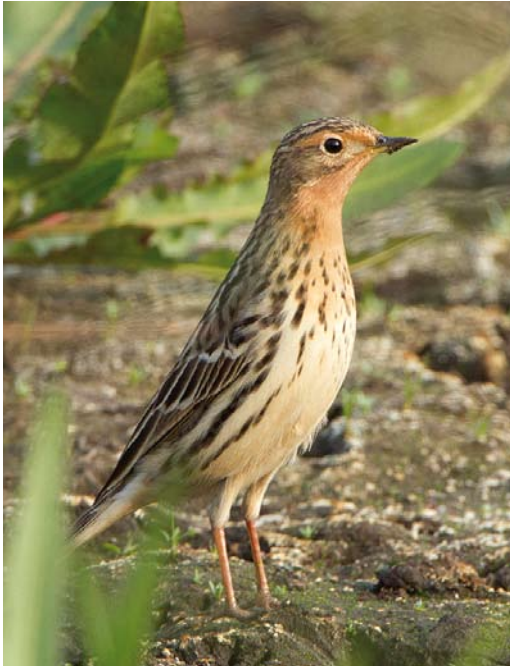
357 Roodkeelpieper / Red-throated Pipit Anthus cervinus , Zevenhoven, Zuid-Holland, 7 mei 2011