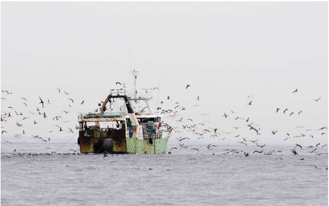
271 Trawler surrounded by seabirds, off southern Portugal, 23 September 2010

Since a few years, it has become more widely known that the area is also excellent for seawatching. Seabirds can be viewed well from Cabo de São Vicente – watching from the northern side of the headland in the morning being the preferred strategy (Walker 1997). Most northern Atlantic seabirds can be seen here and specialties record-