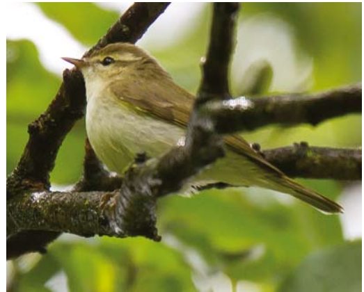
351 Kalendarleeuwerik / Calandra Lark Melanocorypha calandra , Paal 48, Vlieland, Friesland, 8 mei 2011 ( Joachim Bouwmeester ) 352 Roodkopklauwier / Woodchat Shrike Lanius senator , Maasvlakte, Zuid-Holland, 5 mei 2011 ( Ben van den Broek ) 353 Struikrietzanger / Blyth's Reed Warbler Acrocephalus dumetorum , Eemshaven-Oost, Groningen, 6 mei 2011 ( Albert-Erik de Winter ) 354 Grauwe Fitis / Greenish Warbler Phylloscopus trochiloides , Alphen aan den Rijn, Zuid-Holland, 19 juni 2011 ( Paul van der Werken )

RALLEN TOT STRANDLOPERS Kleinste Waterhoenders Porzana pusilla werden waargenomen van 26 mei tot 12 juni in De Wieden, Overijssel, van 1 tot 16 juni in Polder Achteraf bij Breukelenveen (drie), Noord-Holland, en van 4 tot 15 juni bij Schokland (twee); op de laatste locatie lieten de vogels zich af en toe aardig bekijken. Op enkele plekken kwamen Steltkluten Himantopus himantopus tot broeden, al verliep dat niet overal even succesvol. Twee doortrekkers werden op 27 juni gezien vanaf trektelepost De Nolle bij Vlissingen, Zeeland. Grielen Burhinus oedicnemus werden waargenomen op op 7 mei bij Strijen, Zuid-Holland (mogelijk de vogel die hier eerder op 24 en 25 april werd gezien), op 13 juni bij Stellendam, Zuid-Holland, en op 30 juni 's nachts bij Nieuw-Scheemda, Groningen. Op 4 en 5 mei verbleef een Woestijplevier Charadrius leschenaultii bij Den Helder. Waarschijnlijk betrof het dezelfde als op 27 april bij Hoek van Holland, Zuid-Holland. Een