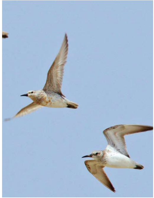
311 Presumed Eastern Common Tern / vermoedelijke Oostelijke Visdief Sterna hirundo longipennis, with Common Tern / Visdief S h hirundo, Heist, West-Vlaanderen, Belgium, 22 June 2011 312 Red Knot / Kanoet Calidris canutus, with Great Knot / Grote Kanoet C tenuirostris, Bandar Abbas, Hormozgan, Iran, 18 May 2011 313 Brown Noddy / Noddy Anous stolidus, Persian Gulf, Iran, 7 June 2011