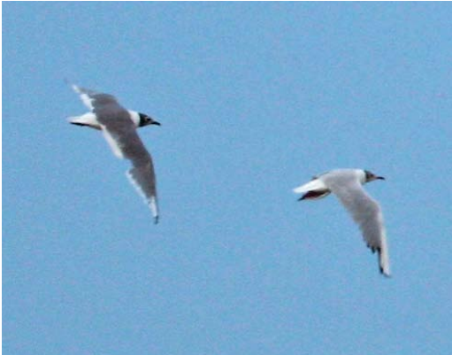
294-295 Franklin's Gull / Franklins Meeuw Larus pipixcan (left), with Black-headed Gull / Kokmeeuw Chroicocephalus ridibundus , Kushmurun lake, Qostanay province, Kazakhstan, 14 July 2010 ( Ross Ahmed ) 296-297 Franklin's Gull / Franklins Meeuw Larus pipixcan , Kushmurun lake, Qostanay province, Kazakhstan, 14 July 2010 ( Ross Ahmed )

Two other features that raised concerns were the apparently all-white tail (lacking any grey) and the less familiar wing-tip pattern. However, both of these features can be explained by moult and feather wear; the bird was missing at least two pri-