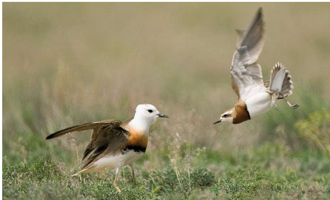
293 Oriental Plover / Steppeplover Charadrius veredus , adult male, with Caspian Plover C. asiaticus , adult male, Atanbaschik semi-desert, Aqtöbe province, Kazakhstan, 9 May 2009

The relatively fresh primaries in combination with the well-developed breast pattern indicated that the bird was an adult. First-summer males show very worn primaries and usually attain a dull breast band (Prater et al 1977).