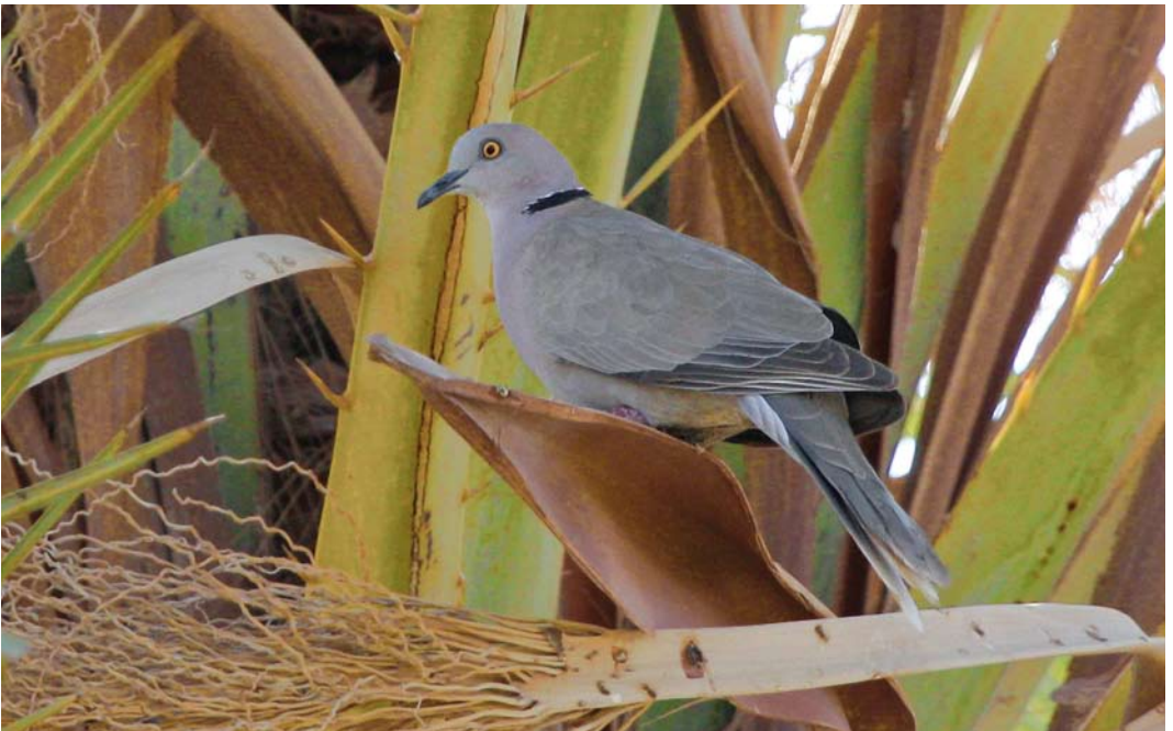
62 Mourning Collared Dove / Treurtortel Streptopelia decipiens , Abu Simbel, Egypt, 29 December 2010 (Kris De Rouck)