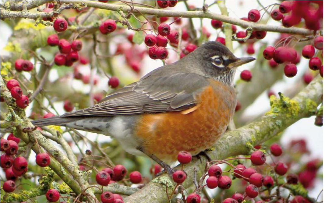
65 American Robin / Roodborstlijster Turdus migratorius , first-winter male, Turf, Devon, England, 11 November 2010