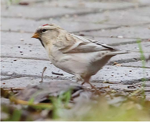
88 Witstuitbarmsijs / Arctic Redpoll Carduelis hornemanni , Texel, Noord-Holland, 14 november 2010

Hooge Platen in de Westerschelde, Zeeland. Er werden in totaal ook nog c 670 langstreckende geteld, met onder andere 270 langs de Eemshaven en 187 langs Kamperhoek, Flevoland. Bij Castricum werden er in totaal ook nog acht geringd: de eerste vangsten voor dit ringstation sinds 2004. Er werden van trektelposten ruim 2100 langsvliegende barmsijsen Carduelis cabaret/flammea gemeld. Daarnaast werden er c 400 geringd, waarvan het merendeel Grote Barmsijs C flammea betrof. Een Witstuitbarmsijs C hornemanni werd op 14 november gefotografeerd in de Sluftervallei op Texel.