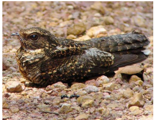
31 Pavonine Quetzal / Pauwquetzal Pharomachrus pavoninus , Rio Teles Pires, Alta Floresta, Mato Grosso, Brazil, 19 August 2006 (Alexander C Lees) 32 Cryptic Forest Falcon / Mintons Bosvalk Micrastur mintoni , Alta Floresta, Mato Grosso, Brazil, November 2006 (Hadoram Shirihai) 33 Black-girdled Barbet / Gordelbaardvogel Capito dayi , male, Alta Floresta, Mato Grosso, Brazil, November 2006 (Hadoram Shirihai) 34 Blackish Nightjar / Roetnachtzwaluw Caprimulgus nigrescens , Serra dos Caiabis, Alta Floresta, Mato Grosso, Brazil, 8 September 2006 (Alexander C Lees). Plate 32-33 contributed from forthcoming Photographic handbook to birds of the world (Jornvall & Shirihai, A&C Black).

river is characterized by the presence of 1000s of biologically impoverished small forest patches, along with large areas of undisturbed forest to the north. Forest patch size is the principal determinant of bird species richness but forest patch quality – the degree of anthropogenic disturbance – is also very important for the most forest-dependent species (Lees & Peres 2006, 2008b). Although these small patches may not be able to retain a full complement of species, they may still function as refuges for many plant and animal species. This permits future breathing space for conservationists to plan strategies for preventing species loss. Fragments may also act as sources for recolonization of proximate areas undergoing vegetative succession, particularly if agricultural land-uses become unprofitable in the future and facilitate resto-