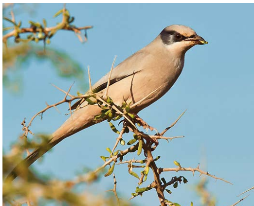
63 Hypocolius / Zijdestaart Hypocolius ampelinus , male, Cape Greco, Cyprus, 4 December 2010 (Alex Kirschel)