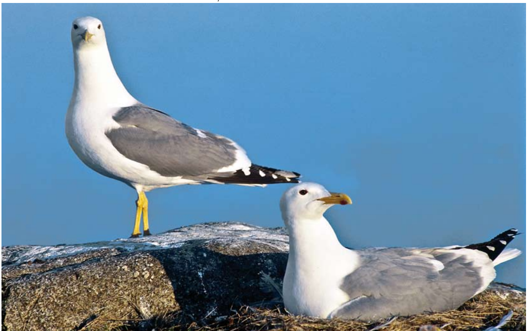
4 Taimyr Gulls / Taimyrmeeuwen Larus taimyrensis , breeding pair, Bird Islands, Mys Vostochny, Taimyr, Russia, 8 July 1991