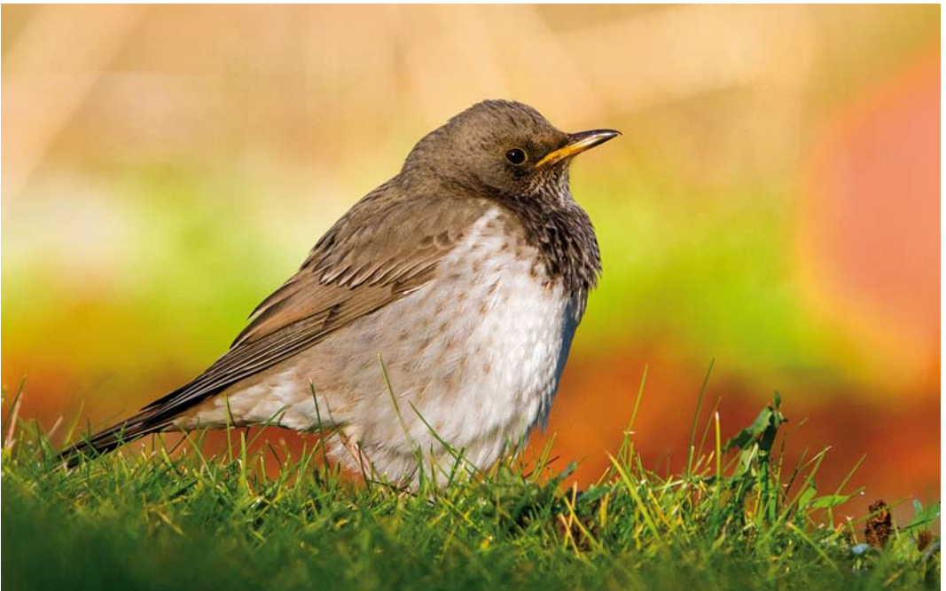
66 Black-throated Thrush / Zwartkeellijster Turdus atrogularis , first-winter male, Loppem, West-Vlaanderen, Belgium, 12 December 2010