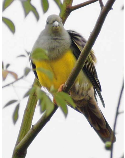
58 Striped Crake / Afrikaanse Porseleinhoen Aenigmatolimnas marginalis , female, Sierra Norte, Sevilla, Spain, 12 December 2010 ( Alberto Plata ) 59 Bruce's Green Pigeon / Waaliaduif Treron waalia , Luxor, Egypt, 3 January 2011 ( Steven R van der Veen ) 60 Pied-billed Grebe / Dikbekfuut Podilymbus podiceps , first-year, Greater Manchester, England, November 2010 ( Richard Stonier )