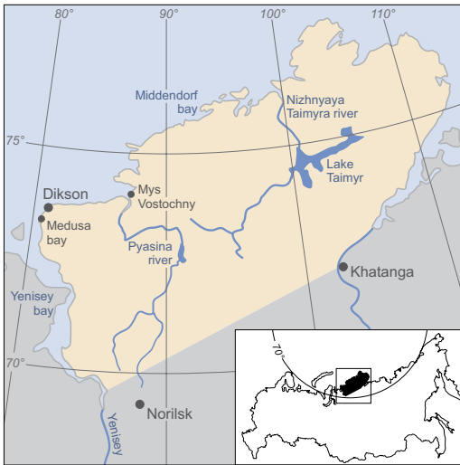
FIGURE 1 Map of Taimyr peninsula, central Siberia, Russia

coveries, both of birds which had migrated in a south-easterly direction towards the Pacific. Del Hoyo et al (1996) indicate that Taimyr Gulls spend the winter in the same area as shown by Cramp & Simmons (1983) but they state that birds breeding on eastern Taimyr winter along the north-western Pacific as well.