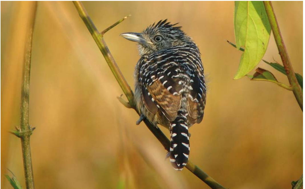
30 Barred Antshrike / Gebandeerde Mierklauwier Thamnophilus doliatus , immature male, 30 km south-west of Alta Floresta, Mato Grosso, Brazil, 6 September 2006 (Alexander C Lees)