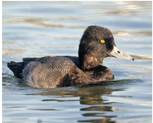
54 Northern Harrier / Amerikaanse Blauwe Kiekendief Circus cyaneus hudsonius , Thornham, Norfolk, England, 28 November 2010 55 Lanner Falcon / Lannervalk Falco biarmicus , Gageron, Camargue, Bouches-du-Rhône, France, 16 January 2011 56 Forster's Tern / Forsters Stern Sterna forsteri , first-year, Peniche, Portugal, 22 January 2011 57 Lesser Scaup / Kleine Topper Aythya affinis , adult male eclipse, Huningue, Haut-Rhin, France, October 2010

cies for the Netherlands was in Gelderland in 1996. In England, a genuine juvenile White-tailed Eagle Haliaeetus albicilla turned up in West Sussex on 11 December and flew to Hampshire the next day. The juvenile female Northern Harrier Circus cyaneus hudsonius at Tacumshin, Wexford, Ireland, remained through December as did a juvenile male between Holme and Blakeney, Norfolk, England; a third one was photographed at Kilcoole, Wicklow, Ireland, on 13 November ( Birding World 23: 509-523, 2010). In the Netherlands, 50 breeding pairs of Montagu's Harrier C. pygargus were counted in 2010 of which 45 in eastern Groningen. In southern Spain, an Atlas Long-legged Buzzard Buteo rufinus cirtensis at Los Barrios, Cádiz, on 9 January is considered to be the same individual seen during the past two years. The sixth Rough-legged Buzzard B. lagopus for Spain was photographed off Tarragona on 18 December. In the Netherlands (c 100) and France (at