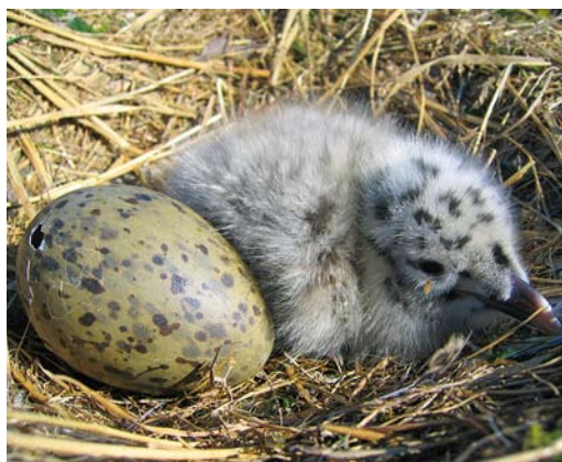
10 Taimyr Gull / Taimyrmeeuw Larus taimyrensis in breeding colony, Mys Vostochny, Taimyr, Russia, 22 June 2005 11 Taimyr Gull / Taimyrmeeuw Larus taimyrensis , adult in breeding colony, Mys Vostochny, Taimyr, Russia, 17 July 2008 12 Taimyr Gull / Taimyrmeeuw Larus taimyrensis , adult trapped on nest, Oleni islands, Medusa bay, Taimyr, Russia, 25 June 2001. Record 7 in appendix 1. 13 Taimyr Gull / Taimyrmeeuw Larus taimyrensis , egg and chick, Bird Islands, Mys Vostochny, Taimyr, Russia, 10 July 2005