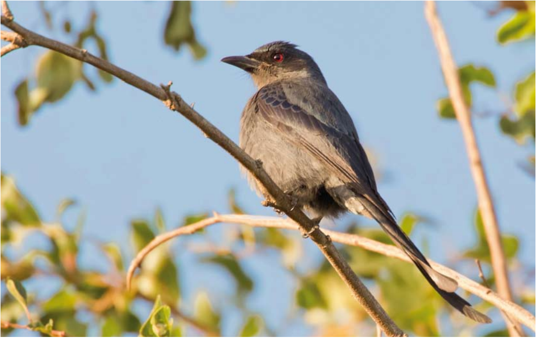
61 Ashy Drongo / Grijze Drongo Dicrurus leucophaeus , Jahra farms, Kuwait, 1 January 2011 (David Monticelli)