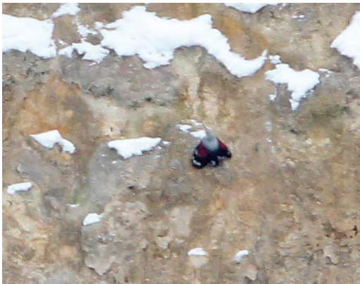
45 Rotskruiper / Wallcreeper Tichodroma muraria , Sint Pietersberg, Maastricht, Limburg, 4 december 2010