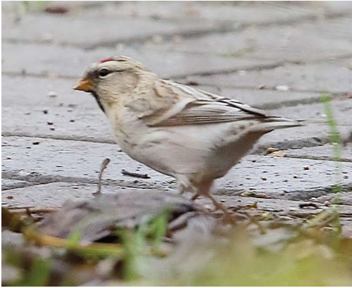
88 Witstuitbarmsijs / Arctic Redpoll Carduelis hornemanni , Texel, Noord-Holland, 14 november 2010

Hooge Platen in de Westerschelde, Zeeland. Er werden in totaal ook nog c 670 langstreckende geteld, met onder andere 270 langs de Eemshaven en 187 langs Kamperhoek, Flevoland. Bij Castricum werden er in totaal ook nog acht geringd: de eerste vangsten voor dit ringstation sinds 2004. Er werden van trektelposten ruim 2100 langsvliegende barmsijsen Carduelis cabaret/ flammea gemeld. Daarnaast werden er c 400 geringd, waarvan het merendeel Grote Barmsijs C flammea betrof. Een Witstuitbarmsijs C hornemanni werd op 14 november gefotografeerd in de Sluftervallei op Texel.