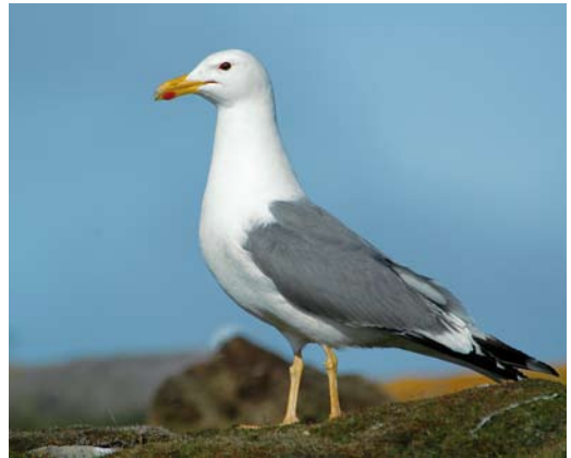
6 Taimyr Gull / Taimyrmeeuw Larus taimyrensis , adult trapped on nest, Bird Islands, Mys Vostochny, Taimyr, Russia, 22 July 2008 ( Jim de Fouw ) 7 Taimyr Gull / Taimyrmeeuw Larus taimyrensis , adult trapped on nest, Bird Islands, Mys Vostochny, Taimyr, Russia, 22 July 2008 ( Jim de Fouw ). Note primary moult (p1-2 shed). 8 Taimyr Gull / Taimyrmeeuw Larus taimyrensis , adult in breeding colony, Mys Vostochny, Taimyr, Russia, 9 August 2006 ( Bram Feij ) 9 Taimyr Gull / Taimyrmeeuw Larus taimyrensis , adult in breeding colony, Mys Vostochny, Taimyr, Russia, 9 August 2006 ( Bram Feij )

studied and ringed during many of these expeditions but often only as a side-project. Sergei Kharitonov has visited Medusa bay (73°21'N, 80°32'E) in western Taimyr, 17 km south of Dikson, several times since 1997, mainly to carry out research on geese, waders and gulls (eg, Kharitonov 2009). Bart Ebbsing has visited Mys Vostochny (in the mouth of the Pyasina river, 74°08'N, 86°43'E) in north-western Taimyr, 205 km east-northeast of Dikson, for a long-term research project on Dark-bellied Brent Goose Branta bernicla in several years between 1990 and 2008 (eg, Ebbsing & Mazurov 2005-07). Klaas van Dijk (1993) and Holmer Vonk (1994) spent a breeding season at Mys Vostochny for research on waders as mem-