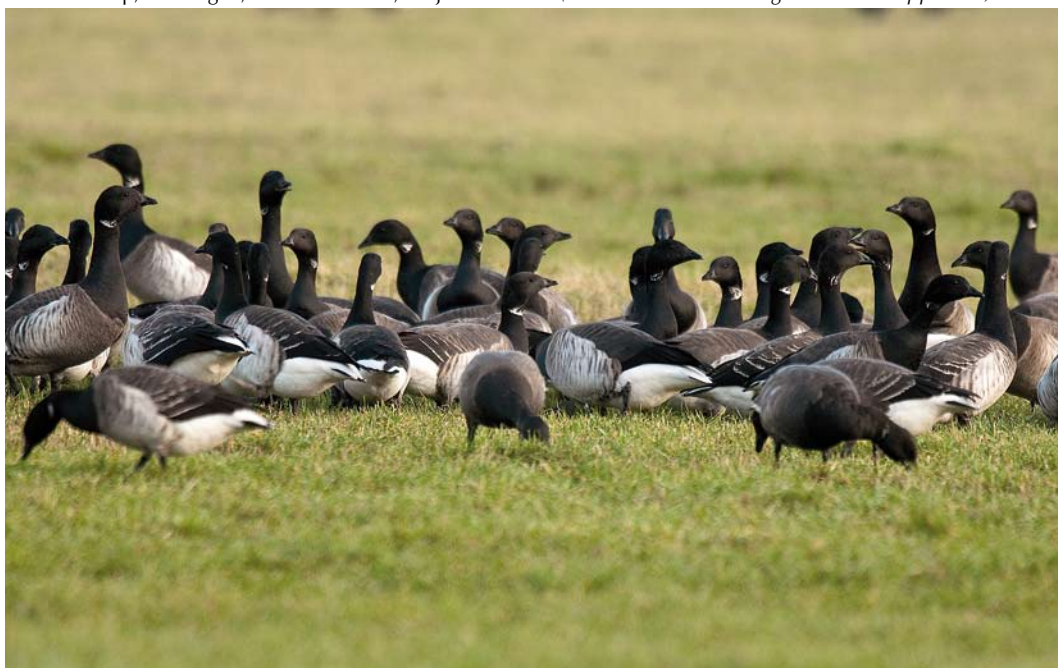
72 Witbuikrotganzen / Pale-bellied Brent Geese Branta hrota , met Rotgans / Dark-bellied Brent Goose B. bernicla , Smerp, Wieringen, Noord-Holland, 10 januari 2011