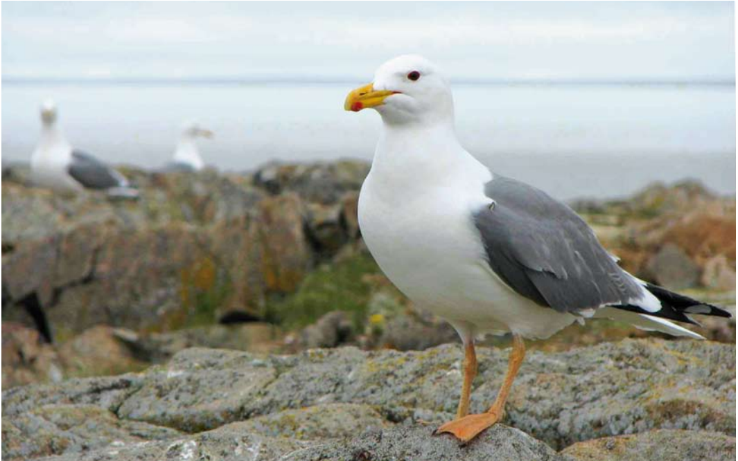
14 Taimyr Gull / Taimyrmeeuw Larus taimyrensis , adult in breeding colony, Mys Vostochny, Taimyr, Russia, 13 July 2007 ( Gerard Müskens )