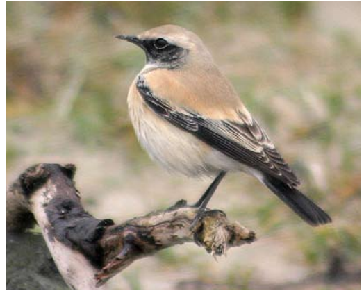
87 Woestijntapuit / Desert Wheatear Oenanthe deserti , mannetje, Stellendam, Zuid-Holland, 5 november 2010