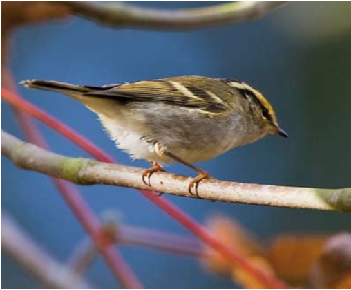
86 Pallas' Boszanger / Pallas's Warbler Phylloscopus proregulus , Ganzenhoek, Wassenaarse Slag, Zuid-Holland, 30 oktober 2010