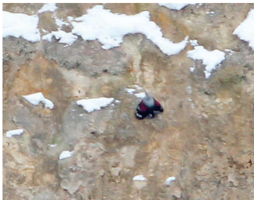
45 Rotskruiper / Wallcreeper Tichodroma muraria , Sint Pietersberg, Maastricht, Limburg, 4 december 2010 (Martin van der Schalk)