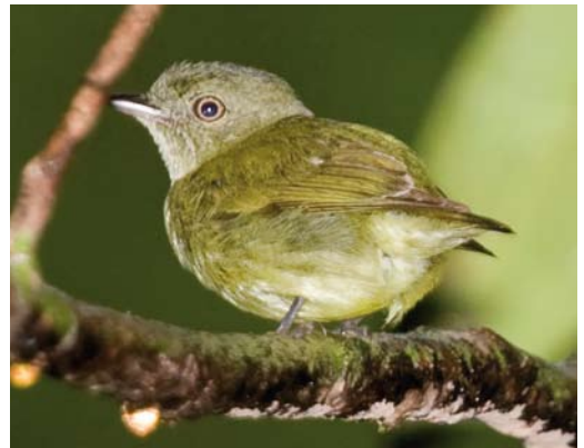
20 Lettered Aracari / Letterarassari Pteroglossus inscriptus, Alta Floresta, Mato Grosso, Brazil, November 2006 21 Red-necked Aracari / Roodhalsarassari Pteroglossus bitorquatus, Alta Floresta, Mato Grosso, Brazil, November 2006 22 Rufous-bellied Euphonia / Roodbuiorganist Euphonia rufiventris, male, Rio Cristalino, Alta Floresta, Mato Grosso, Brazil, 22 July 2006 23 Dusky-tailed Flatbill / Chapmans Breedbektiran Ramphotrigon fuscicauda, Rio Cristalino, Alta Floresta, Mato Grosso, Brazil, 15 August 2006 24 Amazonian Tyrannulet / Bruinkopinezia Inezia subflava, Alta Floresta, Mato Grosso, Brazil, November 2006 25 Dwarf Tyrant-manakin / Dwergtiranmanakin Tyrannetes stolzmanni, Rio Cristalino, Alta Floresta, Mato Grosso, Brazil, December 2006.