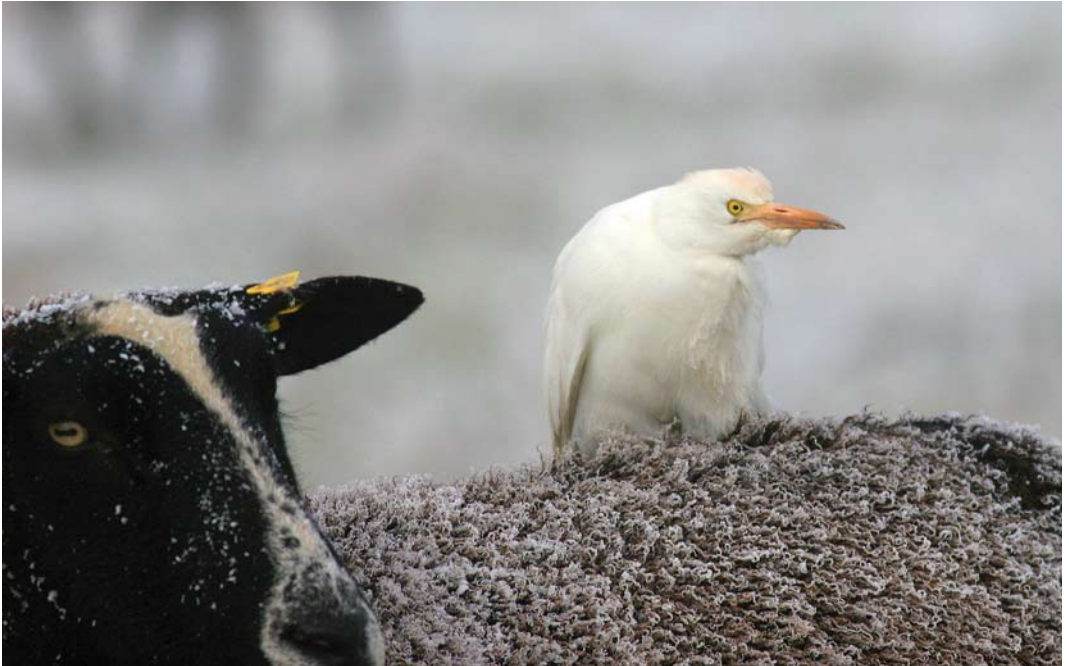
73 Koereiger / Cattle Egret Bubulcus ibis , Onnerpolder, Groningen, 27 november 2010 (Guido Meeuwissen)