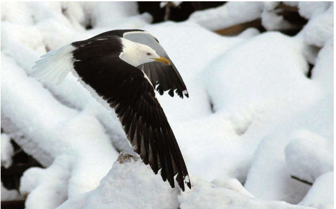
74 Vermoedelijke Baltische Mantelmeeuw / presumed Baltic Gull Larus fuscus fuscus , adult, Harselaar, Barneveld, Gelderland, 20 december 2010 (James Lidster)