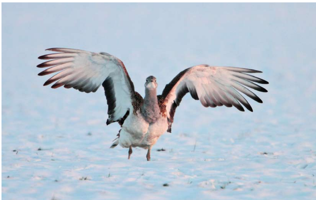
91 Grote Trap / Great Bustard Otis tarda , mannetje, Rilland, Zeeland, 25 december 2010 ( Jaap Denee )