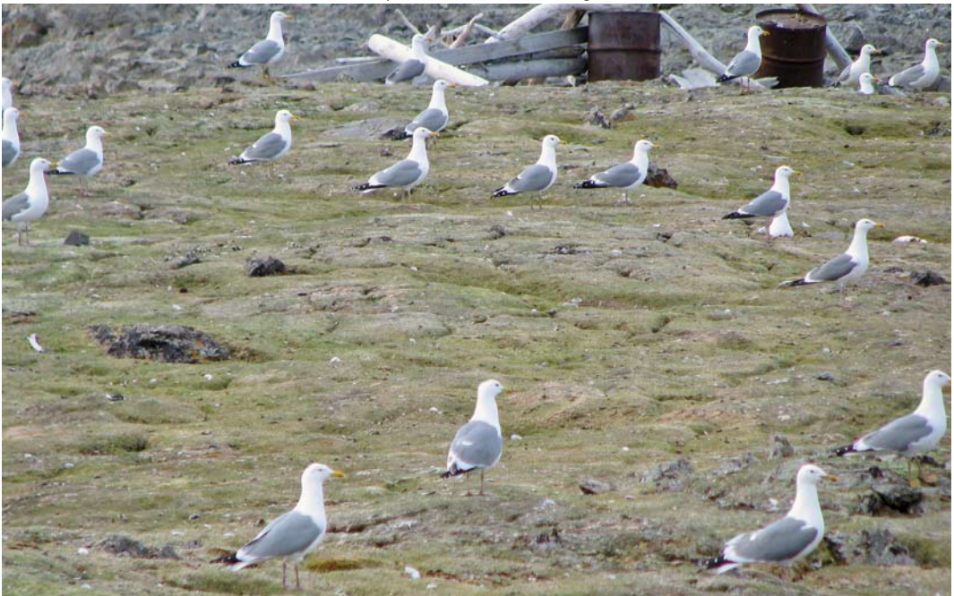
15 Taimyr Gulls / Taimyrmeeuwen Larus taimyrensis , adults in breeding colony, Mys Vostochny, Taimyr, Russia, 17 July 2008