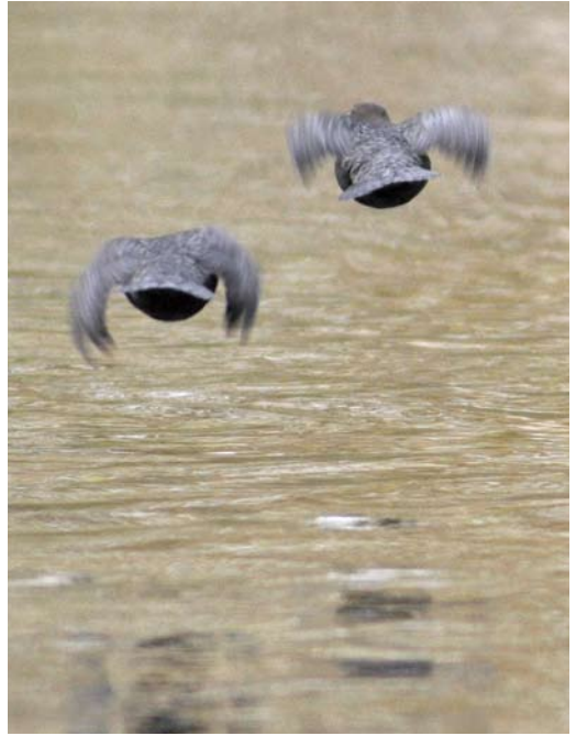
79 Zwartbuikwaterspreeuw / Black-bellied Dipper Cinclus cinclus cinclus , Amsterdamse Waterleidingduinen, Noord-Holland, 10 november 2010 80 Zwartbuikwaterspreeuwen / Black-bellied Dippers Cinclus cinclus cinclus , Amsterdamse Waterleidingduinen, Noord-Holland, 22 november 2010 81 Zwartbuikwaterspreeuw / Black-bellied Dipper Cinclus cinclus cinclus , Amsterdamse Waterleidingduinen, Noord-Holland, 10 november 2010