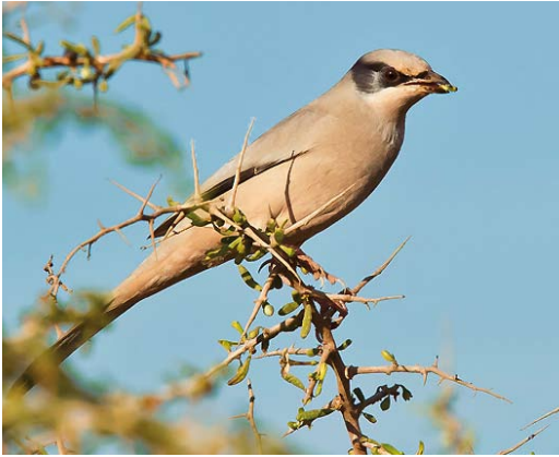
63 Hypocolius / Zijdestaart Hypocolius ampelinus , male, Cape Greco, Cyprus, 4 December 2010 (Alex Kirschel)