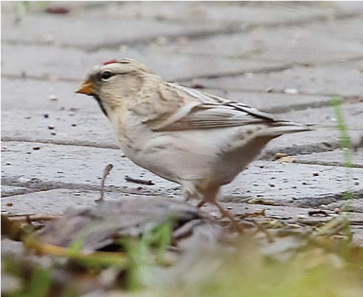
88 Witstuitbarmsijs / Arctic Redpoll Carduelis hornemanni , Texel, Noord-Holland, 14 november 2010

Hooge Platen in de Westerschelde, Zeeland. Er werden in totaal ook nog c 670 langstreckende geteld, met onder andere 270 langs de Eemshaven en 187 langs Kamperhoek, Flevoland. Bij Castricum werden er in totaal ook nog acht geringd: de eerste vangsten voor dit ringstation sinds 2004. Er werden van trektelposten ruim 2100 langsvliegende barmsijsen Carduelis cabaret/flammea gemeld. Daarnaast werden er c 400 geringd, waarvan het merendeel Grote Barmsijs C flammea betrof. Een Witstuitbarmsijs C hornemanni werd op 14 november gefotografeerd in de Sluftervallei op Texel.