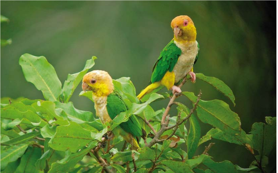
26 White-bellied Parrots / Witbuikciquies Pionites leucogaster , Rio Cristalino, Alta Floresta, Mato Grosso, Brazil, 24 September 2005 (Alexander C Lees). Mixed-subspecies pair with individual of eastern green-thighed nominate P l leucogaster (left) and individual of central yellow-thighed P l xanthurus (right). 27 Common Potoo / Grijze Reuzennachtzwaluw Nyctibius griseus , Carlinda, 40 km east of Alta Floresta, Mato Grosso, Brazil, 12 July 2005 (Alexander C Lees) 28 Zigzag Heron / Zigzagreiger Zebrilus undulatus , Alta Floresta, Mato Grosso, Brazil, November 2006 (Hadoram Shirihai). Contributed from forthcoming Photographic handbook to birds of the world (Jornvall & Shirihai, A&C Black).