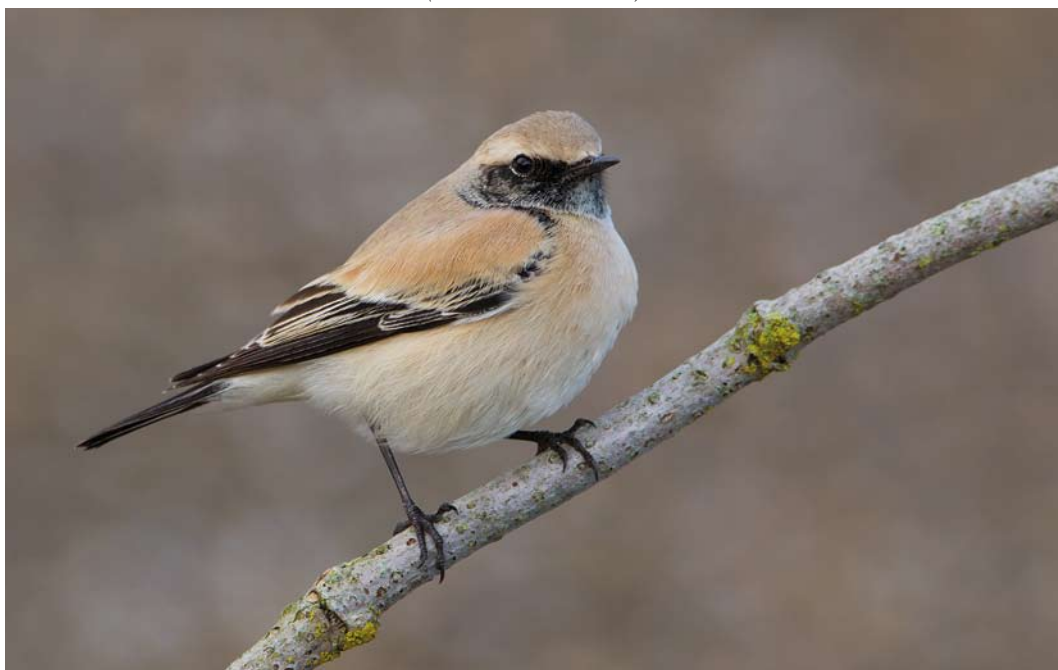
83 Woestijntapuit / Desert Wheatear Oenanthe deserti , mannetje, Stellendam, Zuid-Holland, 5 november 2010