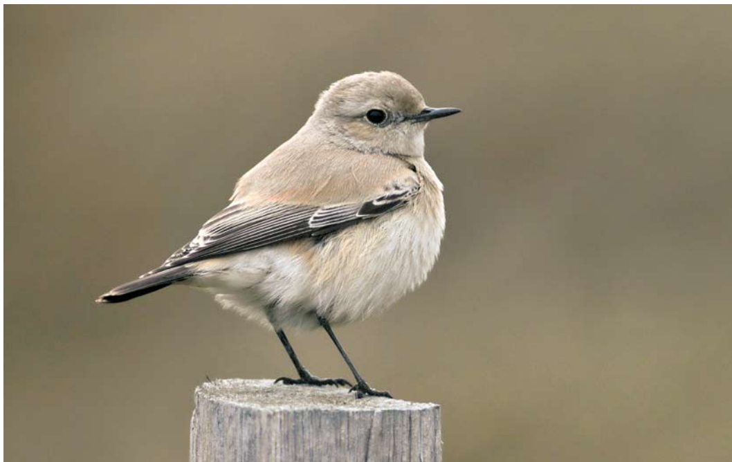
82 Woestijntapuit / Desert Wheatear Oenanthe deserti , vrouwtje, Camperduin, Noord-Holland, 5 november 2010