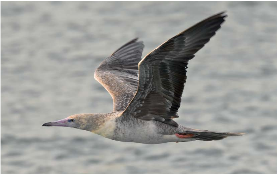
53 Red-footed Booby / Roodpootgent Sula sula , l'Estartit, Girona, Spain, 8 December 2010 (David Monticelli)

involved 14 individuals. This winter, the best ever influx in decades of Barnacle Goose Branta leucopsis for Italy took place with 20-25 individuals, including a record flock of 12 photographed at Torrile, Parma; it was also a record winter for Red-breasted Goose B. ruficollis with more than five. In the USA, a limping Barnacle Goose in a flock of Canada Geese B. canadensis first seen at Orchard Beach, New York, on 26-27 November and then in Connecticut from 3 December into January had been ringed as a first-year on Islay, Scotland, on 13 November 2002 after which it was frequently seen until March 2005 (a parent and a sibling ringed on the same day are still regularly seen on Islay). In mid-December, in the Priyutnensky region of Kalmykia, north-west of the Caspian Sea in southern Russia, 300 to 1000 Red-breasted Geese and also a high number of Lesser White-fronted Geese A. erythropus , Little Bustards Tetrax tetrax and other species died due to freak weather conditions: snow with rain in -10°C, resulting in a 15 cm ice layer making the birds unable to move; it is the first instance of such mass mortality in the region and it is likely that more birds perished in areas not visited by people. One of the largest influxes ever of Pale-bellied Brent Goose B. hrota for the Netherlands occurred in December-January with several large flocks of more than 150 mostly in the Wadden Sea region and the south-west (the largest influx