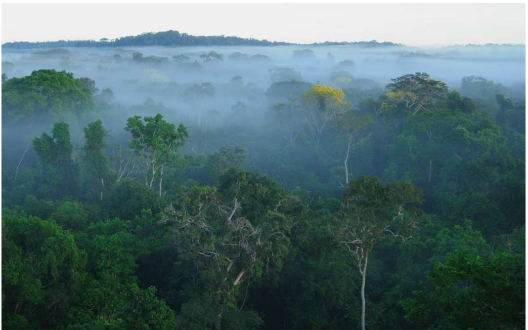
16 View from canopy tower at Cristalino Jungle Lodge, Rio Cristalino, Alta Floresta, Mato Grosso, Brazil, 28 May 2005

Brazil, the world's fifth largest country, is huge (c 8.5 million km 2 ), covering almost 50% of the land surface of South America. Brazil is one of the richest birding countries in the world, with a list of