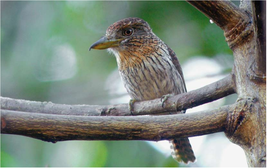
29 Striolated Puffbird / Gestreepte Baardkoekoek Nystalus striolatus , Rio Cristalino, Alta Floresta, Mato Grosso, Brazil, 18 July 2006 (Alexander C Lees)