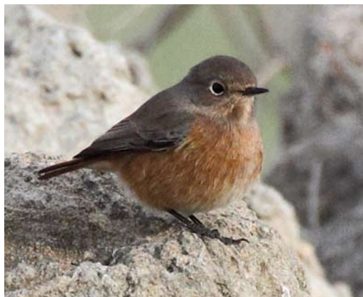
64 Moussier's Redstart / Diadeemroodstaart Phoenicurus moussieri , Malta, 13 December 2010