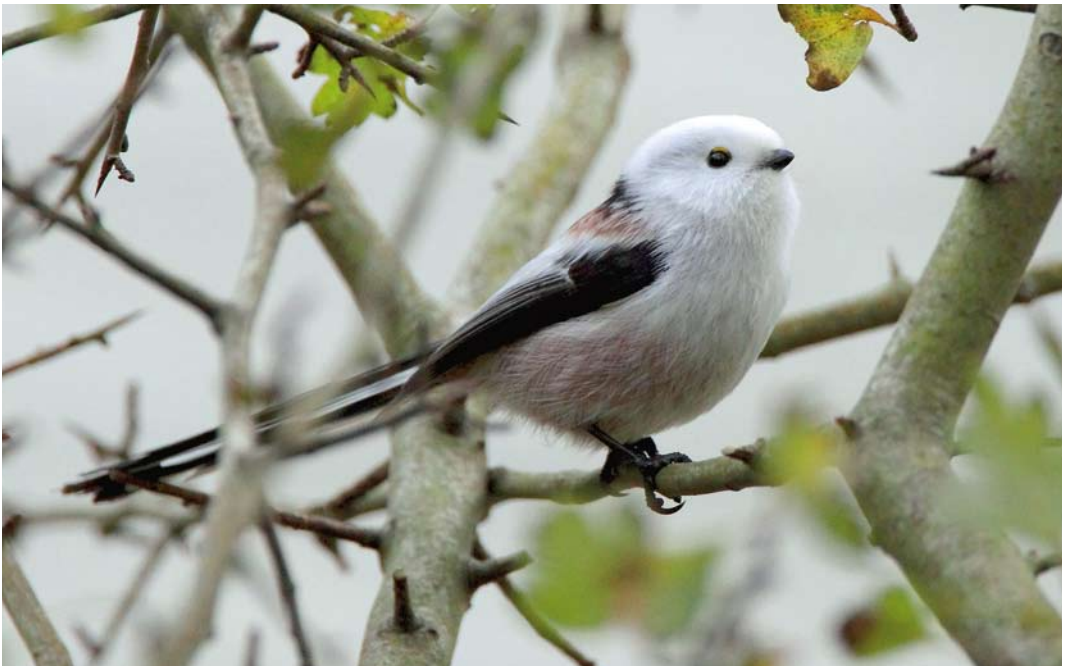
68 White-headed Long-tailed Tit / Witkopstaartmees Aegithalos caudatus caudatus , Ridderpark, Katwijk aan Zee, Zuid-Holland, Netherlands, 12 November 2010 (René van Rossum)