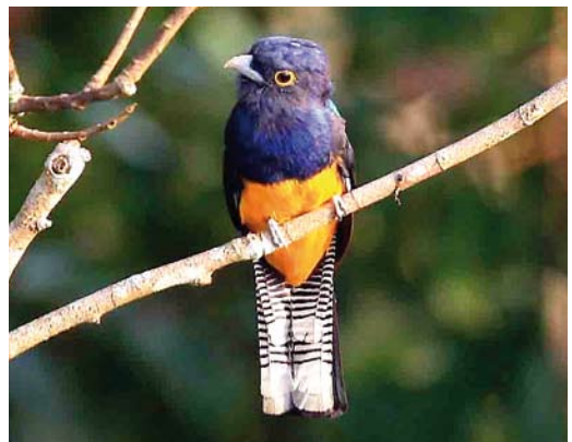
39 Tooth-billed Wren / Amazonewinterkoning Odontorchilus cinereus , Tapajós National Forest, Pará, Brazil, 10 December 2010 (Alexander C Lees) 40 Yellow-shouldered Grosbeak / Geelschouderkardinaal Parkerthraustes humeralis , Tapajós National Forest, Pará, Brazil, 10 December 2010 (Alexander C Lees) 41 Spangled Cotinga / Halsbandcotinga Cotinga cayana , immature male, Rio Cristalino, Alta Floresta, Mato Grosso, Brazil, 24 September 2005 (Alexander C Lees) 42 Paradise Jacamar / Paradijsglansvogel Galbula dea , Alta Floresta, Mato Grosso, Brazil, November 2006 (Hadoram Shirihai) 43 Musician Wren / Orpheuswinterkoning Cyphorinus arada , Alta Floresta, Mato Grosso, Brazil, November 2006 (Hadoram Shirihai) 44 Violaceous Trogon / Violette Trogon Trogon violaceus , Alta Floresta, Brazil, Mato Grosso, November 2006 (Hadoram Shirihai). Plate 42-44 contributed from forthcoming Photographic handbook to birds of the world (Jornvall & Shirihai, A&C Black).