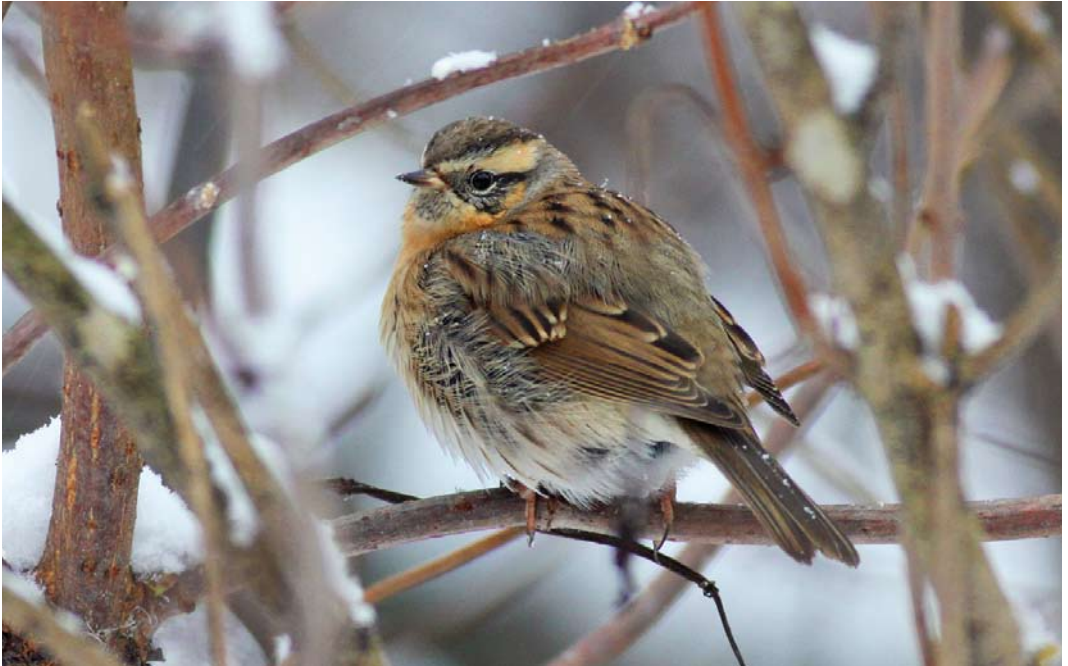
67 Black-throated Accentor / Zwartkeelheggenmus Prunella atrogularis Pori, Pihlava, Finland, 4 December 2010