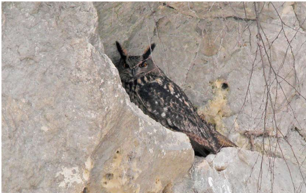
71 Oehoe / Eurasian Eagle Owl Bubo bubo , Sint Pietersberg, Maastricht, Limburg, 4 december 2010 (Wilma van Holten)