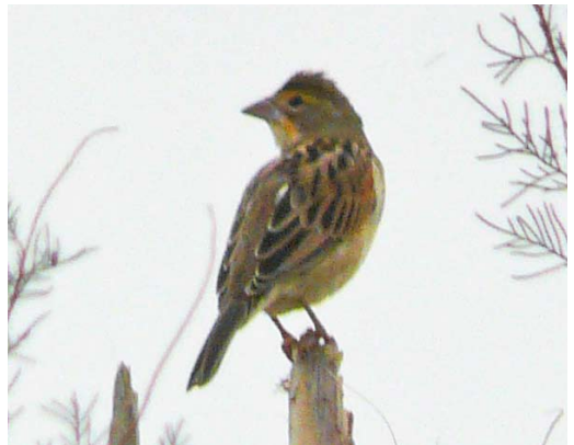
49 Dickcissel / Dickcissel Spiza americana , Ponta Delgado, Flores, Azores, 6 November 2009 (Nico de Vries). The first bird. 50-52 Dickcissel / Dickcissel Spiza americana , Ponta Delgado, Flores, Azores, 6 November 2009 (Nico de Vries). The second bird.

domestic cat disturbed the flock, most birds flew up and many perched on stone walls. I scanned the walls with my 10x40 binoculars and, at a distance of less than 10 m, noticed a small dark bird with a white belly, a relatively long tail, conspicuous white outer tail-feathers and a small pale bill. I had never seen such a bird before and therefore assumed it was a Nearctic songbird. The cat was still around and my camera still in the bag, giving me some worries... As feared, the birds were disturbed, not only by the cat but also by two tractors. The unknown bird flew off to quieter fields further away. Despite searching for it the rest of the morning, I could not relocate it. I made a few notes and a field sketch in my notebook and then quickly returned to our temporary home at Guada, where I consulted my field guide (National Geographic Society 2002). I quickly found the illustration of a male Dark-eyed Junco Junco hyemalis , which per-