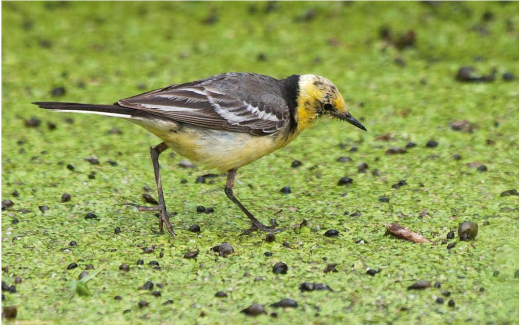
114-115 Citroenkwikstaart / Citrine Wagtail Motacilla citreola , eerste-zomer mannetje, Zeewolde, Flevoland, 16 juli 2011