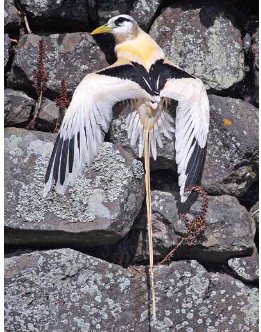
137 White-tailed Tropicbird / Witstaartkeerkringvogel Phaethon lepturus , adult, Fajãzinha, Flores, Azores, 16 October 2011 138 White-tailed Tropicbird / Witstaartkeerkringvogel Phaethon lepturus , adult, Fajãzinha, Flores, Azores, 17 October 2011 139 White-tailed Tropicbird / Witstaartkeerkringvogel Phaethon lepturus , adult, Fajãzinha, Flores, Azores, 15 October 2011