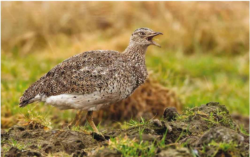
156 Little Bustard / Kleine Trap Tetrax tetrax , Stalhille, West-Vlaanderen, Belgium, 4 March 2012

RAPTORS For the first time since 2008, the Dutch rarities committee dropped species from the list of species that are considered as, by 1 January 2012, the number of individuals accepted for Short-toed Snake Eagle Circus gallicus , Pallid Harrier Circus macrourus , Dusky Warbler Phylloscopus fuscatus and Thrush Nightingale Luscinia luscinia had increased above the average of two per year for the past 30 years; the committee makes an exception for certain species, such as Griffon Vulture Cyps fulvus , where the average number of records is less than two per year but the total over the past 30 years has exceeded 60 individuals. An RSPB Bird Crime report reveals that illegal poisoning of raptors in Britain remains a major problem with 20 Red Kites Milvus milvus , one White-tailed Eagle Haliaeetus albicilla , two Northern Goshawks Accipiter gentilis , one Eurasian Sparrowhawk A. nisus , 30 Common Buzzards Buteo buteo , five Golden Eagles Aquila chrysaetos and eight Peregrine Falcons Falco peregrinus found dead as a result of poisoning in 2010 alone, this number of documented incidents no