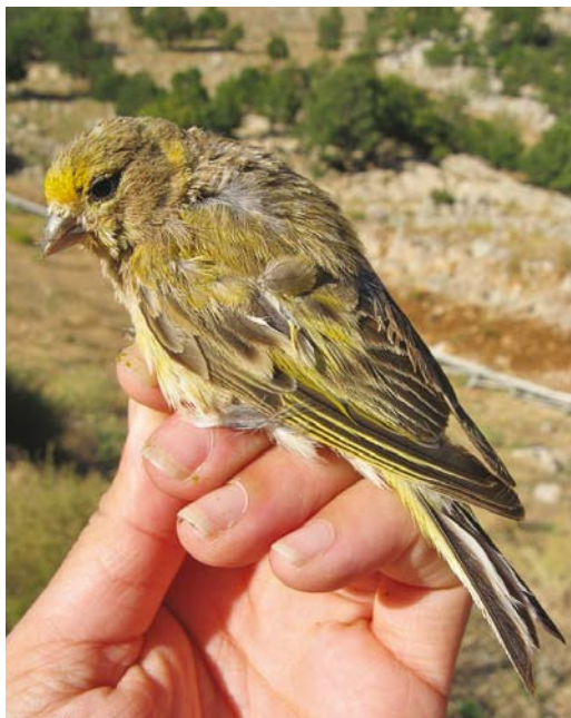
109 Syrian Serin / Syrische Kanarie Serinus syriacus , second calendar-year male, mount Hermon, Israel, 18 July 2008. Despite colourful appearance, this bird can be aged by retained juvenile alula feathers and by worn primaries.