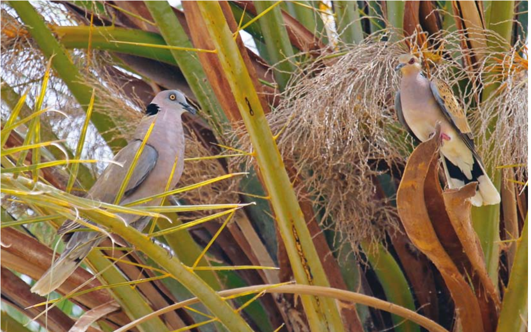
142 Mourning Collared Dove / Treurtortel Streptopelia decipiens (left), with European Turtle Dove / Zomertortel S turtur , Abu Simbel, Egypt, 7 May 2011 ( Eric Didner )