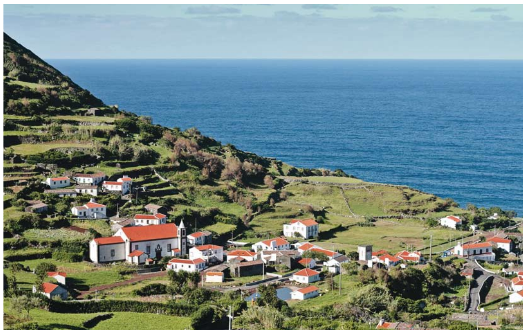
134 Fajãzinha, Flores, Azores, 24 October 2011