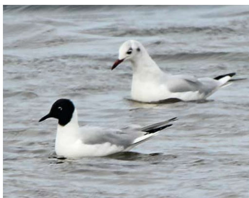
439 Swinhoe's Storm Petrel / Chinees Stormvogeltje Oceanodroma monorhis , Fortune Bank, c 21 nautical miles east of Graciosa, Azores, Azores, 1 August 2012 (Harro H Müller) 440-441 Swinhoe's Storm Petrel / Chinees Stormvogeltje Oceanodroma monorhis , Fortune Bank, c 21 nautical miles east of Graciosa, Azores, 1 August 2012 (Vincent Legrand) 442 Black-bellied Storm Petrel / Zwartbuikstormvogeltje Fregetta tropica , Banco de la Concepción, c 45 nautical miles north of Lanzarote, Canary Islands, 18 August 2012 (Juan Sagardia) 443 Pallas's Gull / Reuzenzwartkopmeeuw Larus ichthyaetus , first-year, Swinoujście, Poland, 22 August 2012 (Zbyszek Kajzer) 444 Bonaparte's Gull / Kleine Kokmeeuw Chroicocephalus philadelphia , adult (left), Blåvandshuk, Vestjylland, Denmark, 4 August 2012 (Per Poulsen)