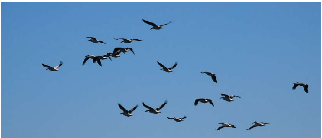
390 Great White Pelicans / Roze Pelikanen Pelecanus onocrotalus , pond of Molentargius, Cagliari, Sardinia, Italy, 23 February 2008 (Fabio Cherchi). Part of group of 27 individuals.

The two groups of Great White Pelicans in Sardinia in 2008 flew off and on daily, which was probably related to food availability. The group at Molentargius usually fed locally, in a wetland rich of Common Carp Cyprinus carpio and Flathead Grey Mullet Mugil cephalus . On various occasions at the end of the morning, the group departed to unknown destinations but in the evening returned to Molentargius and spent the night roosting on embankments, in association with Great Cor-