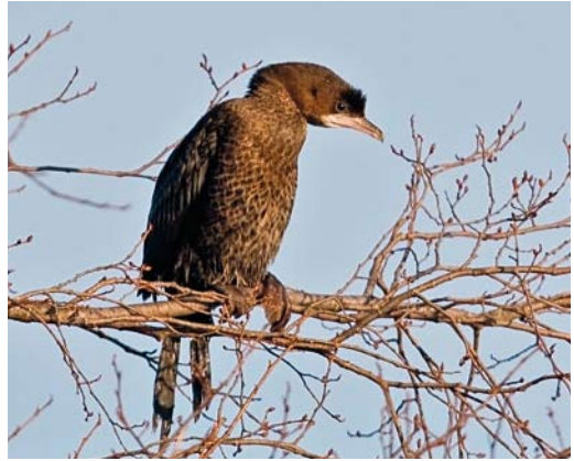
382 Pygmy Cormorant / Dwergaalscholover Phalacrocorax pygmeus , Uzava river, Ventspils, Latvia, 30 January 2012 (Ainars Mankus). First record for Latvia.

A bird stayed on the Uzava river, Ventspils, from 29 January to 2 February 2012 (plate 382; cf Dutch