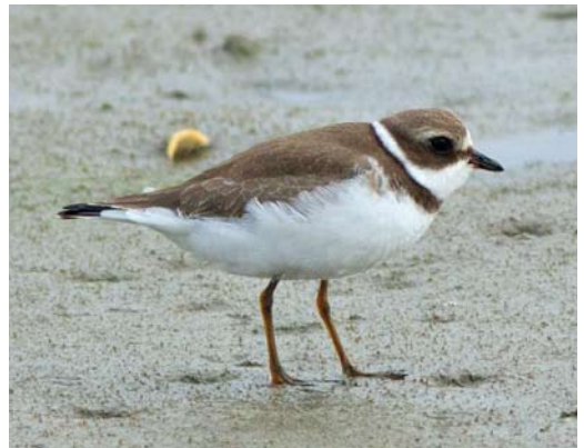
450 Little Crake / Klein Waterhoen Porzana parva , Kruikeke, Oost-Vlaanderen, Belgium, 6 September 2012 ( Erik Van Boogaert ) 451 Booted Eagle / Dwergarend Aquila pennata , Walem, Antwerpen, Belgium, 18 July 2012 ( Johan Buckens ) 452 Short-billed Dowitcher / Kleine Grijze Snip Limnodromus griseus , juvenile, Lodmoor, Dorset, England, 6 September 2012 ( Dave Perrett ) 453 Terek Sandpiper / Terekrutter Xenus cinereus , Cabo da Praia, Terceira, Azores, 29 August 2012 ( Richard Bonser ) 454 Greater Sand Plover / Woestijnplevier Charadrius leschenaultii , Hauke-Haien-Koog, Nordrhein-Westfalen, Germany, 25 August 2012 ( Johannes Honold ) 455 Semipalmated Plover / Amerikaanse Bontbekplevier Charadrius semipalmatus , first-year, South Uist, Outer Hebrides, Scotland, 7 September 2012 ( Steve Duffield )