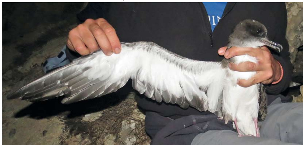
421 Cape Verde Shearwater / Kaapverdische Pijlstormvogel Calonectris edwardsii, Selvagem Grande, Selvagens, 5 April 2012