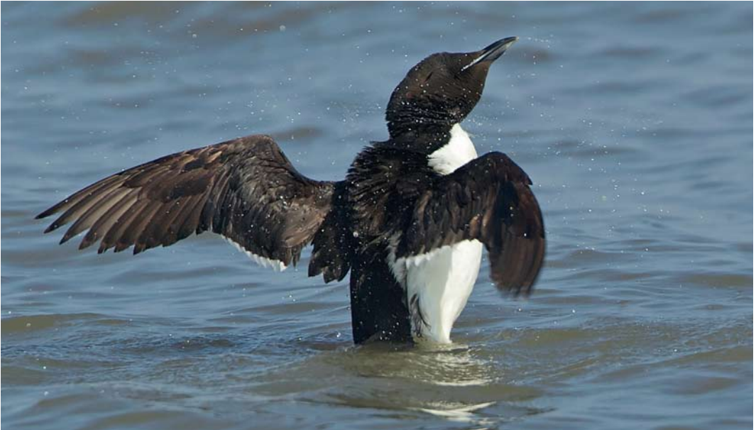
482 Kortbekzeekoet / Thick-billed Murre Uria lomvia, Kustweg, Lauwersmeer, Groningen, 29 juli 2012

Hoewel hij op enige afstand zwom, waren de belangrijkste kenmerken van Kortbekzeekoet goed te zien, zoals de zwarte bovendelen (bruiner bij Zeekoet), de kortere snavel met het karakteristieke witte lijntje op de zijkant, de compactere bouw vergeleken met Zeekoet, de in een scherpe punt oplopende witte borsttekening en het ontbreken van donkere tekening op de flanken. Na enige tijd zwom hij verder de zee op en ging actief duiken, waarbij het afwachten was waar hij weer boven zou komen. Na een uurtje begon hij aan een grondige poetsbeurt en liet zich toen rustig bekijken. Steeds meer vogelaars kwamen de dijk opgerend en wierpen een blik door de opgestelde telescopen: de soort was binnen – en voor verbaasd veel, ook zeer reislustige, vogelaars was het nog een 'lifer' ook.