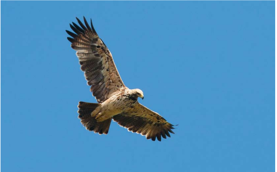
436 Eastern Imperial Eagle / Keizerarend Aquila heliaca , subadult, Sturup, Skåne, Sweden, 25 July 2012 ( Lasse Olsson ) 437 Rüppell's Vulture / Rüppells Gier Gyps rueppellii , Vila Velha De Rodão, Portugal, 4 August 2012 ( Vincent Legrand ) 438 Hybrid Lesser Spotted x Greater Spotted Eagle Aquila pomarina x clanga , juvenile, Biebrza marshes, Poland, 7 September 2012 ( Marcin Przepiórka/www.lto.org.pl )