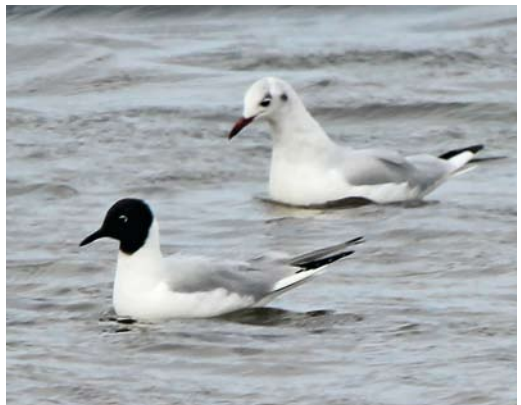
439 Swinhoe's Storm Petrel / Chinees Stormvogeltje Oceanodroma monorhis , Fortune Bank, c 21 nautical miles east of Graciosa, Azores, Azores, 1 August 2012 440-441 Swinhoe's Storm Petrel / Chinees Stormvogeltje Oceanodroma monorhis , Fortune Bank, c 21 nautical miles east of Graciosa, Azores, 1 August 2012 442 Black-bellied Storm Petrel / Zwartbuikstormvogeltje Fregetta tropica , Banco de la Concepción, c 45 nautical miles north of Lanzarote, Canary Islands, 18 August 2012 443 Pallas's Gull / Reuzenzwartkopmeeuw Larus ichthyaetus , first-year, Swinoujście, Poland, 22 August 2012 444 Bonaparte's Gull / Kleine Kokmeeuw Chroicocephalus philadelphia , adult (left), Blåvandshuk, Vestjylland, Denmark, 4 August 2012