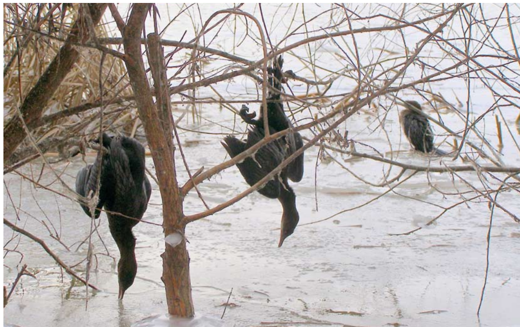
380 Dead and debilitated Pygmy Cormorants / Dwergaalscholwers Phalacrocorax pygmeus as result of cold winter weather, Danube river near Vilkovce, Ukraine, 5 February 2010 ( Maksim V Yakovlev )