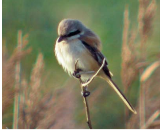
420 Langstaartklauwier / Long-tailed Shrike Lanius schach , eerste-winter, Oude Vuilnisbelt, Den Helder, Noord-Holland, 31 oktober 2011 (Enno B Ebels)

from western Central Asia or L s schach from further east and excludes the other mostly resident subspecies from the Indian Subcontinent and South-East Asia. This was the first record for the Netherlands, the fourth for Europe and the ninth for the Western Palearctic 'sensu BWP'. All WP records are listed in table 1.