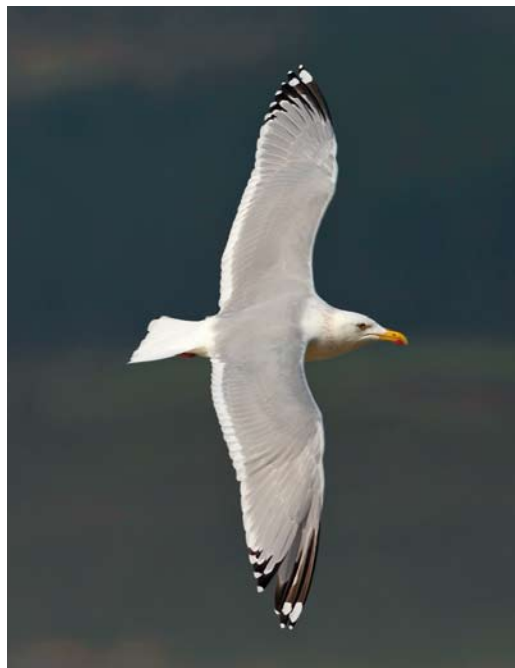
403 Smithsonian Gull / Amerikaanse Zilvermeeuw Larus smithsonianus , adult, Lires fish farm, Galicia, Spain, 25 February 2012 ( Juan Sagardía ). Complete, symmetrical, black 'W' across both webs of p5 is well visible here. Also note uninterrupted, black subterminal band on p10, as well as white mirror on p9, mainly concentrated on inner web.

coverts; 6 very long pale tongue on p8, of same length as on p7; 7 obvious white tongue tip on p6-p9; 8 obvious black bayonet on p7-8, and pointed wedge on outer web of p6; and 9 pale grey, argenteus -like wing.