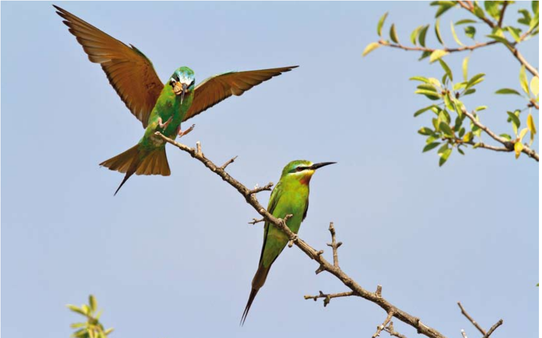
462 Blue-cheeked Bee-eaters / Groene Bijeneters Merops persicus , Delfía, Girona, Spain, 24 August 2012 (Fran Tralalon)