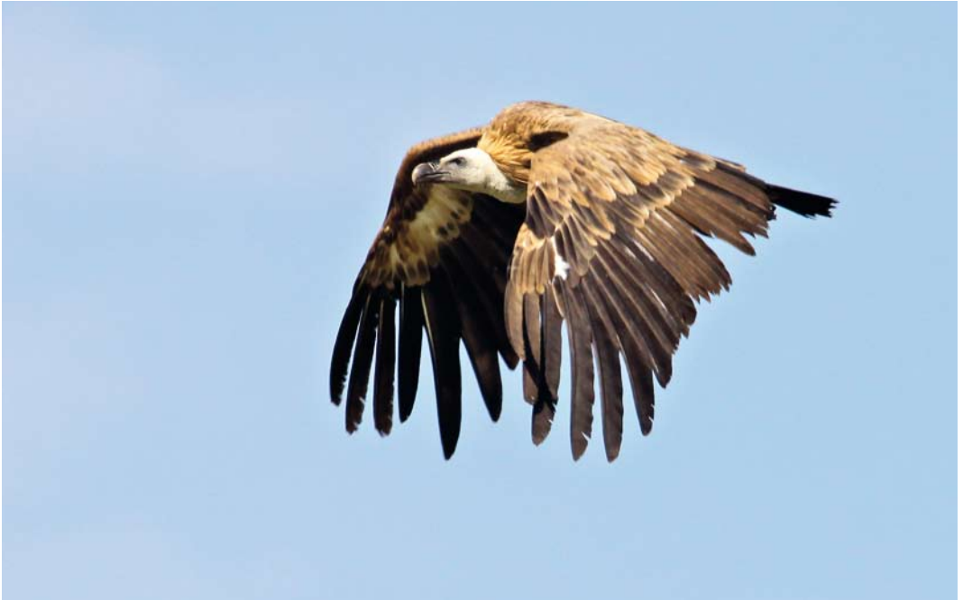
467 Vale Gier / Griffon Vulture Gyps fulvus , Tzummarum, Friesland, 7 juli 2012 468 Bairds Strandloper / Baird's Sandpiper Calidris bairdii , juveniel, Noordzeestrand, Meijendel, Zuid-Holland, 29 augustus 2012 469 Vale Gier / Griffon Vulture Gyps fulvus , Odiliapeel, Noord-Brabant, 31 juli 2012