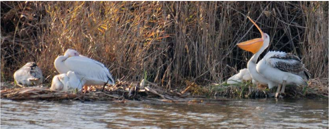
394 Great White Pelican / Roze Pelikaan Pelecanus onocrotalus, pond of Molentargius, Cagliari, Sardinia, Italy, 25 April 2009. Only individual staying in the Gulf of Cagliari after departure of the group in spring 2008, still being present in spring 2012. 395 Great White Pelican / Roze Pelikaan Pelecanus onocrotalus, salt-pan of Macchiareddu, Cagliari, Sardinia, Italy, 14 February 2012. Same bird as in plate 394. This individual was still present in summer 2012. 396 Great White Pelicans / Roze Pelikanen Pelecanus onocrotalus, pond of Molentargius, Cagliari, Sardinia, Italy, 7 February 2008. Part of group of 27 individuals.