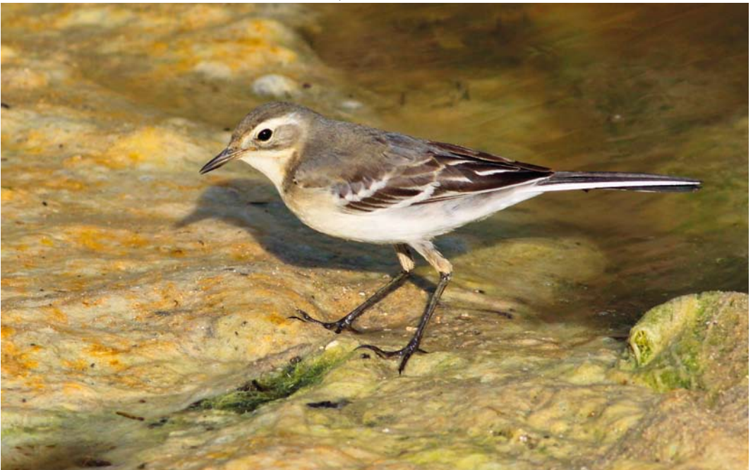
463 Citrine Wagtail / Citroenkwikstaart Motacilla citreola , first-year, Malta, 15 August 2012 (Raymond Galea)