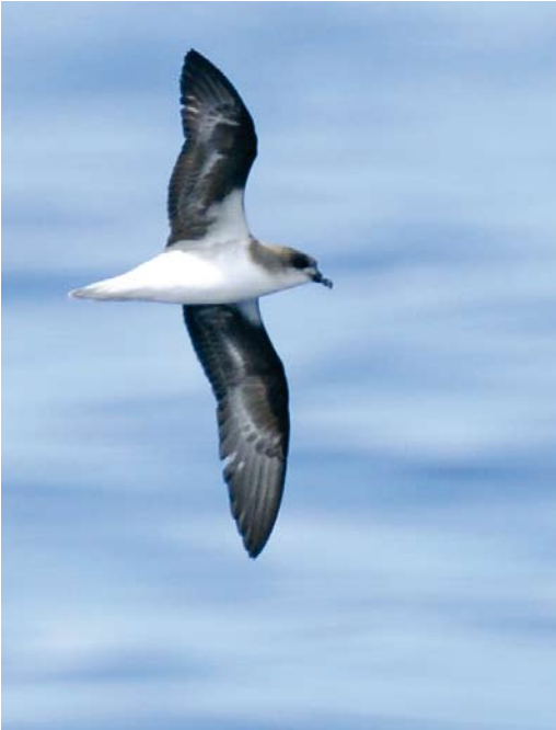
445 Zino's Petrel / Freira Pterodroma madeira , Fortune Bank, c 21 nautical miles east of Graciosa, Azores, 1 August 2012