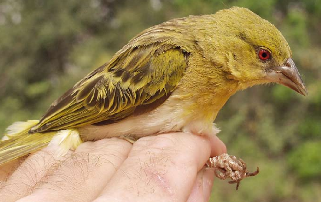
430 Village Weaver / Grote Textorwever Ploceus cucullatus , adult female, Amurum, Jos Plateau, Nigeria (09°52'N, 08°58'E), 27 March 2003. Note long claws, similar to Abu Simbel bird.