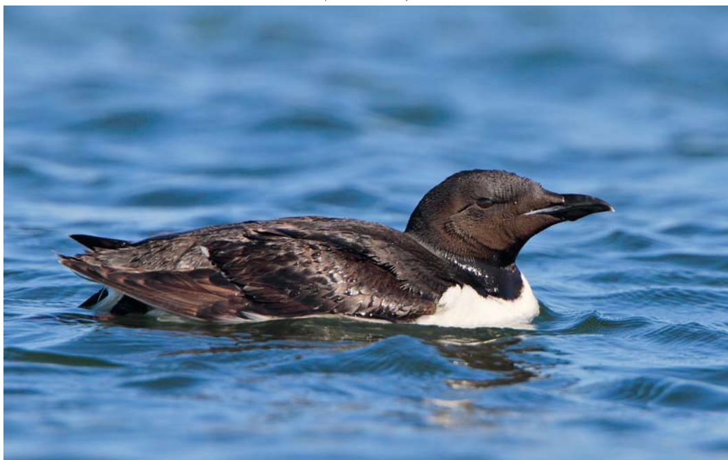
478 Kortbekzeekoet / Thick-billed Murre Uria lomvia , Huisduinen, Den Helder, Noord-Holland, 12 augustus 2012 (Michel Veldt)