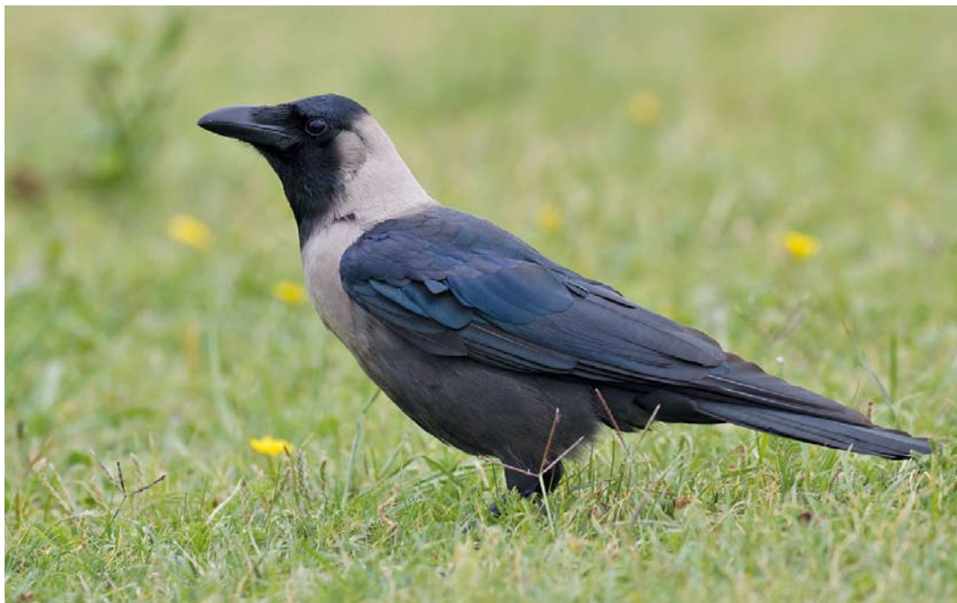
477 Huis kraai / House Crow Corvus splendens , Hoek van Holland, Zuid-Holland, 26 augustus 2012. Exemplaar met kenmerken van C s zugmayeri .