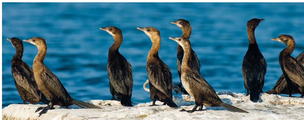
385 Pygmy Cormorant / Dwergaalscholver Phalacrocorax pygmeus , Nielisz reservoir, Lubelskie, Poland, 12 October 2009 ( Lukasz Bednarz ) 386 Pygmy Cormorants / Dwergaalscholwers, pair with young, Senné fishponds, Slovakia, 6 August 2010 ( Miloš Balla ) 387 Pygmy Cormorant / Dwergaalscholver Phalacrocorax pygmeus , Oost-Maarland, Limburg, Netherlands, 10 March 2003 ( Ran Schols ) 388 Pygmy Cormorant / Dwergaalscholver Phalacrocorax pygmeus , Leuth, Gelderland, Netherlands, 16 May 2010 ( Toy Janssen ) 389 Pygmy Cormorants / Dwergaalscholwers Phalacrocorax pygmeus , Poda, Burgas, Bulgaria, 10 September 2008 ( Leander Khil )