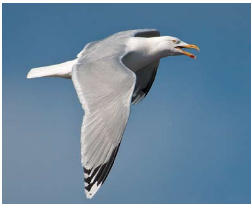
407 Hybrid Glaucous x Herring Gull Larus hyperboreus x argentatus , adult, Sandgerði, Iceland, 1 April 2010 (Peter Adriaens). Different individual than in plate 408, but with roughly same features in primary pattern. This bird has even larger white mirror on p9, with very little subterminal black.