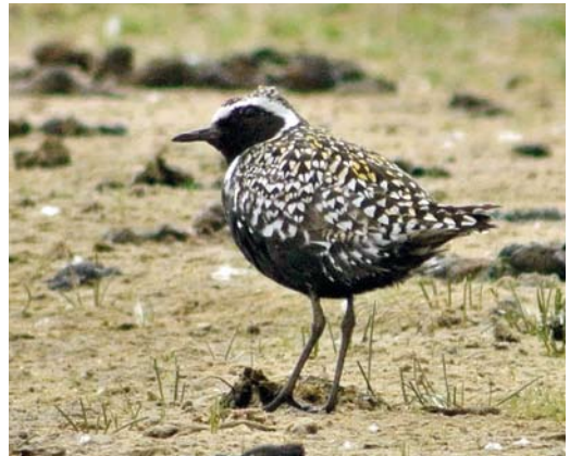
470 Blonde Ruiter / Buff-breasted Sandpiper Tryngites subruficollis , Prunjepolder, Zeeland, 22 augustus 2012 (Thomas Luiten) 471 Blonde Ruiter / Buff-breasted Sandpiper Tryngites subruficollis , Utopia, Texel, Noord-Holland, 3 augustus 2012 (Jos van den Berg) 472 Amerikaanse Goudplevier / American Golden Plover Pluvialis dominica , Schelphoek, Burgh-Haamstede, Zeeland, 25 juli 2012 (Harm Niesen) 473 Aziatische Goudplevier / Pacific Golden Plover Pluvialis fulva , Mariëndal, Den Helder, Noord-Holland, 4 juli 2012 (Harm Niesen)

ties waren voor langere tijd twee exemplaren aanwezig. Ook op een handvol andere plekken werd de soort gemeld. Het tweede-kalenderjaar mannetje Steppekieken-dief Circus macrourus dat vanaf 13 mei bij Exloo, Drenthe, verbleef, werd voor het laatst op 5 september gemeld. Het betrof de eerste overzomeraar voor Nederland. Intrigerend waren de meldingen rond half juli van twee adulte en twee juveniele Visarenden boven het Veluwemeer bij Biddinghuizen, Flevoland. Een donkere valk Falco die op 17 augustus werd gefotografeerd in Nationaal Park de Meinweg bij Roermond, Limburg, betrof mogelijk een Eleonora's Valk F. eleonora ; opmerkelijk was dat twee dagen eerder een donkere vorm Eleonora's Valk werd gemeld over de Duitse grens bij Viersen, Nordrhein-Westfalen, c 20 km naar het noordoosten. Het was een goed najaar voor Porseleinhoen Porzana porzana . Op diverse plekken doken vooral in augustus groepjes op, zoals minstens 16 bij Zevenhuizen,