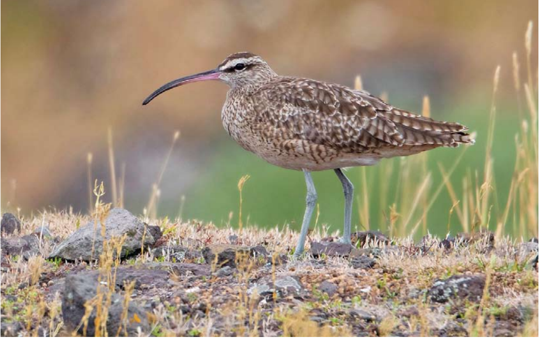
447 Hudsonian Whimbrel / Amerikaanse Regenwulp Numenius hudsonicus , Cabo da Praia, Terceira, Azores, 29 July 2012 448 Stilt Sandpiper / Steltstrandloper Calidris himantopus , adult, Le Teich, Gironde, France, 11 August 2012 449 American Golden Plover / Amerikaanse Goudplevier Pluvialis dominica , Achill Island, Mayo, Ireland, 16 September 2012