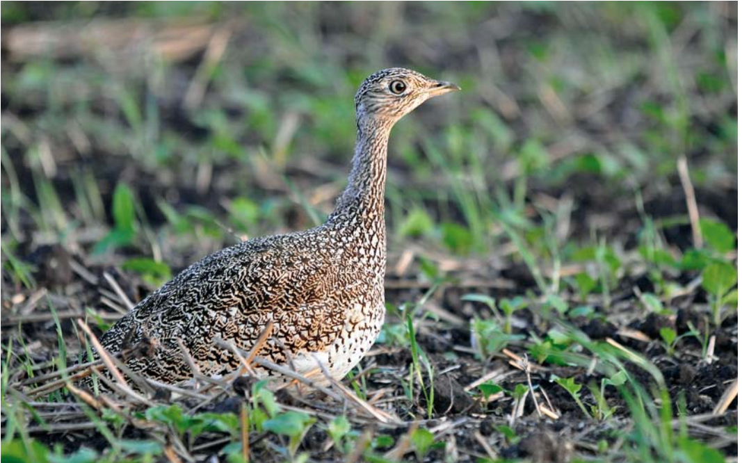
434 Little Bustard / Kleine Trap Tetrax tetrax , Machnówek, Lubelskie, Poland, 8 September 2012