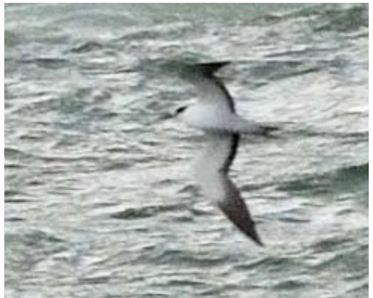
409-414 Bonte Stern / Sooty Tern Onychoprion fuscatus , Maasmond, Maasvlakte, Zuid-Holland, 31 augustus 2012 (Ben van den Broek)