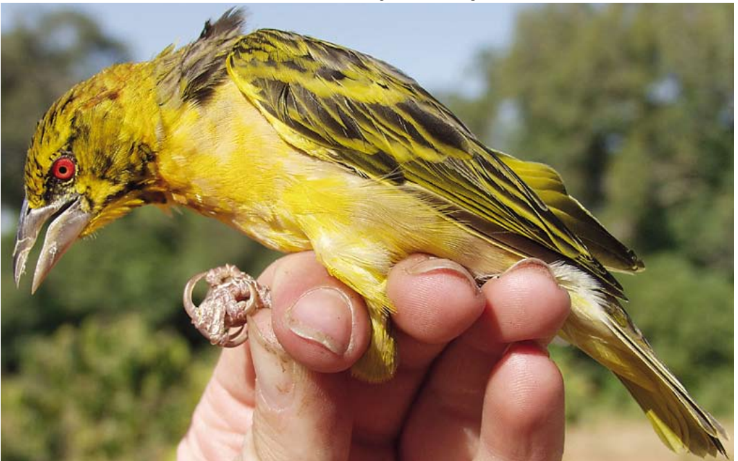
431 Village Weaver / Grote Textorwever Ploceus cucullatus , adult male, Amurum, Jos Plateau, Nigeria (09°52'N, 08°58'E), 28 November 2001 (Ross McGregor). Note long claws, similar to Abu Simbel bird.