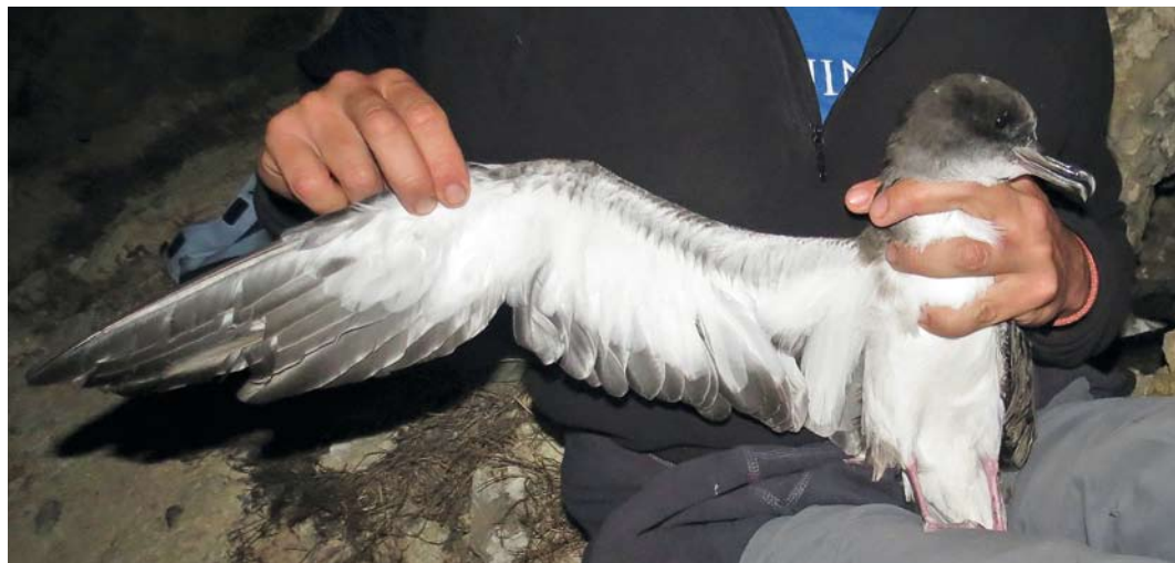
421 Cape Verde Shearwater / Kaapverdische Pijlstormvogel Calonectris edwardsii, Selvagem Grande, Selvagens, 5 April 2012