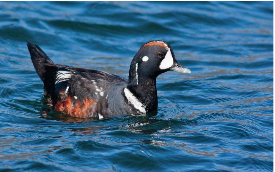
435 Harlequin Duck / Harlekijneend Histrionicus histrionicus , male, Persfjorden, Vardø, Finnmark, Norway, 28 July 2012 (Jürgen Steudtner)