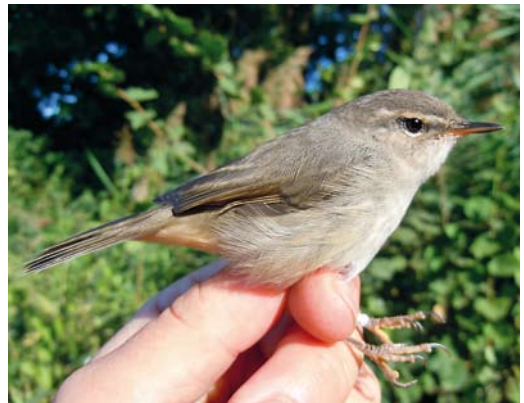
456 European Bee-eater / Bijeneter Merops apiaster , Malta, April 2012 ( Michael Sammut ) 457 Little Swift / Huisgierzwaluw Apus affinis , juvenile, New Brighton, Merseyside, England, 22 June 2012 ( Ashley Powell ) cf Dutch Birding 34: 264, 2012 458 Magnolia Warbler / Magnoliazanger Setophaga magnolia , Fair Isle, Scotland, 23 September 2012 ( Jason Moss ) 459 Magnolia Warbler / Magnoliazanger Setophaga magnolia , Fair Isle, Scotland, 23 September 2012 ( Steve Arlow ) 460 Yellow-breasted Bunting / Wilgengors Emberiza aureola , Falsterbo, Skåne, Sweden ( Stephen Menzie ) 461 Dusky Warbler / Bruine Boszanger Phylloscopus fuscatus , Nodebais, Brabant Wallon, Belgium, 30 August 2012 ( Vincent Bulteau )