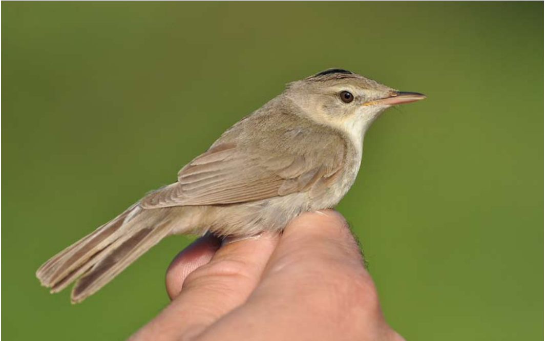
479 Struikrietzanger / Blyth's Reed Warbler Acrocephalus dumetorum , adult, Meijndel, Zuid-Holland, 11 augustus 2012 480 Duinpieper / Tawny Pipit Anthus campestris , eerstejaars, Hendrik-Ido-Ambacht, Zuid-Holland, 26 augustus 2012 481 Waterrietzanger / Aquatic Warbler Acrocephalus paludicola , Lentevreugd, Wassenaar, Zuid-Holland, 13 augustus 2012