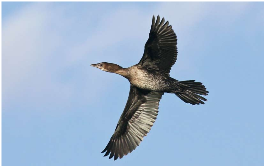
383 Pygmy Cormorant / Dwergaalscholver Phalacrocorax pygmeus , Belgrade, Serbia, 23 November 2008 (Maciej Szymański)