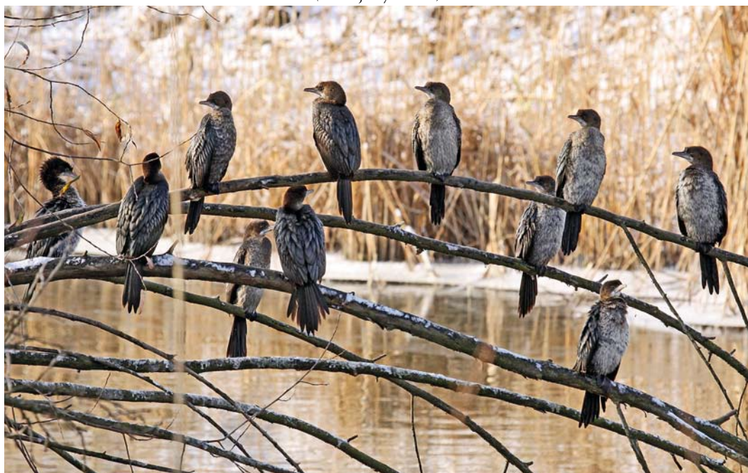
384 Pygmy Cormorants / Dwergaalscholwers Phalacrocorax pygmeus , Belgrade, Serbia, 28 December 2008