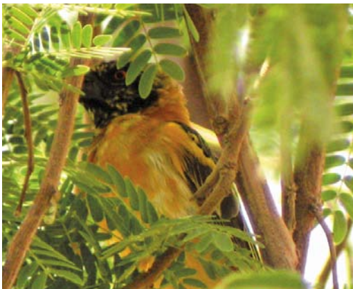
427-428 Village Weaver / Grote Textorwever Ploceus cucullatus , male, presumably adult, Abu Simbel, Egypt, 1 May 2006. Compare claw length with plate 430-431.

During researches about this sighting, it became apparent that what was probably the same bird had been seen on 2 April 2006 'near the blue factory along lake Nasser 500 m outside Abu Simbel' (apparently the area south of 'airport bay') by Erik Forsyth, leading a Rockjumper birding tour. The sighting was brief and no detailed description or photograph could be taken but EF identified the bird as a non-breeding male Village Weaver, a species he was very familiar with. Compared with the photographs taken on 1 May, the bird (assuming it was the same individual) was noted as less black on the face and not as bright yellow. Note that, given the lack of documentation, this April report remains unconfirmed.