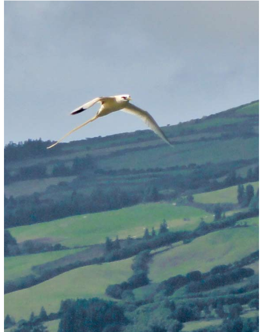
446 White-tailed Tropicbird / Witstaartkeerringvogel Phaethon lepturus , adult, Horta, Faial, Azores, 17 September 2012 (Erik van Ommen)

at Gulf of Cagliari. In 2011, the feral breeding population of African Sacred Ibis Threskiornis aethiopicus in France numbered 660-710 pairs (from 1700 pairs in 2006), mostly in Loire-Atlantique (Ornithos 19: 238-239, 2012). At the Dutch-German border, three fledgling Chilean Flamingos Phoenicopterus chilensis were ringed at Zwillbrocker Venn colony where this (and occasionally other) flamingo species has been thriving since 1982. In the Azores, long-staying Pied-billed Grebes Podilymbus podiceps remained through at least mid-September at Lagoa Azul, São Miguel, at Angra do Heroísmo, Terceira, and at Lagoa Branca, Flores.