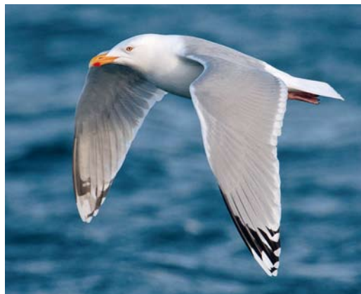
408 Hybrid Glaucous x Herring Gull Larus hyperboreus x argentatus , adult, Njarðvík, Iceland, 1 April 2010. As this bird combines pale grey upperparts with long, Caspian Gull L. cachinnans -like tongue on underside of p10, it may recall Smithsonian Gull L. smithsonianus . Note, however, absence of black on p5, and very large white mirror on p9-10. This bird has no real 'bayonet pattern' on p7-8 either.

Amongst other things, it lacked a black band on p5, did not have a complete black subterminal band on p10 and lacked obvious bayonets on p7-8). Several of the visible features indicate that this bird is most likely an argentatus or smithsonianus with hyperboreus influence. These features include: overall structure and size, slaty black colour on the outer primaries, especially when compared directly with the jet-black coloration of the primaries of other nearby gulls (although it should be noted that, if seen alone, the colour could seem, at times, more jet-black), very pale grey wings, paler than argenteus in direct comparison, lack of any black coloration on p5 and restricted black on p6, would, most likely, indicate argentatus or smithsonianus with hyperboreus influence. This bird addresses well the potential pitfall and illustrates why, when dealing with smithsonianus candidates, hybrid hyperboreus x argentatus should also be borne in mind. A thorough study of the primary pattern is essential for a correct identification.