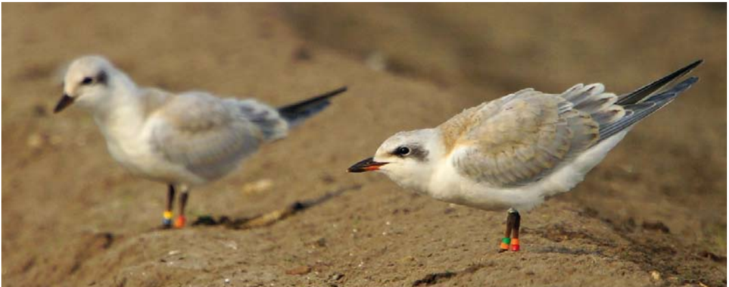
474 Grote Burgemeester / Glaucous Gull Larus hyperboreus , tweede-zomer, Osdorp, Amsterdam, Noord-Holland, 6 september 2012 ( Michel Veldt ) 475 Kleinste Jager / Long-tailed Jaeger Stercorarius longicaudus , juveniel, Kinderdijk, Zuid-Holland, 22 augustus 2012 ( Adri Clements ) 476 Lachsters / Gull-billed Terns Gelochelidon nilotica , juveniele, Keinsmerbrug, Noord-Holland, 28 augustus 2012 ( Arnold W J Meijer )

Vooral twee tamme juveniele van 28 tot 31 augustus op een parkeerplaats bij Hargen aan Zee, Noord-Holland, trokken veel bekijks. Een Amerikaanse Goudplevier Pluvialis dominica verbleef van 17 juli tot 18 augustus in de omgeving van Serooskerke. Aziatische Goudplevieren P. fulva werden gemeld op 3 en 4 juli in Mariëndal bij Den Helder, Noord-Holland; op 8 en 10 juli bij De Cocksdorp op Texel; van 21 tot 23 maximaal twee in de Slufter op Texel; op 31 juli en 1 augustus opnieuw twee in Waal en Burg op Texel; en op 16 augustus in de Ezumakeeg, Friesland. Het is onduidelijk hoeveel vogels er in het spel waren. Een Bonapartes Strandloper Calidris fuscicollis verbleef op 28 juli in de Sophiapolder bij Oostburg, Zeeland. Een tamme juveniele Bairds Strandloper C. bairdii die op 27 augustus werd gefotografeerd op het strand bij Wassenaar, Zuid-Holland, was daar tot groot genoegen van veel vogelaars ook op 29 en 30 augustus te zien. Het betrof alweer de derde twitchbare binnen een jaar. Op zeven plekken in het noorden en