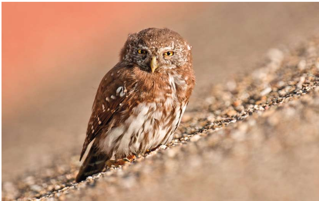
465 Dwerguil / Eurasian Pygmy Owl Glaucidium passerinum , eerstejaars, Holwerd, Friesland, 3 augustus 2012 (Ruurd Jelle van de Leij)