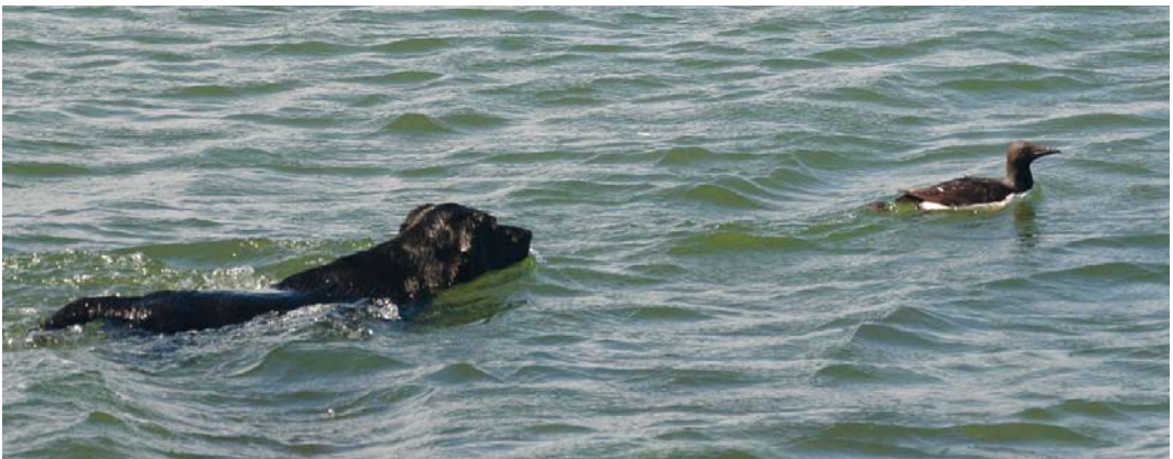
483 Kortbekzeekoet / Thick-billed Murre Uria lomvia , Huisduinen, Den Helder, Noord-Holland, 12 augustus 2012 (Marco Eerkes)

THICK-BILLED MURRE On 28-29 July 2012, a summer-plumaged Thick-billed Murre Uria lomvia was seen near Lauwersoog, Groningen, the Netherlands. On 11-13 August, the same bird stayed at Den Helder, Noord-Holland, c 130 km to the west. On the last day, the bird died while on the water (the corpse could not be collected). At both sites, the bird could be observed at close range and extensively photographed and videoed. The detailed documentation may suffice to identify the subspecies. This was the ninth record, the third of a live bird (two of which eventually also died), the first in summer and the first twitchable.