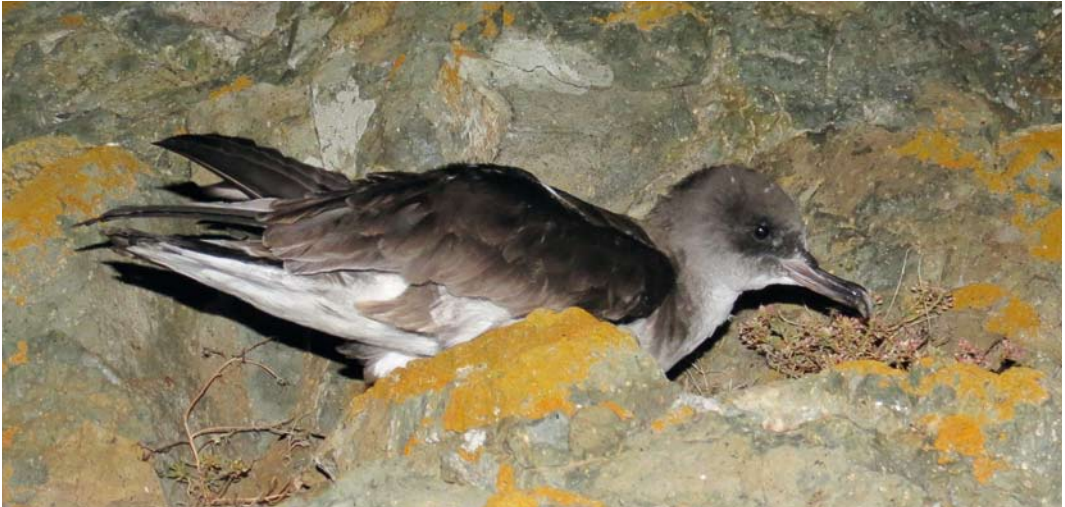
422 Cape Verde Shearwater / Kaapverdische Pijlstormvogel Calonectris edwardsii , Selvagem Grande, Selvagens, 5 April 2012