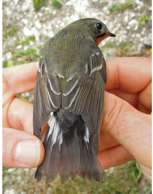
47-48 Mugimaki Flycatcher / Mugimakivliegenvanger Ficedula mugimaki , first-year male, Passo della Berga, Brescia, Italy, 6 October 2011 (Roberto Barezzi)