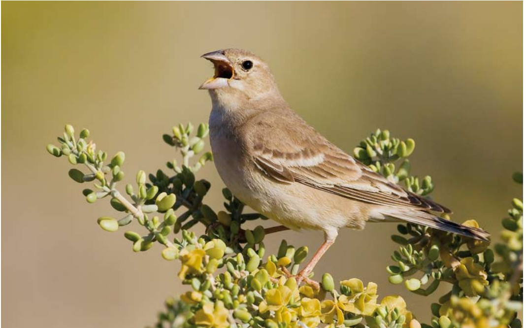
15 Pale Rockfinch / Bleke Rotsmus Carpospiza brachydactyla , singing male, Negev, Israel, 25 April 2010 (Yoav Perlman)