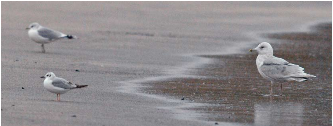
59 Tundra Peregrine Falcon / Toendraslechtvalk Falco peregrinus calidus , juvenile, Alghero, Sassari, Sardinia, Italy, early December 2011 ( Riccardo Paddeu ). Found injured and taken into care; ringed as pullus in Nenetskiy nature reserve, Nenets, Russia, on 3 August 2011. 60 Asian White-winged Scoter / Aziatische Grote Zee-eend Melanitta deglandi stejnegeri , Pontevedra, Galicia, Spain, 28 December 2011 ( Daniel López-Velasco ) 61 Bonaparte's Gull / Kleine Kokmeeuw Chroicocephalus philadelphia , first-winter (centre), Kumlien's Gull / Kumliens Meeuw Larus glaucooides kumlieni (right) and Common Gull / Stormmeeuw L canus canus , Sandágerði, Tórshavn, Faeroes, 11 January 2012 ( Silas K K Olofson )

Peregrine Falcon F peregrinus calidus ringed at Nenetskiy nature reserve, Nenets, Russia, on 3 August 2011 and picked up injured at a distance of 4083 km at Alghero, Sassari, Sardinia, in early December concerned this taxon's first ringing recovery for Italy.