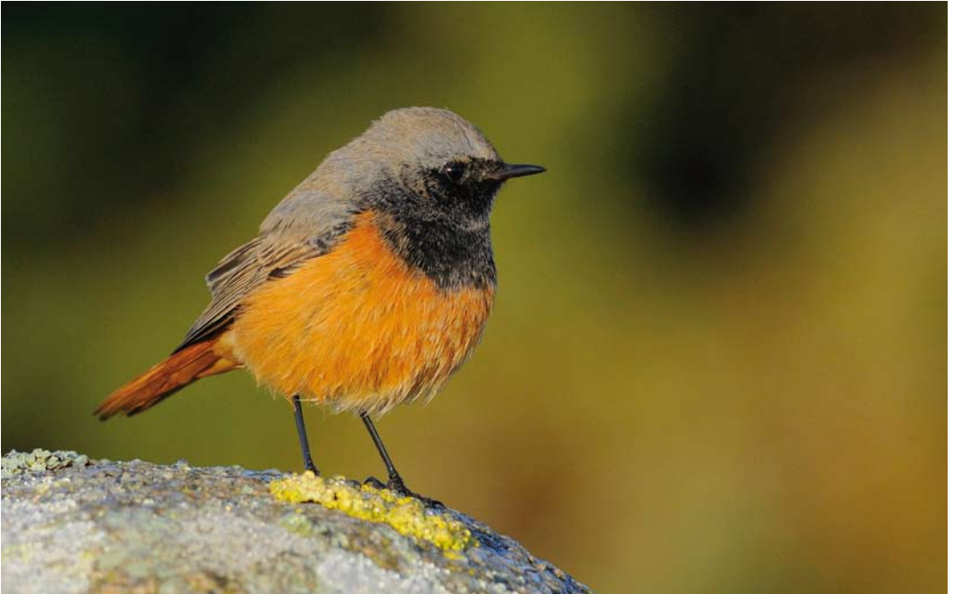
71 Eastern Black Redstart / Oosterse Zwarte Roodstaart Phoenicurus ochruros phoenicuroides , male, Gotland, Sweden, 10 November 2011