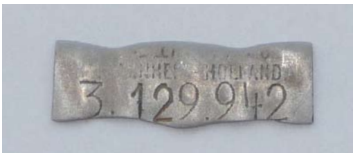
FIGURE 1 Aluminium ring Arnhem 3.129.942 (record 2 in table 1) of second oldest Black-headed Gull Chroicocephalus ridibundus , 27 years and 11 months after ringing on tibia

This bird was aged as after second calendar-year in May 1972, so it was born in 1970 or earlier. The time between ringing and the last sighting was 29 years, 11 months and 24 days. It was at least almost 32 years old when seen for the last time (31 years and 11 months, given that most chicks born in the Wadden Sea hatch in late May) and possibly one or more years older. This individual is currently the second oldest Black-headed Gull.