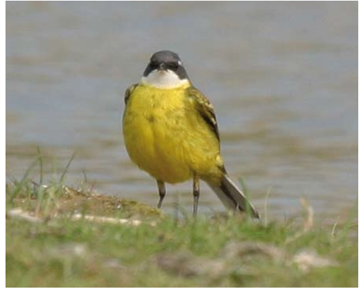
39-40 Witkeelkwikstaart / White-throated Wagtail Motacilla cinereocapilla , mannetje, Makkum, Friesland, 3 mei 2004 (Leo / R Boon/Cursorius)

GEDRAG Langdurig verblijvend in en nabij kort gemaaid vochtig rietmoeras. Tekenen van territoriaal gedrag tonend, waarbij steeds op vaste delen van rietveld hoge rietstengels bezettend, waar vanaf met geregelde tussenpozen roepend. Tijdens gehele verblijf erg plaatstrouw. Interactie met andere kwikstaarten of baltsgedrag richting vrouwtje niet vastgesteld.