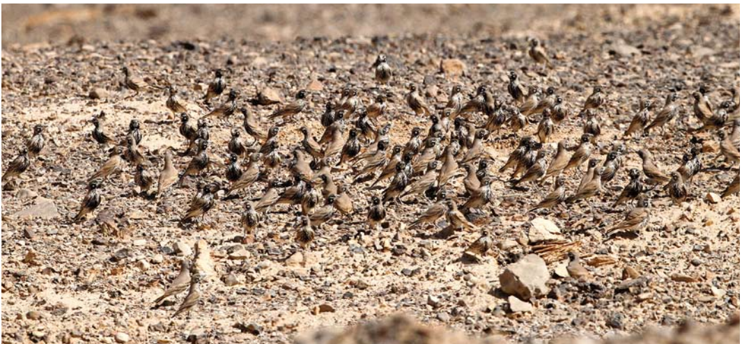
1 Thick-billed Larks / Diksnavelleuweriken Ramphocoris clotbey , Negev, Israel, 5 March 2011. Part of flock of c 300 individuals.

In southern Israel, several nomadic species breed only occasionally and in low numbers. Thick-billed Lark Ramphocoris clotbey , Dunn's