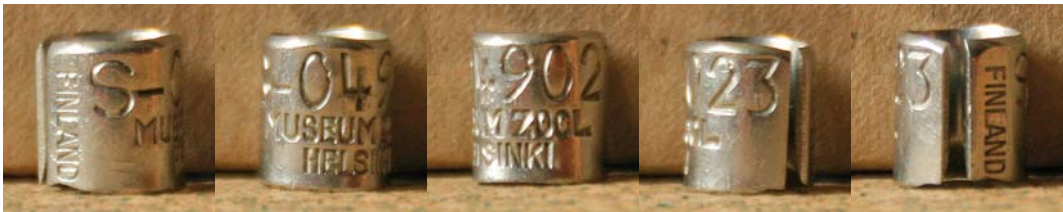
FIGURE 6 Stainless steel ring Helsinki S-049023 of Black-headed Gull Chroicocephalus ridibundus , 30 years and 8 months after ringing on tarsus (Benny Middendorp). Found dead near Monster, Zuid-Holland, Netherlands (record 4 in table 1), collection J van Kruijssen.

as well, with an annual survival of adults of 90% (Prévoit-Julliard et al 1998). During a long-term study in London, England, Gibson (2011) saw 30 individuals of over 20 years old, and 28 breeding birds out of 109 ringed birds (26%) on Griend reached an age of at least 15 years. Most had been ringed as adult, so their real age might even be (much) higher. We have not investigated sex-biased wear and loss of rings but we do not rule out that this also occurs (see Coulson (1976) for