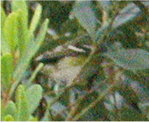
41 White-eyed Vireo / Witoogvireo Vireo griseus , first-year, Ribeira de Cancelas, Corvo, Azores, 22 October 2005