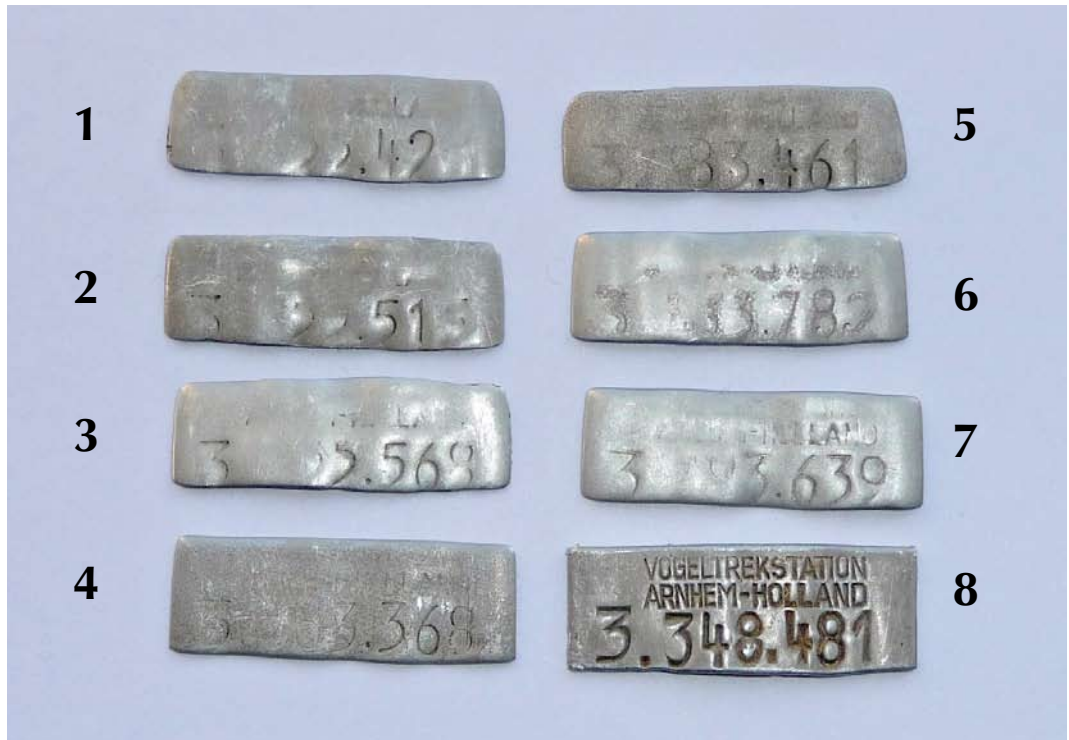
FIGURE 4 Aluminium rings of Vogeltrekstation Arnhem removed from tibia of eight Black-headed Gulls Chroicocephalus ridibundus ; 1-7 wintering at Hilversum, Noord-Holland, Netherlands (intentionally trapped, re-ringed with stainless steel ring), 8 found dead; see table 3 for details.