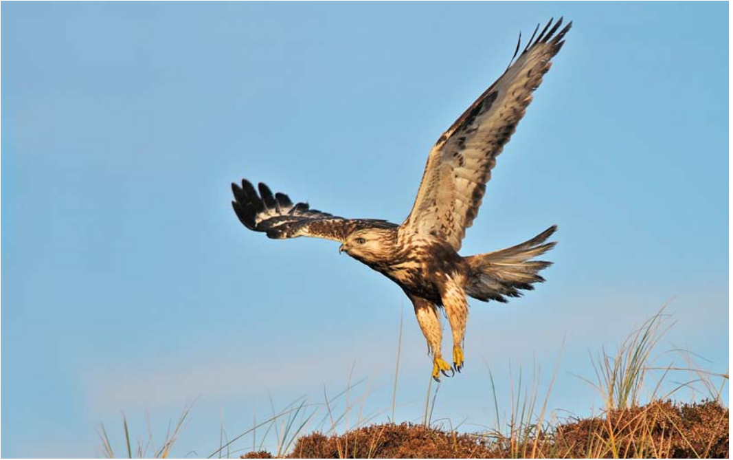
78 Ruigpootbuizerd / Rough-legged Buzzard Buteo lagopus , paal 12, Texel, Noord-Holland, 23 december 2011 (René Pop)