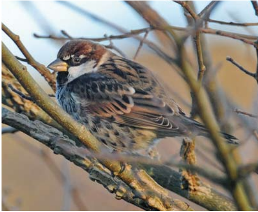
75 Spanish Sparrow / Spaanse Mus Passer hispaniolensis , male, Calshot, Hampshire, England, 13 January 2012 (Chris Thomas)