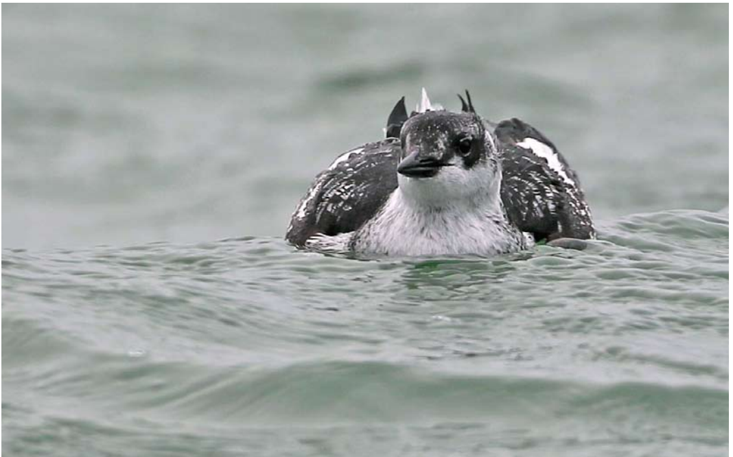
86 Zwarte Zeekoet / Black Guillemot Cephus grylle , eerstejaars, Brouwersdam, Zeeland, 4 december 2011