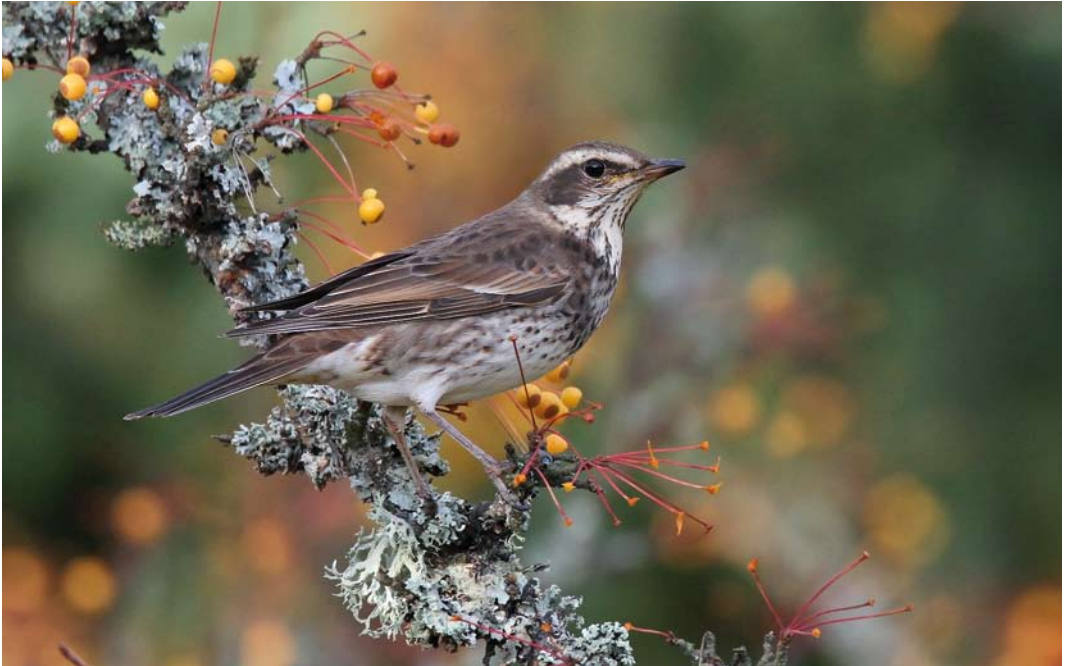
73 Dusky Thrush / Bruine Lijster Turdus eunomus , Säbyholm, Uppland, Sweden, 14 November 2011 (Johannes Rydström)