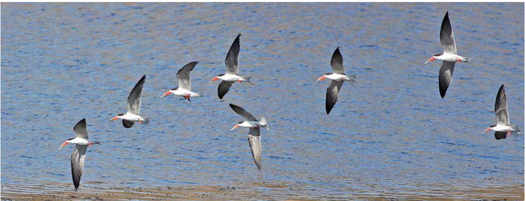
62 Allen's Gallinule / Afrikaans Purperhoen Porphyrio alleni , adult, St Julians, Malta, 24 December 2011 63 Western Sandpiper / Alaskastrandloper Calidris mauri , first-year, Cley, Norfolk, England, 28 December 2011 64 African Skimmers / Afrikaanse Schaarbekken Rynchops flavirostris , Kom Ombo, Egypt, 28 December 2011

33: 203, 2011). A first-year Western Sandpiper C mauri remained at Cley, Norfolk, England, from 28 November into January. The first-winter Long-toed Stint C subminuta at La Turballe, Loire-Atlantique, France from 6 November stayed until 20 December. A first-year Least Sandpiper C minutilla was foraging at Black Rock Strand, Kerry, Ireland, from 29 November to 19 December. A first-year Sharp-tailed Sandpiper C acuminata was present at Chew Valley Lake, Somerset, England, from 18 November to 16 December. The Wilson's Snipe Gallinago delicata on St Mary's, Scilly, England, since early October stayed into late December, while the 14th recorded in the Azores since the autumn was also found in December. The second Pin-tailed Snipe G stenura for Italy (and Europe) was present for a few days until at least 18 December near Siracusa, Sicily, and its identification could be confirmed by sonagrams. In the Azores, a Hudsonian Whimbrel Numenius hudsonicus was seen at Fajã dos Cubres, São Jorge, on 4 December. The last record of Slender-billed Curlew N tenuirostris for Poland on 7 October 1995 has been reconsidered and is now