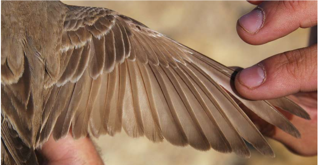
17 Pale Rockfinch / Bleke Rotsmus Carpospiza brachydactyla , adult, Negev, Israel, 9 June 2010 (Yoav Perlman). Note arrested wing moult.

nele regenval de katalysator kan zijn voor nomadisme in woestijnvogels, via de productiviteit van planten en insecten. Deze vorm van opportunisme als het gaat om broeden als reactie op unieke weersomstandigheden wijkt af van gebruikelijke strategieën die zijn gebaseerd op seizoenen. In het licht van de bedreigingen waar de Israëlische woestijnen aan bloot staan, is het begrip van de mechanismen rond het broeden van deze soorten erg belangrijk. De drie soorten broedden namelijk in waardevolle en kwetsbare habitats die zwaar onder druk staan door menselijk handelen.