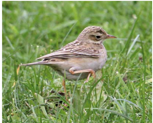
22 Richard's Pipit / Grote Pieper Anthus richardi , first-winter, A Coruña, Galicia, Spain, 11 January 2010 (Pablo Gutiérrez). Note very long white tongue on inner web of second outermost tail-feather (t5), extending far towards base of feather. Note also long-tailed appearance. 23 Richard's Pipit / Grote Pieper Anthus richardi , first-winter, A Coruña, Galicia, Spain, 11 January 2010 (Pablo Gutiérrez). Note triangular shape of black centre of third innermost median covert, almost reaching tip of feather, typical of Richard's. Pattern of two adjoining median coverts, however, more like Blyth's Pipit A godlewskii , with squarer and more clear-cut black centre, creating wide pale tip. 24-25 Richard's Pipit / Grote Pieper Anthus richardi , first-winter, A Coruña, Galicia, Spain, 11 January 2010 (Pablo Gutiérrez). Note long and relatively straight hind claw.

tongue on inner web of t5; 5 mantle pattern more spotted than striped; 6 head pattern with dark lateral crown-stripe and prominent supercilium; and 7 call (which, however, was not recorded). The pattern of the median coverts was not conclusive, with some feathers showing a pattern as in Richard's and some as in Blyth's Pipit (cf plate 20 and 23). However, the most centrally placed moulted one, which are said to be the most important, fit Richard's better (see below).