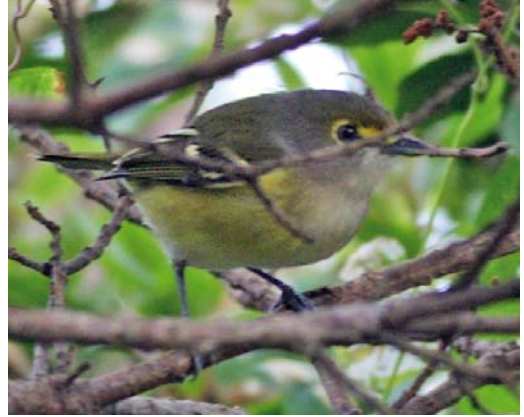
44 White-eyed Vireo / Witoogvireo Vireo griseus , first-year, Ribeira da Ponte, Corvo, Azores, 18 October 2009

before flying away and vanishing into the dense laurel wood. The observation had only lasted for 10-20 sec and PAC knew he had little chance to see the bird again soon.