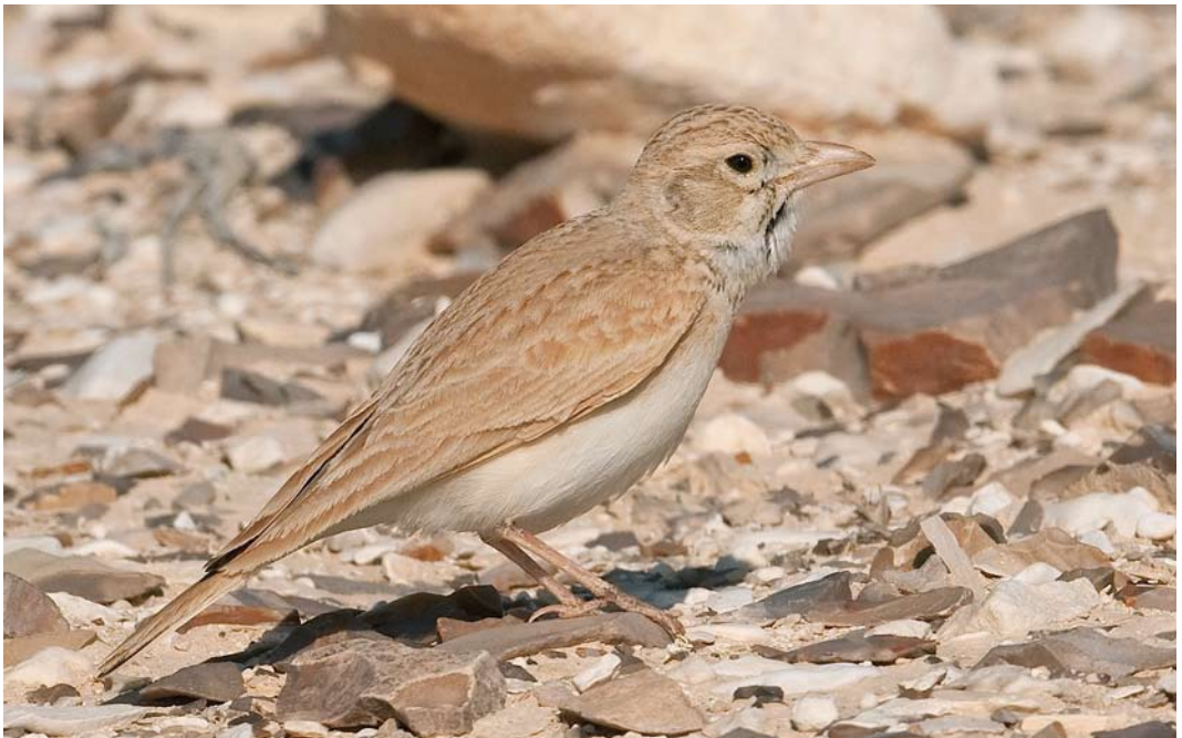
13 Arabian Dunn's Lark / Arabische Dunns Leeuwerik Eremalauda dumni eremodites , Arava valley, Israel, 14 April 2010 (Hadoram Shirihai)

Dunn's Lark is a poorly known nomadic lark breeding locally and discontinuously in remote parts of Central and North Africa and the southern Middle East (del Hoyo et al 2004). Two taxa are recognized: African Dunn's Lark E d dumni in Africa and Arabian Dunn's Lark E d eremodites in the Middle East. It has been suggested that these two may actually represent two species, based on distinctive morphometric differences; further studies into vocalizations and genetic differences are currently being undertaken and the results will be available soon (Hadoram Shirihai pers comm). All Israeli records refer to eremodites . Dunn's Lark is extremely rare in Israel, first recorded in the 1970s (ter Haar 1981, Shirihai 1996). In 1989, it bred in Israel for the first time, in the central Arava valley. This was a major breeding event that involved probably some 10s or 100s of pairs (Shirihai