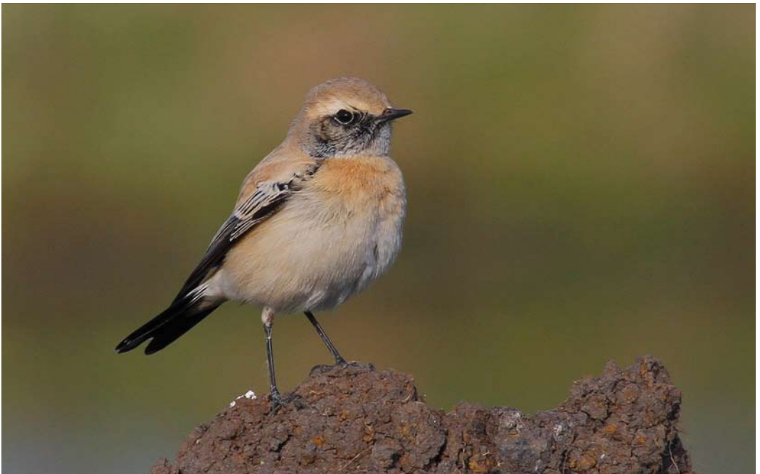
94 Woestijntapuit / Desert Wheatear Oenanthe deserti , mannetje, Ouderkerk aan de IJssel, Zuid-Holland, 12 november 2011 (Wietze Janse)