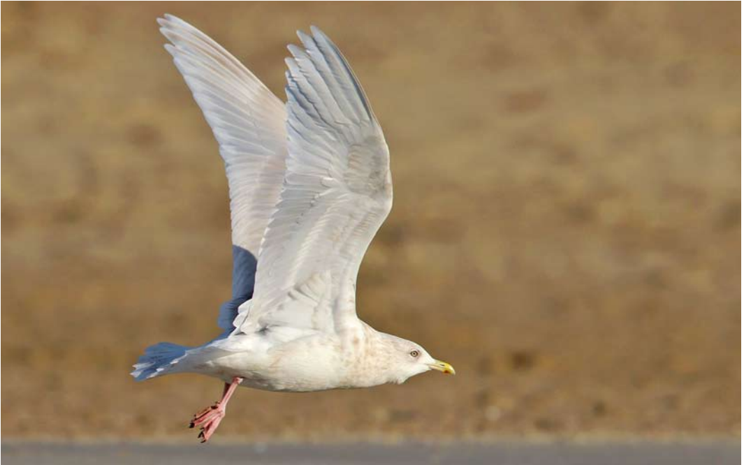
65 Kumlien's Gull / Kumliens Meeuw Larus glaucooides kumlieni , Zeebrugge, West-Vlaanderen, Belgium, 16 January 2012