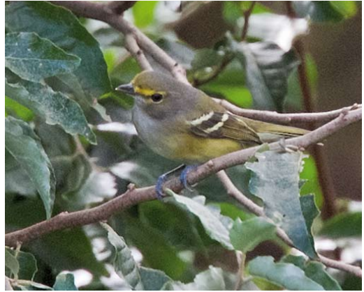
42 White-eyed Vireo / Witoogvireo Vireo griseus , first-year, Ribeira da Lapa, Corvo, Azores, 24 October 2008

west of the 'high fields' on Corvo's sloping eastern flank. Ribeira da Lapa is a small and relatively open valley (compared with other ribeiras on Corvo), the vegetation being dominated by laurel and hydrangea scrub and small cedars. Unfortunately, despite finding a Lesser Yellowlegs Tringa flavipes alongside the pools in the lower part of the valley, they had not detected any interesting passerines and, about halfway up the valley, PA headed south to work his way back through the fields as DS pushed on up the ribeira. Dropping back into the valley bottom, DS was struck by the increased amount of bird activity in this section and, after briefly stopping to take a photograph, settled down in a shady spot overlooking an area of scrub on the opposite side. After a short period scanning, a small, grey-headed passerine with double wing-bars and yellow underparts suddenly appeared amongst the laurel before, almost instantly, disappearing again.