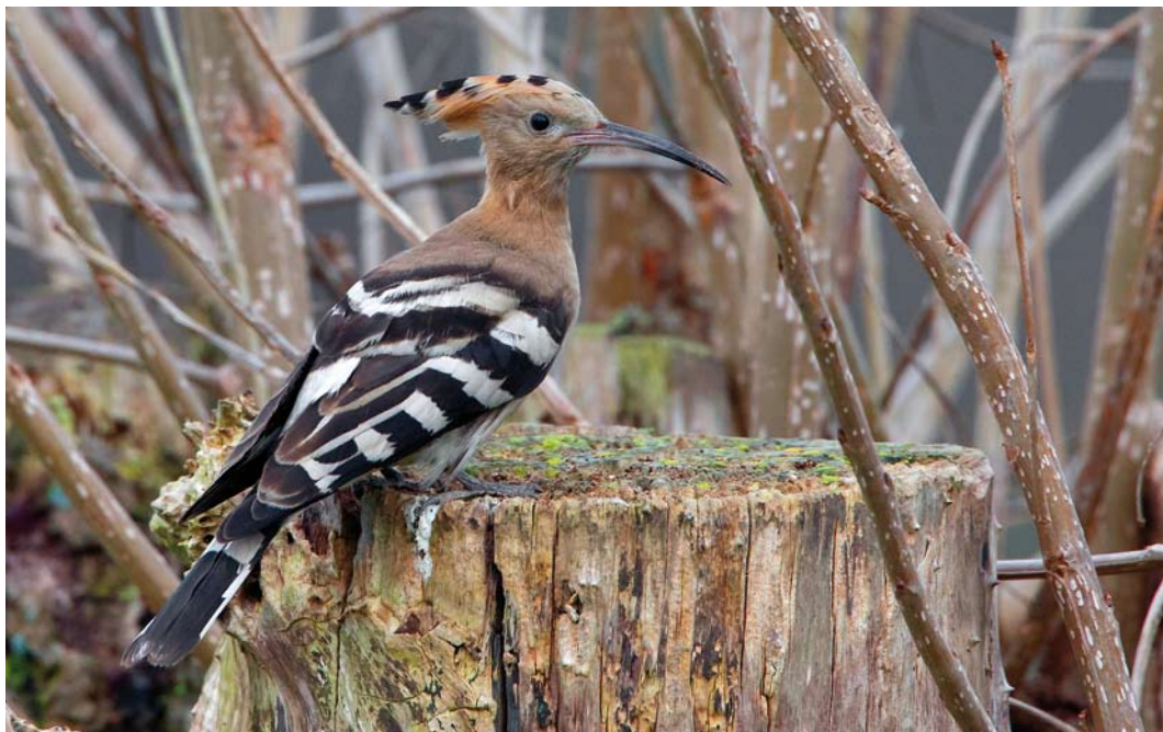
91 Hop / Eurasian Hoopoe Upupa epops , Edam, Noord-Holland, 24 november 2011 (Co van der Wardt)