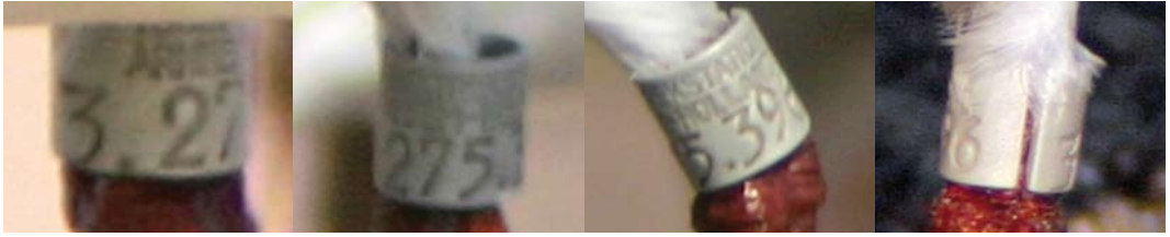
FIGURE 2 Aluminium ring Arnhem 3.275.396 on tibia of world's oldest Black-headed Gull Chroicocephalus ridibundus, Zoetermeer, Zuid-Holland, Netherlands, 16 March 2010 (far left) and 21 March 2011 (other three). Note almost absence of wear after more than 32½ years.