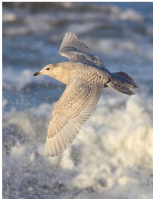
82 Grote Burgemeester / Glaucous Gull Larus hyperboreus , eerstejaars, Hondsbossche Zeewering, Petten, Noord-Holland, 17 december 2011 ( Cock Reijnders ) 83 Kleine Burgemeester / Iceland Gull Larus glaucoides , eerstejaars, Hondsbossche Zeewering, Petten, Noord-Holland, 10 december 2011 ( Cock Reijnders ) 84 Grote Burgemeester / Glaucous Gull Larus hyperboreus , eerstejaars, De Cocksdorp, Texel, Noord-Holland, 23 december 2011 ( René Pop )