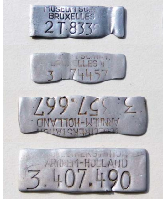
FIGURE 5 Aluminium rings removed from four Black-headed Gulls Chroicocephalus ridibundus breeding on Griend, Friesland, Netherlands (upper three on tarsus, lower on tibia). All trapped on nest and ring replaced by stainless steel ring, Arnhem 3.357.667 upside down; see text for details. Note irregular scalloping of lower edge.