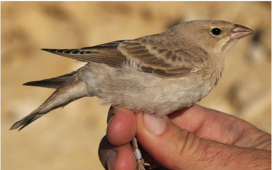
16 Pale Rockfinch / Bleke Rotsmus Carpospiza brachydactyla , juvenile, Negev, Israel, 9 June 2010 (Yoav Perlman)