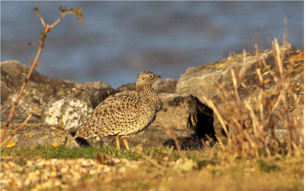
57 Little Bustard / Kleine Trap Tetrax tetrax , Verdrongen Land van Saeftinghe, Zeeland, Netherlands, 15 January 2012 (Peter L Meininger)