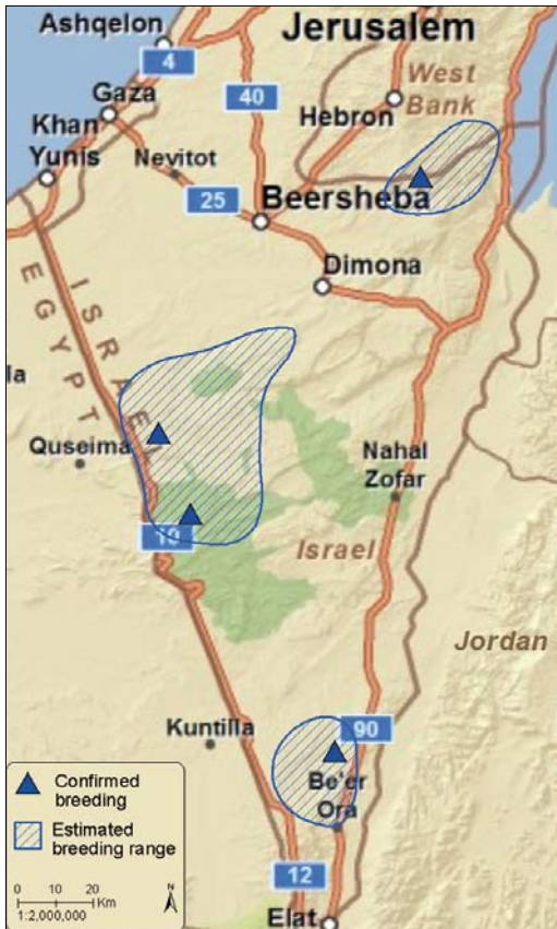
FIGURE 3 Breeding range of Pale Rockfinch Carpospiza brachydactyla in Israel in spring 2010

Post-breeding birds concentrated at drinking spots in the high Negev mountains, where 100s were noted in June-July 2010. Ringing efforts here produced 73 ringed birds (60 juveniles and 13 adults). All adults showed a similar pattern of arrested moult, with one to three moulted primaries, and none to two moulted secondaries (plate 17).