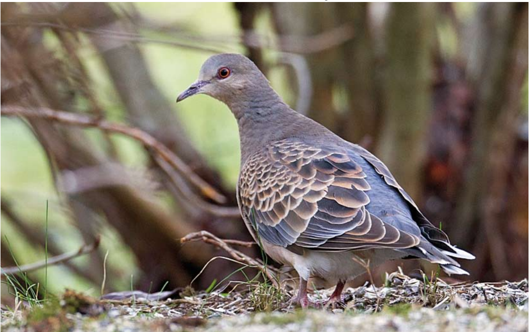
58 Rufous Turtle Dove / Meenatortel Streptopelia orientalis meena , first-year, Pello Nivanpää, Finland, 14 November 2011