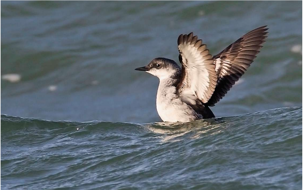
85 Zwarte Zeekoet / Black Guillemot Cephus grylle , eerstejaars, Brouwersdam, Zeeland, 27 november 2011 (Geert Lamers)