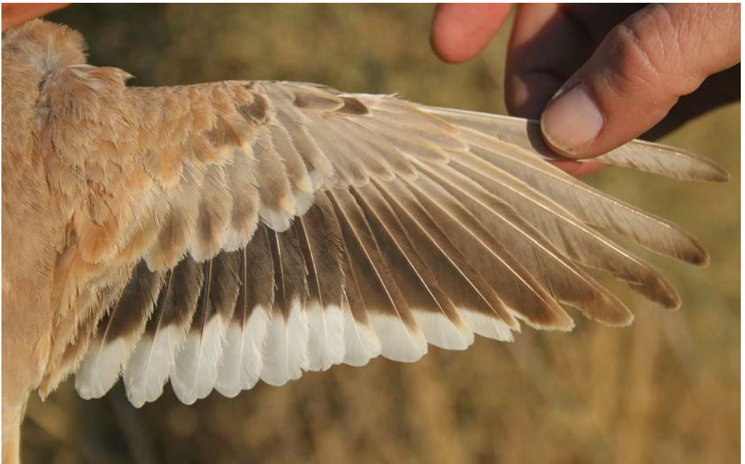
12 Thick-billed Lark / Diksnavelleeuwerik Ramphocoris clotbey , female, Negev, Israel, 14 February 2011 (Yosef Kiat)