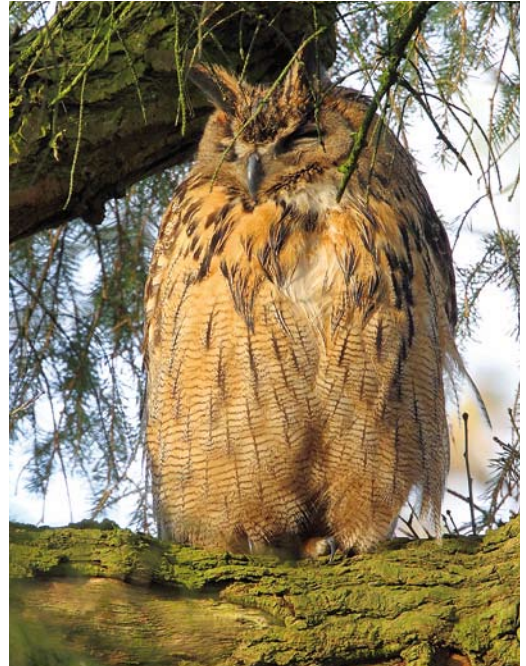
79 Gestreepte Strandloper / Pectoral Sandpiper Calidris melanotos , juveniel, Schoorkuilen, Limburg, 4 november 2011 80 Oehoe / Eurasian Eagle Owl Bubo bubo , Heiloo, Noord-Holland, 24 december 2011 81 Parelduiker / Black-throated Loon Gavia arctica , juveniel, Oudeschild, Texel, Noord-Holland, 26 december 2011