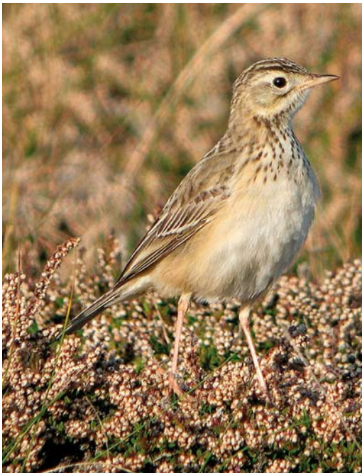
26-27 Blyth's Pipit / Mongoolse Pieper Anthus godlewskii , first-winter, Ouessant, Finistère, France, 14 October 2005 (Aurélien Audevard). Note upright stance.

Richard's Pipit is on average larger, heavier, longer tailed and longer legged and with a more powerful bill than Blyth's Pipit. Some of these features, such as tail length relative to the body, are better judged in flight when, because of its shorter tail, Blyth's can recall one of the smaller pipits. Richard's tends to adopt a more upright posture than Blyth's, similar to a small thrush. On the other hand, Blyth's usually looks smaller, lighter, shorter tailed, more compact and better proportioned, and does not usually adopt the upright stance as frequently as Richard's. It is important to note that some Blyth's can occasionally show a very erect, upright posture, too, as in Richard's (plate 26-27).