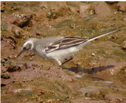
49-50 Citrine Wagtail / Citroenkwikstaart Motacilla citreola , first-year, Lugar de Baixo, Madeira, 10 September 2011

Enno B Ebels, Joseph Haydnlaan 4, 3533 AE Utrecht, Netherlands ( ebels@wxs.nl )