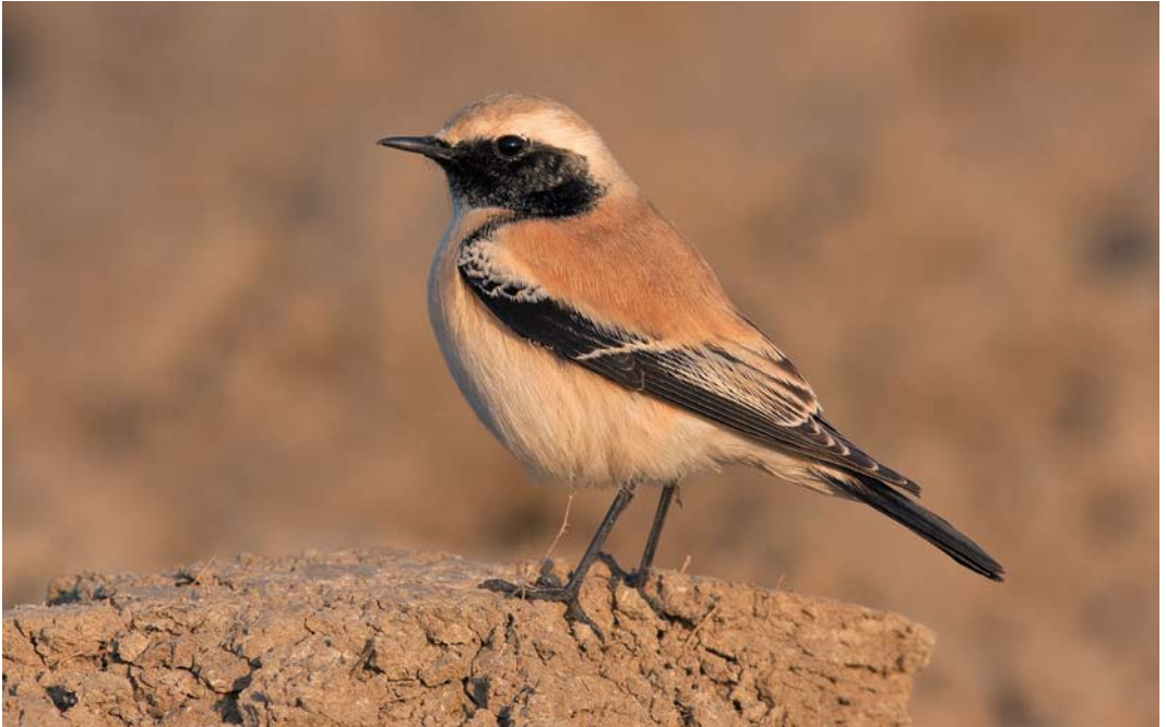
93 Woestijntapuit / Desert Wheatear Oenanthe deserti , mannetje, Burghsluis, Zeeland, 12 november 2011