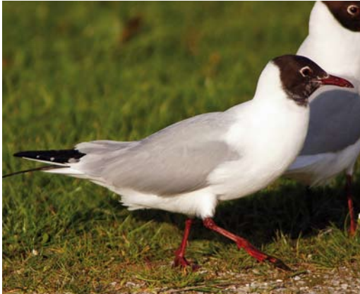
30 Black-headed Gull / Kokmeeuw Chroicocephalus ridibundus , Benthuizenplas, Zoetermeer, Zuid-Holland, Netherlands, 8 May 2009 (Benny Middendorp). Same bird as in plate 28 and 31. Note incomplete summer plumage.