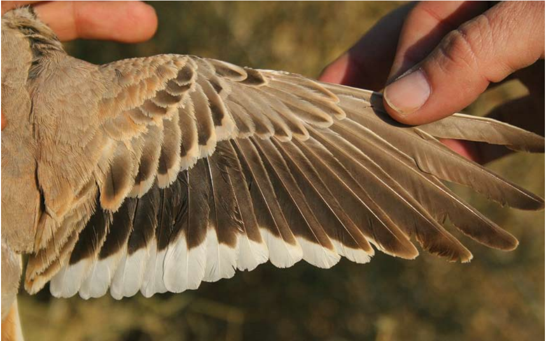
11 Thick-billed Lark / Diksnavelleeuwerik Ramphocoris clotbey , male, Negev, Israel, 14 February 2011 (Yosef Kiat)