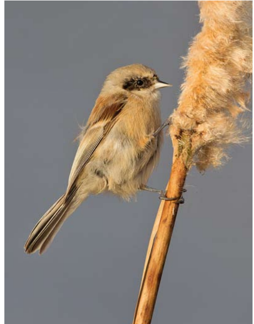
101 Buidelmees / Eurasian Penduline Tit Remiz pendulinus , Klaas Hennepoelpolder, Warmond, Zuid-Holland, 29 november 2011 (René van Rossum)

24 december in Meijndel; en op 30 en 31 december in de Amsterdamse Waterleidingduinen bij De Zilk, Zuid-Holland. Een late Sperwergrasmus Sylvia nisoria verbleef op 6 november in De Tuintjes bij De Cocksdorp. Een overwinterende Grasmus S communis verbleef van 23 november tot in januari in Utrecht, Utrecht. Opmerkelijk was ook een late Kleine Karekiet Acrocephalus scirpaceus op 26 november op de noordpunt van Texel. De enige Graszanger Cisticola juncidis van deze periode werd op 14 november gemeld bij Nieuwvliet-Bad in Zeeuws-Vlaanderen, Zeeland.