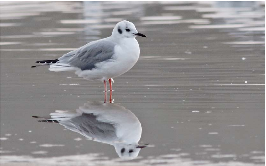
66 Bonaparte's Gull / Kleine Kokmeeuw Chroicocephalus philadelphia , Hirtshals, Nordjylland, Denmark, November 2011