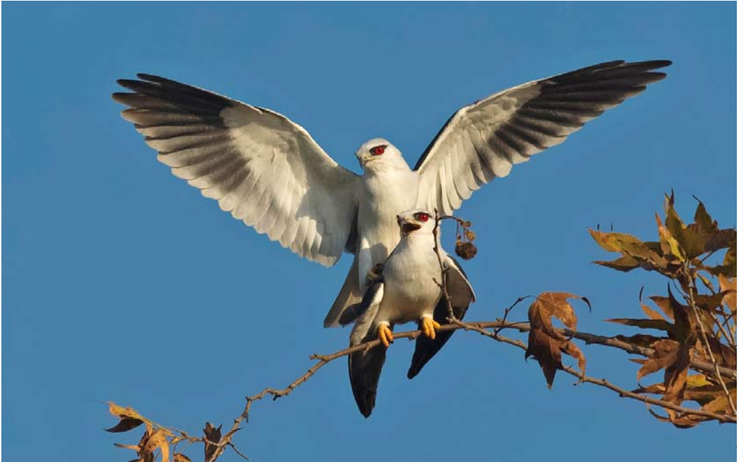
52 Black-winged Kites / Grijze Wouwen Elanus caeruleus , Agmon lake, Israel, 27 November 2011 cf Dutch Birding 33: 398, 2011 53 Greater Yellowlegs / Grote Geelpootruiter Tringa melanoleuca , first-year, Hauxley, Northumberland, England, 18 November 2011 54 Gyr Falcon / Giervalk Falco rusticolus , first-year, Oostburg, Zeeland, Netherlands, 7 January 2012