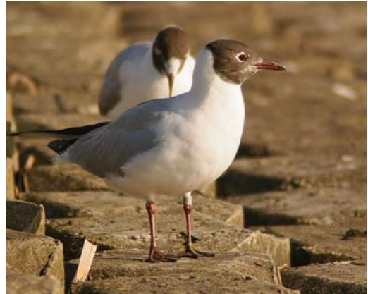
31 Black-headed Gull / Kokmeeuw Chroicocephalus ridibundus , Benthuizenplas, Zoetermeer, Zuid-Holland, Netherlands, 16 March 2010 (Benny Middendorp). Same bird as in plate 28 and 30. Note strong similarity in pattern of hood in the three different years.

measurements were taken: weight 294 g, wing length 306 mm, total head-and-bill length 82.7 mm, tarsus length 44.9 mm, and bill depth at gonys 8.8 mm. The bird was in full adult summer plumage and based on its measurements it was a male (Palomares et al 1997). The aluminium ring (figure 1) was replaced by a stainless steel ring (Arnhem 3.557.150) and the bird was released with a colour-ring 'white LCA' on the left tarsus. This colour-ring enabled Klaas van Dijk and RO to identify LCA on 12 other days between 5 and 29 May 2000, and again on 10 days between 8 May and 5 June 2001. In 2001, this bird was also in full adult summer plumage. Most observations were carried out when it was sitting on the beacon of Griend, in the centre of the breeding colony (plate 32), but we did not try to locate its nest exactly. However, it was seen landing near the beacon, and it showed territorial behaviour on the landing