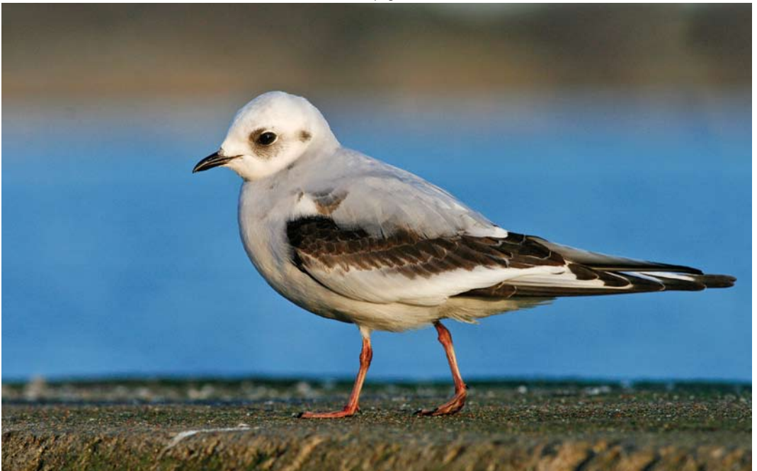
68 Ross's Gull / Ross' Meeuw Rhodostethia rosea , first-winter, Öckerö, Bohuslän, Sweden, 30 December 2011