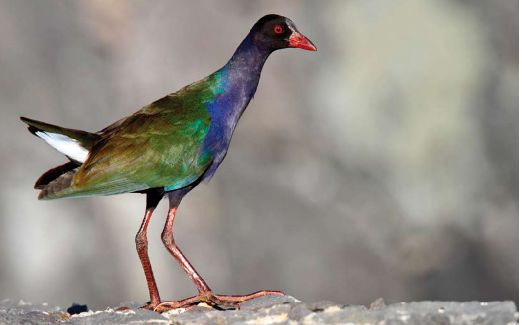
55 Allen's Gallinule / Afrikaans Purperhoen Porphyrio alleni , adult, Tías, Lanzarote, Canary Islands, 4 January 2012 ( Juan Sagardía Pradera )