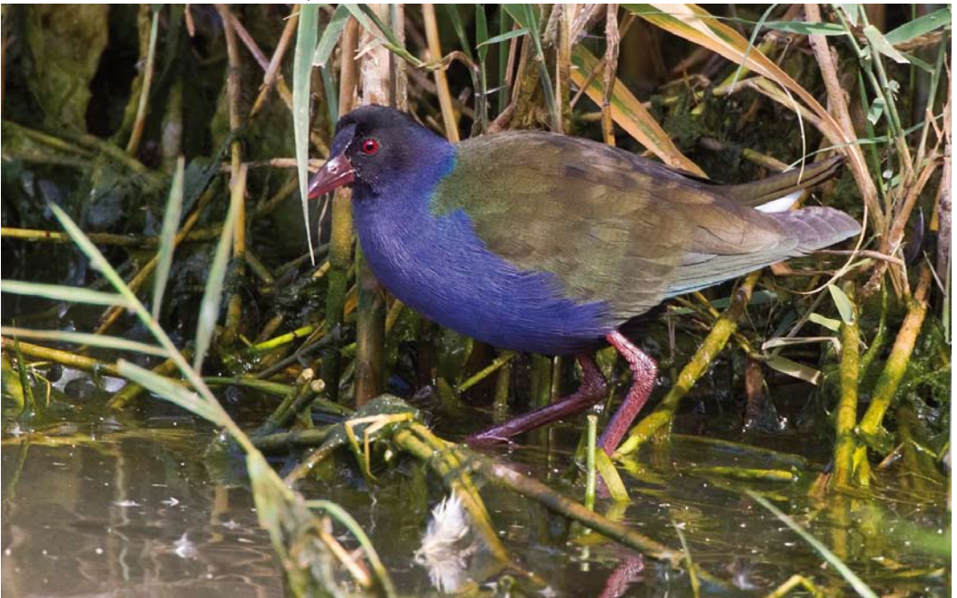
56 Allen's Gallinule / Afrikaans Purperhoen Porphyrio alleni , adult, Catalina Garcia, Fuerteventura, Canary Islands, 9 December 2011