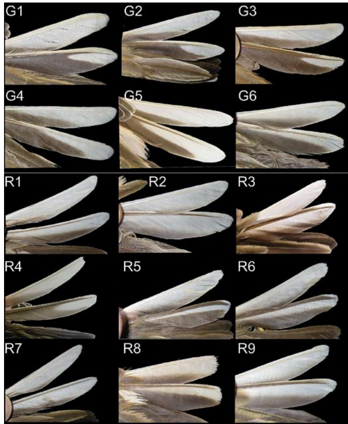
FIGURE 2 Variation in outermost tail-feathers of Richard's Pipit Anthus richardi (R) and Blyth's Pipit A. godlewskii (G) (David Vieites). G1-6 A. godlewskii . R1-4 A. r. richardi . R5-6 atypical A. r. centralasiae . R7 A. r. ussuriensis . R8-9 A. r. sinensis . G1-4 show typical pattern of t5-6 in Blyth's, with some specimens having more white on t5 (G5-G6). R8-9 examples of Richard's where pattern and amount of white resemble atypical Blyth's of G5-6.

Tail pattern is a supporting feature for separating Richard's Pipit and Blyth's Pipit but it should be used with care as there is a certain degree of overlap (Svensson 1992, cf van den Berg et al 1993). The pattern of the outer tail-feather (t6) and the outer web of the second outermost tail-feather (t5) in both species are similar, being mostly white, but with some birds showing a variable degree of brown. Figure 2 shows examples of the variation in t5-6 in both species from a large series of skins at Natural History Museum in Tring, England, and Museum für Naturkunde, Berlin, Germany. In Blyth's, the white on the inner web of t5 never extends to the base of the feather, unlike the most common pattern in Richard's. The variation on t5 and t6 in Richard's is substantial; t5 and t6 usually have much white, with a typical pattern on the