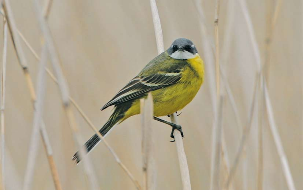
37-38 Witkeelkwikstaart / White-throated Wagtail Motacilla cinereocapilla , mannetje, Makkum, Friesland, 5 mei 2004 ( Bas van den Boogaard )