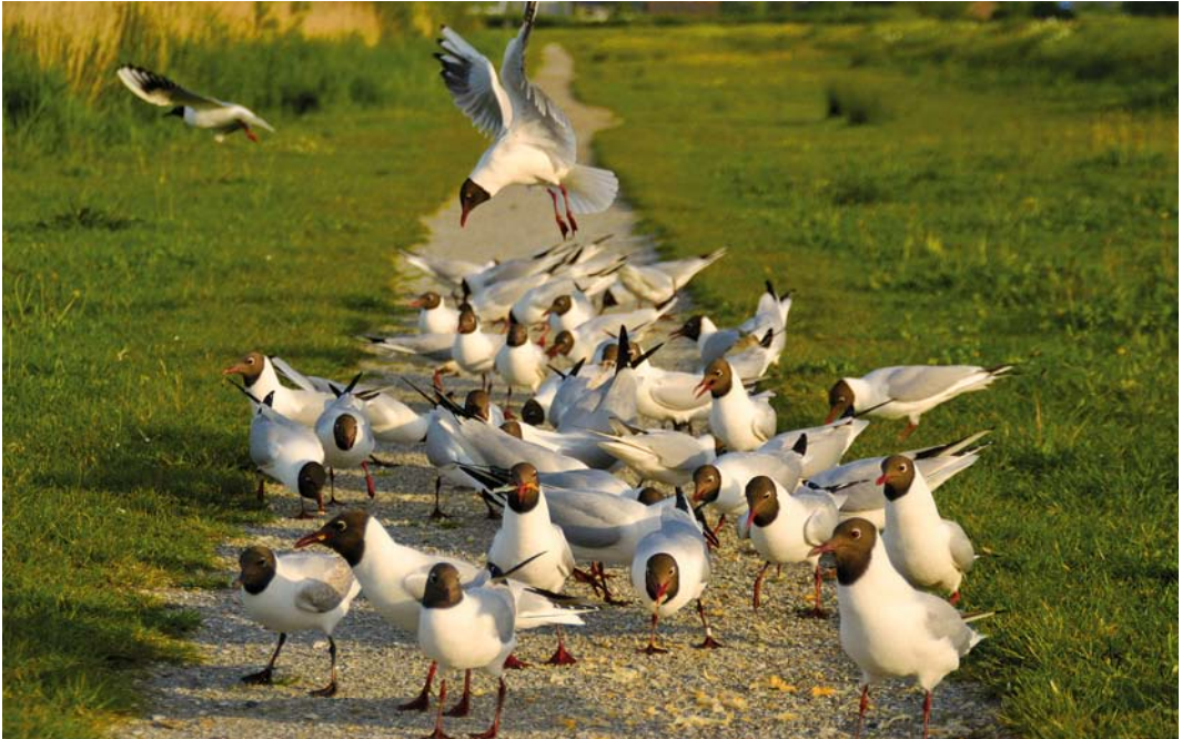
29 Black-headed Gulls / Kokmeeuwen Chroicocephalus ridibundus , Zoetermeer, Zuid-Holland, Netherlands, 20 May 2009 ( Benny Middendorp ). Birds of nearby Benthuiserplas breeding colony after being lured by food. World's oldest Black-headed Gull (plate 28) often recorded at this site.

food to an open area near the colony; see Middendorp (2009) for details. On that day, BM saw a ringed adult with an unfamiliar ring number and he could read the inscription (Arnhem 3.275.396) with his telescope. BM observed the bird at Benthuiserplas on 11 other days in 2009, two days in April, five in May, and four in June, with 22 June as the last day. The bird behaved like other local breeding birds but it attained no full adult summer plumage. Observations were not carried out inside the breeding colony, so it is unknown if it held a breeding territory or if it had a nest. The bird returned to Benthuiserplas on five days between 16 March and 8 April 2010, and again on 21 March 2011 (plate 28). Other sightings are lacking, despite extensive visits (at least twice a week by a few people) in the period March-July in 2010 and 2011, and there are no other records of this individual. BM was able to obtain several photographs and video images.