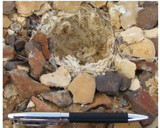
2 Thick-billed Larks / Diksnavelleeuweriken Ramphocoris clotbey , male and female in courtship display, Negev, Israel, 31 March 2010 (Thomas Krumenacker) 3 Thick-billed Lark / Diksnavelleeuwerik Ramphocoris clotbey , male with food for nestlings, Arava valley, Israel, 18 April 2010 (Yoav Perlman) 4 Nest of Thick-billed Lark / Diksnavelleeuwerik Ramphocoris clotbey after breeding, Arava valley, Israel, 10 May 2010 (Yoav Perlman)

Alterman & Barak Granit pers comm; plate 1). Such tight flocks of males have not been documented before. Another impressive concentration during this period occurred at Hameyshar plains with up to 250 birds in February 2011. This site had received large amounts of rain during the previous winter, and as a result large amounts of seeds remained on the ground and probably helped to support this large population.