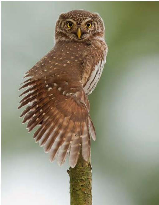
69 Eurasian Pygmy Owl / Dwerguil Glaucidium passerinum , Ullerup Skov, Nordsjælland, Denmark, December 2011 (Johnny Salomonsson)

year). In Spain, an adult was photographed at Lires, Fisterra, A Coruña, on 28 December. The first and second Kumlien's Gulls L glaucooides kumlieni for Denmark, if accepted, were an adult at Blåvands Huk, Syddanmark, and a fourth calendar-year at Hanstholm, Thisted, Nordjylland, both found on 8 January. The second for Belgium was photographed at Zeebrugge, West-Vlaanderen, from 16 January. The adult Forster's Tern Sterna forsteri in Galway, Ireland, remained into January. On 28 December, eight African Skimmers Rynchops flavirostris were seen just south of Kom Ombo, Egypt.