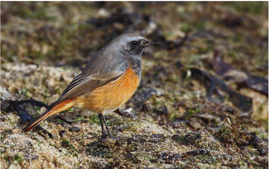
72 Eastern Black Redstart / Oosterse Zwarte Roodstaart Phoenicurus ochruros phoenicuroides , first-year male, Margate, Kent, England, 15 November 2011 ( James A Hanlon )