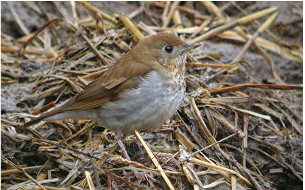
74 Veery / Veery Catharus fuscescens , Muck, Highland, Scotland, 18 November 2011 (Steve Nuttall)