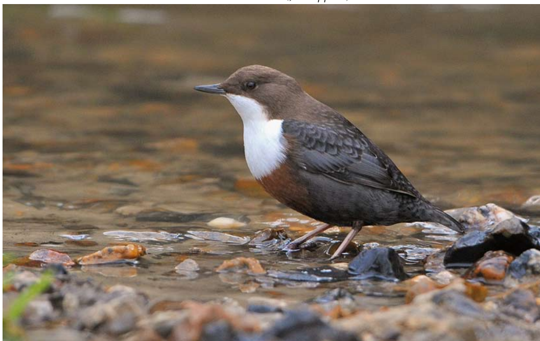
92 Roodbuikwaterspreeuw / Red-bellied Dipper Cinclus cinclus aquaticus , St Gerlach, Valkenburg, Limburg, 18 december 2011 (Jos Keppens)