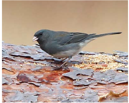
76 Dark-eyed Junco / Grijsje Junco Junco hyemalis , Hawkhill Inclosure, Beaulieu, Hampshire, England, 7 January 2012 (Kris De Rouck)

hybrid between Collared x European Pied Flycatcher F. albicollis x hypoleuca based on a partial neck collar and other intermediate characters, turned out to be a pure European Pied; therefore, it is suggested that a neck collar may be a shared ancestral character of pied flycatcher species occasionally expressed in populations that normally lack it (J Ornithol 152: 1069-1073, 2011). This example shows that certain plumage features may not always be as diagnostic as assumed; for a few other examples of presumed atavism in WP birds see, eg, Dutch Birding 5: 26-27, 1983.