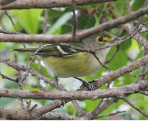
43 White-eyed Vireo / Witoogvireo Vireo griseus , first-year, Ribeira da Ponte, Corvo, Azores, 18 October 2009 (Edward Vercruyse)