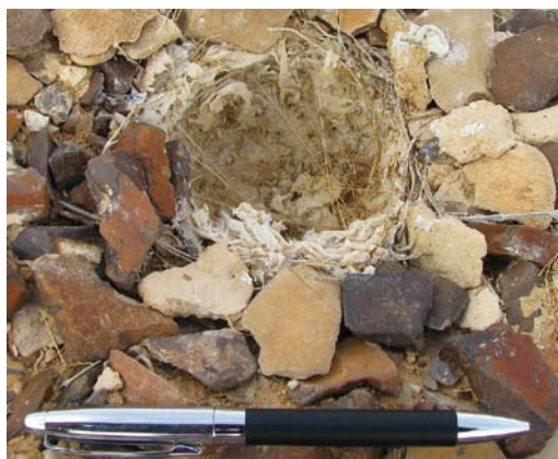
2 Thick-billed Larks / Diksnavelleeuweriken Ramphocoris clotbey , male and female in courtship display, Negev, Israel, 31 March 2010 (Thomas Krumenacker) 3 Thick-billed Lark / Diksnavelleeuwerik Ramphocoris clotbey , male with food for nestlings, Arava valley, Israel, 18 April 2010 (Yoav Perlman) 4 Nest of Thick-billed Lark / Diksnavelleeuwerik Ramphocoris clotbey after breeding, Arava valley, Israel, 10 May 2010 (Yoav Perlman)

Alterman & Barak Granit pers comm; plate 1). Such tight flocks of males have not been documented before. Another impressive concentration during this period occurred at Hameyshar plains with up to 250 birds in February 2011. This site had received large amounts of rain during the previous winter, and as a result large amounts of seeds remained on the ground and probably helped to support this large population.