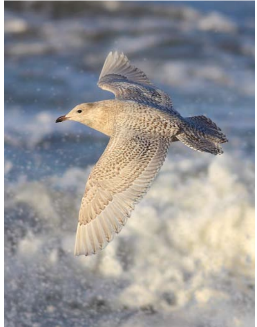
82 Grote Burgemeester / Glaucous Gull Larus hyperboreus , eerstejaars, Hondsbossche Zeewering, Petten, Noord-Holland, 17 december 2011 (Cock Reijnders) 83 Kleine Burgemeester / Iceland Gull Larus glaucoides , eerstejaars, Hondsbossche Zeewering, Petten, Noord-Holland, 10 december 2011 (Cock Reijnders) 84 Grote Burgemeester / Glaucous Gull Larus hyperboreus , eerstejaars, De Cocksdorp, Texel, Noord-Holland, 23 december 2011 (René Pop)