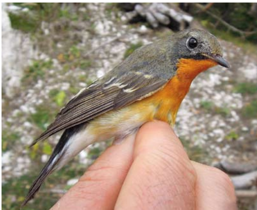
45-46 Mugimaki Flycatcher / Mugimakivliegenvanger Ficedula mugimaki , first-year male, Passo della Berga, Brescia, Italy, 6 October 2011

sembling a Red-breasted Flycatcher Ficedula parva , because of the orange underparts and greyish upperparts. The ringers realized that it was not this species but they did not have direct access to electricity and internet (due to the remote position in the mountains) and, therefore, it took some time before the correct identification was established. RB sent some photographs to Ottavio Janni, who helped to identify the bird as a first-year male Mugimaki Flycatcher F mugimaki .