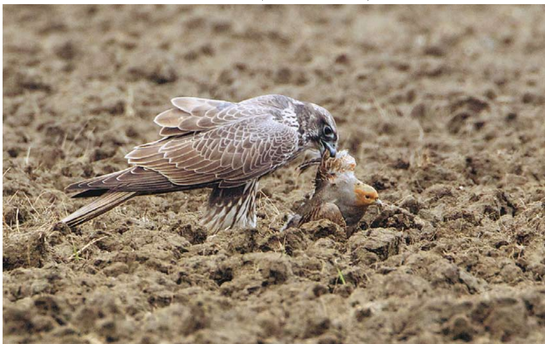
175 Giervalk / Gyrfalcon Falco rusticolus , eerstejaars, met Patrijs / Grey Partridge Perdix perdix , Hoek, Zeeland, 24 februari 2012 (Martin van der Schalk)