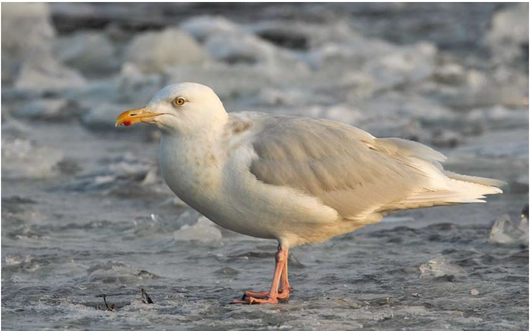
181 Grote Burgemeester / Glaucous Gull Larus hyperboreus , adult, Urk, Flevoland, 7 februari 2012 (Edwin Winkel)