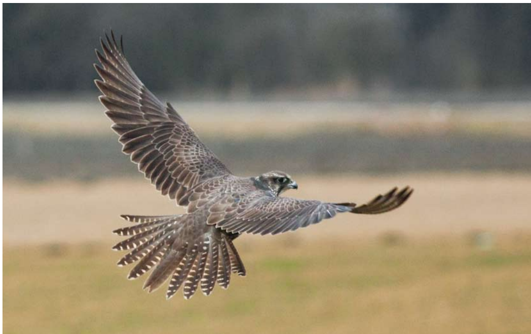
174 Giervalk / Gyrfalcon Falco rusticolus , eerstejaars, Hoek, Zeeland, 19 februari 2012 (Garry Bakker)