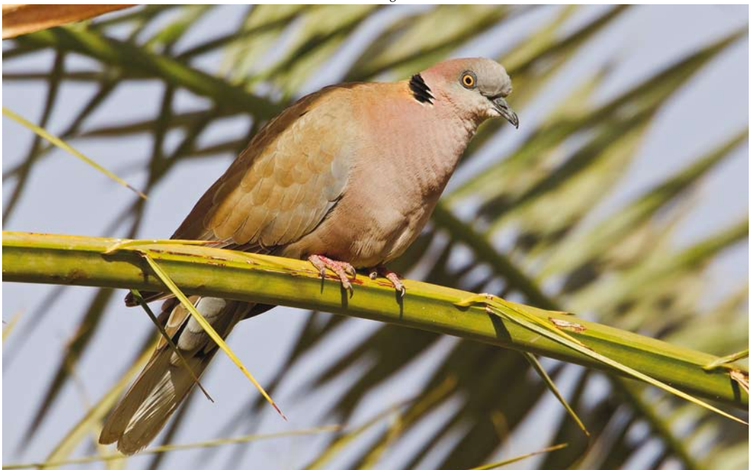
143 Mourning Collared Dove / Treurtortel Streptopelia decipiens , Abu Simbel, Egypt, 9 January 2012 ( Vincent Legrand )