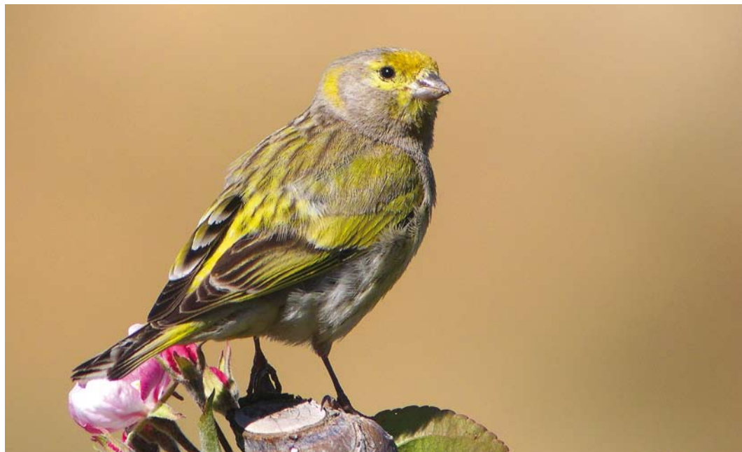
112 Syrian Serin / Syrische Kanarie Serinus syriacus , male, Bloudan, Syria, 30 April 2006. Age of this bird cannot be determined for certain since alula feathers and primary coverts are invisible. Note that tertials of left wing have been moulted, obviously as a result of some accident.

binnenste en de twee buitenste oude duimvleugelveren zeer opvallend; indien geen enkele duimvleugelver is geruid (en er dus geen contrast zichtbaar is), zijn alle drie duimvleugelveren sterk gesleten en hebben een bruin centrum (duimvleugelveren van adulte zijn duidelijk minder gesleten en met een zwarter centrum).