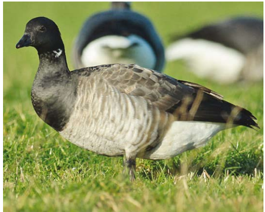
120-121 Presumed hybrid Pale-bellied x Dark-bellied Brent Goose / vermoedelijke hybride Witbuikrotgans x Rotgans Branta hrota x bernicla , adult, Bantpolder, Lauwersmeer, Friesland, Netherlands, 21 February 2009 ( Rik Winters ) 122-123 Presumed hybrid Pale-bellied x Dark-bellied Brent Goose / vermoedelijke hybride Witbuikrotgans x Rotgans Branta hrota x bernicla , adult, Smerp, Noord-Holland, Netherlands, 28 December 2009 ( Fred Visscher ). Different birds.

2009 near Ezumazijl, Friesland. Based on the intermediate appearance, the three birds were presumed to be hybrids Pale-bellied x Dark-bellied Brent Goose, although this is probably not more than a best guess. In all cases, also the possibility of 'Gray-bellied Brant' (cf Garner & Millington 2001, Garner & friends 2008; see also below) was suggested, and the birds were judged by some birders who were asked to comment to be pale Dark-bellied Brent Geese, or dark Pale-bellied Brent Geese (with last two options remarkably depending strongly on the species being most frequent in the commentators' country of residence...).