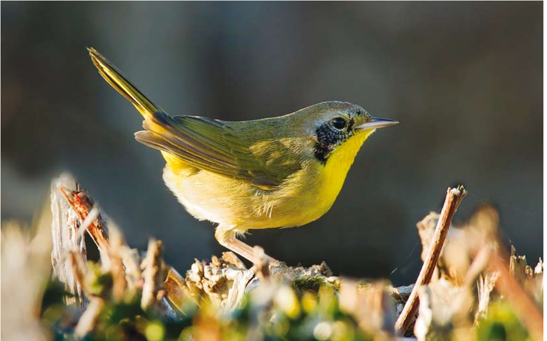
168 Common Yellowthroat / Gewone Maskerzanger Geothlypis trichas, second calendar-year male, Rhiwderyn, Gwent, Wales, 25 February 2012