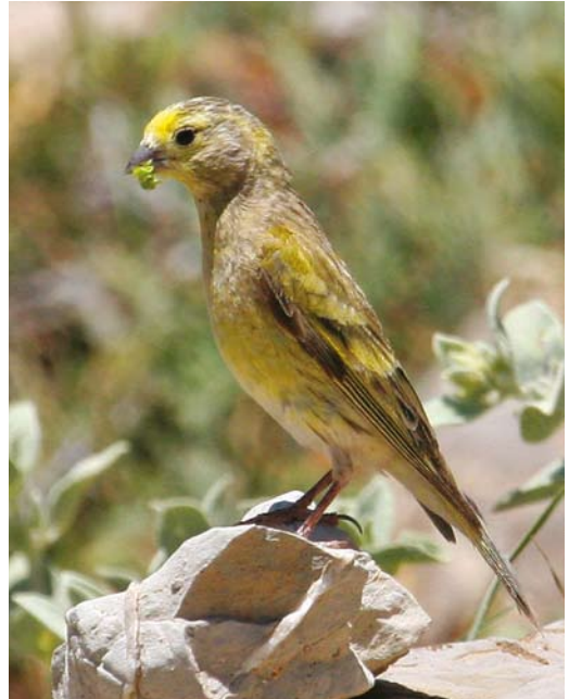
110 Syrian Serin / Syrische Kanarie Serinus syriacus , second-year female, mount Hermon, Israel, 29 May 2008 (Lior Kislev). Note brownish and worn alula feathers and primary coverts, lacking yellowish edges and grey tip.

birds, having both adult-type feathers and some old retained juvenile feathers; and 3 adults (third calendar-year or older) of which all feathers are similar in age and pattern.