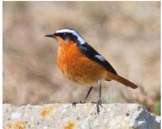
170 Glaucous Gull / Grote Burgemeester Larus hyperboreus , first-winter, with Yellow-legged Gull / Geelpootmeeuw L. michahellis , first-winter, Lagune de Khnifiss, Western Sahara, Morocco, 15 January 2012 (Arnoud B van den Berg/The Sound Approach) 171 Ross's Gull / Ross' Meeuw Rhodostethia rosea , first-winter, Molfetta, Puglia, Italy, 23 February 2012 (Angelo Nitti) 172 Isabelline Wheatear / Izabeltapuit Oenanthe isabellina , Âit-Labbès, Eastern High Atlas, Morocco, 13 March 2012 (Arnoud B van den Berg/The Sound Approach) 173 Moussier's Redstart / Diadeemroodstaart Phoenicurus moussieri , male, Tarifa, Cádiz, Spain, 17 March 2012 (Javier Elorriaga)

discovered at Maasbracht, Limburg, the Netherlands, on 23 February and seen across the Belgian-Dutch border at, eg, Kessenich and Maaseik, Limburg, Belgium, from 28 February into March (and again occasionally on the Dutch side of the border from 7 March). During the International Gull Meeting at Zagreb, Croatia, on 16-19 February, a possible Heuglin's Gull L. heuglini and three Great Black-backed Gulls L. marinus (only seven previous records) were found at the Jakuševac dump. The identification of a third-winter ' herring gull ' at Den Oever, Noord-Holland, from 22 January into March was much debated, as its characters did not exclude Smithsonian Gull L. smithsonianus ; analysis of DNA taken from its droppings, however, indicated it concerned a Herring Gull L. argentatus (Peter de Knijff in litt). In Spain, the adult Smithsonian Gull at Lires, Fisterra, A Coruña, from 28 December 2011 was still present on 22 February.