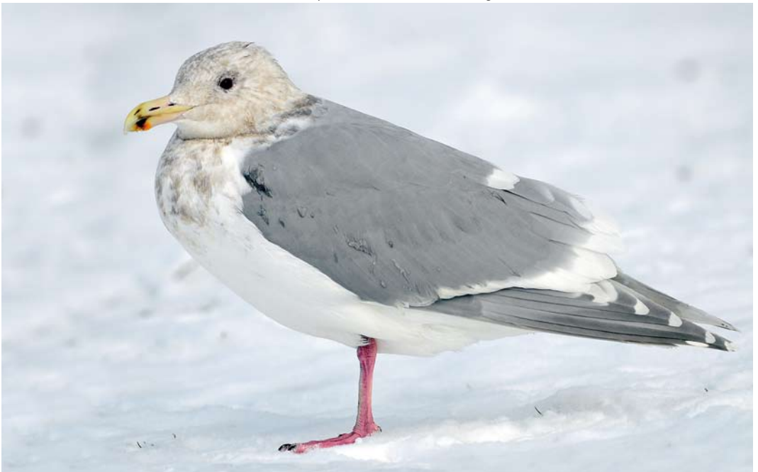
155 Glaucous-winged Gull / Beringmeeuw Larus glaucescens , adult, Århus, Nordjylland, Denmark, 3 February 2012