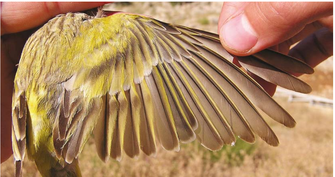
107 Syrian Serin / Syrische Kanarie Serinus syriacus , adult (third calendar-year or older) male, mount Hermon, Israel, July 2007. Most feathers moulted c 1 year before, at same period. As a result, these feathers have same basic colour, abrasion and pattern (compare with plate 106). Note that all fresh feathers, including fresh/growing inner primaries, are part of this bird's post-breeding moult that had started just few weeks before this wing was photographed, and are not part of the discussed moult pattern.