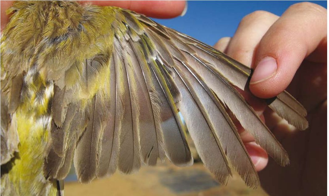
106 Syrian Serin / Syrische Kanarie Serinus syriacus , second calendar-year female, mount Hermon, Israel, 19 July 2008 (Yael Lehnardt). All retained feathers, especially primaries, extensively worn and browner than adult-type feathers (compare with plate 107). Note that all fresh feathers, including fresh/growing inner primaries and primary coverts, are part of this bird's first post-breeding moult that had started just few weeks before this wing was photographed in July, and are not part of the discussed moult pattern.