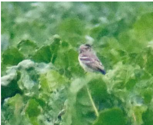
118 Hybride Citroenkwikstaart x Gele Kwikstaart / hybrid Citrine x Blue-headed Wagtail Motacilla citreola x flava , juveniel, Zeewolde, Flevoland, 16 juli 2011

Ook van 19 tot 22 juli verzamelden beide ouders voedsel voor de jongen maar de frequentie van de voedselvluchten lag aanzienlijk lager dan in de voorgaande dagen. Opvallend was dat het mannetje meerdere pogingen deed om overvliegende Torenvalken Falco tinnunculus te verjagen en daarin soms werd bijgestaan door Gele Kwikstaarten die in de nabijheid nestelden. Ook werd waargenomen hoe het mannetje kortstondig boven de bietenplanten een luchtgevecht aanging met een mannetje Gele Kwikstaart. De jongen verbleven nog steeds hoofdzakelijk op de grond en lieten zich nauwelijks bekijken. De ouders zaten langdurig boven in het gewas om pas na veelvuldige verplaatsingen met het verzamelde voedsel naar de grond te vliegen om daar, buiten beeld, de jongen te voeren.