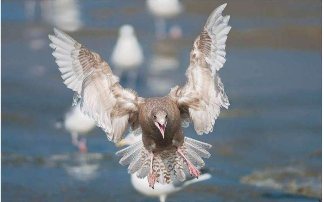
180 Grote Burgemeester / Glaucous Gull Larus hyperboreus , eerste-winter, paal 29, Texel, Noord-Holland, 6 maart 2012