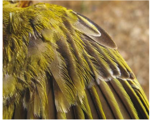
104 Syrian Serin / Syrische Kanarie Serinus syriacus , second calendar-year female, mount Hermon, Israel, 15 August 2008 (Yael Lehnardt). All alula feathers and three outer greater coverts juvenile, with rusty fringes, and more strongly worn. Unmoulted outer primary coverts also worn and brownish. Note that two new inner primaries and primary coverts are part of this bird's first post-breeding moult that has started just few weeks before this wing was photographed in July, and are not part of the discussed moult pattern. 105 Syrian Serin / Syrische Kanarie Serinus syriacus , adult male, mount Hermon, Israel, 18 July 2008 (Yael Lehnardt). All alula feathers from same moult period, having blackish centre and yellow fringes. Primary coverts neatly tipped pure grey. Compare with plate 103 and 104.

ing the winter since they had no more than only one or two different wear and colour patterns in their wings. Feathers that had been replaced due to accidental loss in winter, evident because they were the least worn and not symmetrically moulted, were not included in our analysis.