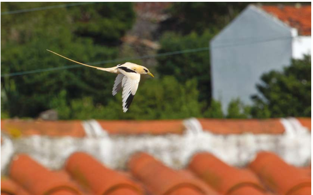
136 White-tailed Tropicbird / Witstaartkeerkringvogel Phaethon lepturus , adult, Fajãzinha, Flores, Azores, 15 October 2011 ( David Monticelli )