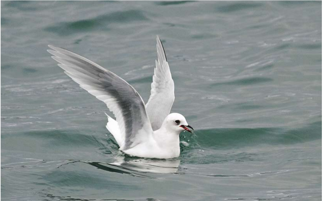
154 Ross's Gull / Ross' Meeuw Rhodostethia rosea , adult, Ardglass, Down, Ireland, 24 January 2012