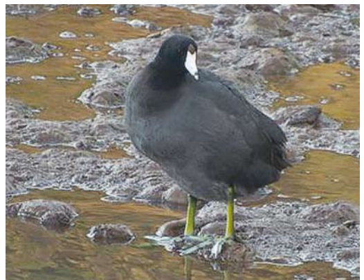
159 Black-throated Accentor / Zwartkeelheggenmus Prunella atrogularis , Gingen, Baden-Württemberg, Germany, 20 January 2012 160 Wallcreeper / Rotskruiper Tichodroma muraria , Sint Pietersberg, Maastricht, Limburg, Netherlands, 6 March 2012 161 Pine Bunting / Witkopgors Emberiza leucocephalos , male, with Yellowhammer / Geelgors E. citrinella , Gattererberg, Zillertal, Tirol, Austria, 9 March 2012 162 African Dunn's Lark / Afrikaanse Dunns Leeuwerik Eremalauda dunnii dunnii , Oued Jenna, Aousserd, Western Sahara, Morocco, 10 January 2012 163 Citrine Wagtail / Citroenkwikstaart Motacilla citreola , Aswan, Egypt, 5 February 2012 164 American Coot / Amerikaanse Meerkoet Fulica americana , Lugar de Baixo, Madeira, 20 January 2012