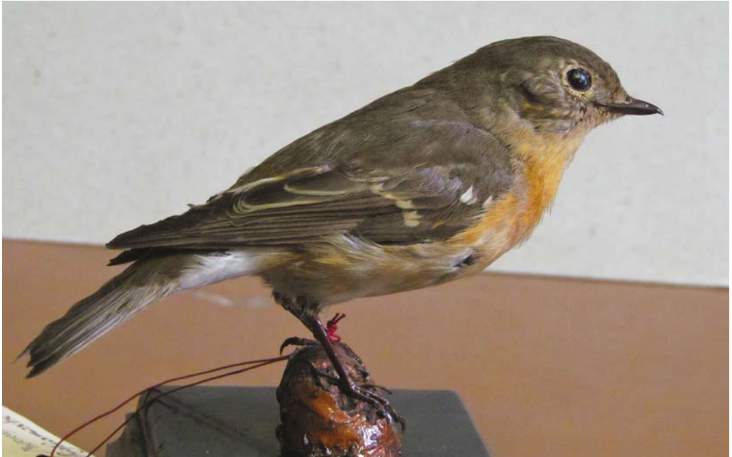
147 Mugimaki Flycatcher / Mugimakivliegenvanger Ficedula mugimaki , first-winter female (collected at San Vendemiano, Treviso, Italy, on 29 October 1957), Museum Brandolini Giol, Oderzo, Treviso, January 2012

presented here and represent the first colour photographs of this individual to be published. The all-dark tail clearly indicates this is a female (lacking the white patches on the outer tail shown by males), as do the pale yellowish underparts (deeper orange in male). The pale tips to the median and greater coverts indicate that it is a first-year bird. The good condition of the specimen (in particular wing- and tail-feathers and bare parts) visible in plate 146-147 was noted by Giol (1959) as an indication of a presumed wild origin.