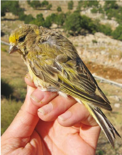
109 Syrian Serin / Syrische Kanarie Serinus syriacus , second calendar-year male, mount Hermon, Israel, 18 July 2008 (Yael Lehnardt). Despite colourful appearance, this bird can be aged by retained juvenile alula feathers and by worn primaries.