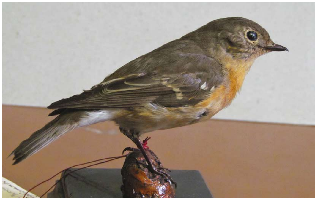
147 Mugimaki Flycatcher / Mugimakivliegenvanger Ficedula mugimaki , first-winter female (collected at San Vendemiano, Treviso, Italy, on 29 October 1957), Museum Brandolini Giol, Oderzo, Treviso, January 2012

presented here and represent the first colour photographs of this individual to be published. The all-dark tail clearly indicates this is a female (lacking the white patches on the outer tail shown by males), as do the pale yellowish underparts (deeper orange in male). The pale tips to the median and greater coverts indicate that it is a first-year bird. The good condition of the specimen (in particular wing- and tail-feathers and bare parts) visible in plate 146-147 was noted by Giol (1959) as an indication of a presumed wild origin.