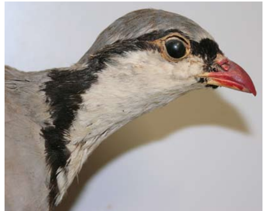
131-132 Italian Rock Partridge / Italiaanse Steenpatrijs Alectoris graeca orlandoi , adult (collected at Molise, Apennines, Italy, November 2007), Università di Scienze Naturali del Molise, Pesche, Campobasso, Italy (Andrea Corso). Same bird as in plate 126, 129 and 133. Note very pale underparts, typical of most birds (but few of the southernmost part of the range in Calabria), with almost apricot-tinged belly/vent, as well as quite pale, almost apricot undertail-coverts. 133 Italian Rock Partridge / Italiaanse Steenpatrijs Alectoris graeca orlandoi , adult (collected at Molise, Apennines, Italy, November 2007), Università di Scienze Naturali del Molise, Pesche, Campobasso, Italy (Andrea Corso). Same bird as in plate 126, 129 and 131-132. Close-up of head and throat. Note quite clean off-white throat patch, surrounded by black collar which is broader than in Sicilian Partridge A whitakeri but less irregular and ragged than in Alpine Rock Partridge A g saxatilis . Note almost invisible drab eye-line over black eye-stripe, differing from whitakeri . Note also well-defined and quite wide white line between crown and dark eye-stripe and lore.

colour in whitakeri (chiefly on undertail), as well as from darker saxatilis ; and 4 very clean and off-white throat surrounded by well-marked black collar, often narrower than in saxatilis but broader than in whitakeri . More details are given in the captions. I hope this note and these photographs will help taxonomists to further define the phenotypic appearance of orlandoi .