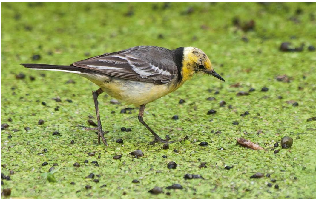
114-115 Citroenkwikstaart / Citrine Wagtail Motacilla citreola , eerste-zomer mannetje, Zeewolde, Flevoland, 16 juli 2011