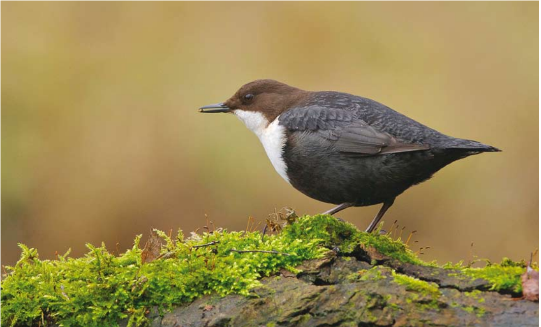
189 Zwartbuikwaterspreeuw / Black-bellied Dipper Cinclus cinclus cinclus , Oosterveld, Hengelo, Overijssel, 28 februari 2012

verbleef een Grote Pieper Anthus richardi in Het Zwin, Zeeland. Een mooi aantal van 113 Sneeuwgorzen Plectrophenax nivalis trok op 24 februari langs telpost Noordkaap in Groningen. Het landelijke telpostrecord is in handen van dezelfde telpost en betrof 384 exemplaren op 26 februari 2011. Grauwe Gorzen Emberiza calandra werden op enkele plekken in Groningen,