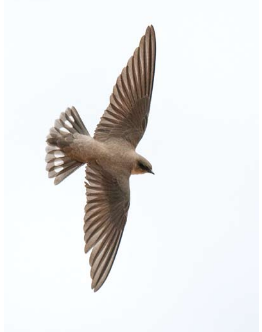
165 Paddyfield Warbler / Veldrietzanger Acrocephalus agricola , Pagham Harbour, West Sussex, England, 26 February 2012 166 Western Pale Crag Martin / Westelijke Vale Rotszwaluw Ptyonoprogne obsoleta presaharica , Oued Jenna, Aousserd, Western Sahara, Morocco, 10 January 2012 167 Pine Bunting / Witkopgors Emberiza leucocephalos , female, Kalanji, Tukums, Latvia, 29 January 2012