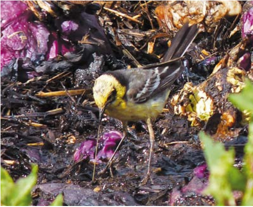
116 Citroenkwikstaart / Citrine Wagtail Motacilla citreola , eerste-zomer mannetje, Zeewolde, Flevoland, 17 juli 2011 (André van den Berg)