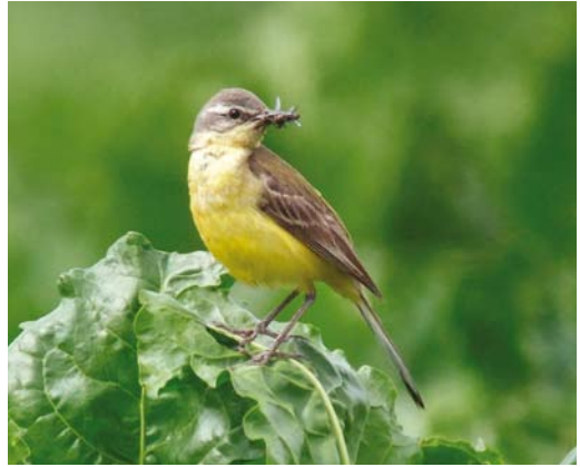
117 Gele Kwikstaart / Blue-headed Wagtail Motacilla flava , vrouwtje, Zeewolde, Flevoland, 21 juli 2011 (Roy Slaterus). Vrouwtje van gemengd broedpaar.

was: niet alleen ging het om het c 33e geval van Citroenkwikstaart (28 gevallen tot en met 2010) maar bovendien om het eerste broedgeval. In de daaropvolgende dagen werd vastgesteld dat de vogel gepaard was met een vrouwtje Gele Kwikstaart M flava en dat ze samen ten minste drie jongen grootbrachten. De plek was niet vrij toegankelijk en daarom werd besloten om het nieuws niet uitgebreid te verspreiden. In dit artikel worden de determinatie van de Citroenkwikstaart en het gemengde broedgeval besproken.