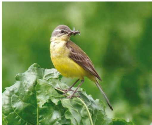
117 Gele Kwikstaart / Blue-headed Wagtail Motacilla flava , vrouwtje, Zeewolde, Flevoland, 21 juli 2011 (Roy Slaterus). Vrouwtje van gemengd broedpaar.

was: niet alleen ging het om het c 33e geval van Citroenkwikstaart (28 gevallen tot en met 2010) maar bovendien om het eerste broedgeval. In de daaropvolgende dagen werd vastgesteld dat de vogel gepaard was met een vrouwtje Gele Kwikstaart M flava en dat ze samen ten minste drie jongen grootbrachten. De plek was niet vrij toegankelijk en daarom werd besloten om het nieuws niet uitgebreid te verspreiden. In dit artikel worden de determinatie van de Citroenkwikstaart en het gemengde broedgeval besproken.