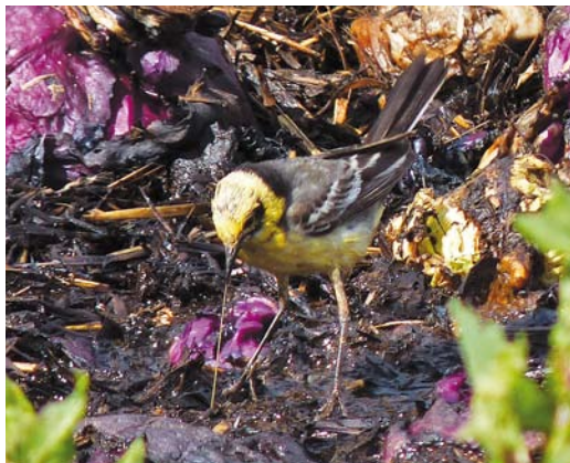
116 Citroenkwikstaart / Citrine Wagtail Motacilla citreola , eerste-zomer mannetje, Zeewolde, Flevoland, 17 juli 2011 (André van den Berg)