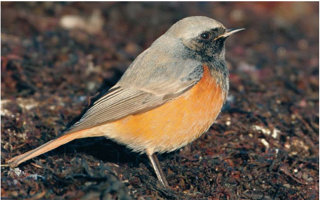
169 Eastern Black Redstart / Oosterse Zwarte Roodstaart Phoenicurus ochruros phoenicuroides , male, Rålehamn, Tjällran, Skåne, Sweden, 24 January 2012 ( Mikael Nord )