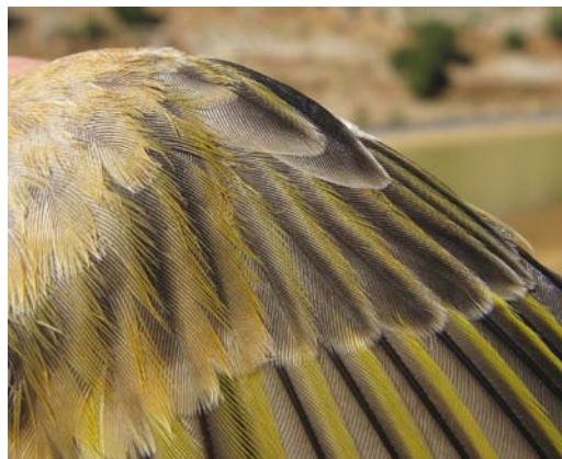
103 Syrian Serin / Syrische Kanarie Serinus syriacus , juvenile, mount Hermon, Israel, 18 July 2008 ( Gidon Perlman ). Note brownish-grey basic colour of alula and greater coverts, not blackish; first (smallest) alula feather fringed rufous; little yellow on second alula feather. In addition, greater coverts have broad rufous edges.

Most of the adults were moulting their feathers when trapped but it was always easy to discern, based on wear and/or feather colour, which of the feathers had been replaced in the previous summer. Before the onset of their first complete post-breeding moult, first-summer (second calendar-year) birds (as defined by ring recoveries) were examined carefully to identify old retained first-generation feathers. These old feathers can in fact