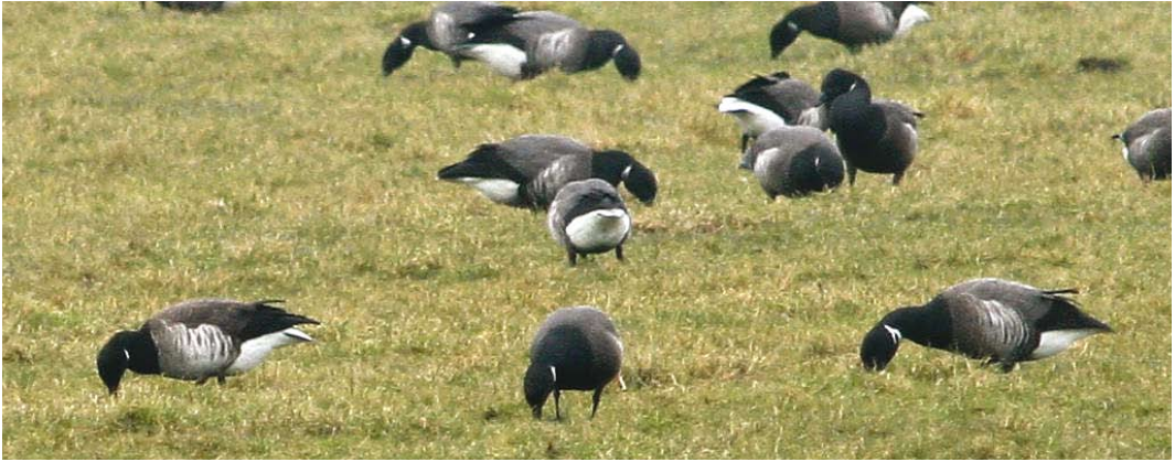
124 Presumed hybrid Pale-bellied x Dark-bellied Brent Goose / vermoedelijke hybride Witbuikrotgans x Rotgans Branta hrota x bernicla , adult (left), with Dark-bellied Brent Geese / Rotganzen B. bernicla , Texel, Noord-Holland, Netherlands, 22 February 2009

probably leave 'difficult' brent geese unidentified and/or are reluctant to report hybrids. Older reports are perhaps hard to trace anyway because, in those days, all brent geese taxa were treated as subspecies and 'intermediate' birds were considered to be of very limited interest. Therefore, the reports in table 1 are probably not complete but give an idea of the minimum numbers involved.