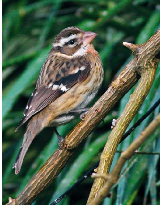
83 Rose-breasted Grosbeak / Roodborstkardinaal Pheucticus ludovicianus , first-winter male, Hugh Town, St Mary's, Scilly, England, 29 December 2012

China. Dating analysis suggests that a basal divergence separating curruca and minula from the other four taxa occurred between 4.2 and 7.2 million years ago, and these two then diverged between 2.3 and 4.4 million years ago. The splits between althaea , blythi , halimodendri and margelanica occurred later, between one and 2.5 million years ago. For information on taxa identified in the Netherlands (Siberian blythi , European curruca and Central Asian halimodendri ), see www.dutchbirding.nl/news.php?id=768 . The second Eastern Oliveaceous Warbler Iduna pallida for Utsira, Rogaland, Norway, was seen on 1 October (not 1 November) and was not trapped (contra Dutch Birding 35: 404, 2012). In Western Sahara, three family groups of Cricket Warbler Spiloptila clamans were found west of Awserd in late December and early January.