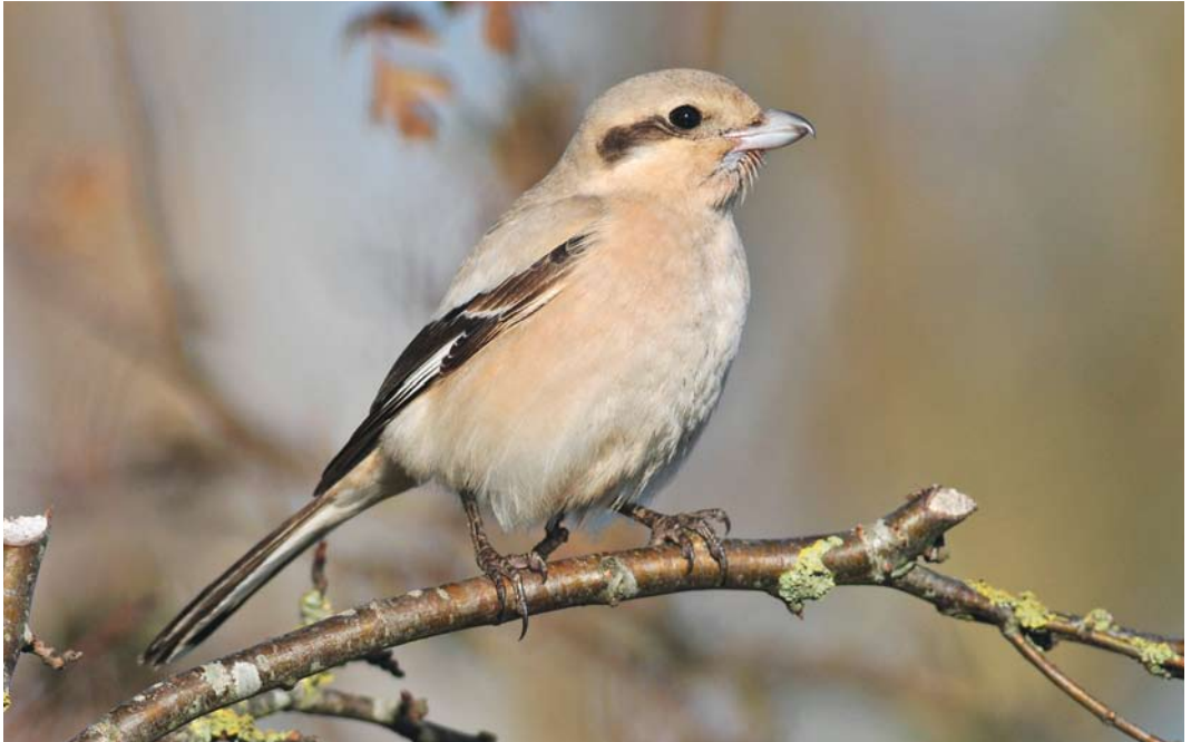
96 Steppeklapekster / Steppe Grey Shrike Lanius lahtora pallidirostris , eerstejaars, Buitendijk, Texel, Noord-Holland, 5 november 2012 (René Pop)

en overige belangstellenden bezocht. In totaal werden c 25-30 exemplaren geteld, waaronder de bekende lichte vogel met kenmerken van Zugmayers Huiskraai C s zugmayeri (een noordwestelijke ondersoort). Tegenstanders van de bestrijdingsactie tekenden met succes bezwaar aan; de rechter besloot om voorlopig niet tot eliminatie over te gaan, omdat de Huiskraai is aangevoelen als beschermde inheemse soort. De enige telst waar Bonte Kraaien C cornix werden gemeld was de Eemshaven, met zeven exemplaren. Het Zuid-Hollandse paar Raven C corax werd de gehele periode rondom Meijndel waargenomen. Vanaf 4 november bevonden zich weer overwinterende Buidelmezen Remiz pendulinus rondom Vockestaert, Zuid-Holland, ditmaal maximaal twee. Net als vorige winter was een van de vogels geringd. Op 22 november werden er nog liefst vijf geringd in het Verdronken Land van Saeftinghe, Zeeland, waar op 17 december ook nog een veldwaarneming werd verricht. De twee Kuifleeuweriken Galerida cristata van Venlo, Limburg, bleven de gehele periode. Met slechts 19 gemelde langstreckende Strandleeuweriken Eremophila alpestris bleef de soort uitermate schaars. Een late Oeverzwaluw Riparia riparia verbleef op 9 november bij het Zuidlaardermeer, Groningen. Tot eind november werden nog verscheidene Boerenzwaluwen Hirundo rustica waargenomen. Op 16 december volgde ten slotte nog een melding bij Puttershoek, Zuid-Holland. Er was een serie waarnemingen van late Huiszwaluwen Delichon urbicum , met