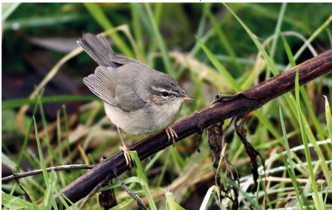
93 Bruine Boszanger / Dusky Warbler Phylloscopus fuscatus , Geestmerambacht, Noord-Holland, 15 december 2012 ( Cock Reijnders )