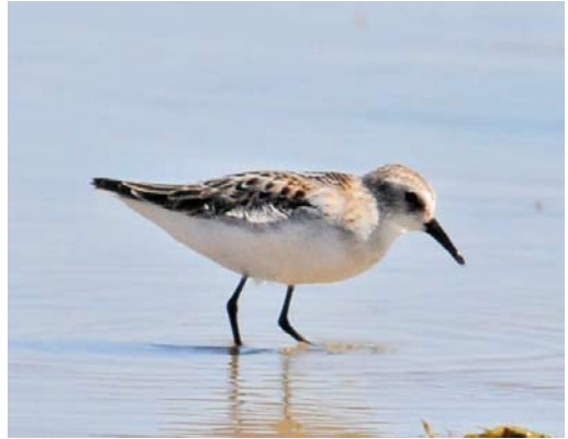
54 Red-necked Stint / Roodkeelstrandloper Calidris ruficollis , juvenile, Sorbulak lake, Almaty province, Kazakhstan, 23 September 2012 ( Machiel Valkenburg )