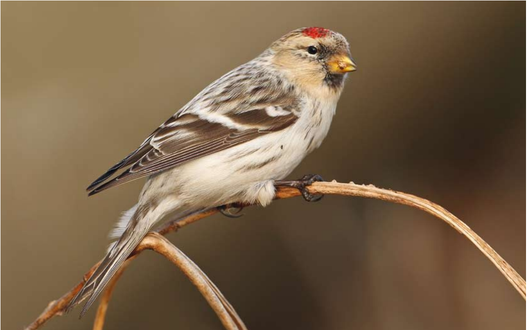
76 Hornemann's Redpoll / Groenlandse Witstuitbarmisjijs Acanthis hornemanni hornemanni, first-year, Aldeburgh, Suffolk, England, 16 December 2012