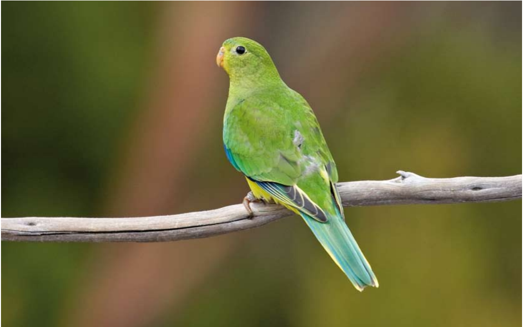
58 Orange-bellied Parrot / Oranjebuikparkiet Neophema chrysogaster , juvenile, Melaleuca, Tasmania, Australia, 29 January 2011