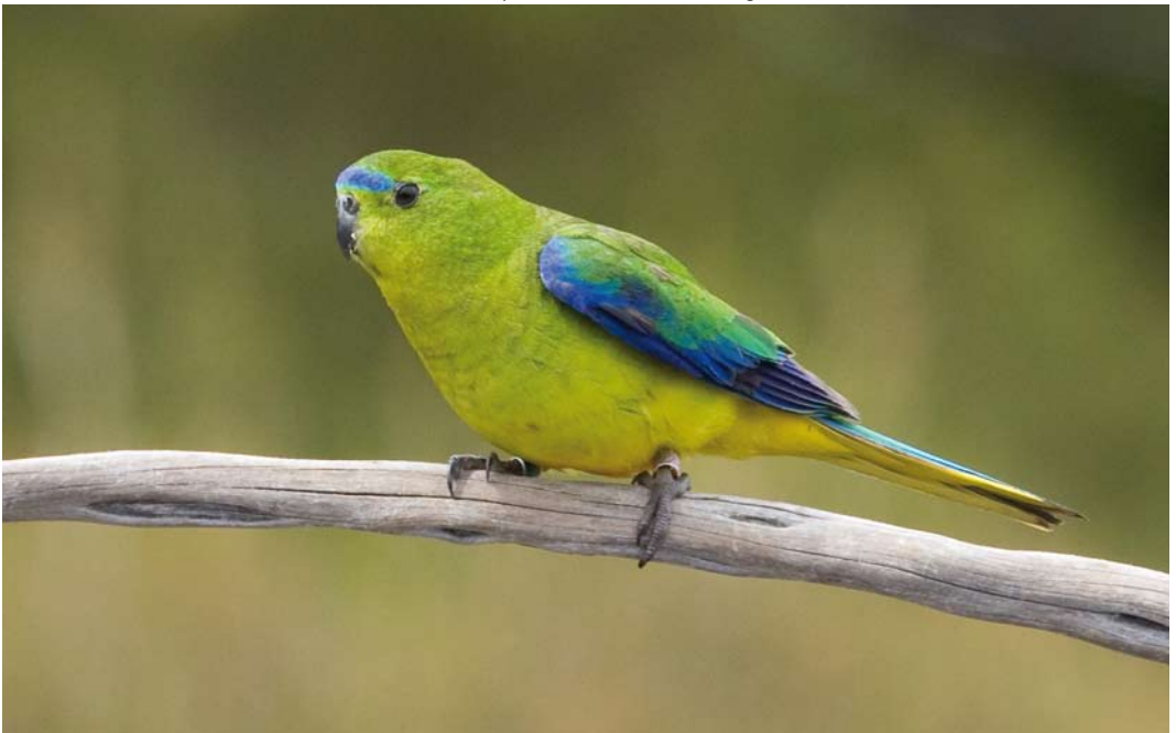
59 Orange-bellied Parrot / Oranjebuikparkiet Neophema chrysogaster , adult, Melaleuca, Tasmania, Australia, 29 January 2011 (Peter Lindenburg)