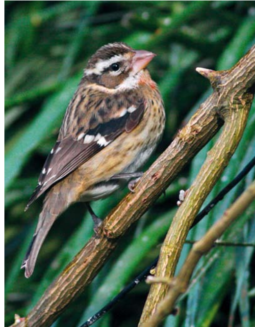
83 Rose-breasted Grosbeak / Roodborstkardinaal Pheucticus ludovicianus , first-winter male, Hugh Town, St Mary's, Scilly, England, 29 December 2012

China. Dating analysis suggests that a basal divergence separating curruca and minula from the other four taxa occurred between 4.2 and 7.2 million years ago, and these two then diverged between 2.3 and 4.4 million years ago. The splits between althaea , blythi , halimodendri and margelanica occurred later, between one and 2.5 million years ago. For information on taxa identified in the Netherlands (Siberian blythi , European curruca and Central Asian halimodendri ), see www.dutchbirding.nl/news.php?id=768 . The second Eastern Oliveaceous Warbler Iduna pallida for Utsira, Rogaland, Norway, was seen on 1 October (not 1 November) and was not trapped (contra Dutch Birding 35: 404, 2012). In Western Sahara, three family groups of Cricket Warbler Spiloptila clamans were found west of Awserd in late December and early January.