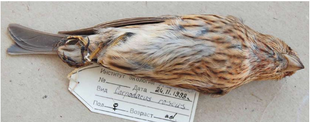
195-197 Pallas's Rosefinch / Pallas' Roodmus Carpodacus roseus , female or first-year male (collected at Saraktash district, Orenburg oblast, Russia, 24 November 1998), Institute of Plant and Animal Ecology, Ural Centre of Russian Academy of Sciences, Yekaterinburg, Russia, 26 July 2010