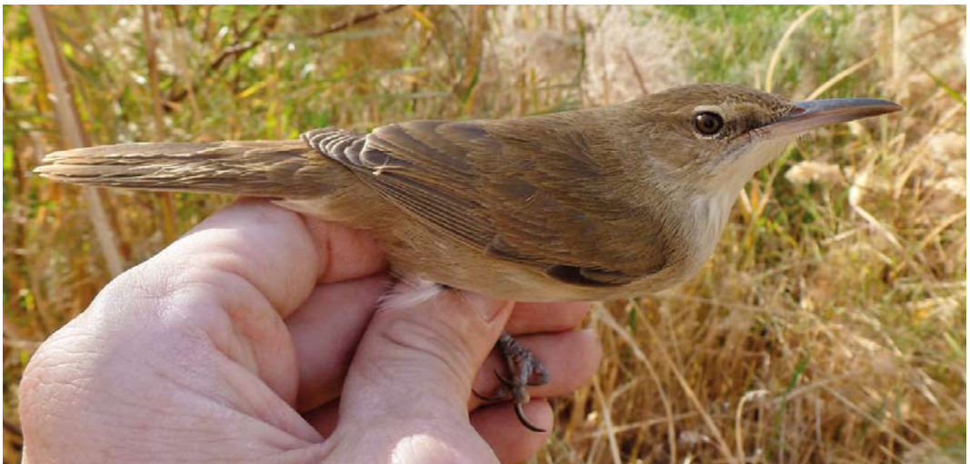
221-222 Clamorous Reed Warbler / Indische Karekiet Acrocephalus stentoreus , Dakhla Oasis, Libyan Desert, Egypt, 10 January 2012 (Jens Hering). Normally coloured individual.

Heunks 1999, Bensch et al 2000) and above all for various island-based representatives of Acrocephalus in Polynesia, including leucism in several species (Holyoak 1978, Graves 1992, Kennerley & Pearson 2010, Leisler & Schulze-Hagen 2011). In contrast, in the Middle East subspecies A. s. levantinus of Clamorous Reed, dark-coloured birds have been noted regularly, and these are indicated as dark morph (being unique to this subspecies; cf Kennerley & Pearson 2010; http://blumen.smugmug.com/Birds/Clamorous-reed-warbler-Dark ). For example, in Israel, the proportion of ringed dark morphs is 30-40% (Yosef Kiat pers comm). The only other reed warbler species with a distinct dark morph is Tahiti Reed Warbler A. caffer in