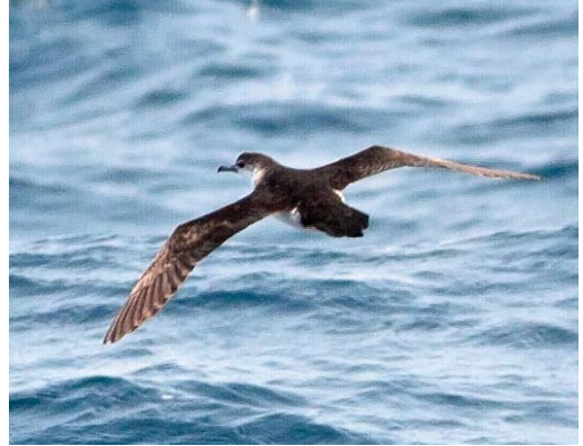
210 Audubon's Shearwater / Audubons Pijlstormvogel Puffinus lherminieri , off Cape Hatteras, North Carolina, USA, 1 June 2011. Note long-tailed impression, similar to Canary Islands bird. Note also bulkier impression of head and bill in comparison with Barolo Shearwater P baroli in plate 213 and dark surrounding of eye. Although secondaries are still growing, it is already possible to see lack of pale panel. 211 Boyd's Shearwater / Kaapverdische Kleine Pijlstormvogel Puffinus boydi , off Cape Verde Islands, 24 March 2007. Note lack of pale panel in greater coverts, black of cap extending to eye and long-tailed impression. Note strong similarity between this individual and Audubon's Shearwater P lherminieri in plate 210.

A third option would be Tropical Shearwater P bailloni . This species is hard to separate from the lherminieri -complex but only juveniles show as dark (almost pure black) a back as the mystery shearwater. Although it is impossible to age the bird without much more detailed images, as fledgling Tropical Shearwaters do not leave their colonies in the Indo-Pacific before December, it is highly unlikely one would find its way to the Canary Islands at this time of year. Moreover, as there are only two sightings from the well-watched eastern South African coast and no sightings at all from the even more intensively watched South African western coast (Sinclair 2009) it is probably safe to assume that it is an unlikely vagrant further north in the Atlantic.