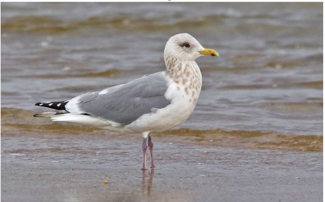
224 Thayer's Gull / Thayers Meeuw Larus thayeri , adult, San Ciprian, Galicia, Spain, 23 March 2013