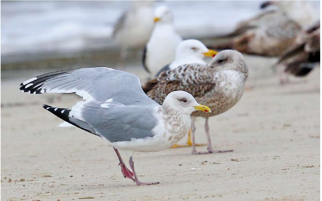
223 Thayer's Gull / Thayers Meeuw Larus thayeri , adult, San Ciprian, Galicia, Spain, 23 March 2013 (Kris De Rouck)