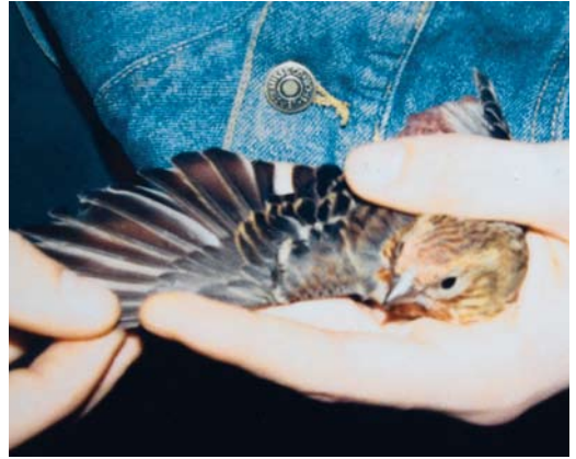
192-193 Pallas's Rosefinch / Pallas' Roodmus Carpodacus roseus , female or first-year male, Tsivil district, republic of Chuvashia, Russia, 9 December 1995 (A Yakovlev)

Chuvashia, female or first-year male, trapped by A Ksenofontov (plate 192-193). This record was accepted by the regional Middle Volga ornithological records committee. The man who trapped the bird claimed he saw other Pallas's Rosefinches at the same location some two weeks later (Sotnikov 2008, Isakov et al 2009; Oleg Borodin in litt, Vladimir Yakovlev in litt).