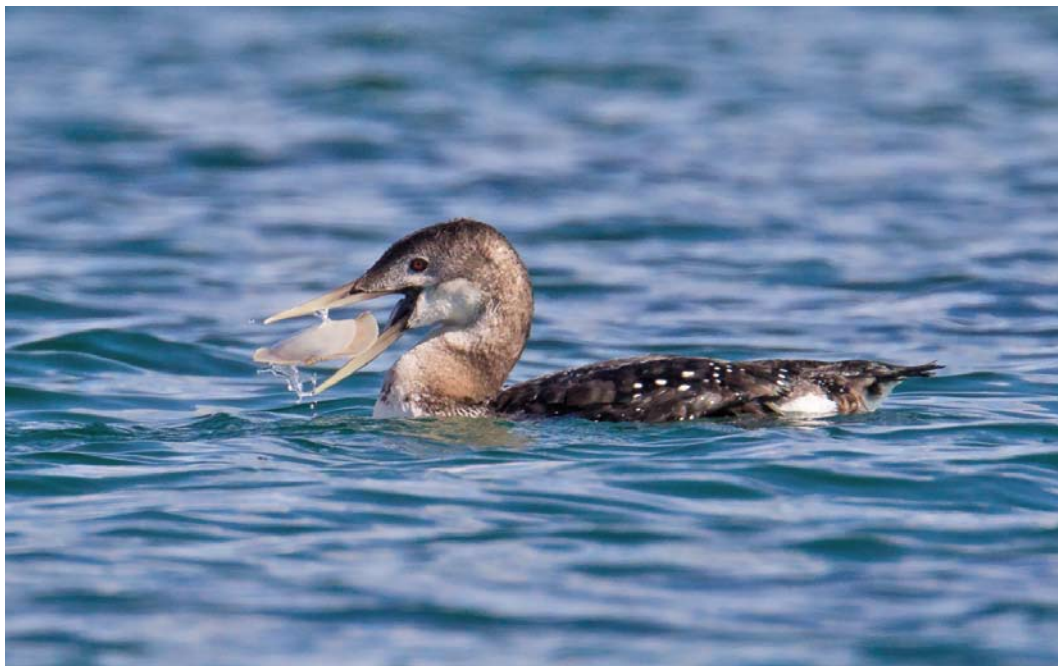
225 Yellow-billed Loon / Geelsnavelduiker Gavia adamsii , adult, Herston, South Ronaldsay, Orkney, Scotland, 7 April 2013 (Hugh Harrop)