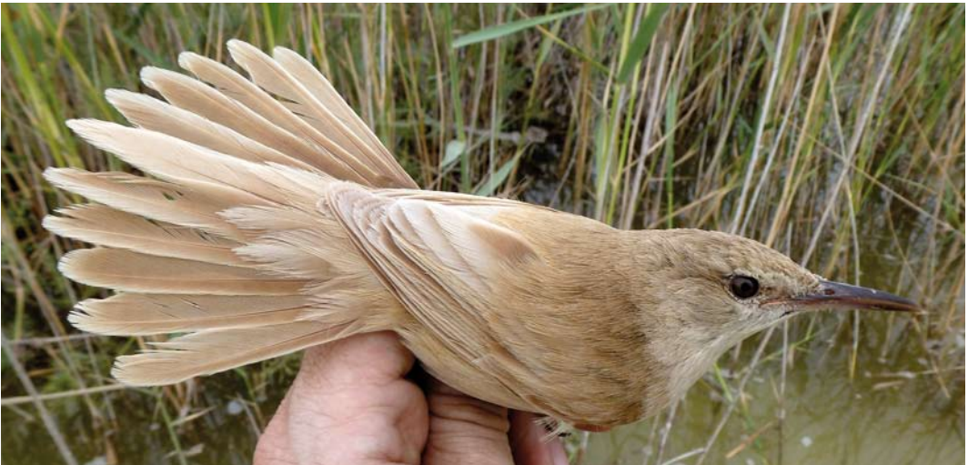
218-220 Aberrantly coloured Clamorous Reed Warbler / Indische Karekiet Acrocephalus stentoreus , Ismailiya, Nile Delta, Egypt, 20 April 2012 (Jens Hering)

Grouw (pers comm), the pale fringes were enhanced by bleaching by the (sun) light since these feather parts are always exposed. The actual colour due to the mutation could only be observed on the feathers' inner webs.