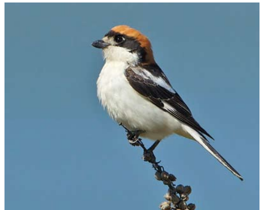
260 Roodstuitzwaluw / Red-rumped Swallow Cecropis daurica , Kustweg, Lauwersoog, Groningen, 17 april 2013 (Willem Hartholt) 261 Iberische Tjiftjaf / Iberian Chiffchaff Phylloscopus ibericus , Donkere Duinen, Den Helder, Noord-Holland, 30 april 2013 (Maurits Martens) 262 Hop / Eurasian Hoopoe Upupa epops , Beilen, Drenthe, 15 april 2013 (Frank van der Wielen) 263 Roodkopklauwier / Woodchat Shrike Lanius senator , Maasvlakte, Zuid-Holland, 28 april 2013 (Martin van der Schalk)

Haliaeetus albicilla , 2183 Bruine Kiekendieven Circus aeruginosus met onder andere 101 langs Breskens op 8 april, 284 Blauwe Kiekendieven C cyaneus , 12 Grauwe Kiekendieven C pygargus , 19 Ruigpootbuizerds Buteo lagopus , 98 Visarenden Pandion haliaetus , 216 Smellekens Falco columbarius , slechts 97 Boomvalken F sub-buteo (234 in dezelfde periode in 2012) en 218 Slechtvalken F peregrinus . Een Slangenarend Circaetus gallicus werd op 29 april gemeld boven het Drents-Friese Wold bij Wateren, Drenthe. Vanaf 6 april werden minstens 15 doortrekkende Steppekiekendieven C macrourus opgemerkt. Zoals inmiddels gebruikelijk in het voorjaar was de soort nauwelijks twitchbaar. Vanaf half april werden slechts c vijf Roodpootvalken F vespertinus gemeld, waaronder een pleisteraar vanaf 21 april in het Haaksbergerveen, Overijssel. In de eerste week van maart tekende zich massale trek van Kraanvogels Grus grus af; alleen al door trektellers werden toen ruim 63 000