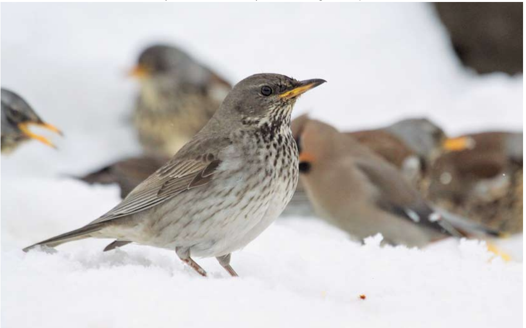
244 Black-throated Thrush / Zwartkeelijster Turdus atrogularis , second calendar-year female, Plaza, Chrzanow, Malopolskie, Poland, 4 April 2013