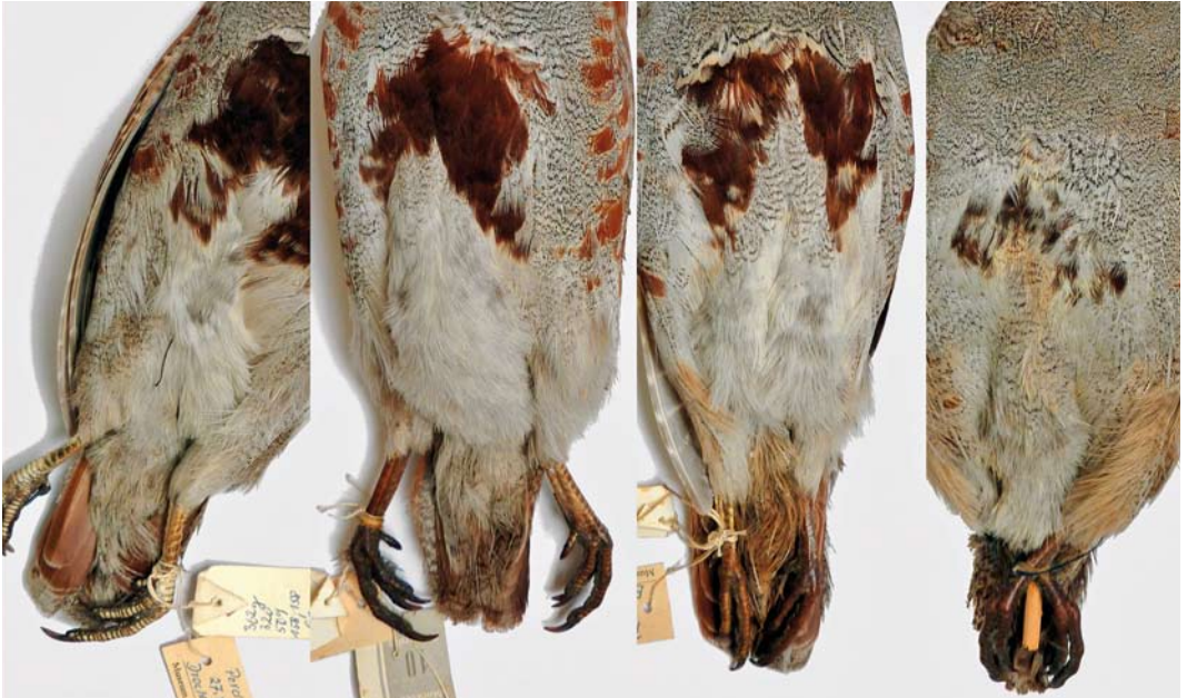
FIGURE 2 Grey Partridges / Patrijzen Perdix perdix, Zoologisches Forschungsmuseum Alexander Koenig, Bonn, Germany, 12 August 2011. Four scores for undertail-coverts coloration (from left to right): golden-brown coloration 'absent', 'only faintly present', 'clearly present' and 'not possible to score'.

186 Grey Partridge / Patrijs Perdix perdix perdix, male (collected at Szabolcs, Hungary, on 22 February 1934), Naturalis Biodiversity Centre, Leiden, Netherlands, 28 December 2011. Grey circle in middle of Grey Card was used to calibrate colours (see text). Despite being collected far from sphagnetorum range, this individual shows large belly patch.