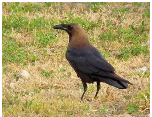
235 Little Swift / Huisgierzwaluw Apus affinis , Ghadira, Malta, 16 March 2013 ( Nicholas Galea ) 236 Pallas's Leaf Warbler / Pallas' Boszanger Phylloscopus proregulus , Zurrieq, Malta, 21 April 2013 ( Patrick Sammut ) 237 Common Bulbul / Grauwe Buulbuul Pycnonotus barbatus , Tarifa, Cádiz, Spain, 1 May 2013 ( Javier Elorriaga ) 238 Red-tailed Shrike / Turkestaanse Klauwier Lanius phoenicuroides , Comino, Malta, 20 April 2013 ( Luca Pisani ) 239 Citrine Wagtail / Citroenkwikstaart Motacilla citreola , adult male, Bagno di Venere, Pantelleria, Italy, 3 April 2013 ( Andrea Corso ) 240 Brown-necked Raven / Bruinnekraaf Corvus ruficollis , Vila-Seca, Tarragona, Catalunya, Spain, 11 April 2013 ( Edu Gracia Tinedo )