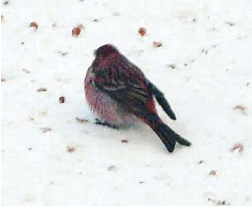
198 Pallas's Rosefinch / Pallas' Roodmus Carpodacus roseus , male, Ulyanovsk, Russia, 25 January 2011. Same bird as plate 199.