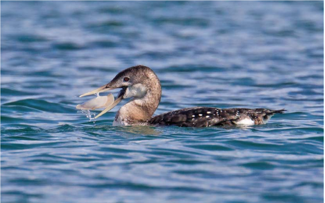
225 Yellow-billed Loon / Geelsnavelduiker Gavia adamsii , adult, Herston, South Ronaldsay, Orkney, Scotland, 7 April 2013 (Hugh Harrop)