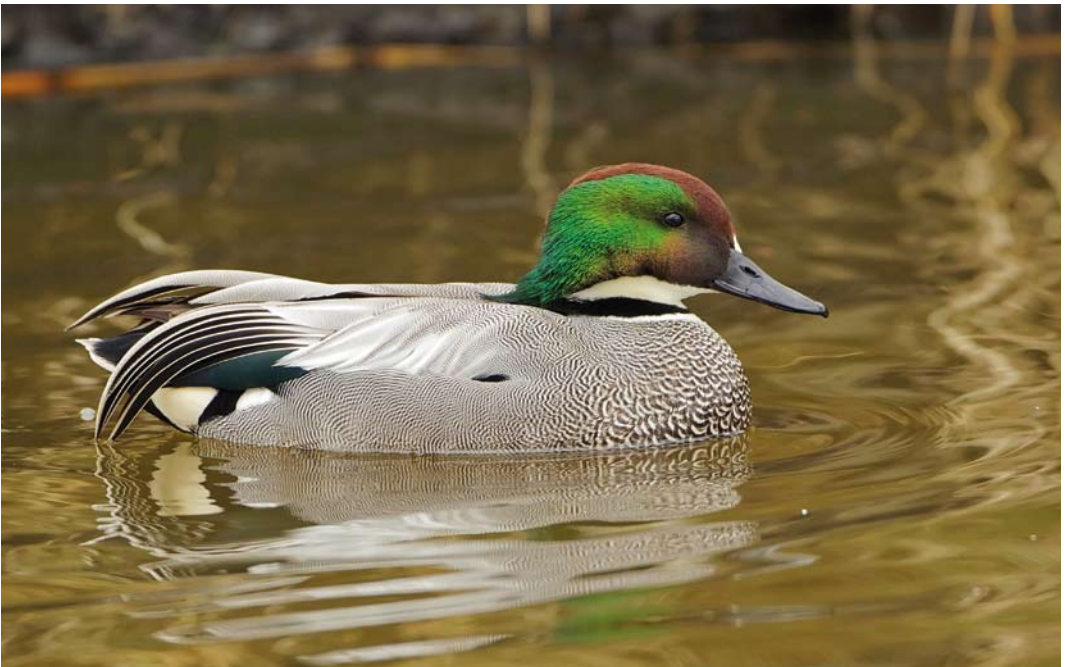
226 Falcated Duck / Bronskopeend Anas falcata , male, Spijkenisse, Zuid-Holland, Netherlands, 30 March 2013 (Martin van der Schalk)