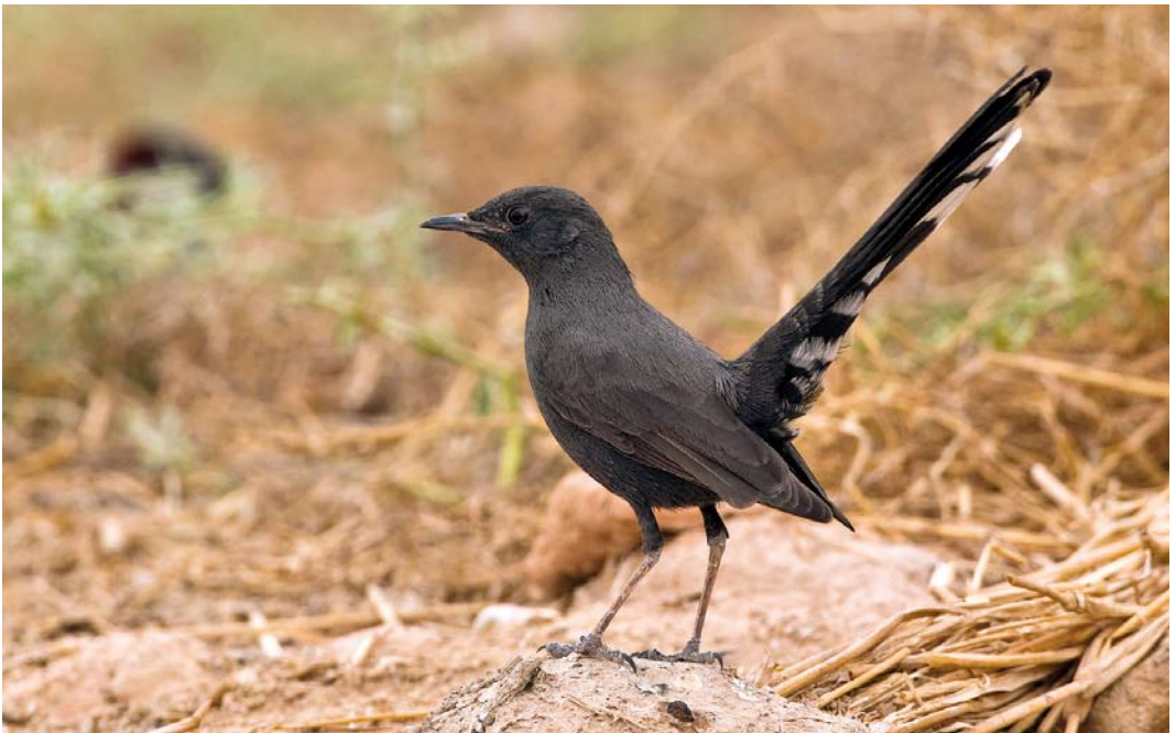
242 Black Scrub Robin / Zwarte Waaiersaart Cercotrichas podobe , Yotvata, Israel, 8 April 2013 (David Monticelli)