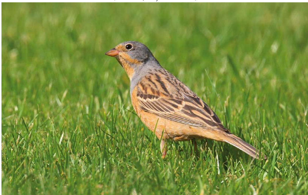
206 Bruinkeelortolaan / Cretzschmar's Bunting Emberiza caesia , mannetje, Lauwersoog, Groningen, 5 mei 2013