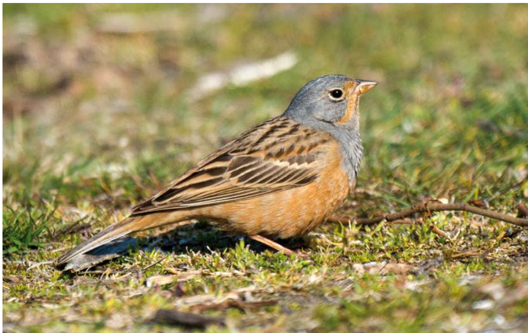
205 Bruinkeelortolaan / Cretzschmar's Bunting Emberiza caesia , mannetje, Lauwersoog, Groningen, 5 mei 2013 (Arnoud B van den Berg)