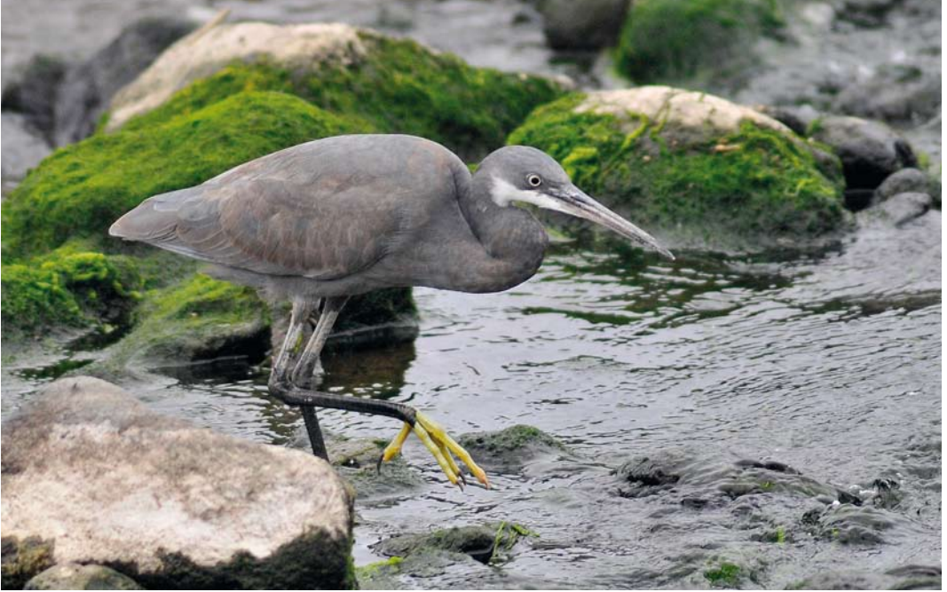
64 Western Reef Heron / Westelijke Rifeiger Egretta gularis , Ribeira Grande, Santo Antão, Cape Verde Islands, 28 November 2012