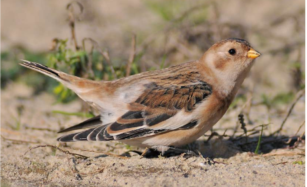
26 Snow Bunting / Sneeuwgorst Plectrophenax nivalis , male P. n. insulae , Texel, Noord-Holland, Netherlands, 11 October 2010. Extensive rusty markings on head and underparts and little contrast between fringes of scapulars and mantle-feathers indicative of insulae . 27 Snow Bunting / Sneeuwgorst Plectrophenax nivalis , female P. n. nivalis , Katwijk aan Zee, Zuid-Holland, Netherlands, 2 November 2012. Note extensive white on primaries, second innermost showing more than 60% white, diagnostic of nivalis . Also note overall pale appearance and contrast between pale mantle and rusty scapular edges.