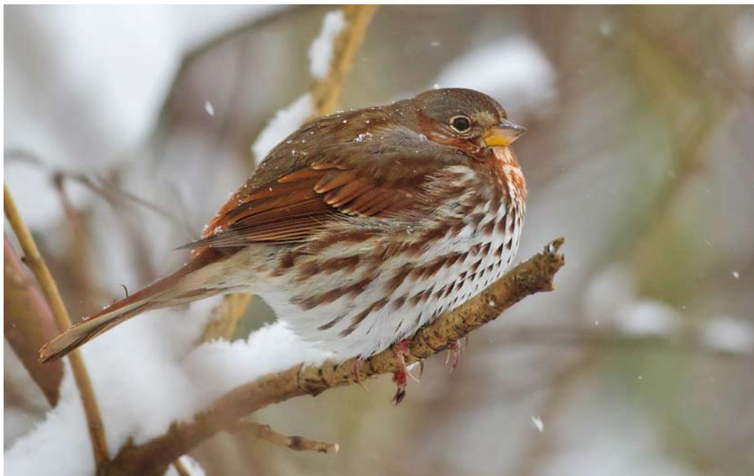
84 Fox Sparrow / Roodstaartgors Zonotrichia iliaca , Haapsula, Estonia, 14 December 2012