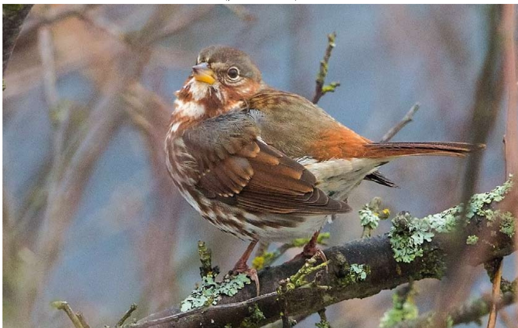
85 Fox Sparrow / Roodstaartgors Zonotrichia iliaca , Korpoo, Utö, Finland, 20 December 2012 (Jorma Tenovuo)