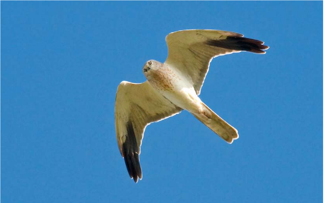
70 Pallid Harrier / Stepekiekendief Circus macrourus , second calendar-year male, Barbate, Andalucía, Spain, 8 December 2012

wordpress.com/2012/12/17/interesting-shearwater). Along the Mediterranean coast of Israel, a Leach's Storm Petrel Oceanodroma leucorhoa was seen off Akhziv on 8 December. On Santo Antão, Cape Verde Islands, several Cape Verde Storm Petrels O jabejabe were sound-recorded at Fontainhas on 27-30 November and (one) at Boca de Ambas as Ribeiras, c 3 km inland, on 2 December; breeding is not known from Santo Antão although the species has been reported in the past. If accepted, a White-tailed Tropicbird Phaethon lepturus found dead on the tideline at Mawbray Bank, Cumbria, England, on 6 January would be the first for Britain. A white-morph Red-footed Booby Sula sula was photographed on Raso, Cape Verde Islands, on 9 October. On 13 December, a Masked Booby S dactylatra turned up on Curral Velho off Boa Vista, Cape Verde Islands. The first-winter Double-crested Cormorant Phalacrocorax auritus on El Hierro, Canary Islands, from 22 October was still present on 30 November.