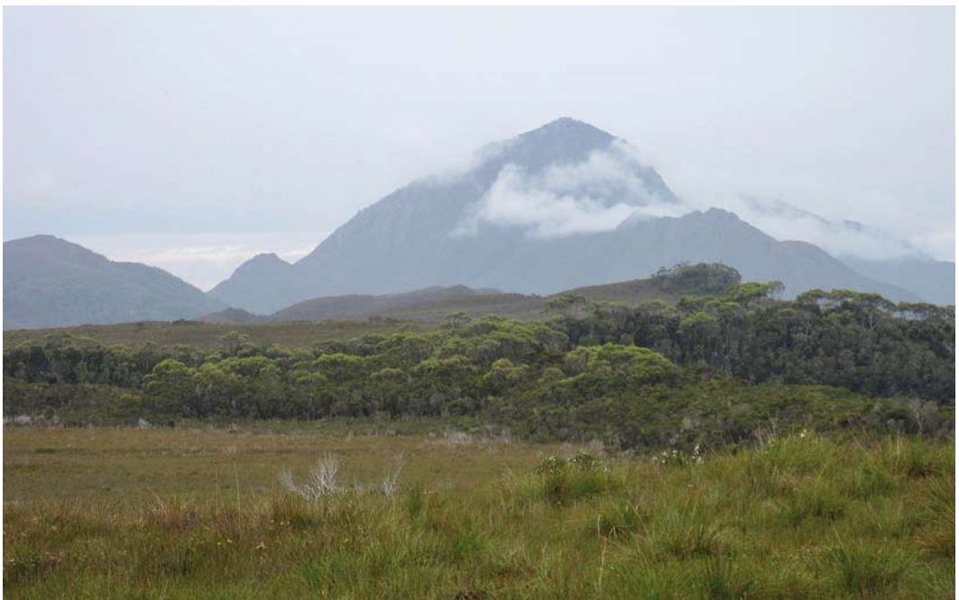
60 Breeding habitat of Orange-bellied Parrot Neophema chrysogaster , Melaleuca, Tasmania, Australia, 31 January 2011 (Maartje van Kregten)

Australia. Migration includes crossing Bass Strait, a 600 km flight over sea. They spend the winter in saltmarshes, dunes, beaches, pastures and shrubland close to the coast, where they feed on the ground or in low vegetation. Feeding is almost exclusively on seeds and fruits, mainly of sedges, and salt-tolerant coastal and saltmarsh plants (Orange-bellied Parrot Recovery Team 2006). The preferred habitat has been degraded and lost throughout the species' range; however, the majority of this impact has occurred within the wintering areas. The major contributing factor is habitat loss due to