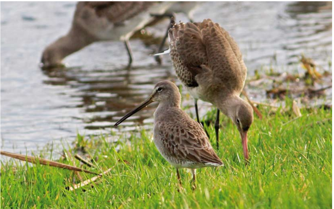
69 Long-billed Dowitcher / Grote Grijze Snip Limnodromus scolopaceus , adult winter, with Black-tailed Godwits / Grutto's Limosa limosa , Our Lady's Island Lake, Wexford, Ireland, 14 January 2013 (Killian Mullarney)