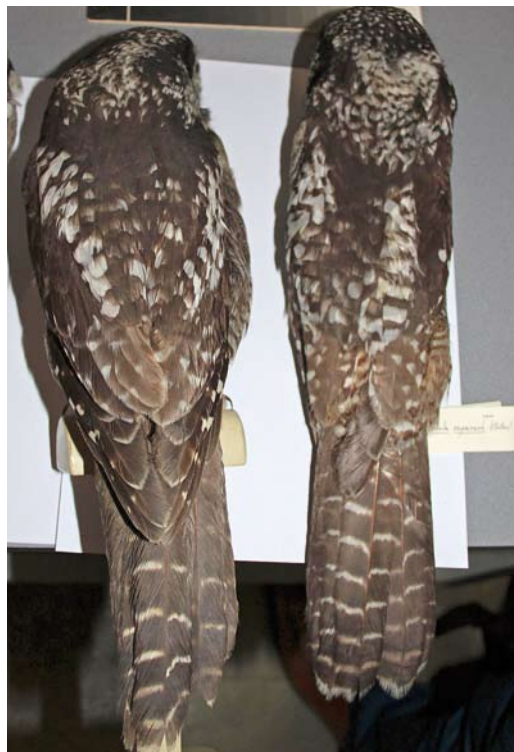
11 American Hawk Owls / Amerikaanse Sperweruilen Surnia ulula caparoch (left: caught off Las Palmas, Gran Canaria, Canary Islands, in October 1924; right: specimen from Canada), Naturalis Biodiversity Center, Leiden, Netherlands, August 2012