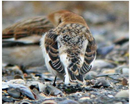
18 Snow Bunting / Sneeuwgors Plectrophenax nivalis , adult male P n insulae , Eemshaven, Groningen, Netherlands, 6 January 2008 ( Rik Winters ). Note fringes to mantle-feathers being only slightly paler than fringes of scapulars. 19 Snow Bunting / Sneeuwgors Plectrophenax nivalis , male, Lauwersoog, Groningen, Netherlands, 23 February 2008 ( Rik Winters ). Tertial and inner greater covert edges much abraded, rump invisible, so age and subspecies cannot be told with certainty, but rusty fringes to mantle-feathers and compact appearance suggest insulae . 20 Snow Bunting / Sneeuwgors Plectrophenax nivalis , first-winter female, Lauwersoog, Groningen, Netherlands, 18 February 2008 ( Rik Winters ). Tertial and inner greater covert edges abraded and narrow, tail-feathers sharply pointed. Grey mantle and extensive white underparts indicate P n nivalis . 21 Snow Bunting / Sneeuwgors Plectrophenax nivalis , adult male P n insulae , Lauwersoog, Groningen, Netherlands, 23 December 2008 ( Rik Winters ). Note typical rump pattern with extensive black markings.

In general, adults show more white than first-winter birds of the same sex and subspecies. When both sex and subspecies can (in most cases) be determined, some additional features may be of use when determining the age of the bird.