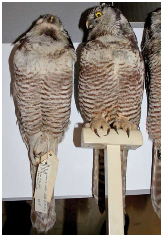
10 American Hawk Owl / Amerikaanse Sperweruil Surnia ulula caparoch (caught off Las Palmas, Gran Canaria, Canary Islands, in October 1924), right, with Northern Hawk-Owl / Sperweruil S u ulula (left: specimen from Finland), Naturalis Biodiversity Center, Leiden, Netherlands, August 2012 (Cosme D Romay)