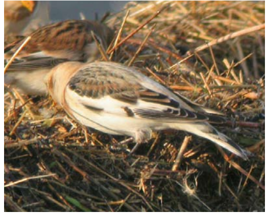
15 Snow Bunting / Sneeuwvogel Plectrophenax nivalis , first-winter male P n insulae , Lauwersoog, Groningen, Netherlands, 16 February 2008 (Rik Winters) 16 Snow Bunting / Sneeuwvogel Plectrophenax nivalis , male, most likely P n nivalis , Eemshaven, Groningen, Netherlands, 6 January 2008 (Rik Winters). Note extensively white rump and contrast between pale mantle fringes and rufous scapular fringes. Very pale plumage and large size suggestive of vasowae .

(hereafter nivalis ) from Greenland east to western Russia, including Scandinavia, and P n insulae (hereafter insulae ) from Iceland. The two subspecies form mixed flocks on the wintering grounds where their ranges overlap. Little is known about the ratios in which the subspecies occur in the Netherlands. Insulae is presumed to be the most numerous subspecies, being about twice as numerous as nivalis (Jukema & Fokkema 1992), but this ratio may vary between winters. However, using the identification criteria described hereafter, birds I checked in the Wadden Sea area in autumn (September-October) all proved to be nivalis .