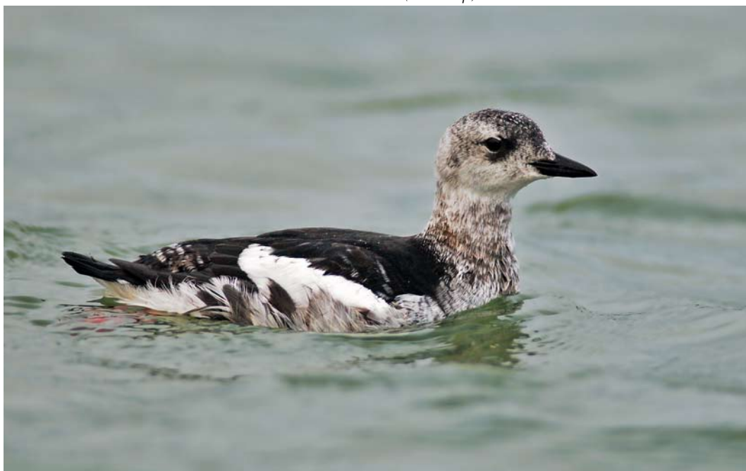
90 Zwarte Zeekoet / Black Guillemot Cephus grylle , adult winter, Oudeschild, Texel, Noord-Holland, 16 december 2012 ( René Pop )