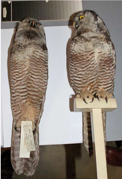
8 American Hawk Owls / Amerikaanse Sperweruilen Surnia ulula caparoch (right: caught off Las Palmas, Gran Canaria, Canary Islands, in October 1924; left: specimen from Canada), Naturalis Biodiversity Center, Leiden, Netherlands, August 2012 (Cosme D Romay)

in characters but the overlap is wide. Some differences between both taxa exist in the pattern of individual feathers on crown, scapulars and chest (eg, Cramp 1985) but even within one individual the variation in feather pattern in each of these feather tracts is large and valid for identification only when exactly the same feather of ulula and caparoch is compared. The only easy identification character is formed by the colour pattern of the two longest primaries (p7-8; primaries numbered from inside): ulula shows 8-10 white spots beyond the longest primary covert on the outer web of these feathers (of which 4-5 on the emarginated part), caparoch has 5-7 white spots (2-3 on the emarginated part); moreover, the spots of ulula are larger and squarer and of caparoch smaller and rounder. This character is useful in the field as well. The Las Palmas bird has only five spots on the outer web of p7-8 (of which two small ones on the emarginated part) and thus clearly belongs to caparoch . Measurements of