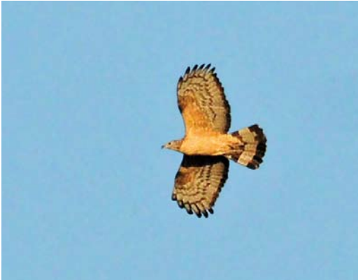
53 Crested Honey Buzzard / Aziatische Wespendif Pernis ptilorhynchus , adult male, Korgalzhyn, Aqmola province, Kazakhstan 12 May 2012 ( Ignaas Robbe )