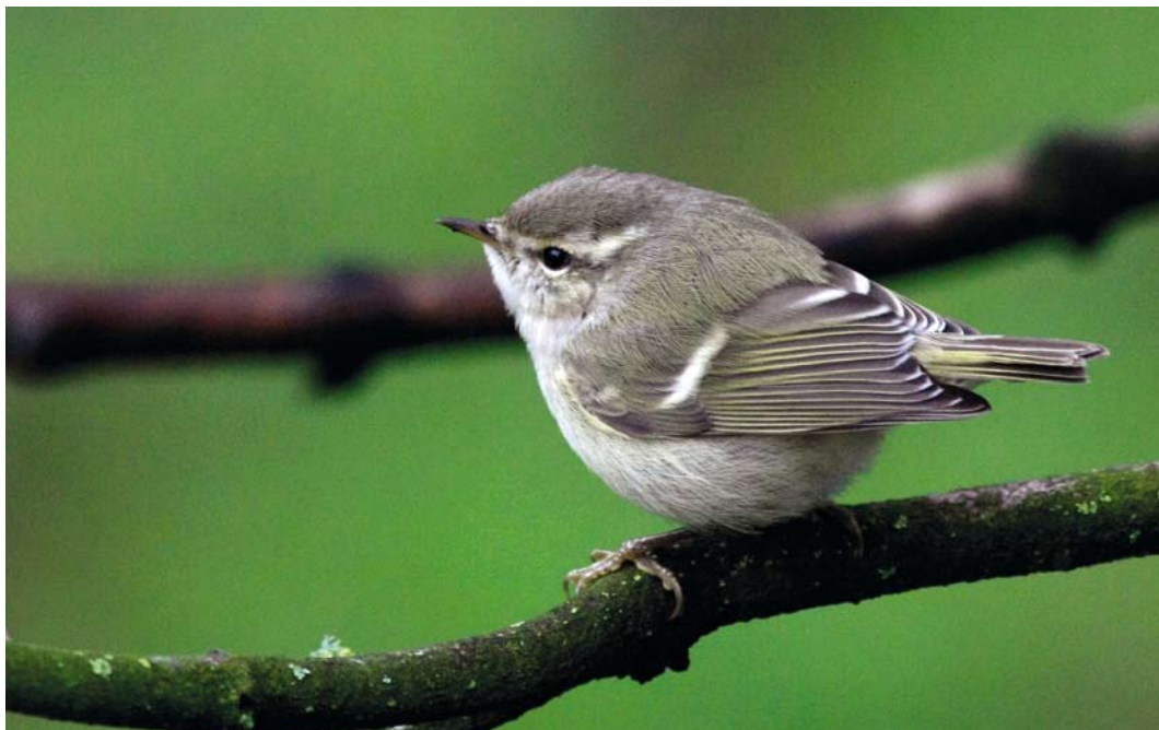
92 Humes Bladkoning / Hume's Leaf Warbler Phylloscopus humei , Beijum, Groningen, Groningen, 25 december 2012 ( Ipe Weeber )