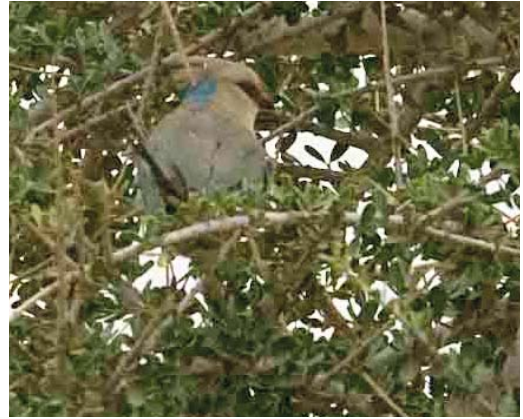
52 Blue-naped Mousebird / Blauwnekmuivogel Urocolius macrourus , near Choum, Mauritania, 13 December 2007

Dunn's Lark in the area, where the species is in fact widespread (Crochet 2007), occurring north to Morocco in southern Western Sahara (Awserd area, see Copete et al 2008) and even Tafilalt (Albegger et al 2010; http://maroc.observado.org/waarneming/view/67994098 ).