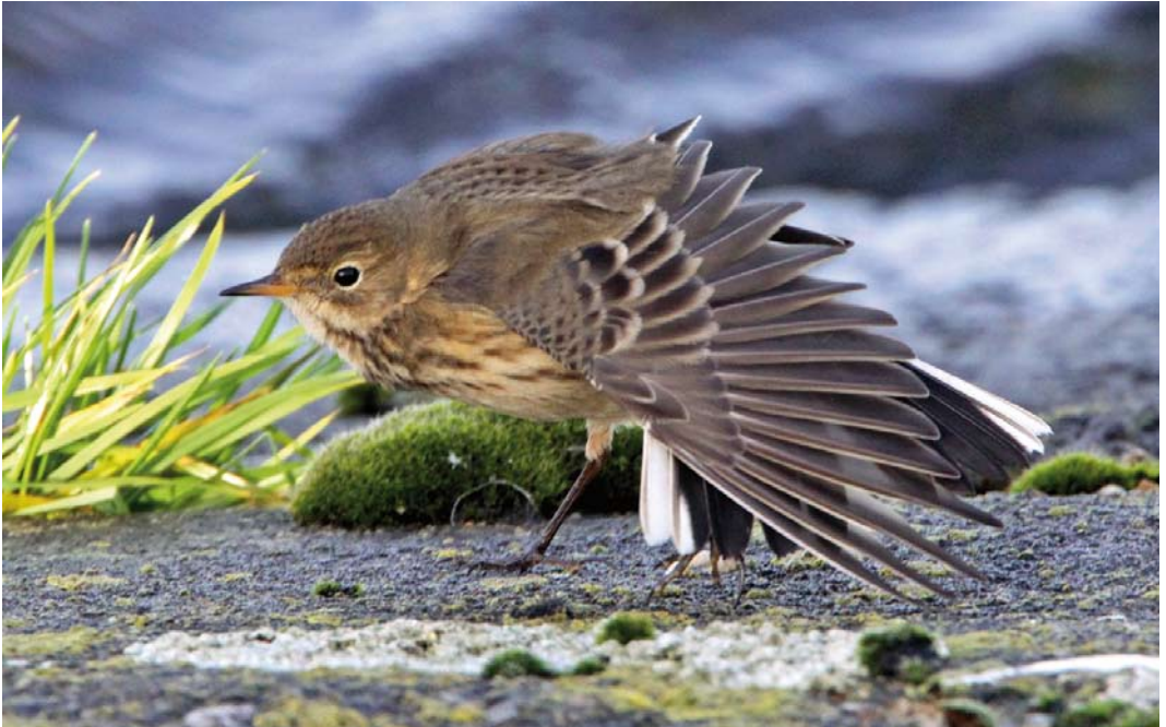
86 American Buff-bellied Pipit / Amerikaanse Waterpieper Anthus rubescens rubescens , Queen Mother Reservoir, Berkshire, England, 15 December 2012