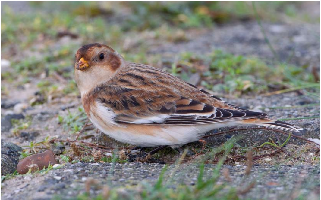
17 Snow Bunting / Sneeuwgor Plectrophenax nivalis , adult female P n insulae , Katwijk aan Zee, Zuid-Holland, Netherlands, 2 November 2012 (René van Rossum). Pointed centre of scapulars typical for female. Extensive coloration on head and underparts and slight contrast between mantle and scapulars indicate insulae .

The inner greater coverts can be used in two ways. They are largely dark with a pale fringe. In juveniles, this fringe is narrow and easily wears off while, in adults, the fringe is wide and less prone to wear. Especially late in the season, interpretation of this feature may become difficult. The tell-tale sign of age is a moult contrast shown by some first-winter birds. Some have moulted their innermost (rarely two) inner greater covert(s) and replaced the narrowly edged juvenile one(s) by a broadly edged adult-type feather. Any bird showing a broadly edged inner greater covert next to a narrowly edged one certainly is a first-winter (plate 22).