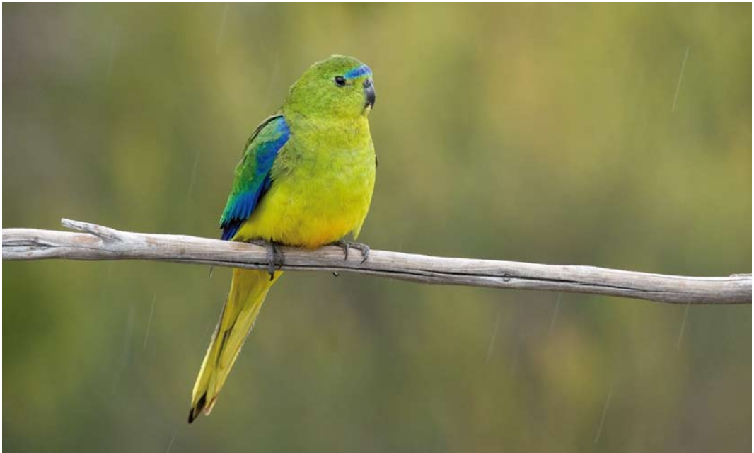
55 Orange-bellied Parrot / Oranjebuikparkiet Neophema chrysogaster , adult, Melaleuca, Tasmania, Australia, 30 January 2011

The entire breeding area lies within a radius of c