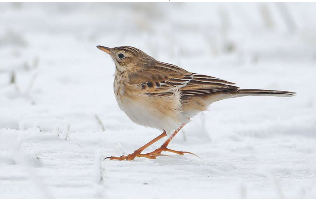
79 Richard's Pipit / Grote Pieper Anthus richardi , first-winter, Warta mouth, Poland, 8 December 2012 (Mateusz Matysiak)