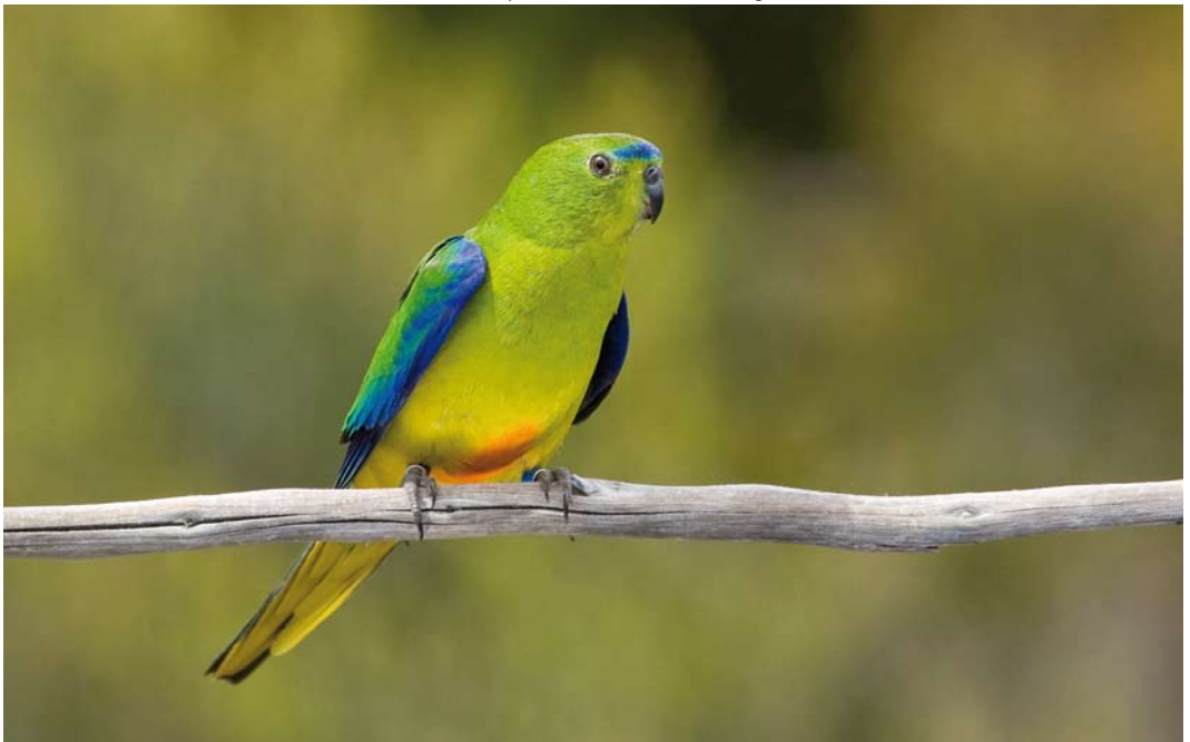
57 Orange-bellied Parrot / Oranjebuikparkiet Neophema chrysogaster , adult, Melaleuca, Tasmania, Australia, 29 January 2011