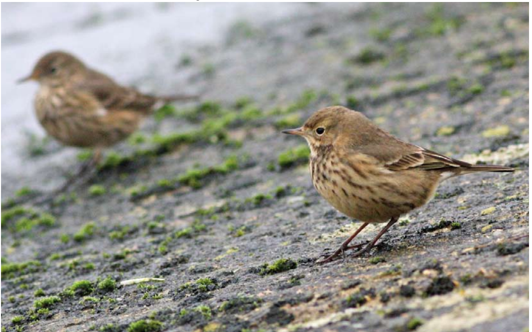
87 American Buff-bellied Pipits / Amerikaanse Waterpiepers Anthus rubescens rubescens , Queen Mother Reservoir, Berkshire, England, 26 December 2012 ( Marek Walford )