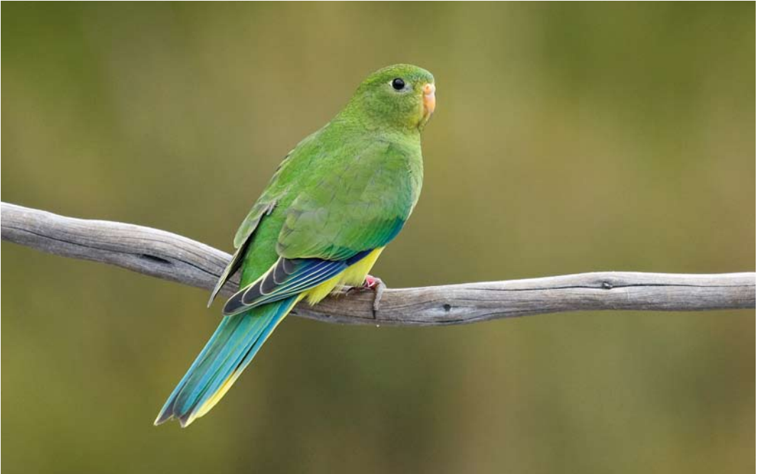
56 Orange-bellied Parrot / Oranjebuikparkiet Neophema chrysogaster , juvenile, Melaleuca, Tasmania, Australia, 29 January 2011