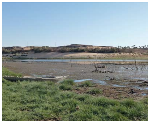
45-47 Three-banded Plover / Driebandplevier Charadrius tricollaris , Abu Simbel, Egypt, 1 May 2012 (Jens Hering) 48 Three-banded Plover / Driebandplevier Charadrius tricollaris , Abu Simbel, Egypt, 2 May 2012 (Jens Hering) 49-50 Location of lek of Three-banded Plover Charadrius tricollaris on eastern shore of brackish lake south of Abu Simbel airport, Egypt, 3 May 2012 (Jens Hering)