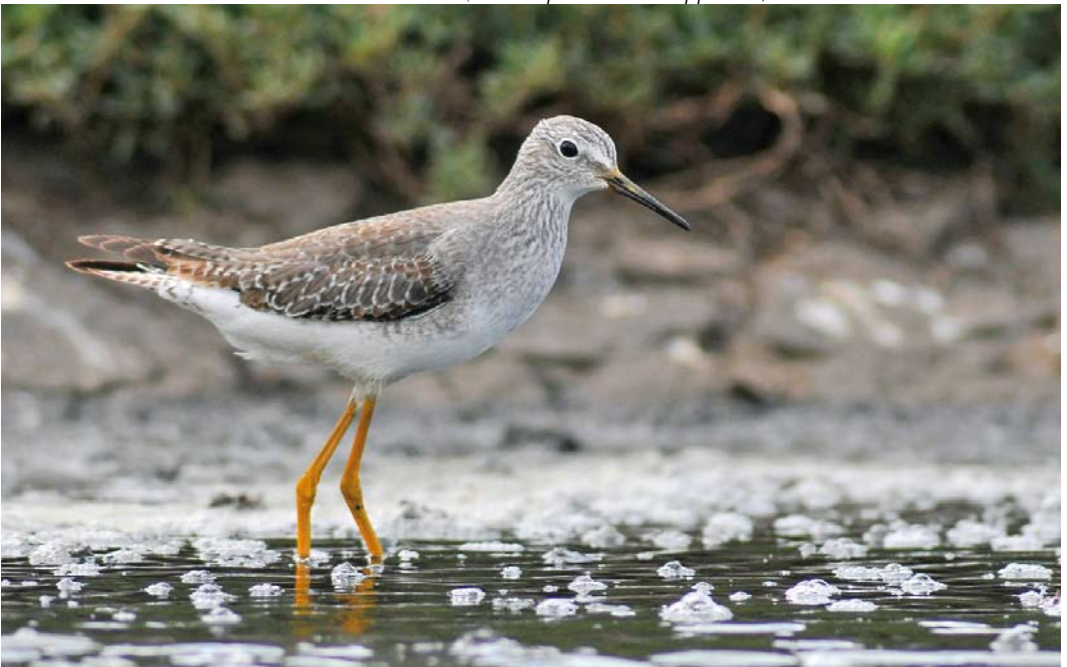
65 Lesser Yellowlegs / Kleine Geelpootruiter Tringa flavipes , first-winter, Mindelo, Santo Antão, Cape Verde Islands, 3 December 2012