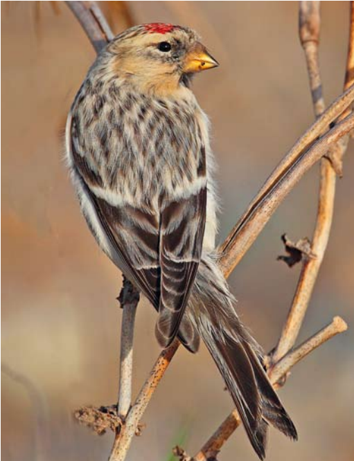
82 Hornemann's Redpoll / Groenlandse Witstuitbarmsijs Acanthis hornemanni hornemanni , first-year, Aldeburgh, Suffolk, England, 15 December 2012