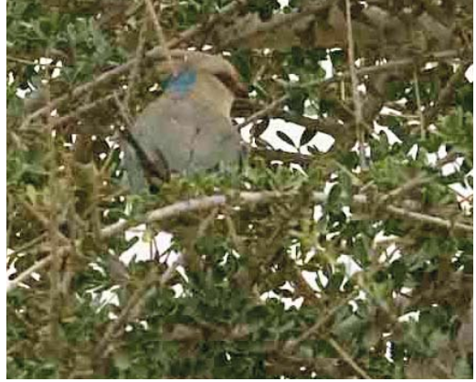
52 Blue-naped Mousebird / Blauwnekmuisvogel Urocolius macrourus , near Choum, Mauritania, 13 December 2007 (Keijo Wahlroos)

Dunn's Lark in the area, where the species is in fact widespread (Crochet 2007), occurring north to Morocco in southern Western Sahara (Awserd area, see Copete et al 2008) and even Tafilalt (Albegger et al 2010; http://maroc.observado.org/waarneming/view/67994098 ).