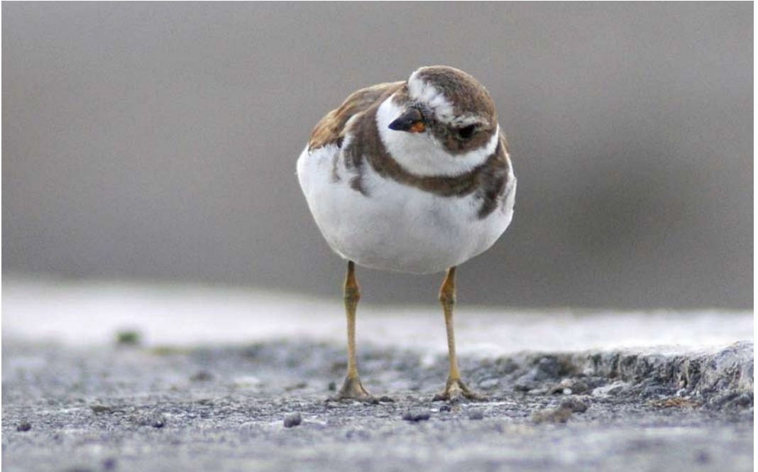
66 Semipalmated Plover / Amerikaanse Bontbekplevier Charadrius semipalmatus , Mindelo, Santo Antão, Cape Verde Islands, 3 December 2012