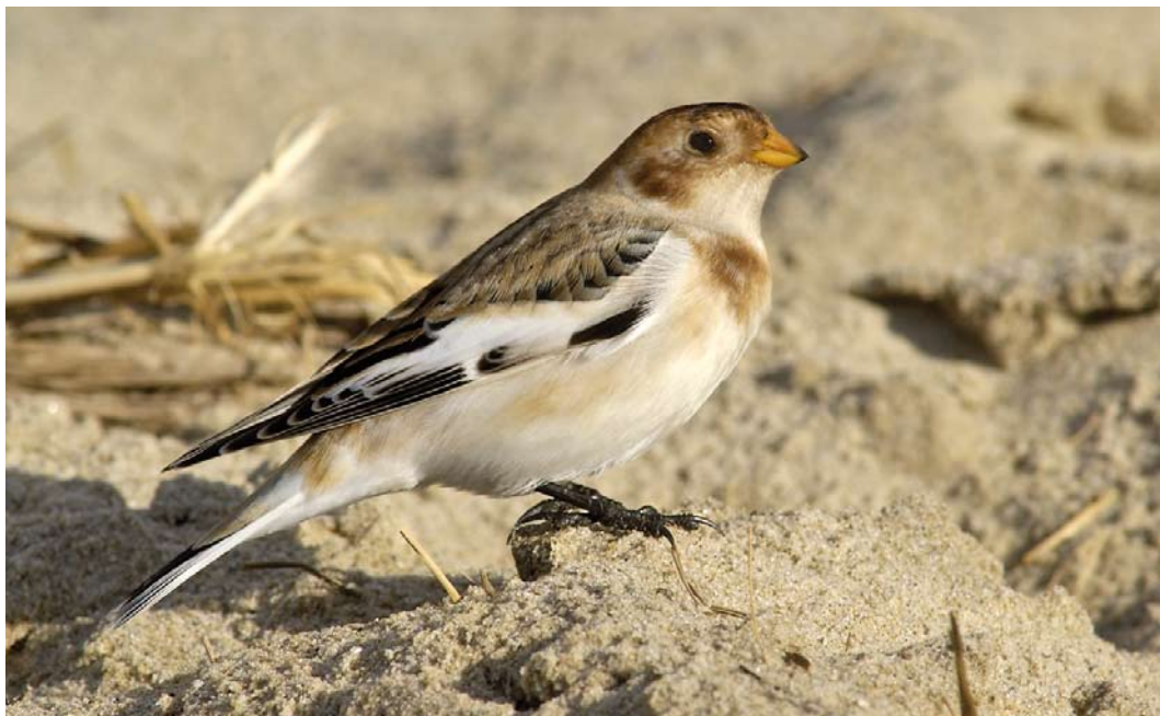
28 Snow Bunting / Sneeuwgor Plectrophenax nivalis , male P n nivalis , Julianadorp, Noord-Holland, Netherlands, 23 September 2002 ( René Pop ). Male nivalis as indicated by pale fringes to mantle-feathers, extensive white in primary coverts, white in primaries and overall pale appearance. 29 Snow Bunting / Sneeuwgor Plectrophenax nivalis , adult male P n nivalis , Texel, Noord-Holland, Netherlands, 25 May 2004 ( René Pop ). Note totally white rump and whitish fringes to mantle-feathers. Lack of white at primary bases indicates second calendar-year.