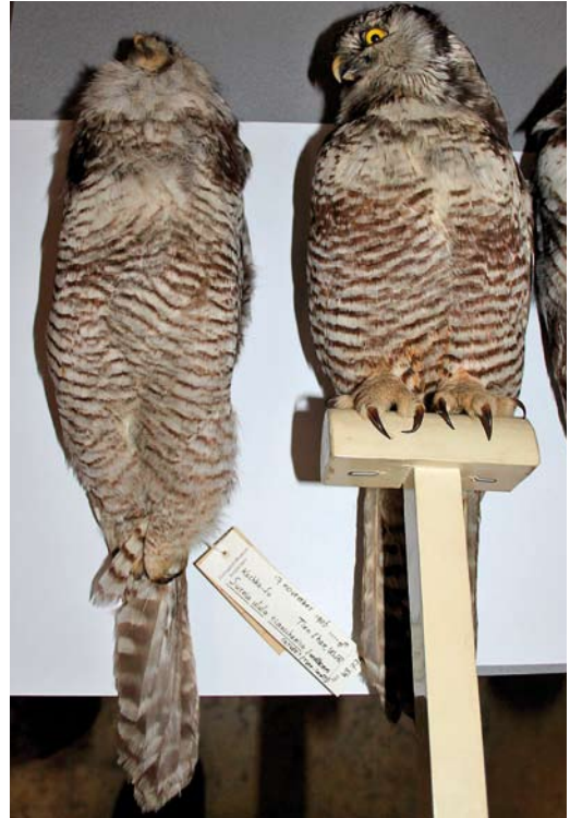
9 American Hawk Owl / Amerikaanse Sperweruil Surnia ulula caparoch (caught off Las Palmas, Gran Canaria, Canary Islands, in October 1924), right, with Northern Hawk-Owl / Sperweruil S u tianschanica (specimen from Central Asia), Naturalis Biodiversity Center, Leiden, Netherlands, August 2012 (Cosme D Romay). Note that underpart barring is slightly bolder and darker in caparoch than in tianschanica .

in characters but the overlap is wide. Some differences between both taxa exist in the pattern of individual feathers on crown, scapulars and chest (eg, Cramp 1985) but even within one individual the variation in feather pattern in each of these feather tracts is large and valid for identification only when exactly the same feather of ulula and caparoch is compared. The only easy identification character is formed by the colour pattern of the two longest primaries (p7-8; primaries numbered from inside): ulula shows 8-10 white spots beyond the longest primary covert on the outer web of these feathers (of which 4-5 on the emarginated part), caparoch has 5-7 white spots (2-3 on the emarginated part); moreover, the spots of ulula are larger and squarer and of caparoch smaller and rounder. This character is useful in the field as well. The Las Palmas bird has only five spots on the outer web of p7-8 (of which two small ones on the emarginated part) and thus clearly belongs to caparoch . Measurements of