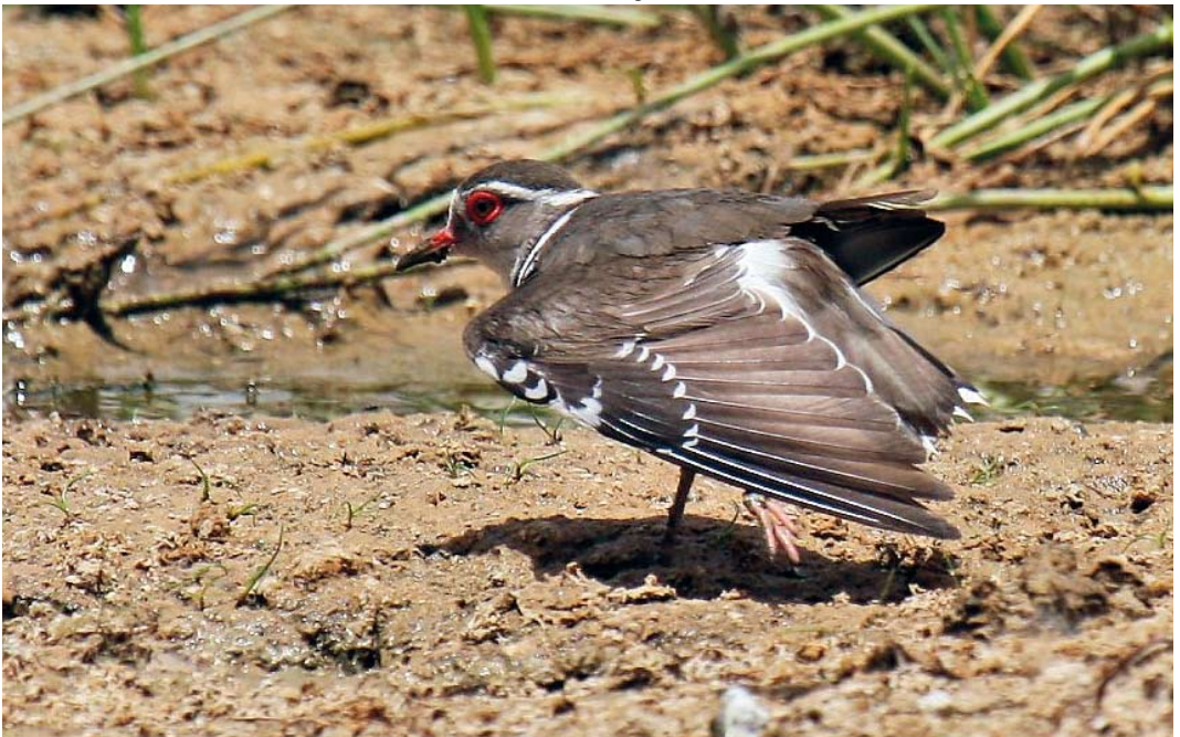
44 Three-banded Plover / Driebandplevier Charadrius tricollaris , Abu Simbel, Egypt, 1 May 2012 (Jens Hering)