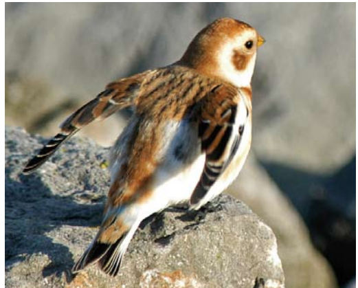
22 Snow Bunting / Sneeuwgorz Plectrophenax nivalis , first-winter female P n insulae , Lauwersoog, Groningen, Netherlands, 23 December 2008 (Rik Winters). Note broad edge to moulted inner greater covert. 23 Snow Bunting / Sneeuwgorz Plectrophenax nivalis , first-winter female P n insulae , De Blocq van Kuffeler, Flevoland, 24 December 1996 (Arnoud B van den Berg). Note general rusty appearance and lack of obvious white. 24 Snow Buntings / Sneeuwgorzen Plectrophenax nivalis , Katwijk aan Zee, Zuid-Holland, Netherlands, 2 November 2012 (Luuk Punt). Male nivalis (right): note rump without black; rusty fringes wear with time, leaving rump white. 25 Snow Bunting / Sneeuwgorz Plectrophenax nivalis , male P n insulae , IJmuiden, Noord-Holland, Netherlands, 10 November 2003 (Arnoud B van den Berg). Note extensive rusty markings and black centres of rump-feathers visible through rusty edges.

the rump. Subspecific identification of females is less straightforward; c 75% can be assigned to subspecies using features not easily observed in the field while, on the other hand, the reliability of visible features is not well known.