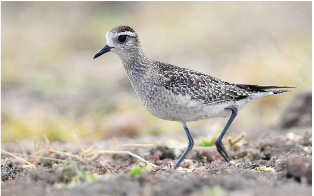
67 American Golden Plover / Amerikaanse Goudplevier Pluvialis dominica , first-winter, Po del Sol, Santo Antão, Cape Verde Islands, 28 November 2012