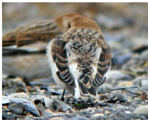
18 Snow Bunting / Sneeuwgors Plectrophenax nivalis , adult male P n insulae , Eemshaven, Groningen, Netherlands, 6 January 2008 ( Rik Winters ). Note fringes to mantle-feathers being only slightly paler than fringes of scapulars. 19 Snow Bunting / Sneeuwgors Plectrophenax nivalis , male, Lauwersoog, Groningen, Netherlands, 23 February 2008 ( Rik Winters ). Tertial and inner greater covert edges much abraded, rump invisible, so age and subspecies cannot be told with certainty, but rusty fringes to mantle-feathers and compact appearance suggest insulae . 20 Snow Bunting / Sneeuwgors Plectrophenax nivalis , first-winter female, Lauwersoog, Groningen, Netherlands, 18 February 2008 ( Rik Winters ). Tertial and inner greater covert edges abraded and narrow, tail-feathers sharply pointed. Grey mantle and extensive white underparts indicate P n nivalis . 21 Snow Bunting / Sneeuwgors Plectrophenax nivalis , adult male P n insulae , Lauwersoog, Groningen, Netherlands, 23 December 2008 ( Rik Winters ). Note typical rump pattern with extensive black markings.

In general, adults show more white than first-winter birds of the same sex and subspecies. When both sex and subspecies can (in most cases) be determined, some additional features may be of use when determining the age of the bird.