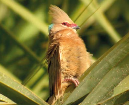
51 Blue-naped Mousebird / Blauwnekmuisvogel Urocolius macrourus , Akhmakou, Mauritania, 2 January 2005