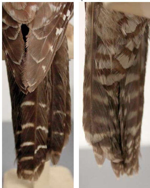
6-7 American Hawk Owl / Amerikaanse Sperweruil Surnia ulula caparoch (caught off Las Palmas, Gran Canaria, Canary Islands, in October 1924), Naturalis Biodiversity Center, Leiden, Netherlands, August 2012 (Cosme D Romay). Details of tail from above (plate 6) and below (plate 7).

first-year male caparoch . Accordingly, this record from the Canary Islands was mentioned in the section 'Movements' of the species account in Cramp (1985) while its mensural data were similarly included in the section 'Measurements' but no further details were published. Because this specimen represents only the second record of caparoch in Europe and the Western Palearctic, we here provide a full account of this record.