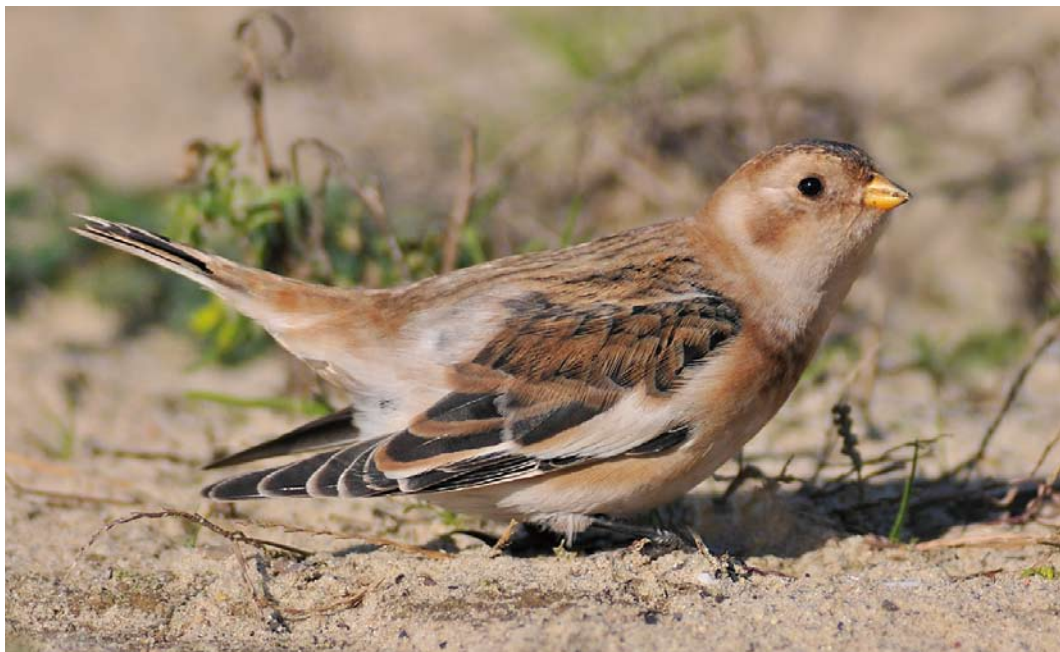
26 Snow Bunting / Sneeuwgorst Plectrophenax nivalis , male P. n. insulae , Texel, Noord-Holland, Netherlands, 11 October 2010. Extensive rusty markings on head and underparts and little contrast between fringes of scapulars and mantle-feathers indicative of insulae . 27 Snow Bunting / Sneeuwgorst Plectrophenax nivalis , female P. n. nivalis , Katwijk aan Zee, Zuid-Holland, Netherlands, 2 November 2012. Note extensive white on primaries, second innermost showing more than 60% white, diagnostic of nivalis . Also note overall pale appearance and contrast between pale mantle and rusty scapular edges.