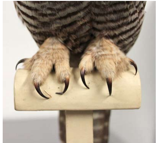
5 American Hawk Owl / Amerikaanse Sperweruil Surnia ulula caparoch (caught off Las Palmas, Gran Canaria, Canary Islands, in October 1924), Naturalis Biodiversity Center, Leiden, Netherlands, August 2012 (Cosme D Romay). Detail of claws and feathered feet.