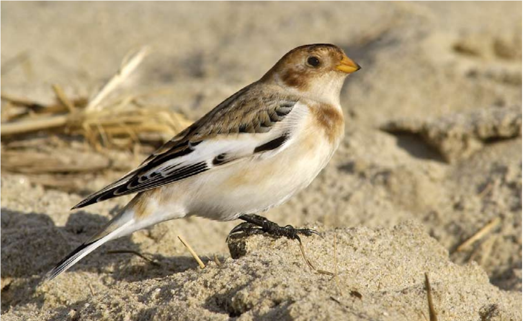
28 Snow Bunting / Sneeuwgor Plectrophenax nivalis , male P n nivalis , Julianadorp, Noord-Holland, Netherlands, 23 September 2002 ( René Pop ). Male nivalis as indicated by pale fringes to mantle-feathers, extensive white in primary coverts, white in primaries and overall pale appearance. 29 Snow Bunting / Sneeuwgor Plectrophenax nivalis , adult male P n nivalis , Texel, Noord-Holland, Netherlands, 25 May 2004 ( René Pop ). Note totally white rump and whitish fringes to mantle-feathers. Lack of white at primary bases indicates second calendar-year.