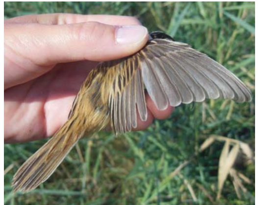
30 Aquatic Warbler / Waterrietzanger Acrocephalus paludicola , adult, Gironde estuary, Charente-Maritime, France, 23 August 2011 (Raphaël Musseau) 31 Aquatic Warbler / Waterrietzanger Acrocephalus paludicola , adult, Gironde estuary, Charente-Maritime, France, 15 August 2012 (Raphaël Musseau) 32 Aquatic Warbler / Waterrietzanger Acrocephalus paludicola , juvenile, Gironde estuary, Charente-Maritime, France, 22 August 2011 (Raphaël Musseau) 33 Aquatic Warbler / Waterrietzanger Acrocephalus paludicola , juvenile, Gironde estuary, Charente-Maritime, France, 22 August 2012 (Raphaël Musseau)

ity of males leave in the second half of July (de By 1990). Birds take a western migratory route mainly along the coastlines to reach north-western Africa in September, western Africa in October and the sub-Saharan winter quarters in November (Flade & Lachmann 2008, Schäffer et al 2006). During post-breeding migration, the species is regularly recorded in Latvia, Lithuania, Poland, Germany, Netherlands, Belgium, France, Portugal, Spain and sometimes in England (Flade & Lachmann 2008). Indirect records (predated individuals discovered in nests of Eleonora's Falcon Falco eleonora ) have also been documented along the Mediterranean Sea and Black Sea, in Turkey and Bulgaria (Flade & Lachmann 2008). Habitats used are close to those