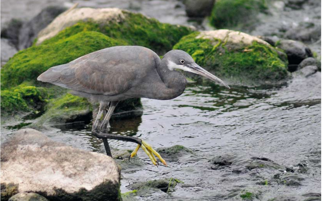
64 Western Reef Heron / Westelijke Rifeiger Egretta gularis , Ribeira Grande, Santo Antão, Cape Verde Islands, 28 November 2012