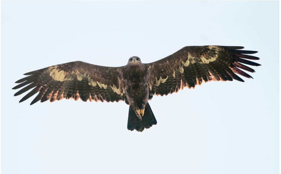
239 Steppe Eagle / Steppearend Aquila nipalensis , third calendar-year, Großkrut, Niederösterreich, Austria, 6 May 2014 ( Leander Khil )