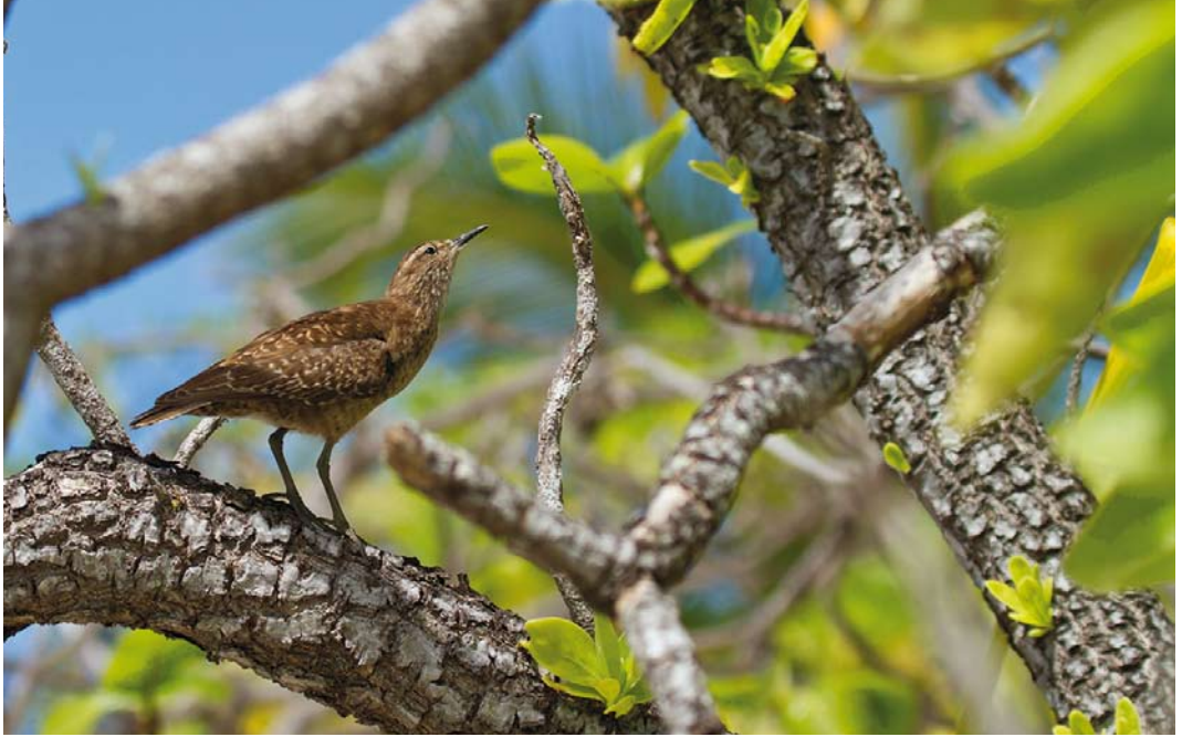
228-229 Tuamotu Sandpiper / Tuamotustrandloper Prosobonia parvirostris , Tenararo Atoll, French Polynesia, 12 September 2013. Foraging on nectar in tree.