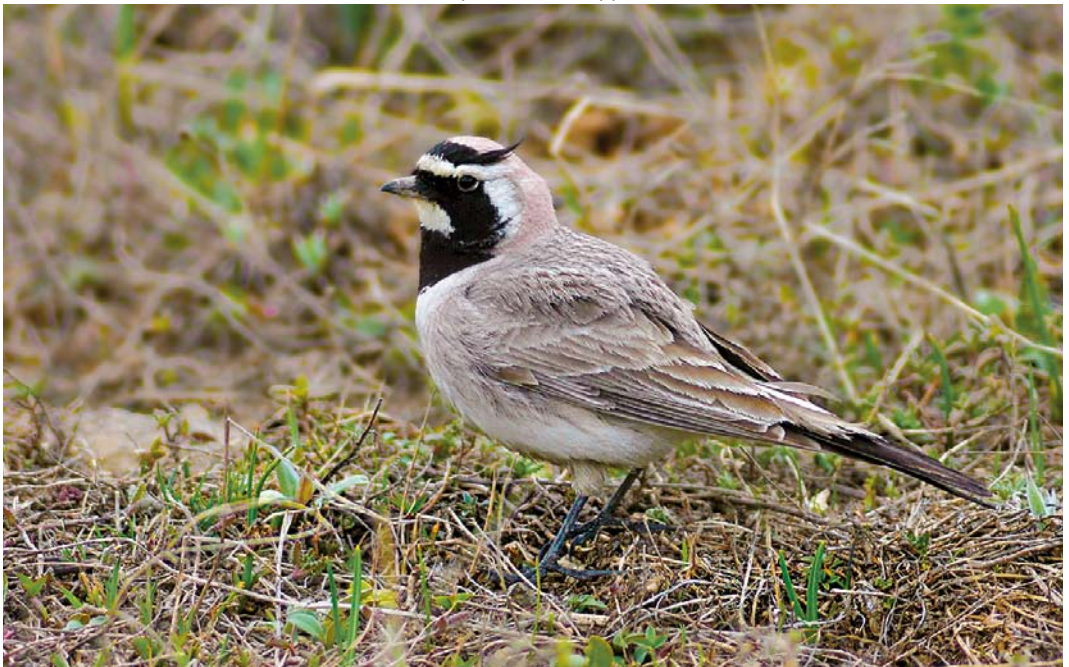
237 Caucasian Horned Lark / Kaukasische Strandleeuwerik Eremophila penicillata , Aragats, Armenia, 13 May 2011