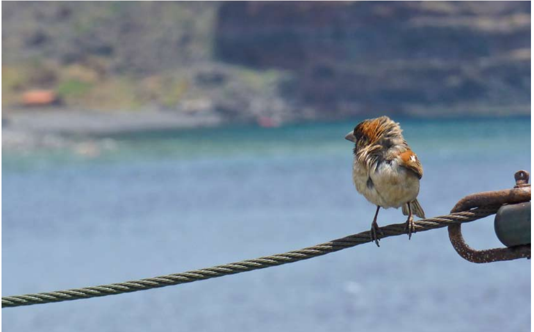
198 Iago Sparrow / Kaapverdische Mus Passer iagoensis , male, on board of MV Plancius , off Deserta Grande, Desertas, 12 May 2013 (Nils van Duivendijk)