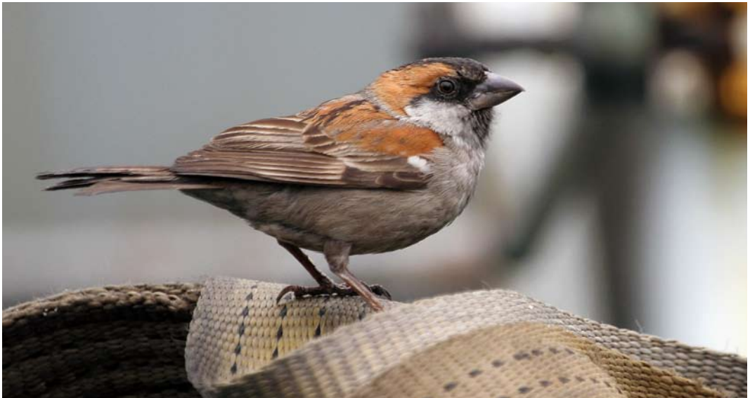
201 Iago Sparrow / Kaapverdische Mus Passer iagoensis , male, on board of MV Plancius , Hansweert, Zeeland, Netherlands, 20 May 2013