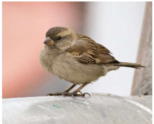
202 Iago Sparrows / Kaapverdische Mussen Passer iagoensis , female (left) and male, on board of MV Plancius , Hansweert, Zeeland, Netherlands, 20 May 2013 ( Cerjon Gelling ) 203 Iago Sparrows / Kaapverdische Mussen Passer iagoensis , male (left) and female, on board of MV Plancius , Hansweert, Zeeland, Netherlands, 20 May 2013 ( Luuk Punt ) 204 Iago Sparrow / Kaapverdische Mus Passer iagoensis , female, on board of MV Plancius , Hansweert, Zeeland, Netherlands, 20 May 2013 ( Karel Hoogteyling )

Hazevoet, C J 2013b. Iago sparrows in the Netherlands – a tragi-comical soap without happy ending. Website: www.scvz.org/info0913.html .